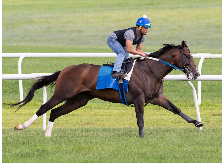
Cogburn

recent works have been at Churchill, the 7-5 morning line got his first taste of the Del Mar grass with a three-furlong work in :37 4/5 (2/2) Oct. 28.