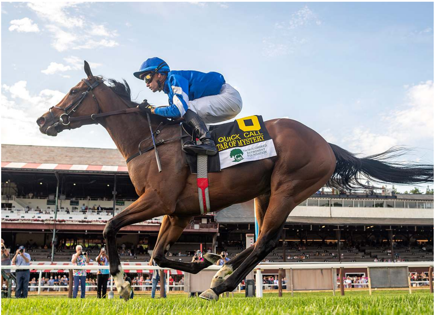
Star of Mystery taking the Quick Call Stakes at Saratoga

Bookmark this tab http://www.thoroughbreddailynews.com/getLatest.php to download the latest edition of the TDN each day.