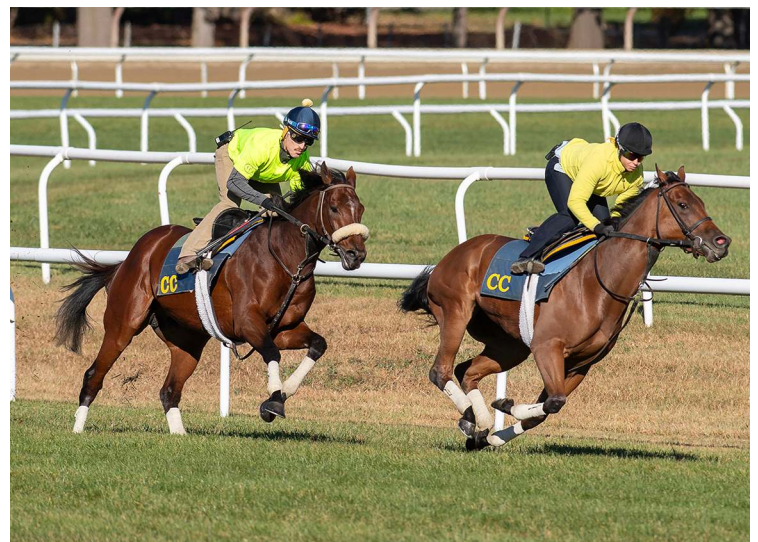
Far Bridge (outside) working over the Oklahoma turf Oct. 25