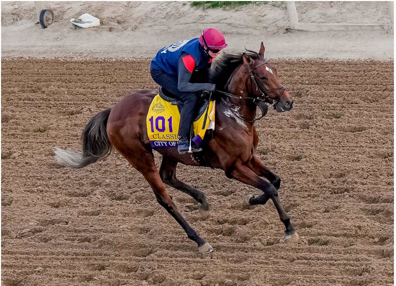
City of Troy takes his first spin over the Del Mar main track