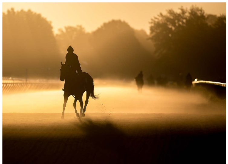
Sunrise over Saratoga's famed Oklahoma training track