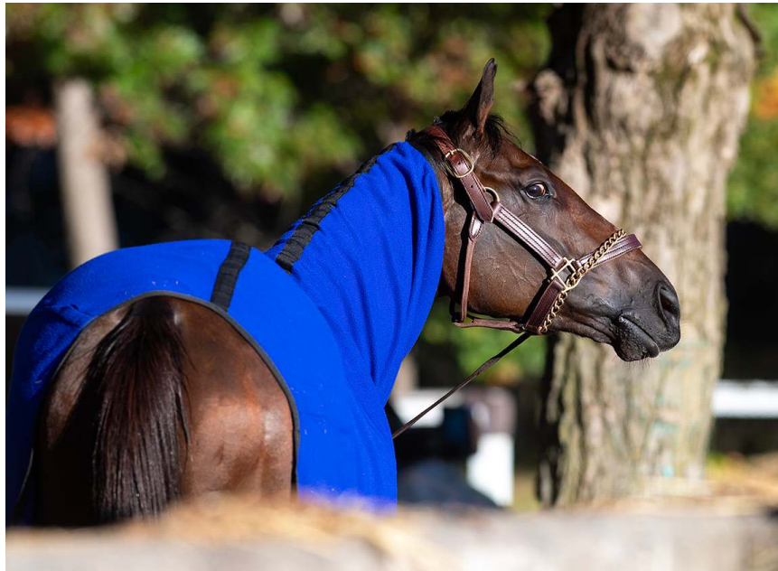
Thorpedo Anna earlier this month at Saratoga