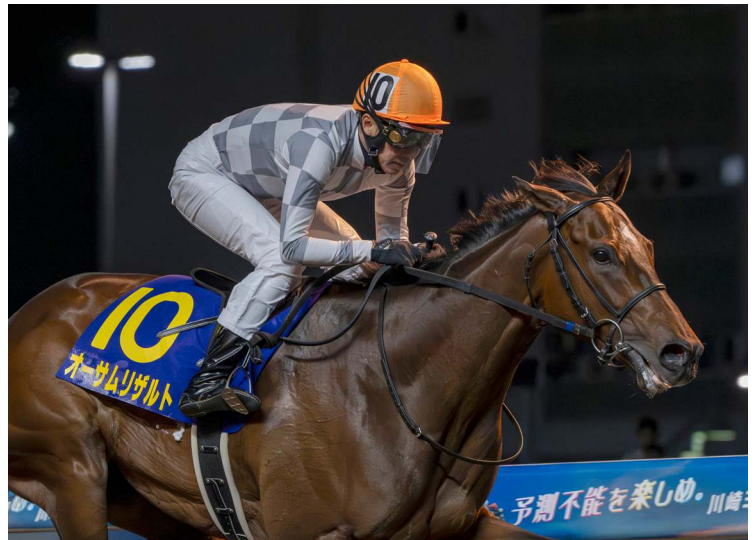
Awesome Result