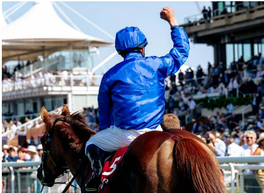
Notable Speech | Goodwood Racecourse