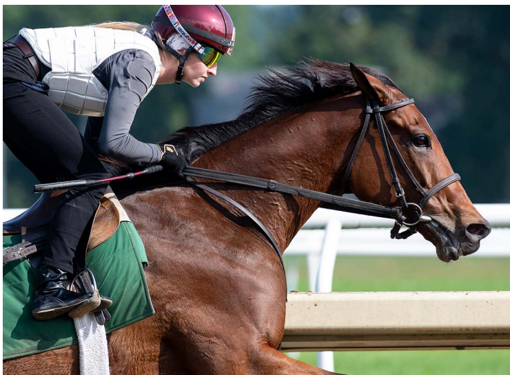
War Like Goddess