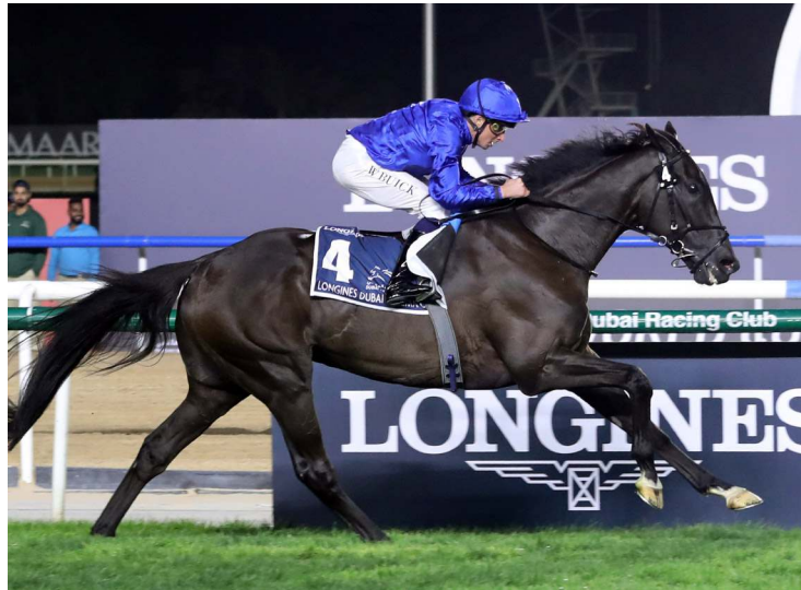
Rebel's Romance winning the Sheema Classic

Conversely, Shahryar is will begin from a low draw for Cristian Demuro and his last-out fifth in the G2 Sapporo Kinen is probably best forgiven, as he was first up since the Sheema and racing over an unsuitable 2000 meters.