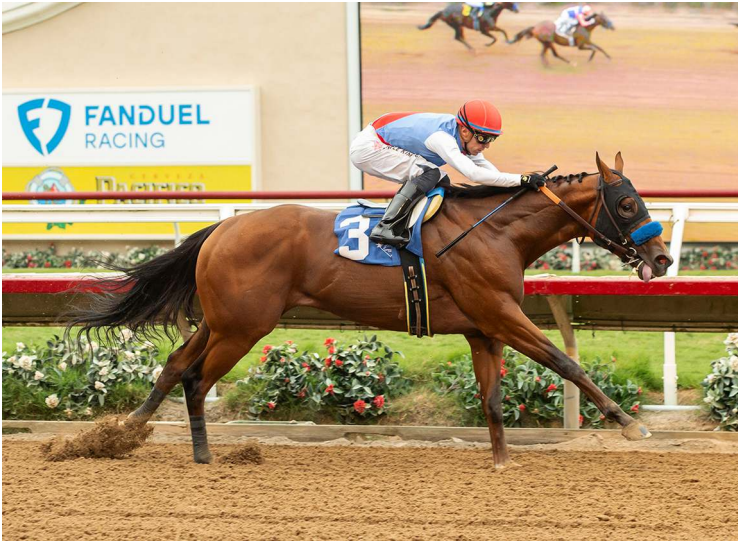
Muth winning the Shared Belief

An ill-timed temperature forced the bay out of the Preakness, also causing him to miss some training. Fresh and ready for his return, he came home a two-length winner in the Sept. 1 Shared Belief Stakes at Del Mar before making one more attempt at nine furlongs in Sept. 28 GI California Crown, but had to settle for sixth that day. The cut back to a one-mile distance should hit squarely between the eyes.