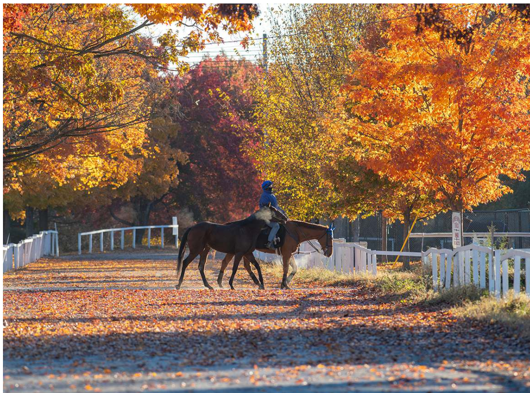
Saratoga: The Fall Place to Be

'TDN Rising Star' Scylla (Tapit) heads to the GI Breeders' Cup Filly & Mare Sprint after turning back to seven furlongs with a second-place finish in the GI Ballerina Handicap at Saratoga Aug. 24. The well-related Juddmonte homebred was previously second after looking long gone in the 1 1/16-mile GI Clement L. Hirsch Stakes three weeks earlier at Del Mar.