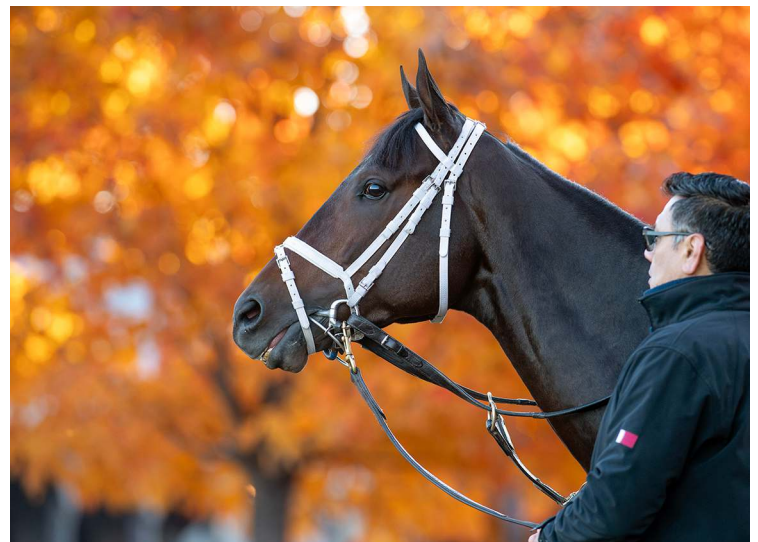
Fierceness enjoying the fall at Saratoga

Pletcher's remaining four Breeders' Cup entrants-- Candied (Candy Ride {Arg}) (Distaff), Gate to Wire (Munnings) (Juvenile Turf Sprint), Tapit Trice (Tapit) (Classic) and Tenacious Leader (Not This Time) (Juvenile Turf)--were split between Belmont Park and Keeneland, respectively. Pletcher has won a total of 15 Breeders' Cup races.