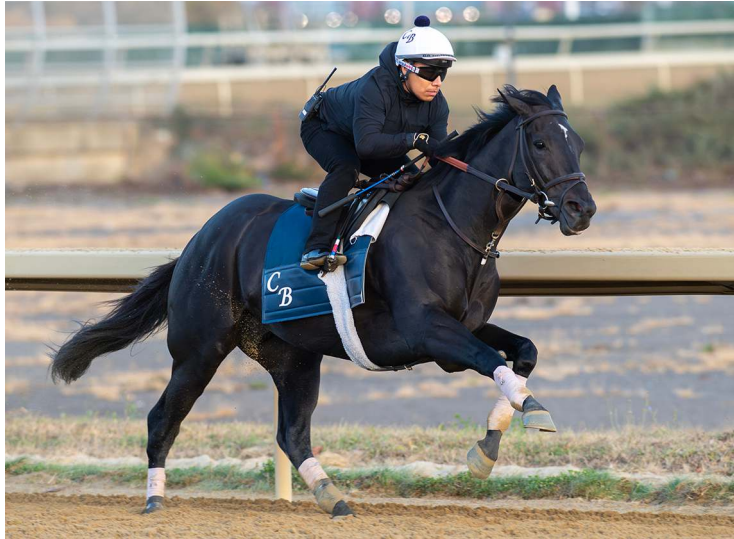
Domestic Product working at Belmont last weekend

Zedan Racing's Muth (Good Magic), winner at distances ranging from five furlongs to 1 1/8 miles, has proven time and again that he cannot be left off the ticket. Named a 'TDN Rising