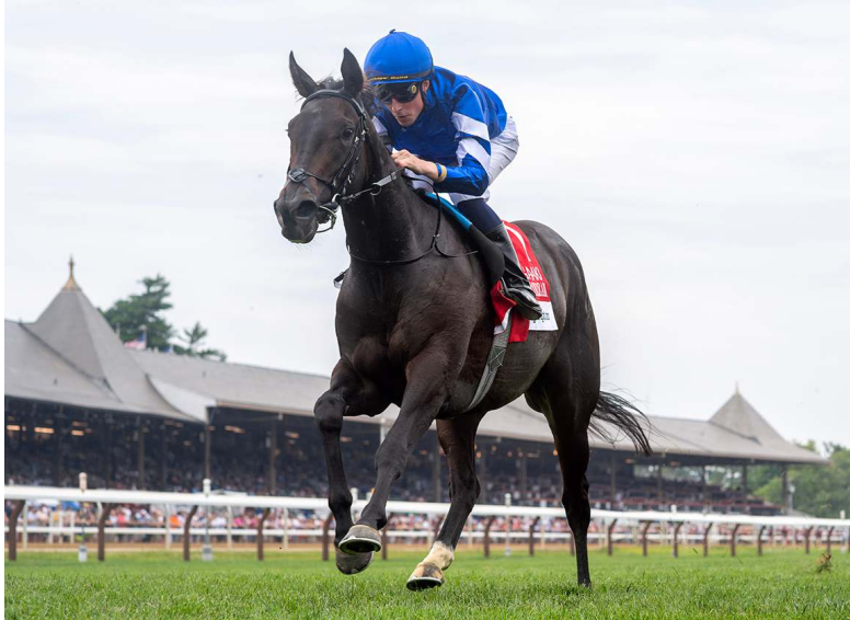
Cinderella's Dream