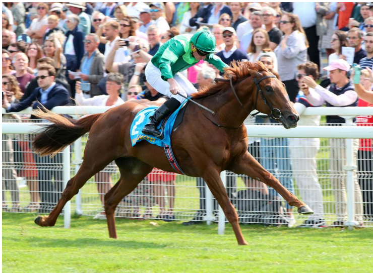
Whistlejacket | ScoopDyga

The GI Breeders' Cup Juvenile Turf Sprint, the first offering over two days of championship racing at Del Mar, last year served as the coming-out party for fan-favorite Big Evs (Ire) (Blue Point {Ire}). The colt held the lead from the top of the lane to the wire after rating just off the speed up the backstretch and around the far turn. It's always difficult to predict whether being forwardly placed while turf sprinting is a help or a hindrance. Big Evs exhibited his tactical strength and uncorked at the right opportunity. What is guaranteed in this year's race is that a scamper down the lane will create another exciting contest for these juveniles.