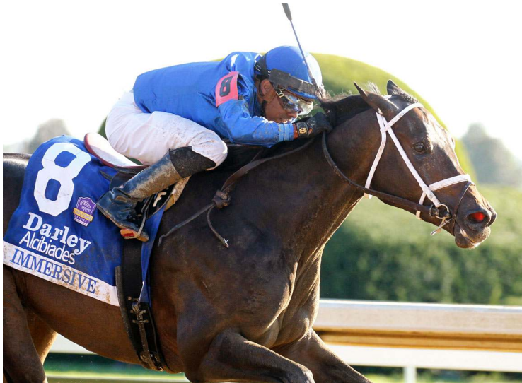
Immersive wins the Alcibiades

In the waning weeks of summer and the beginning weeks of fall, prime time each year for the 2-year-old cream to rise to the top with 'Future Stars Friday' as a target, there were eight graded stakes on the dirt from coast to coast specifically for juvenile fillies. Seven individual fillies won those eight stakes with five of the seven entered in Friday's GI Breeders' Cup Juvenile Fillies, making it a true championship event.