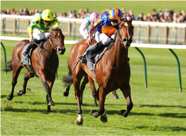
Lake Victoria winning the Cheveley Park

Team Europe almost always brings some nice horses for a crack at this championship match, but almost surprisingly, they are 3-for-16 in the race. However, to ignore their presence is a fool's errand, and they shipped over some titans this year for just about every turf division, as well as the Classic. Combined