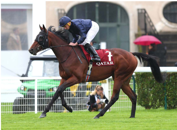
Henri Matisse

To the outside of the rush for positions, MGSW & G1SP-Ire Henri Matisse (Ire) (Wootton Bassett {GB}) will be the Aidan O'Brien representative here racing in the Coolmore-navy colors. A winner of three straight at the Curragh in Ireland, including two Group 2 races, he took his first step up into elite company two back Sept. 15 in the G1 Goffs Vincent O'Brien National Stakes and begrudgingly yielded in the closing yards to finish second by three-quarters of a length. He took his show on the road Oct. 6 to France, finishing fifth in the G1 Qatar Prix Jean-Luc Lagardere after being knocked around early on and finding himself farther back than ideal. They're removing the blinkers for this start, and Ryan Moore is back in the irons.