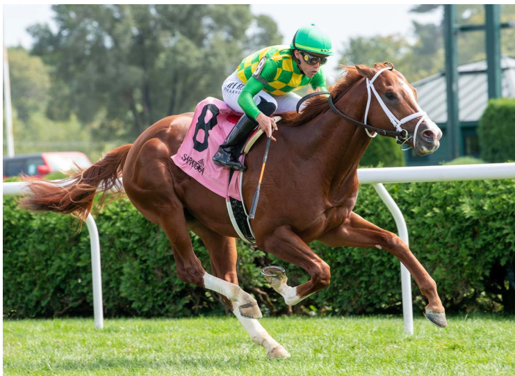
Gate to Wire breaks his maiden at the Spa

With Mentee (City of Light) heading to the GI Breeders' Cup Juvenile Turf, that means Gate to Wire (Munnings) will be the lone representative to come out of the GIII Futurity Stakes that was run at Aqueduct Racetrack Oct. 4. The chestnut was the runner-up that day, but he has talent in spades. With turf underneath on his dam side, the Todd Pletcher trainee is going to be a massive price, but he gets the services of multiple Eclipse winner Irad Ortiz, Jr. In a race where anything can happen, Gate to Wire could do just that in the end. --@campbellparlay