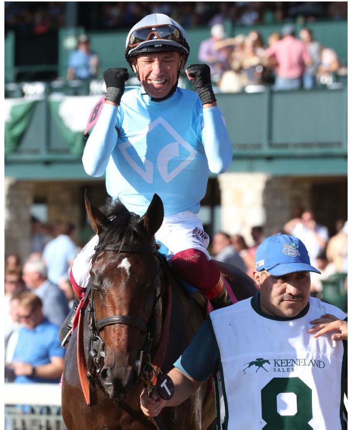
May Day Ready