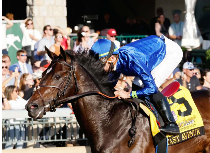
East Avenue

that maybe he could very well be a little more forward coming out of these one-turn races. I hope so."