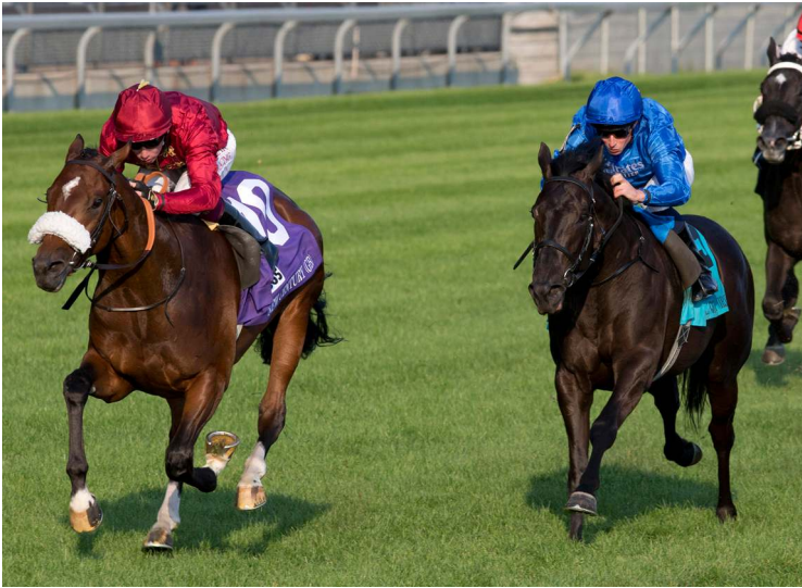
New Century (left) winning the Summer Stakes with Al Qudra (right) in hot pursuit

While the Juvenile Fillies Turf division is stacked heavy on the firepower from Europe, the GI Breeders' Cup Juvenile Turf has a bit more grace to give as Japan, the U.S., and Europe all have entries in here with strong arguments to make in their favor for