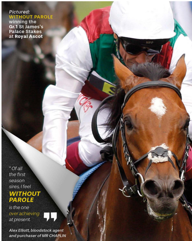
Pictured: WITHOUT PAROLE winning the Gr.1 St James's Palace Stakes at Royal Ascot

"Of all the first season sires, I feel WITHOUT PAROLE is the one over achieving at present."