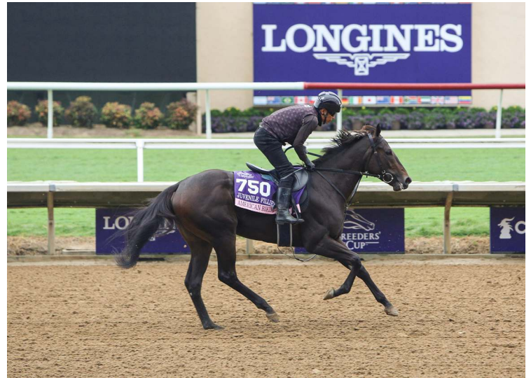
American Bikini