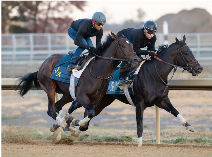
This year's Juvenile Fillies favorite, Scottish Lassie (outside), works at Belmont Oct. 26 with last year's runner-up, Jody's Pride