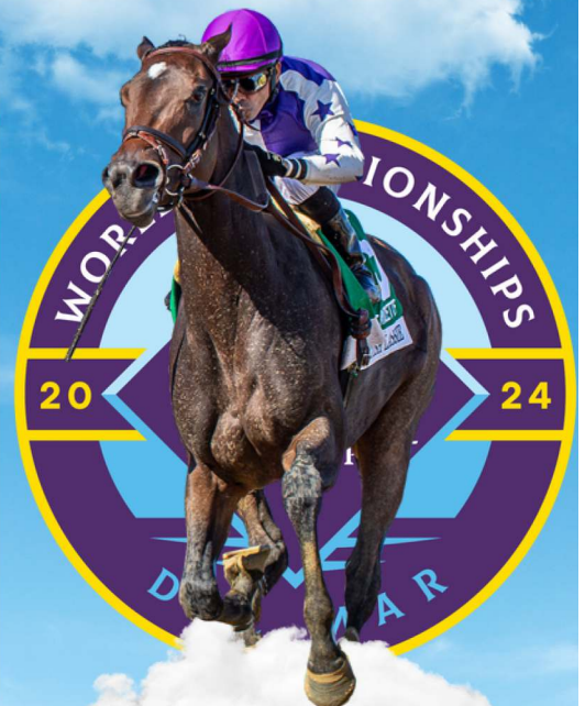
GI WINNER KEESEP GRAD SCOTTISH LASSIE