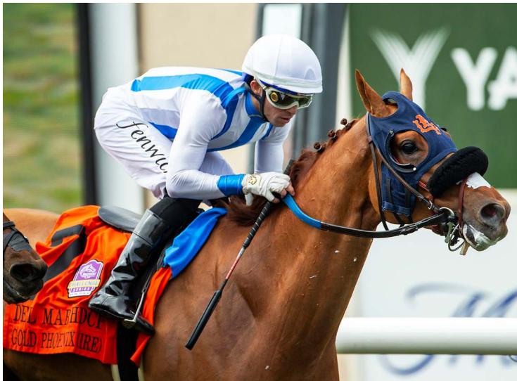
Gold Phoenix | Benoit