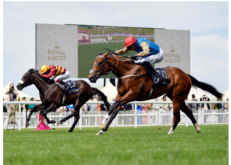
Shareholder (outside)

Also present is Shareholder (Ire) (Not This Time), who notched a signature win in the G2 Norfolk Stakes at the Royal Meeting in mid-June for owner Wathnan Racing and the intriguing breeder at Skyfall Thoroughbreds.