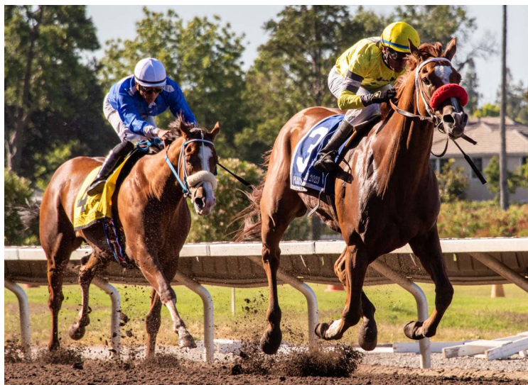
Pleasanton racing

BN: I don't know if the swimming pool is still on the table. Obviously, the Tapeta track has been a big benefit.