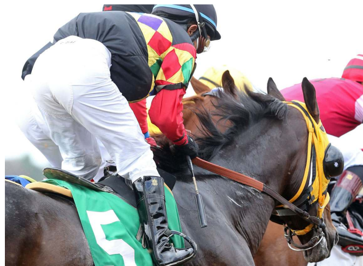
Dirt racing

Penalty: 7-day period of Ineligibility for Covered Person, beginning on December 21, 2024; Disqualification of Covered Horse's Race results, including forfeiture of all purses and other compensation, prizes, trophies, points, and rankings and repayment or surrender (as applicable); a fine of $1,000; imposition of 2 Penalty Points. Admission. Cont.