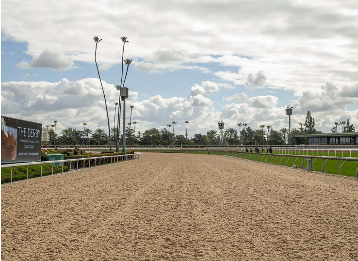
Santa Anita all-weather track

We're a long way off because those discussions really have not entered the stage where I can really give you a good answer. But yes, you would think you would need some kind of an agreement with the Tribes to be able to launch this thing with the certainty that it's sustainable.