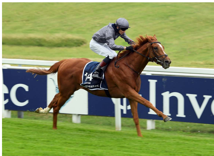
Serpentine