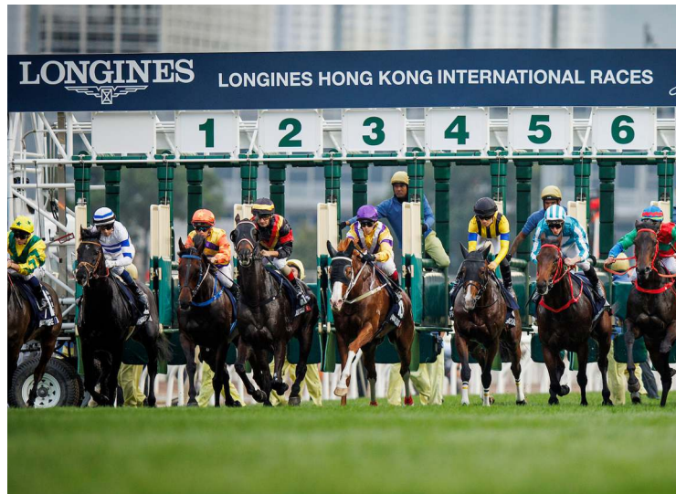
Hong Kong racing | HKJC

I can't give you specifics as to when, but there would need to be a very layered approach as to what's necessary. For example, I would expect that we would need to go back to the CHRB [California Horse Racing Board] one more time and get another second set of approvals before we could even consider a soft launch.