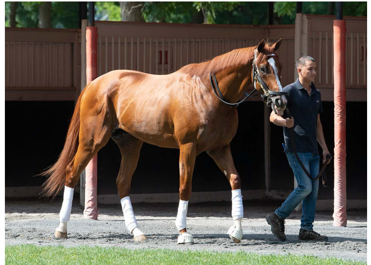
Cyberknife | Sarah Andrew

CYBERKNIFE , similarly, welcomed back 179 mares last spring following a massive first book of 223. Of 171 live foals, 23 weanlings were sold (30 offered) at $79,260. Cyberknife, who broke Spend a Buck's 37-year-old track record in the GI Haskell, takes a second trim to $20,000 (opened at $30,000). Cont.