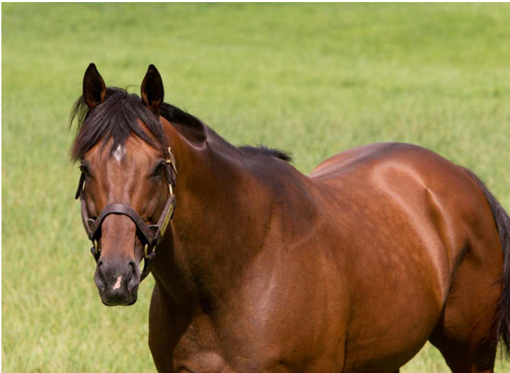
Hard Spun | Darley

Don't miss tomorrow's edition, featuring insights from two prominent breeders on their top value sires in the $20,000 to $29,999 range.