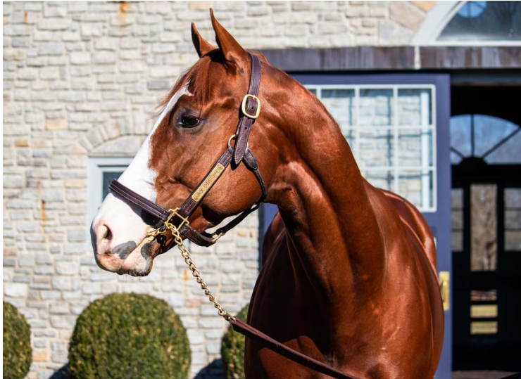
Jack Christopher

JACK CHRISTOPHER , yet another with a monster debut book (247), made a steady start with weanlings conceived at $45,000--33 of 44 processed at $104,727--and he's now right down to $25,000. With 192 live foals in his first crop, and another 168 mares last spring, he's entitled to land running as an unbeaten Grade I winner at two.