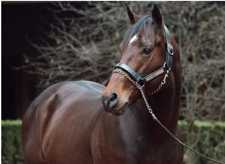
Army Mule

On a very similar path to Girvin , Army Mule also punched way above weight when launching in a brutally competitive intake. His third crop of juveniles, into play last year, comprises 57 live foals and he has depended on mature horses--such as 5-year-old Grade II winner Federal Judge --for his recent stakes action. But you get a sense of what's brewing from his latest yearlings, 41 of 51 converting a cover fee of $7,500 to an average $75,345.