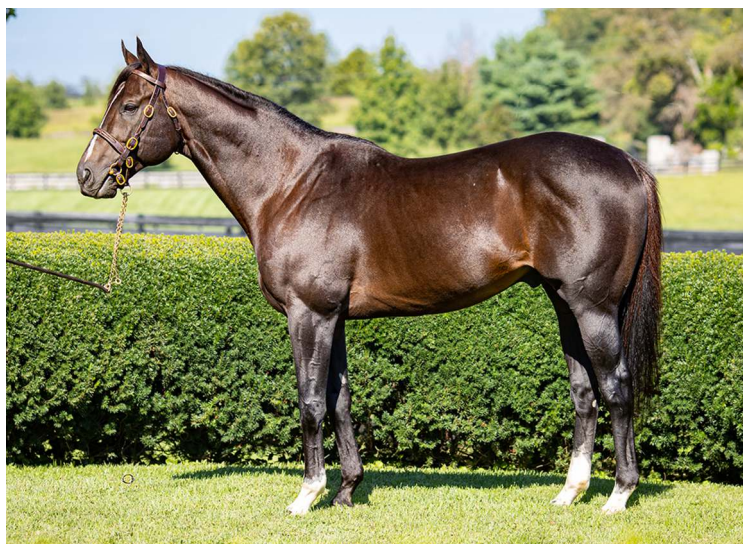
Girvin | EquiSport

GIRVIN is set for big things very soon, just needing to ride out a bump with only 40 live foals in his third crop of juveniles, who entered play in 2024. He still mustered another five stakes winners, taking him up to 13 overall at 8.3 percent of named foals. Of course, the big thing with Girvin is that he transferred to Kentucky after his strong start and has covered 152 and 138 mares over the last two years. Sure enough, 14 of 22 yearlings sold in 2024 averaged $105,835--off a conception fee of just $6,000! That shows what can be done if you breed with belief to "bubble" sires. With his biggest and best books coming on stream, Girvin could soon leave his $25,000 fee well behind.