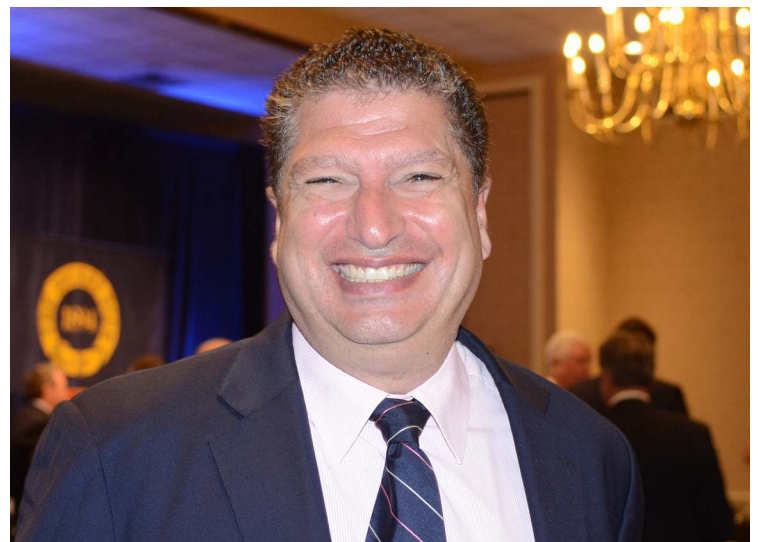
Bill Nader | Horsephotos

With that, it covers a large percentage of the horse population up North at Santa Anita. Los Alamitos can cater to some of the other horses. So, we think we pretty much have blanket coverage at this point. But we'll keep an eye on it and see, you know, with the participation rate. Is it working? Does it make sense for both sides as a win-win proposition?