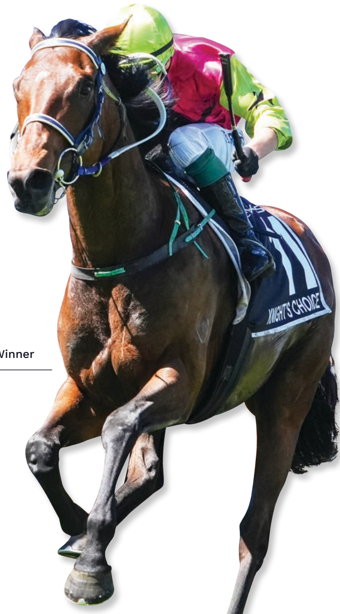
2024 $8.6M Melbourne Cup Winner Knights Choice