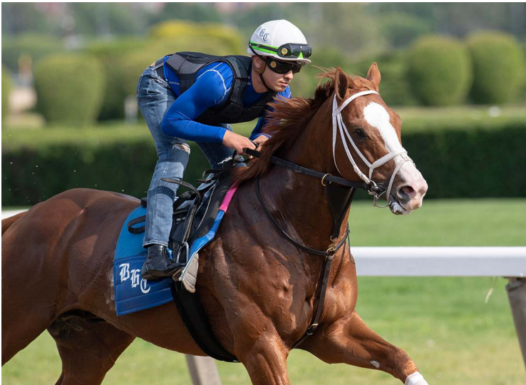
Chowser is a full-brother to GSW/GISP Warrant (pic)