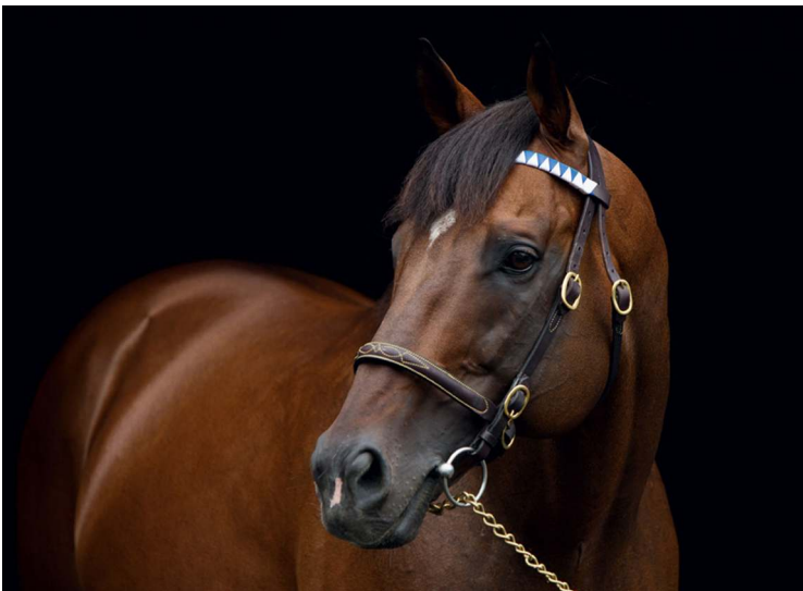
Hard Spun | Darley