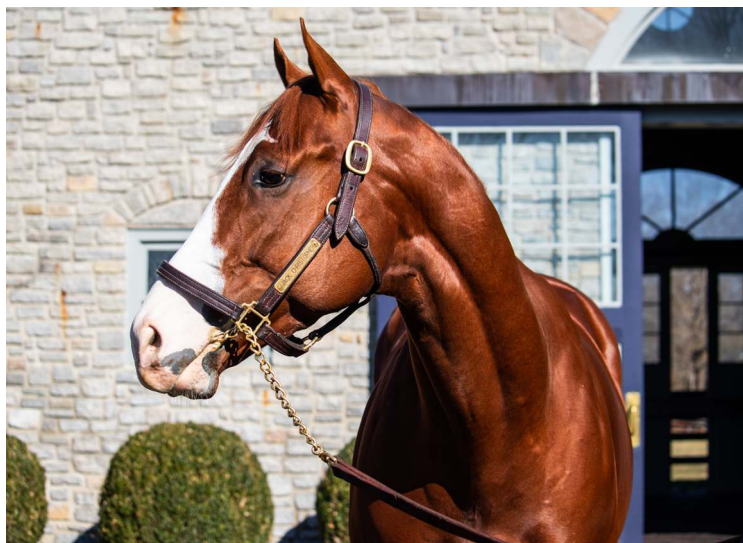
Jack Christopher

JACK CHRISTOPHER , yet another with a monster debut book (247), made a steady start with weanlings conceived at $45,000--33 of 44 processed at $104,727--and he's now right down to $25,000. With 192 live foals in his first crop, and another 168 mares last spring, he's entitled to land running as an unbeaten Grade I winner at two.