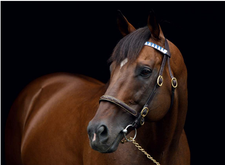
Hard Spun | Darley