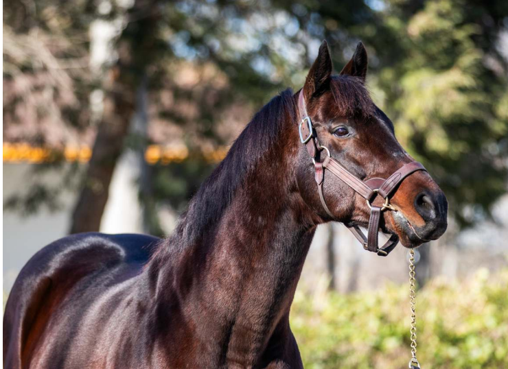
Blame

But that takes him up to 50 overall, at a solid 8 percent of named foals, with 21 graded stakes winners including half a dozen at the elite level. And for a sire at this stage of his career, he's maintaining consistent demand at the sales, his latest yearlings again achieving a yield over $90,000 (47 sold of 54).