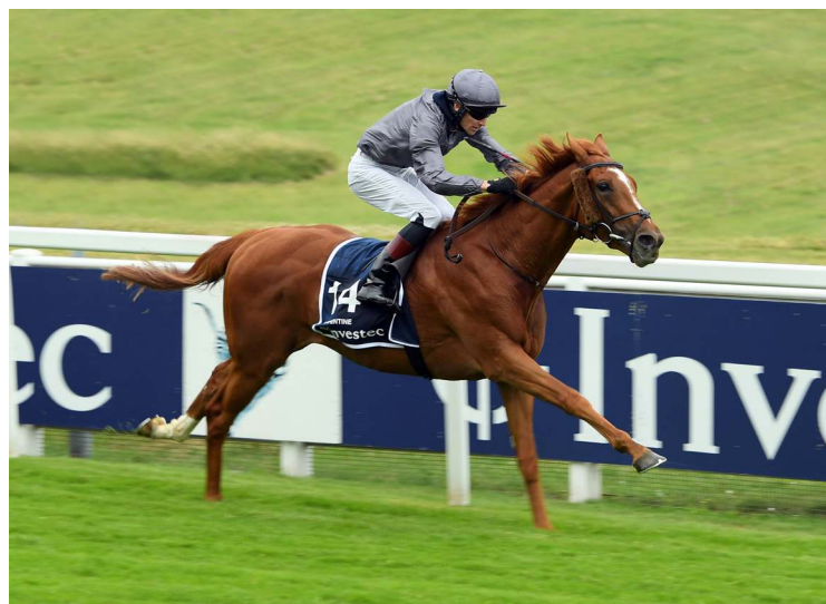
Serpentine