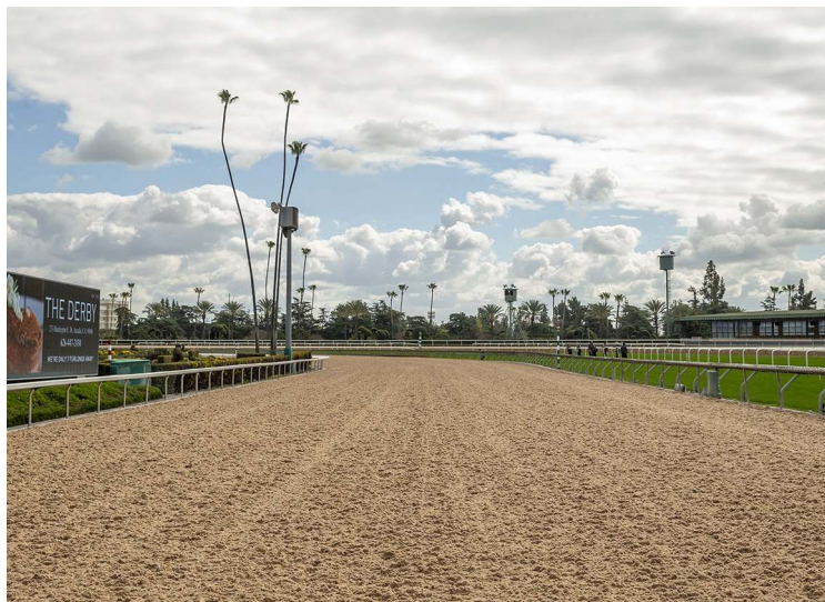
Santa Anita all-weather track

We're a long way off because those discussions really have not entered the stage where I can really give you a good answer. But yes, you would think you would need some kind of an agreement with the Tribes to be able to launch this thing with the certainty that it's sustainable.