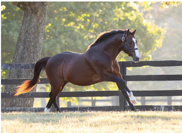
Into Mischief