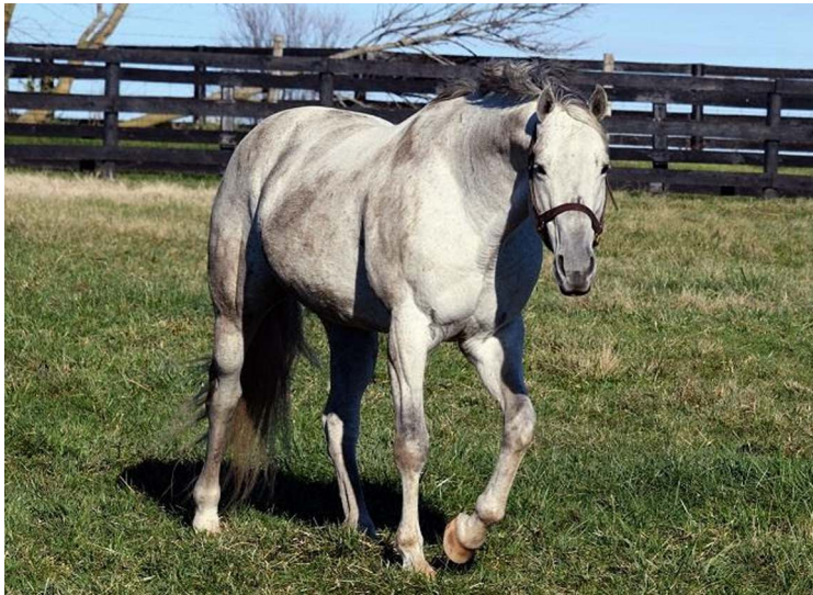
Mission Impazible at Old Friends

Old Friends Retirement Farm in Georgetown, Kentucky, has announced the addition of six graded stakes winners to their farm: Count Again, Delaunay, Mission Impazible, Normandy Invasion, Rainbow Heir and Warrior's Reward.