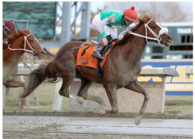
Global Steve

Also Ran: Gun Trader, Baby Dukes, Fire Pit, Right Wing Runner. Scratched: Mission First, National Law, Robert's Moon.