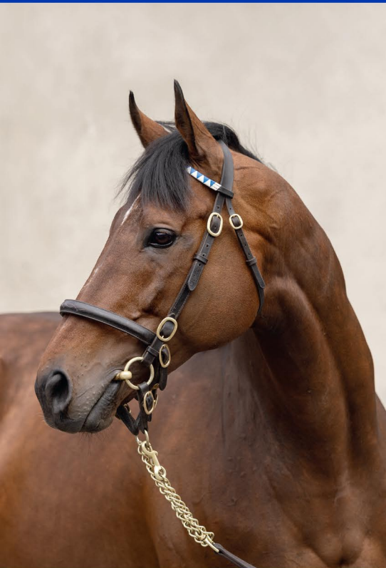
World Champion Ghaiyyath, Timeform 133