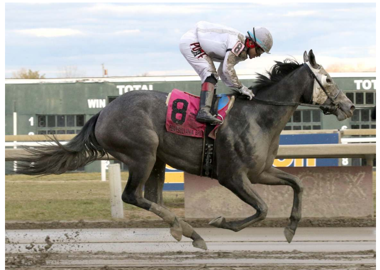
Honorable Win

Honorable Partner, who sold for $1,000 at the Inglis Digital USA sale in July, has a yearling full-brother and a weanling full-sister to the winner. Click for the Equibase.com chart or VIDEO , sponsored by FanDuel TV .