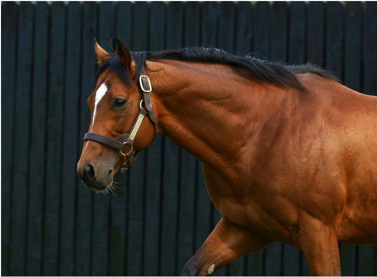
Gleneagles | Coolmore