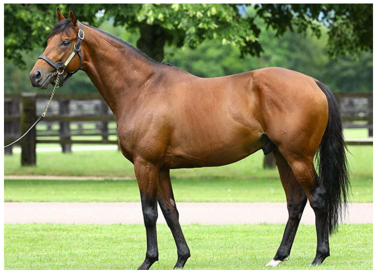
Zarak | The Aga Khan Studs