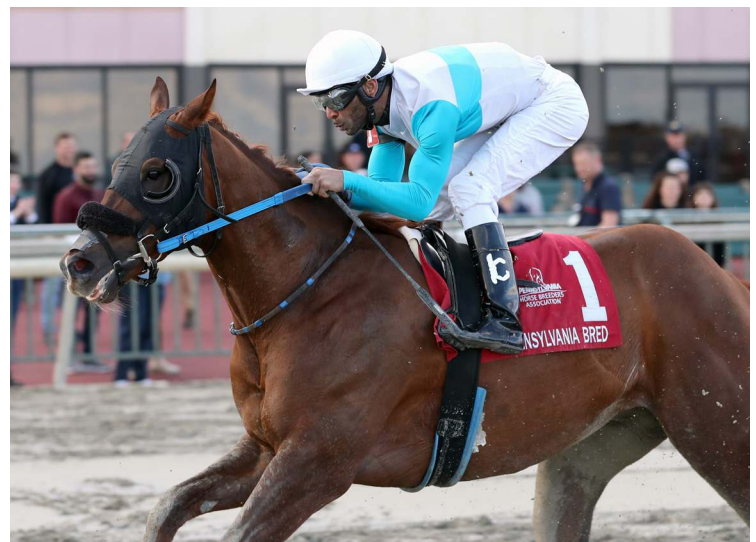
Fenton Forever

Winchill , Honorable Win, f, 2, o/o Honorable Partner, by Congressionalhonor. Miss Behaviour S., 12-30, Parx Racing