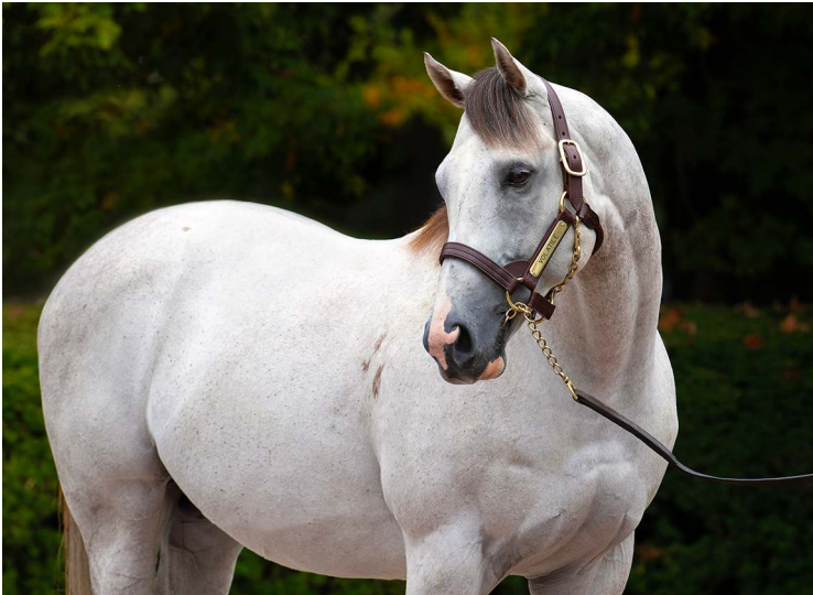
Volatile, standing at Three Chimneys Farm, stands for $12,500 in 2025