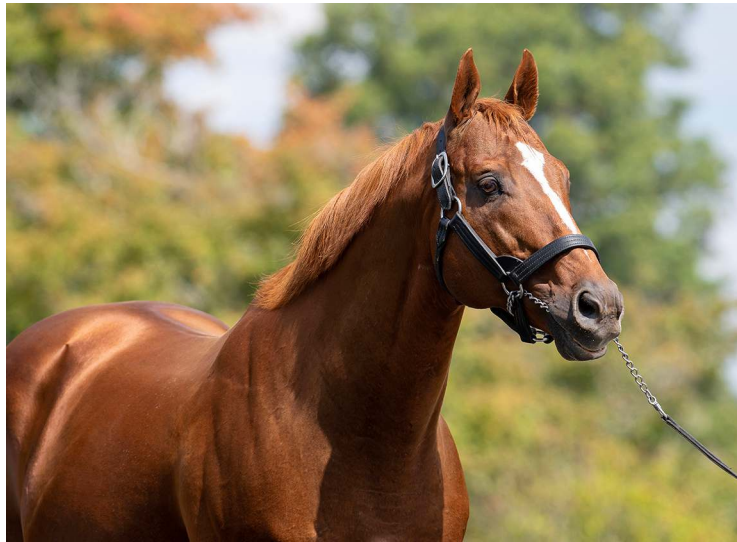
Curlin

The venerable Mineshaft obviously owes fourth place to the desert plunder of Senor Buscador, who accounted for 76.7% of his total $15,680,634 bank, though it was nice to see him close out 2024 with a 2-year-old stakes winner (Jenkin in the Year's End Stakes at Oaklawn). But Constitution certainly took a major step forward--as many had confidently anticipated--in finishing just behind on $15,400,026. While just lacking that Grade I headliner he elevated himself sharply, with a sixth crop into the gate, from $10,641,524 and 15th place in 2023. And of course he now also has a son making waves in Tiz the Law .