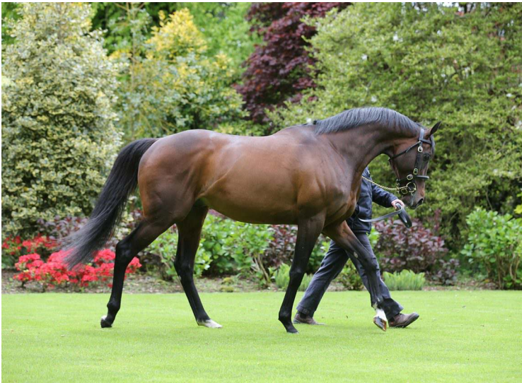
Camelot is the champion sire in France and led the European table Coolmore