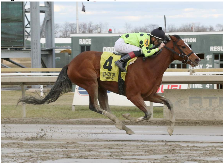
Hollywood Beauty

Also Ran: Tip Line, Alyvia Mavis, Belle Bottoms, Maximus Angelicus. Scratched: Majestic Jo, Not Too Late.