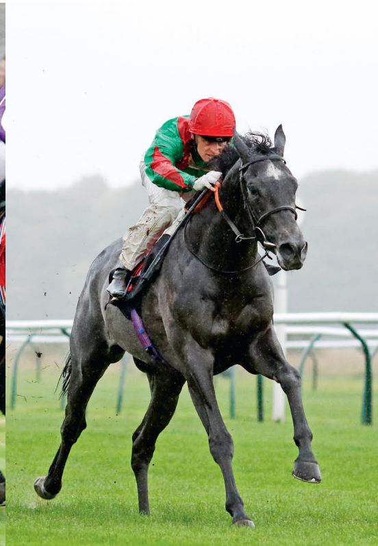
Gethin, six-length winning debutant, Timeform 96