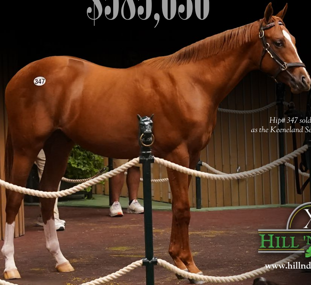
Hip# 347 sold for $5,000,000 as the Keeneland September Sales Topper