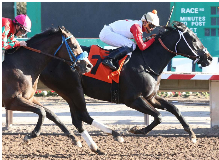
Take Charge Tom became the first stakes winner for WinStar's Tom's d'Etat in the Lost In the Fog Juvenile S.