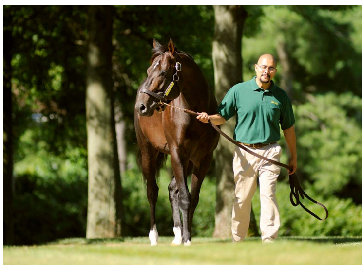
Twirling Candy | Lane's End

Unsurprisingly he did the same on the overall turf list, despite only sending a third crop of juveniles to the gate. But the grass champion is Twirling Candy , whose outstanding campaign places him sixth on the general sires' list, with $8,457,529 of his aggregate $15,174,744 banked on the green. No surprise to see Justify (a few cents shy of $8 million) lying second, nor the splendid veteran War Front in fourth, but those who take a prescriptive view of pedigrees must clock none other than Into Mischief between them. If you consider that his stock will typically experiment with grass only if not working out on the main track, it reflects pretty scandalously on the big international programs that he has been given virtually zero opportunity in Europe.