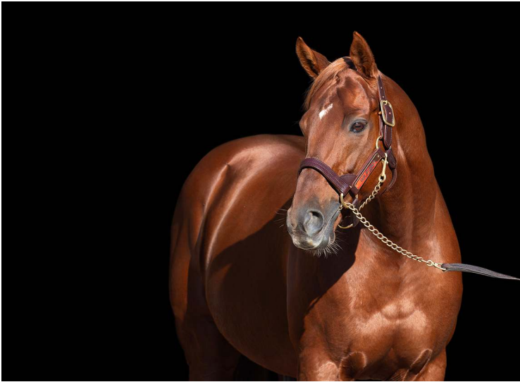
Gun Runner

of $28,562,932 he posted in 2022. That felt inevitable the moment Laurel River won the G1 Dubai World Cup, but the fact is that Into Mischief would have fallen only marginally short (at $28,212,648) even if that particular horse had never left his stable this year.