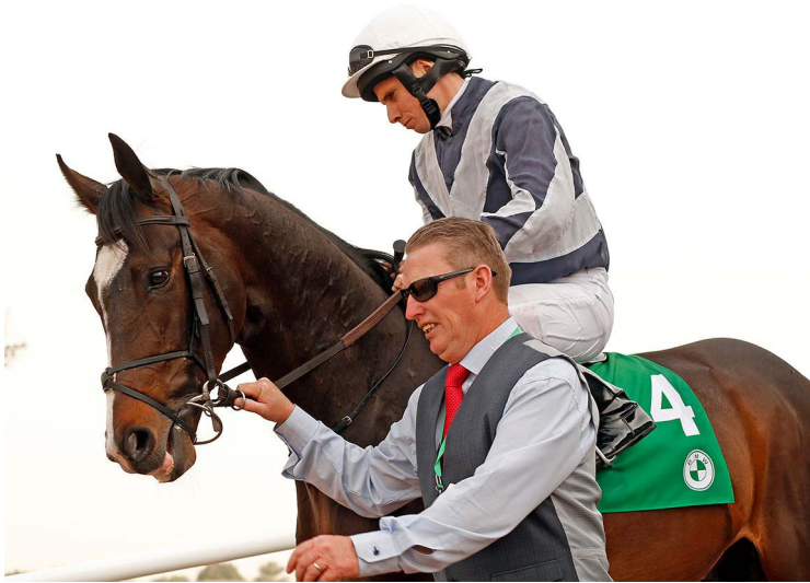
Mount Everest