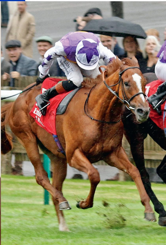
Stanhope Gardens, runner-up in the G3 Autumn Stakes, Timeform 109