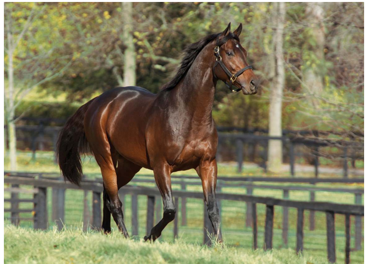
Blame | Claiborne

Omaha Beach with six graded stakes performers. But the cavalries behind some of these young commercial sires continues to astound. Fourth-placed Vino Rosso , for example, has accumulated exactly 200 starters in 2024 with only a second crop of juveniles into the gate! Let's hope some of those young stallions showing promise under the radar get more attention than Preservationist , who has now left the country despite a class-high 56% winners to starters in 2024.