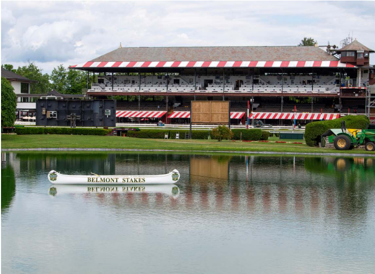
Saratoga Race Course