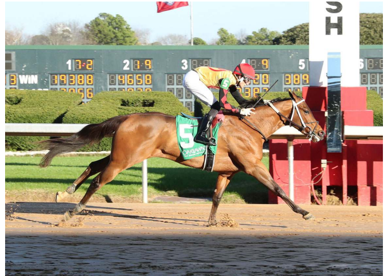
Miss Martini

Hip 423: Dam sells at KEEJAN with Denali