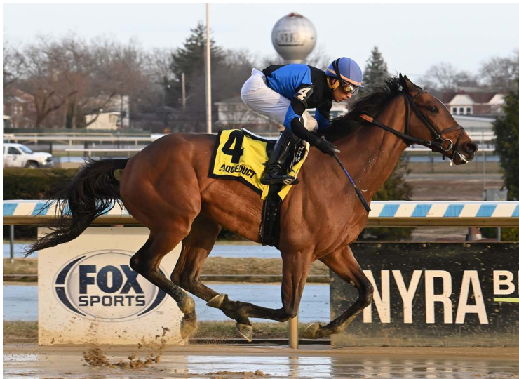
Phileas Fogg