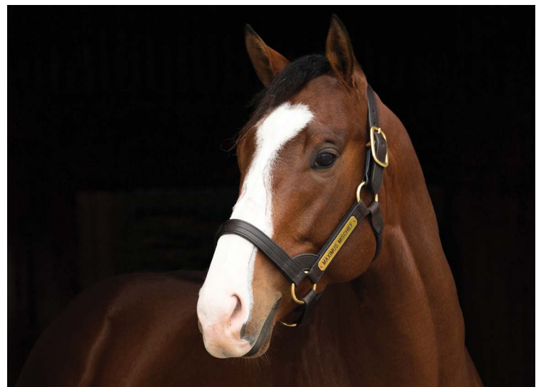
Maximus Mischief | Spendthrift Farm