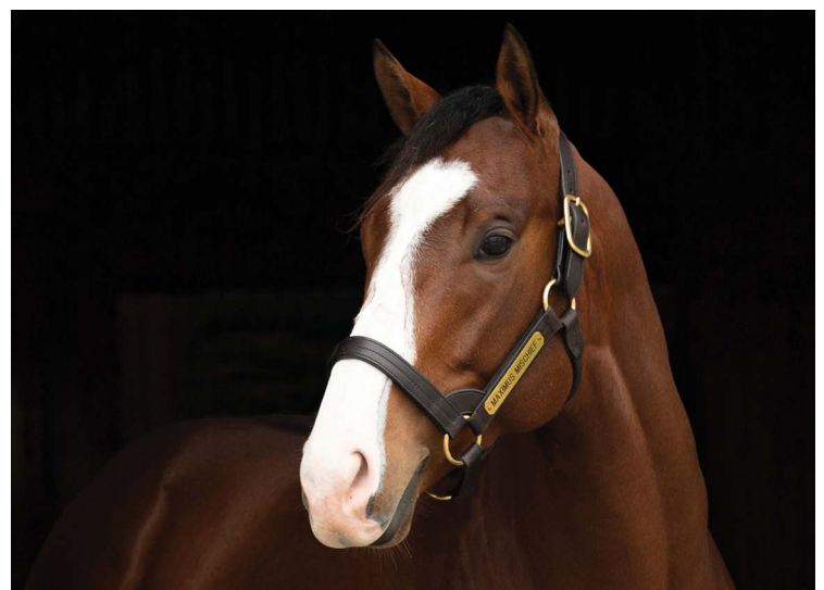
Maximus Mischief | Spendthrift Farm