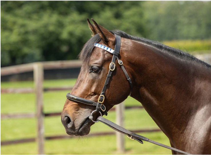
Pinatubo | Darley