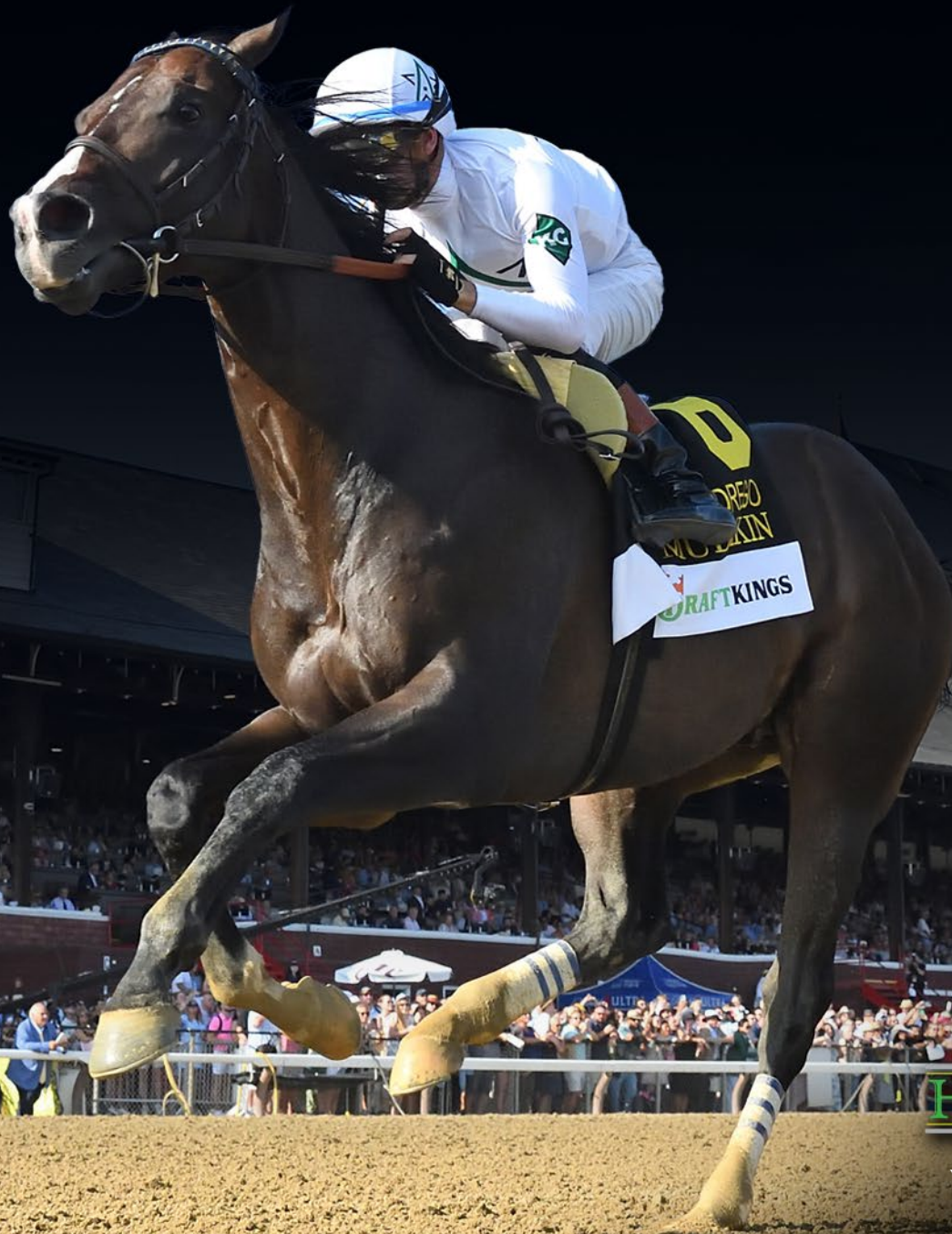
Mullikin winning the Forego Stakes (G1) at Saratoga

IN 2024, SIRE OF: FOREGO STAKES (G1) WINNER MULLIKIN AND NEW MILLIONAIRE NEWGRANGE