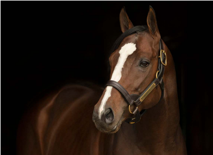
Thousand Words