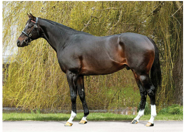
Kameko | Tweenhills