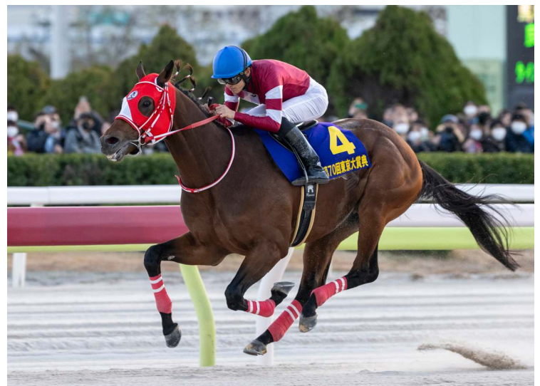
Forever Young

Also Ran: Ushba Tesoro (Jpn), Grand Bridge (Jpn), Derma Sotogake (Jpn), Crown Pride (Jpn), Sayono Nature (Jpn), King of the Nile (Jpn), Grande Mare (Jpn). Click for the goracing.jp chart and VIDEO.