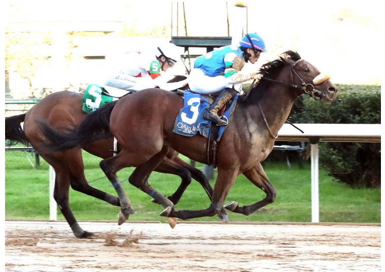
Monet's Magic

MONET'S MAGIC (c, 2, Good Magic --Rontos Lily {MSP, $107,714}, by Big Drama) kicked off his racing career last