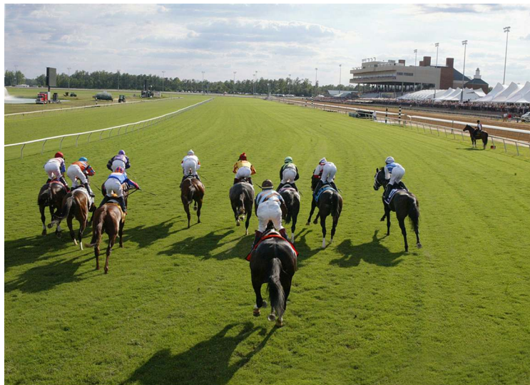
Virginia's Colonial Downs

--Let's see HIWU catch some actual bad guys. The Horseracing Integrity and Welfare Unit never seems to let common sense get in the way of a suspension.