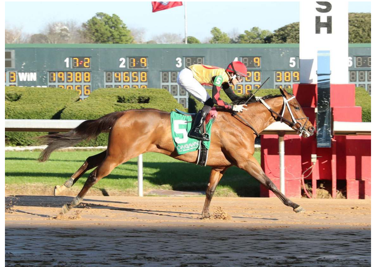
Miss Martini

Hip 423: Dam sells at KEEJAN with Denali