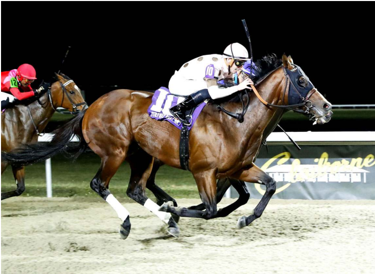
Swiss Slang