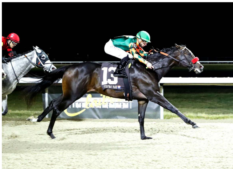
Maitre D