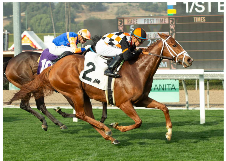
Queen Maxima