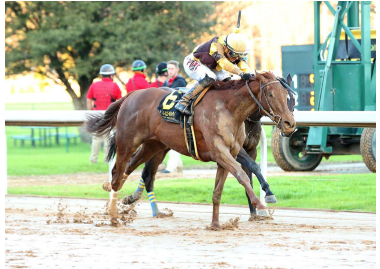
Jenkin

Well-distanced when third in her 6 1/2-furlong debut at Aqueduct Sept. 26, Jenkin was never a threat when fifth going seven furlongs at Churchill Nov. 2. She rolled to a three-length maiden score when stretched to one mile at Oaklawn last time out Dec. 6. Click for the Equibase.com chart or VIDEO, sponsored by FanDuel TV.