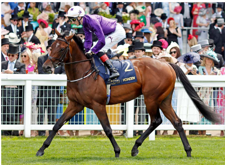
Arizona Blaze | Racingfotos.com