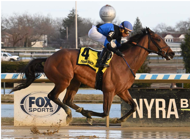
Phileas Fogg