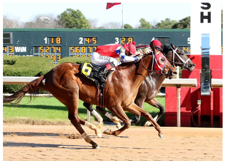
Innovator (inside) over Dreaminblue (outside)

INNOVATOR (c, 2, Authentic--Inspired {MSW, $439,785}, by Unbridled's Song), who was slammed at the windows to the tune of 80 cents on the dollar here, blazed out of the blocks to lead by several lengths up the backstretch. Making every pole a winning one, the dark bay kept to the task around the far turn, but he was joined to the outside by Dreaminblue (Street Boss) for the final furlong. The colt would not let his rival pass and slid into home by a head to clear the maiden ranks. Cont.