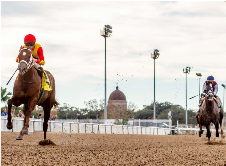
Smoken Wicked (outside)