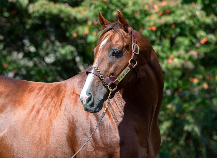
Midshipman