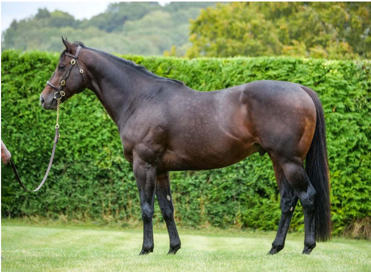
Sergei Prokofiev | Whitsbury Manor Stud