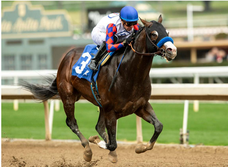
March of Time

7th-Gulfstream, $40,600, Msw, 12-27, 2yo, f, 1 1/16m, 1:46.02, ft, 3 1/4 lengths.