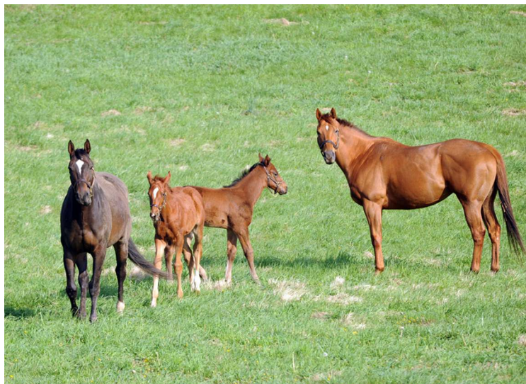
Mares and foals in the field

Twelve people have been denied stud book privileges of registering foals with the Jockey Club, effective January 1, 2025, due to violations, the group announced Friday via press release.