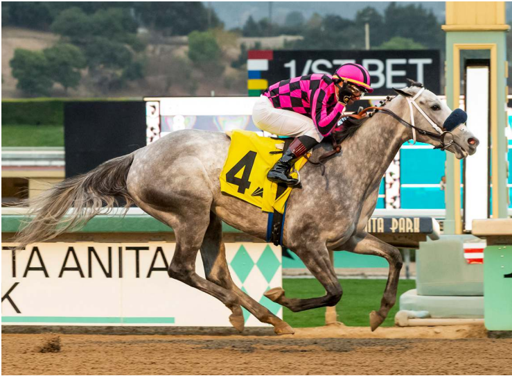
Our Moonlight