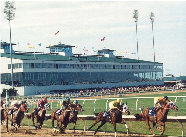
Sam Houston | Coady

Each year up to $25 million from sales tax on purchased horse-related items (feed, tack, etc.) is deposited into the HIEA and up to 70% of the funds can be spent on purses. It covers all racing breeds in the state.