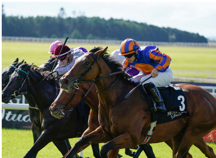
The unbeaten Lake Victoria wins the Moyglare Stud Stakes