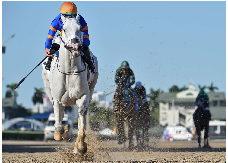
White Abarrio dominated an allowance field on his return to racing after over five months away

Drawn in the 10-hole for this next stop on his comeback tour, MGISW White Abarrio (Race Day) will tackle 11 others in Saturday's GIII Mr. Prospector Stakes at Gulfstream Park all