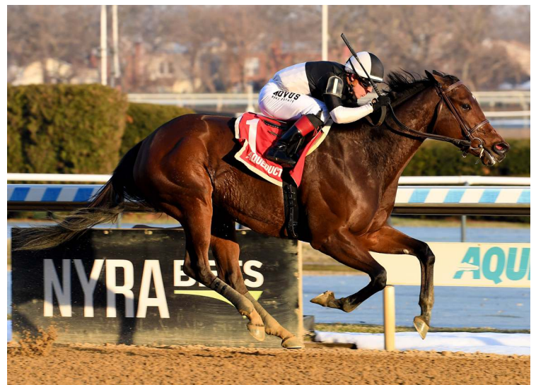
Stonewall Star

One of 68 stakes winner for Flatter, Stonewall Star is out of a half-sister to GISP Pinch Pie (Victory Gallop). This is the family of GI Breeders' Cup Classic winner Volponi (Cryptoclearance). Jonata, who has four winners from four runners, has not been reported bred since 2021. Click for the Equibase.com chart or VIDEO, sponsored by FanDuel TV.