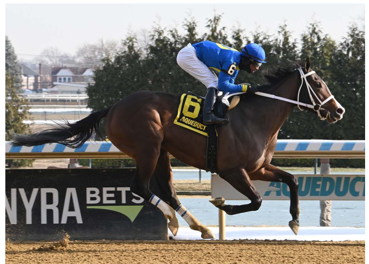
Mega Mil