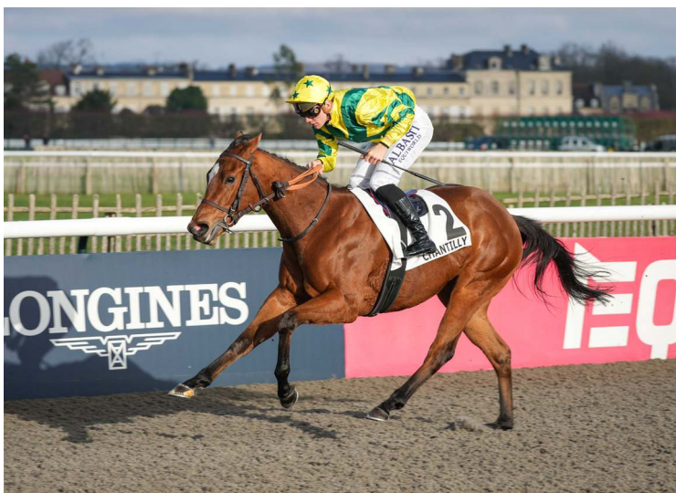
Chantilly winner Kaadi

Tamyz (Fr), g, 3, Le Havre (Ire)--Tamasha (GB), by Sea The Stars (Ire). Deauville, 12-27, 12 1/2f (AWT), 2:39.70. B-Sumbe (FR). *€40,000 3yo '24 ARQJUL.