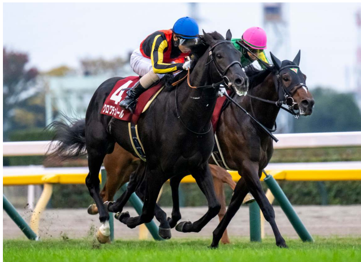
Croix du Nord