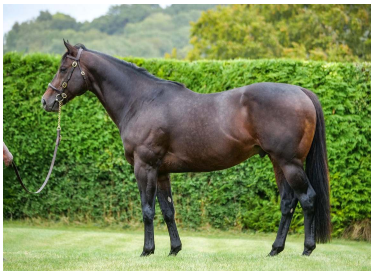
Sergei Prokofiev | Whitsbury Manor Stud

Sergei Prokofiev (Scat Daddy), Whitsbury Manor Stud 121 foals of racing age/28 winners/2 black-type winners 16:00-NEWCASTLE, 6f, El Cobre Fuego (GB) 31,000gns Tattersalls December Foal Sale 2022; 30,000gns Tattersalls October Yearling Sale (Book 3) 2023 16:00-NEWCASTLE, 6f, Oilisa (GB) 4,000gns Tattersalls December Foal Sale 2022