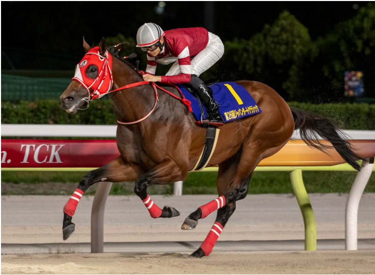
Forever Young