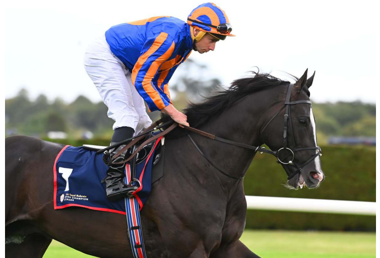
Auguste Rodin

Two other names on the Coolmore roster catch the eye in this fee bracket. Auguste Rodin (Ire) looks exceptional value at €30,000. He became a bit of a 'Marmite' horse following some lapses on the track but I'm prepared to stick to the fact that when he was good he was brilliant. It takes a proper horse to compile a CV which includes the Derby, Irish Derby, Irish Champion Stakes, Breeders' Cup Turf, Prince of Wales's Stakes and Futurity Trophy. And that's what he is: a proper horse with a top-drawer pedigree.