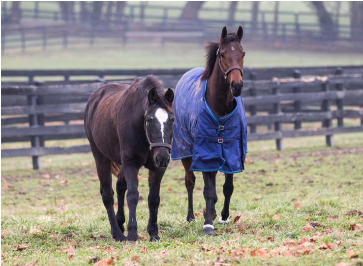
Thorpedo Anna and her paddock-mate Cooper