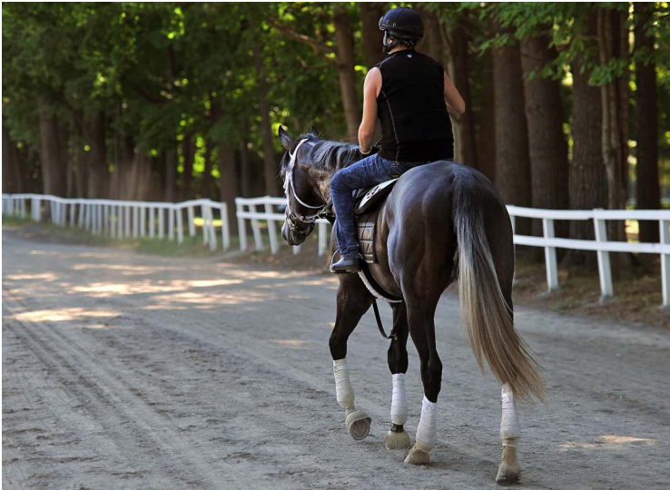
Blofeld

His average earnings per starter sits at $101,710, and his highest earner has just over $400,000 in the bank--meaning the average is not skewed by a single outlier, as further witnessed by his median earnings per runner of $76,535.