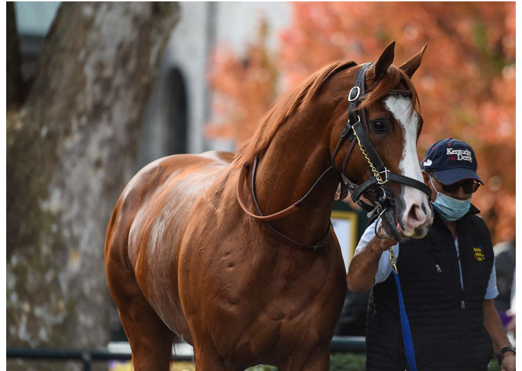
Improbable | Jon Siegel

60 foals of racing age/13 winners/2 black-type winners