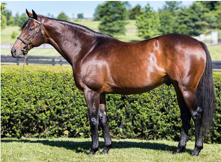
Divisidero

Kitten's Joy--Madame du Lac, by Lemon Drop Kid Airdrie Stud, $5,000