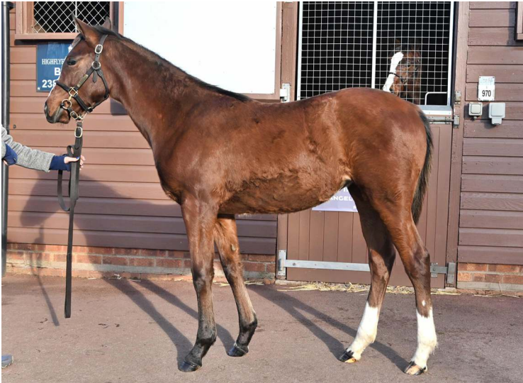
The Frankel filly out of Archangel Gabriel | Tattersalls