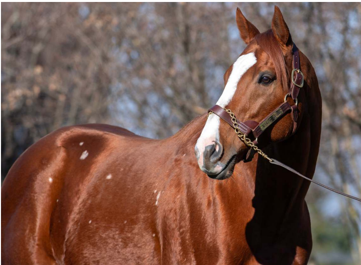
Mystic Guide | Sarah Andrew

'TDN Rising Star' MYSTIC GUIDE actually achieved an excellent average--touching $60,000, off a $15,000 conception fee--from 11 weanlings sold, and no fewer than 154 mares returned to him in the spring.