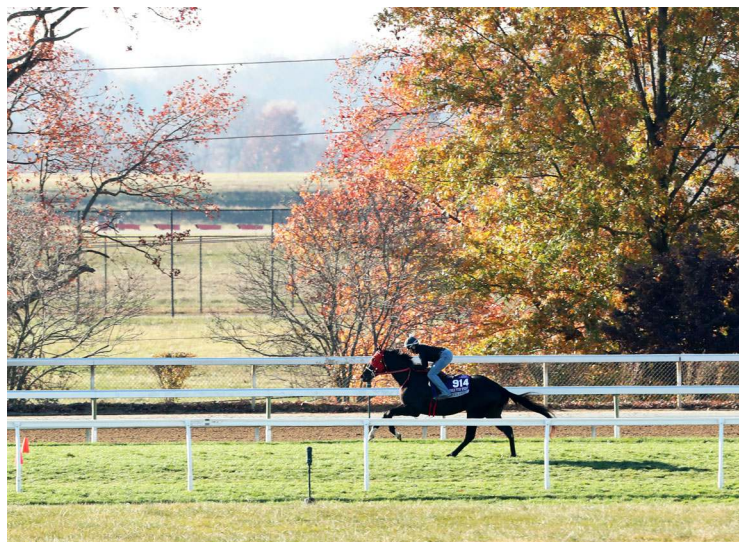
The ill-fated Tyler's Tribe