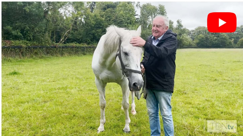
The Ever Growing Influence of Dark Angel