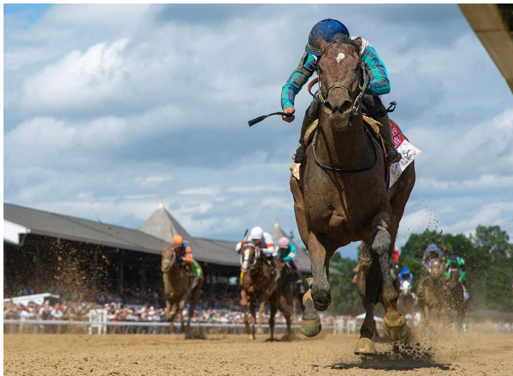
Book'em Danno

Cigar Mile. "But I don't think he ran his best, whether that was a function of him being down inside or maybe a tough campaign beginning to take a toll a bit.