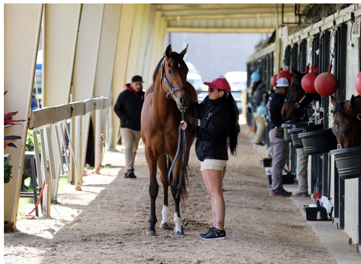
OBS barn area

Ocala Breeders' Sales Company (OBS) has catalogued 316 horses for its January Winter Mixed Sale to be held Jan. 28 and the OBSONline January 2025 Sale is scheduled to begin Jan. 23, according to the auction company's Wednesday press release.