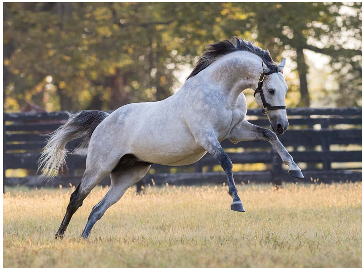
Cross Traffic

As newly-crowned champion freshman, in 2019 Cross Traffic received 188 mares at $25,000, up from 60 at $7,500 the previous year. The resulting crop included Grade I winner Defining Purpose, a moral Grade I winner in the tragic Maple Leaf Mel, and lately Neece Marie.