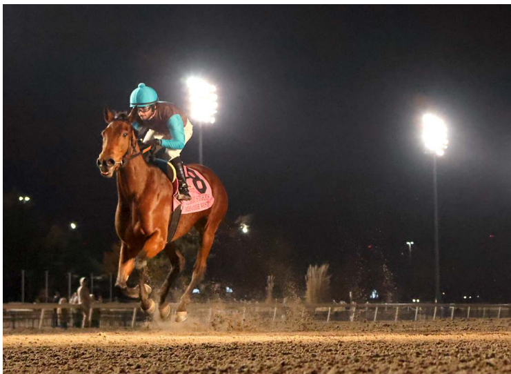
Miss Code West | | Remington Park

Three stakes wins against fellow Oklahoma-breds and a second in her only open company attempt, earned Miss Code West (Code West) the Horse of the Meeting honor at Remington Park for a second consecutive season. The 3-year-old filly received the most votes in the contentious category following the 2024 race meeting.