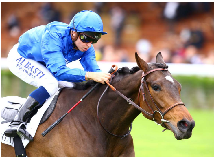
Musis Amica, the dam of Aegean Prince