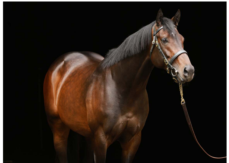
Mo Town | Coolmore

Breed to race, you can't go wrong with Echo Town at $5,000. He has lots of winners already with his first-crop and stakes horses too, although nothing graded yet. I can only see them getting better at three.