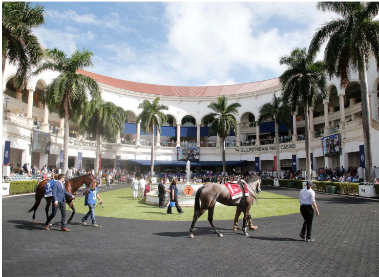
Gulfstream's paddock

1/ST, the ownership group behind Gulfstream Park and Santa Anita Park, is partnering with auction company Fasig-Tipton, who will be their title sponsor for the new Fasig-Tipton 3-Year-Old Filly Series, the company said in a press release on Wednesday.