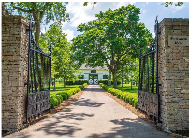
Mt. Brilliant Farm gate

Mt. Brilliant Family Foundation has signed on for the third consecutive year as the presenting sponsor for the Thoroughbred Charities of America's (TCA) upcoming 35th Annual Stallion Season Auction to be held Wednesday, Jan. 8 through Sunday, Jan. 12, the organization said via a Wednesday press release.