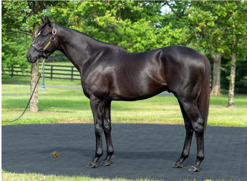
Independence Hall | Louise Reinagel