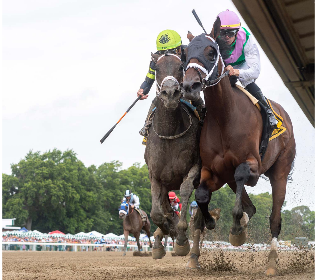
2024 in photos: July 20. In a dramatic stretch drive, Idiomatic (rail) holds off Soul of an Angel and wins the GIII Molly Pitcher Stakes at Monmouth Park.