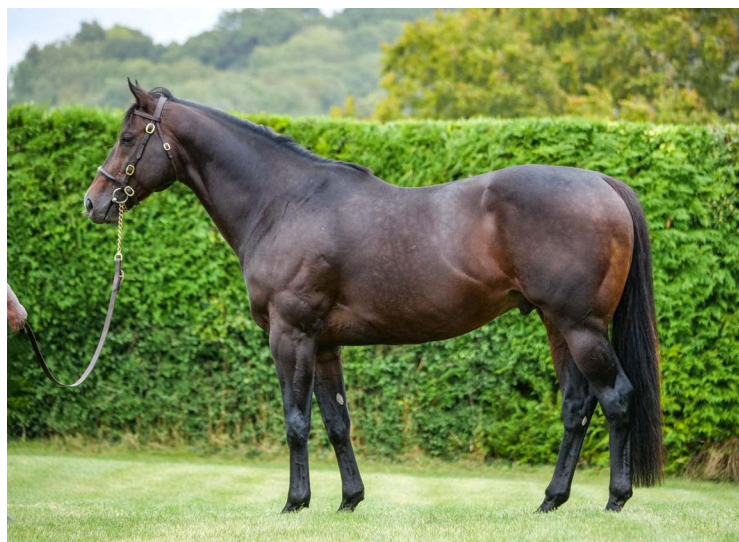
Sergei Prokofiev | Whitsbury Manor Stud