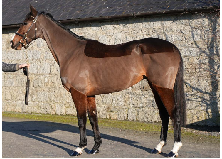
Uncle Phil | ThoroughBid