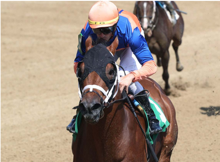
Loggins | Coady Photography