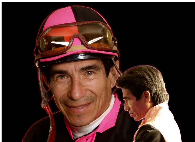
Hall of Famer Laffit Pincay Jr.