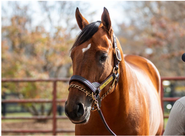
Muth, son of Good Magic earned Grade I wins at 2 & 3