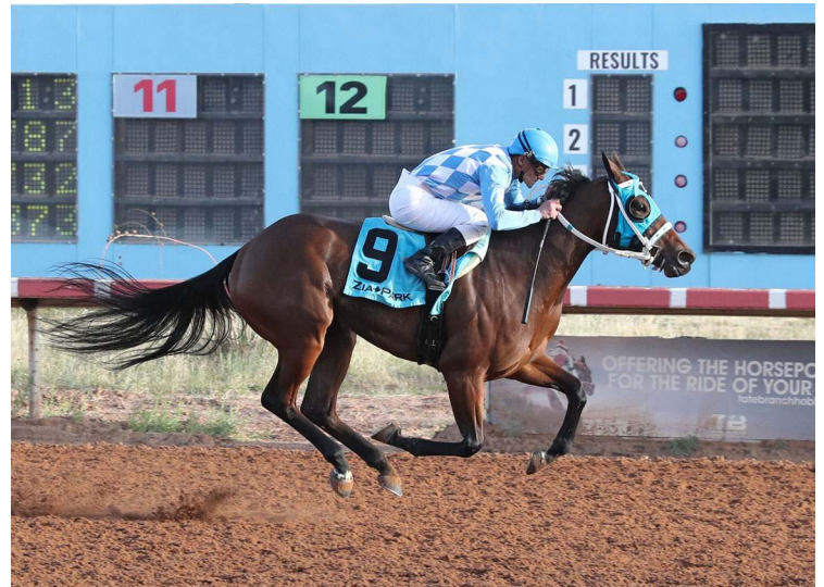
Payingoffmymarker

Justify , Valentine Candy, c, 3, o/o Taste Like Candy, by Candy Ride (Arg) . Steel Valley Sprint S., 11-25, Mahoning Valley Kentucky Wildcat , Kentucky Gold, f, 3, o/o Gold Rush Hush, by Attila's Storm. MSW, 11-25, Zia Mark Valeski , Miss Arlington, f, 4, o/o Luvnotionumbernine, by Notional. Hollywood Gaming Mahoning Distaff S., 11-25, Mahoning Valley Marking , Payingoffmymarker, f, 3, o/o Domesday Gal, by Dome. New Mexico Classic Oaks, 11-25, Zia