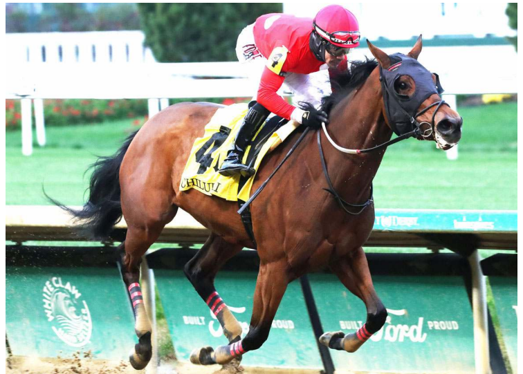
'TDN Rising Star' Two Sharp became the newest graded winner for Lane's End's Twirling Candy in the Chilukki S.

FOR THE WEEK ENDING NOVEMBER 24, 2024 ACTIVE NORTH AMERICAN-BASED STALLIONS