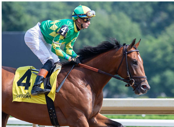
Chancer McPatrick

Fans will have their second of six opportunities to bet on the 150th running of the GI Kentucky Derby Thursday, Nov. 28 through Sunday, Dec. 1 with Pool 2 of the Kentucky Derby Future Wager where GISW Chancer McPatrick (McKinzie) and East Avenue (Medaglia d'Oro) were made the 10-1 co-individual favorites with 'All Other Colts and Geldings Foaled in 2022' not listed within the 38 individual interests listed as the heavy 4-5 favorite.