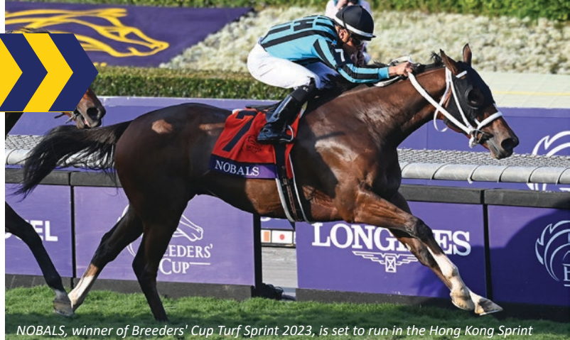
NOBALS, winner of Breeders' Cup Turf Sprint 2023, is set to run in the Hong Kong Sprint

Nobals will need to be at his best since he will face five other Group 1 stakes winners and the sensational Ka Ying Rising who just broke the Sha Tin six-furlong course record in 1:07.43 seconds. This year's Breeders' Cup Turf Sprint winner Starlust is also entered after showing a sensational rally to win at Del Mar. Japan sends the