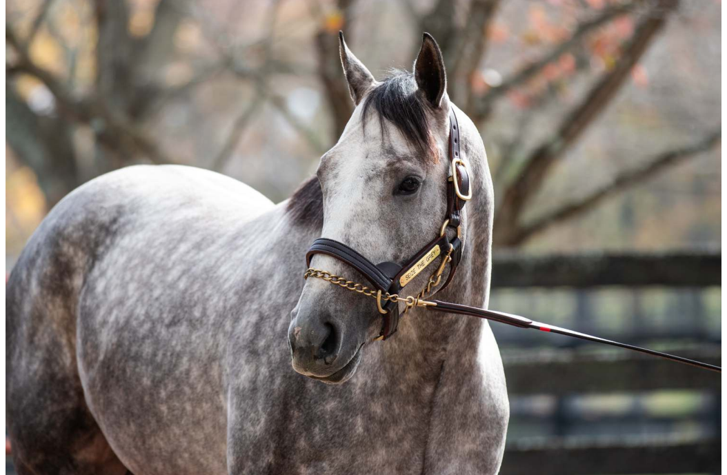
Dual Grade I winner Seize the Grey (Arrogate) is one of four stallions new to Gainesway in 2025. More on the new recruits on page 3.