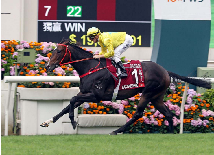
A full-sister to Lucky Sweynesse will be offered at the 2025 NZB National Yearling Sale | HKJC

A total of 1,088 lots have been catalogued for the 2025 New Zealand Bloodstock (NZB) National Yearling Sale, which is scheduled to take place at Karaka from January 26-30. The catalogue, which is now available to view online , features 661 yearlings in Book 1 and another 427 in Book 2.