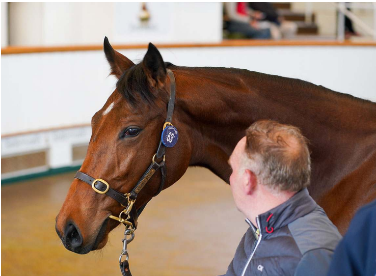
Lot 63, the record-breaking Dark Angel filly | Tattersalls