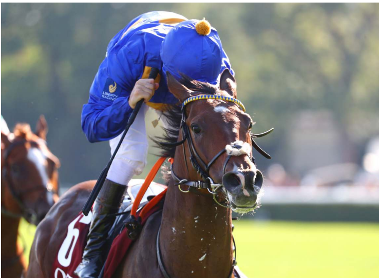
Fantastic Moon

The connections of Fantastic Moon (Ger) (Sea The Moon {Ger}), eleventh in Sunday's G1 Japan Cup, have declined an invitation to the G1 Longines Hong Kong Vase at Sha Tin Racecourse on Sunday, December 8, and the four-year-old has