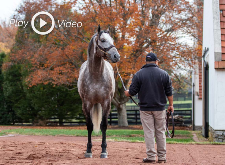
Click here for our visit with Charge It and the other three newcomers at Gainesway Farm