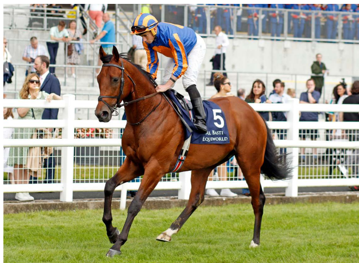
Aesop's Fables