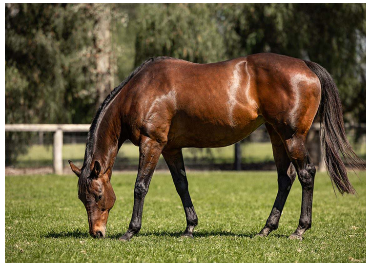
Winx | Inglis