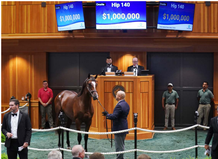
Yinzer (Hip 140)