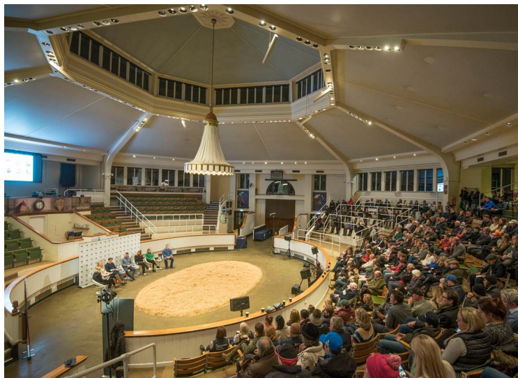
The 2023 TBA Breed Smart Forum

The Breed Smart Forum: Matings for Markets will take place on Thursday, Nov. 28 in the sales ring at Park Paddocks during the Tattersalls December Foal Sale, the Thoroughbred Breeders' Association (TBA) announced on Friday.