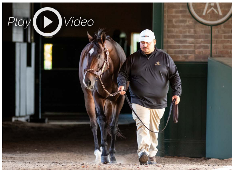
Click here for our visit with Cogburn, as well as fellow newcomers Timberlake and Heartland, at WinStar Farm