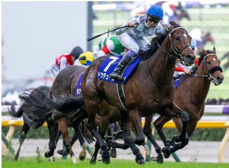
Do Deuce

“I really think I ride the best horse in the race,” the Belgian said. “So, we're going to do our best on Sunday to realize everybody's dream. The team worked hard to bring him 100% fit and I think his owner wants to realize also something big, so we are all very confident.”