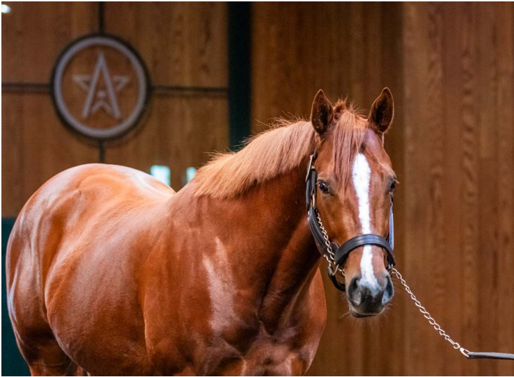
Heartland at WinStar Farm