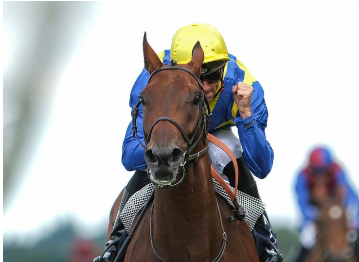
Goliath at Ascot