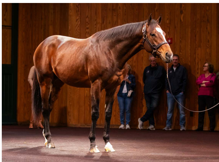
Breeders check out Timberlake at WinStar's open house

While Heartland was never able to make it back to the starting gate, the WinStar team is hoping he can make his mark as a sire. Standing for $10,000, Heartland will be the second son of Justify to stand in Kentucky after Spendthrift's Arabian Lion retired last year. Cont.