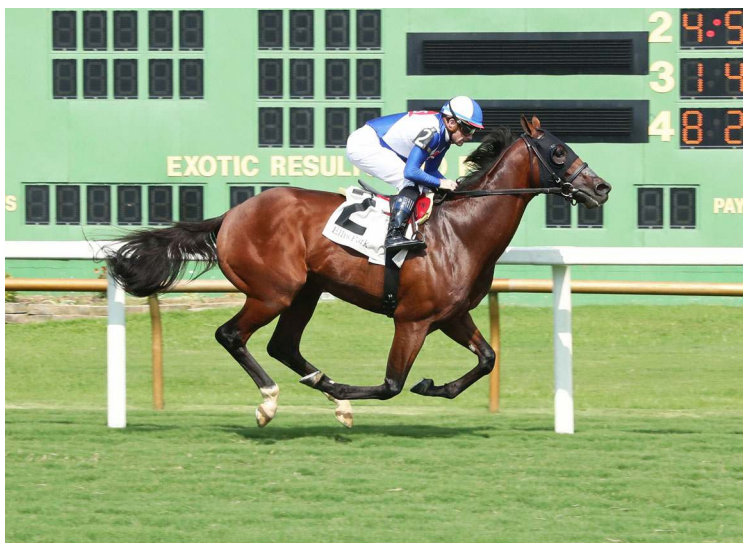
Dashman

“He's had a couple of breezes since then; he had a nice half on Saturday, just an easy maintenance work to get him to the race. He's been good. He hasn't been out of the feed tub. He's in the bridle when he's training. We're expecting a good outcome on Saturday.”