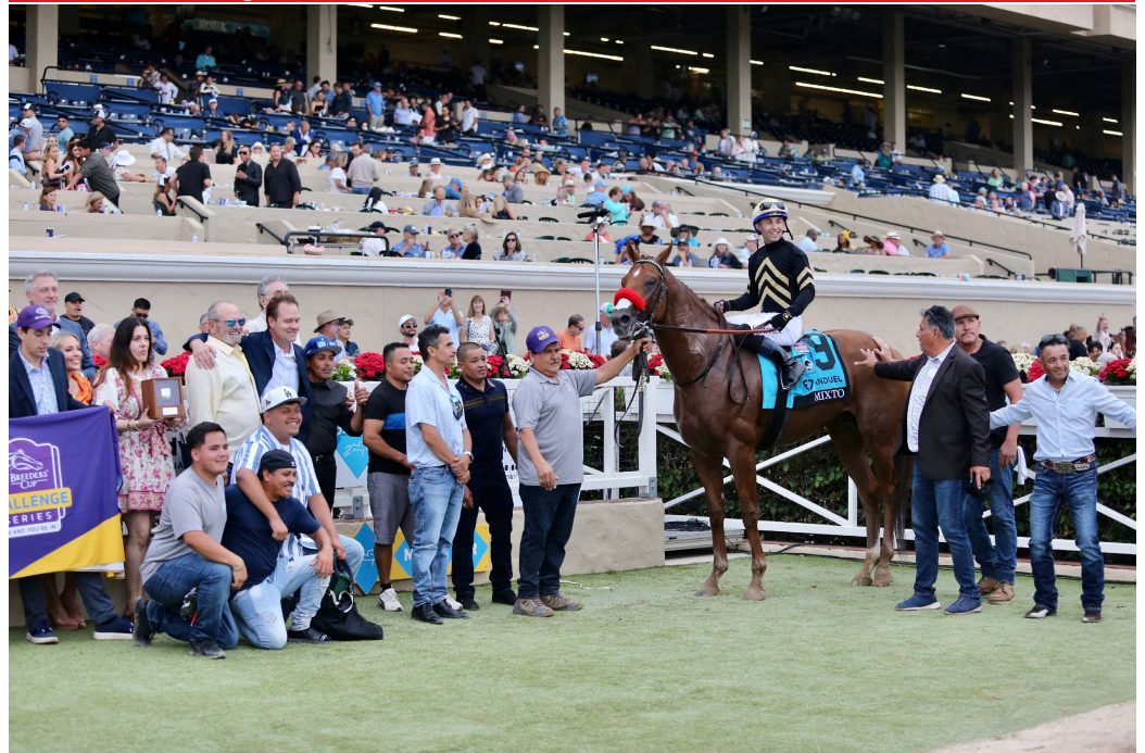
GI FanDuel Racing Pacific Classic winner Mixto (Good Magic) returns in Saturday's GIII Native Diver Stakes at Del Mar.