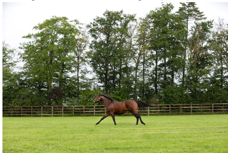
Pinatubo has a runner at Dundalk | Darley

Pinatubo (Ire) (Shamardal), Dalham Hall Stud 110 foals of racing age/19 winners/1 black-type winner 5-DUNDALK, 8f, Carolina Jetstream (GB) 110,000gns Tattersalls October Yearling Sale (Book 2) 2023