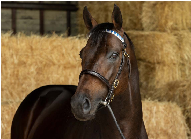
Too Darn Hot | Darley

Volatile (Violence) , Three Chimneys Farm, $15,000 125 foals of racing age/21 winners/0 black-type winners 7-Churchill Downs, 3:55 p.m. EDT, Msw 6 1/2f, Putting Eagle, 12-1 $25,000 RNA KEE NOV wnl; $110,000 KEE SEP yrl; $295,000 OBS MAR 2yo 5-Aqueduct, 2:09 p.m. EDT, Msw 6 1/2f, Volatile Situation, 7-2 $75,000 SAR AUG yrl