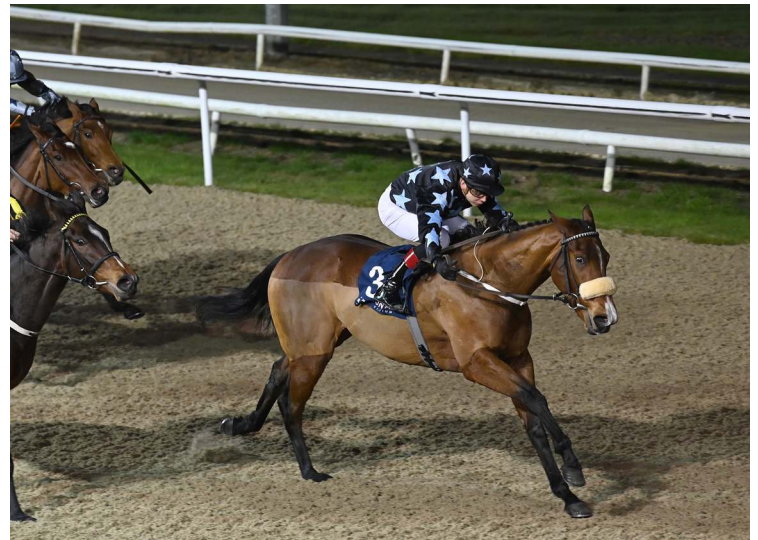
Empress Artemis