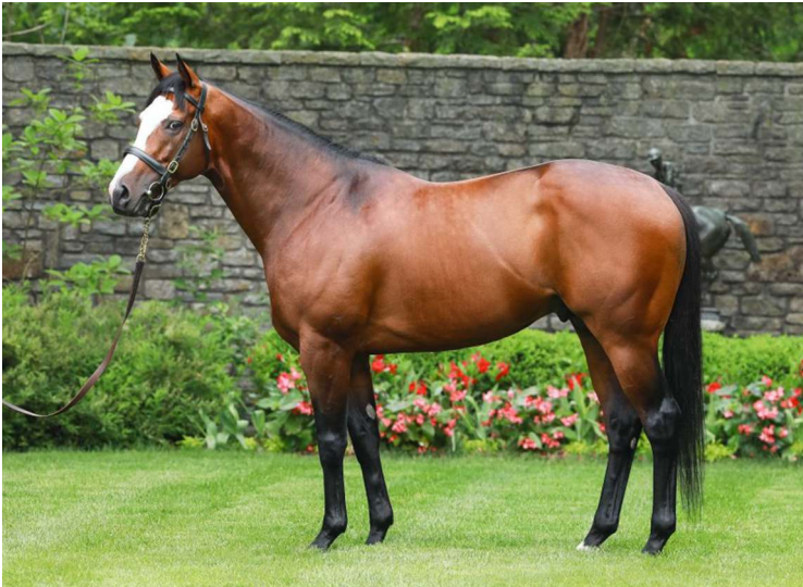
Tiz the Law | Coolmore

Fog of War (War Front) , Topaz Stud, private 53 foals of racing age/3 winners/0 black-type winners 5-Aqueduct, 2:09 p.m. EDT, Msw 6 1/2f, Lets Fight, 15-1