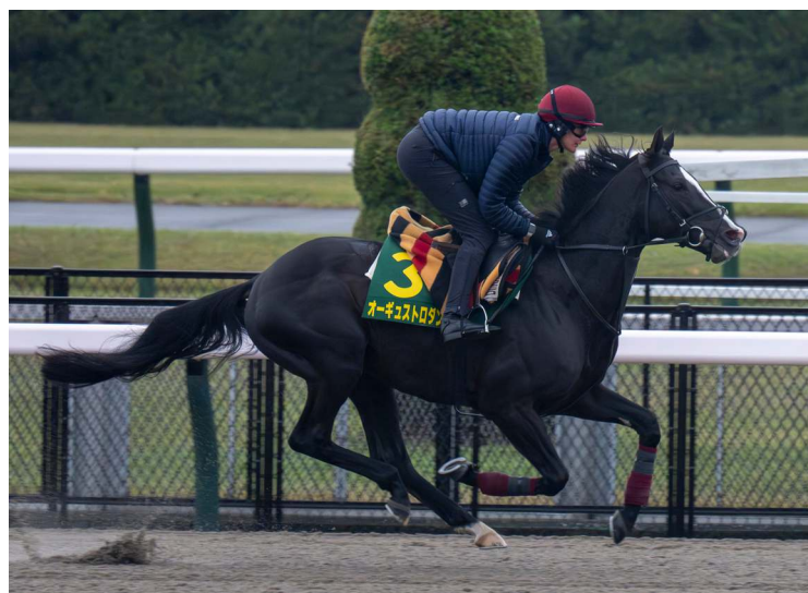
Auguste Rodin

It has been an enigmatic version in 2024 of Auguste Rodin (Ire) , who becomes the first foreign-based son of Deep Impact to contest a race on the JRA circuit. Cont. p15