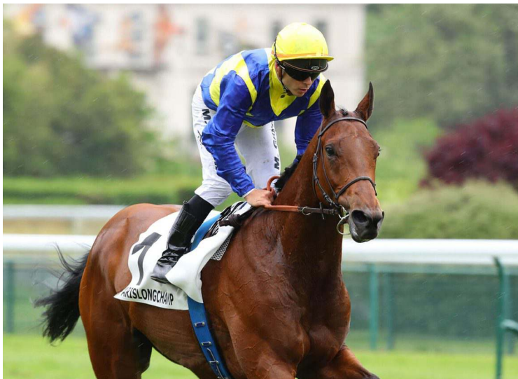
Goliath at ParisLongchamp

“Think about it, in my first year I've had a horse in the Kentucky Derby,” he said. “I've had horses at Royal Ascot. I've had a horse in the Golden Slipper. I had a horse in the Everest and now I have a horse in the Japan Cup. It's fun. Who doesn't want to be in all those races?”