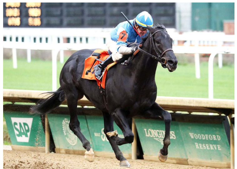
Kinetic Control | Coady Media