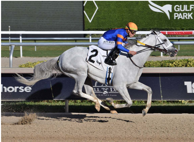
White Abarrio

They bet him like he couldn't lose, and multiple Grade I winner White Abarrio (Race Day) justified the confidence with a tour de force as the 1-5 favorite in the seventh race at Gulfstream Park.