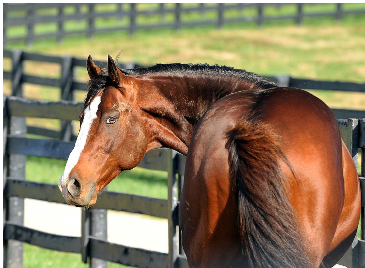
Union Rags is the sire of Caramel Swirl's full-brother Snappy Dresser, a live chance in Saturday's Cattleys Stakes

T O Elvis (Volatile) was a debut third on the grass in September and validated 3-5 favoritism in romping by 9 1/2 lengths in his first start on the dirt at Kyoto Oct. 5.