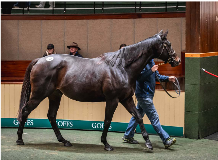
Her Honour topped Friday's session at €725,000 | Goffs

Goffs offered 207 mares on Friday and sold 161 which equates to a 78% clearance rate. The turnover was €10,839,000 and the average was €67,323 while the median rested at €40,000. Taking the Niarchos draft out of last year's bonanza, Goffs are 15% behind the corresponding sale 12 months ago on turnover and average while the median was €42,000 on this day last year.