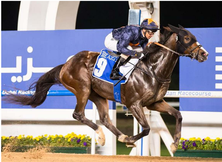
Wild 'n' Woolly is out of a half-sister to Capezzano, a Group 1 winner in Dubai