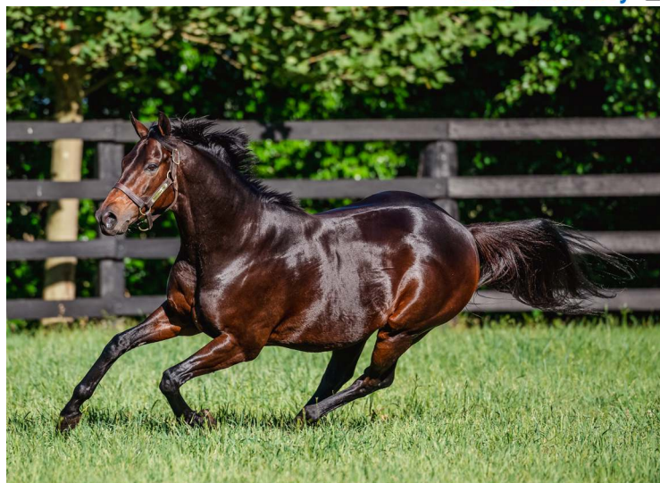
Too Darn Hot | Tattersalls Online