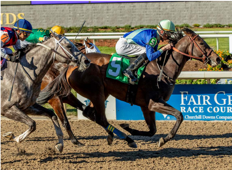
Hay Jude

The winner has a yearling full-brother named Boston Soldier who was purchased as a short-yearling for $42,000 at the OBS January Sale. Click for the Equibase.com chart.