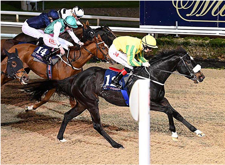
Sakti | Tattersalls Online