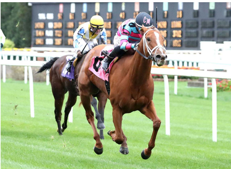
Fantastical

FANTASTICAL (f, 3, Air Force Blue--Wangari, by Giant's Causeway) steadily improved to graduate on her fifth attempt at Turfway back in February. The filly made the switch to grass and