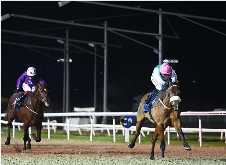
Purview | Racingfotos.com