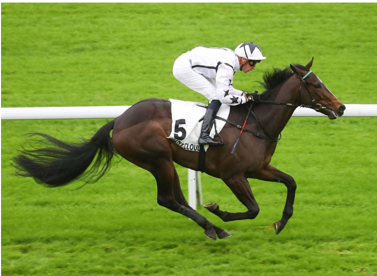
Glamis Road | Scoop Dyga

Listed Prix Herod heroine Glamis Road (Ire) (Kodiac {GB}) (lot 190) is one of two wildcards that were added to Arqana's Vente d'Elevage on Friday. The sale runs from Dec. 7 to Dec. 10 in Deauville.