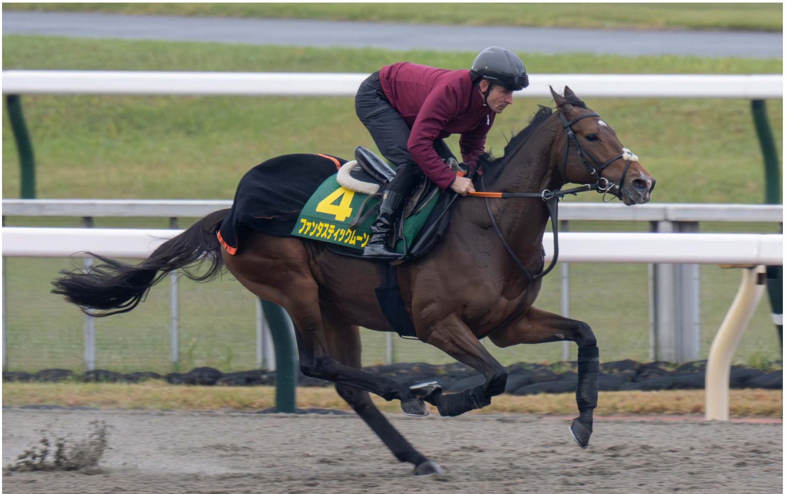
Fantastic Moon galloped in Japan ahead of Sunday's G1 Japan Cup