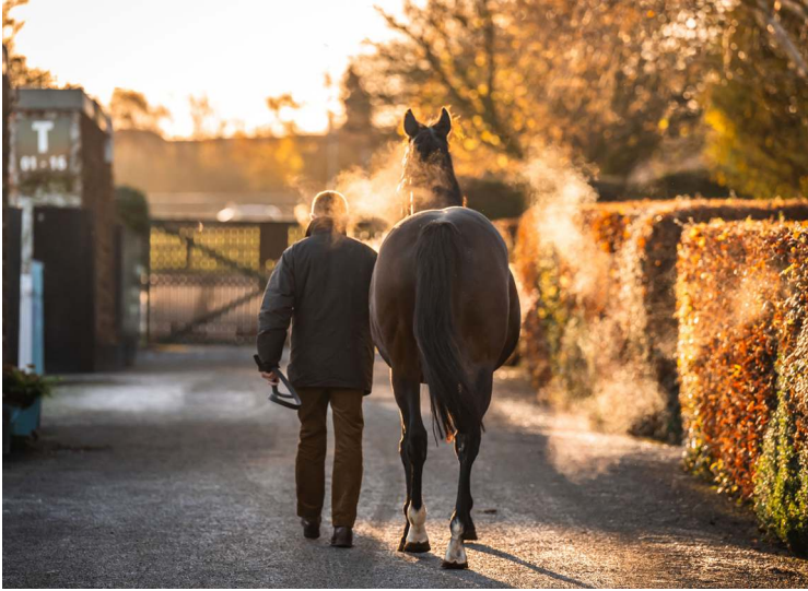
The dam of Goliath was a €5 million buyback | Goffs