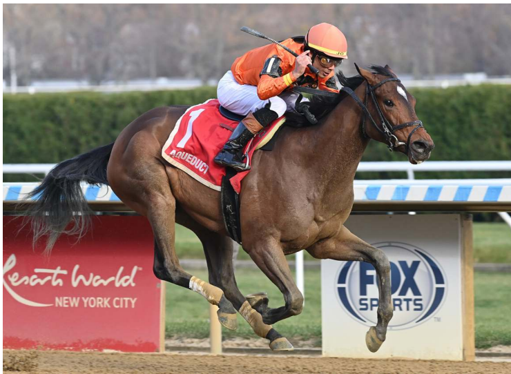
With the Angels

Margins: 2, HF, HF. Odds: 0.35, 38.75, 9.70. Also Ran: Bam's Bliss Kiss, D's a Rock, Valtellina, Bellacose, Phoebeinwonderland. Scratched: Shoot It True.