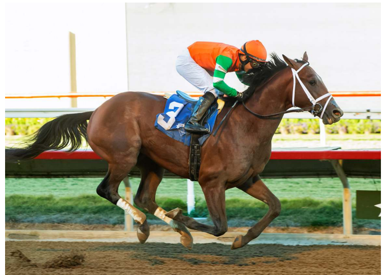
Journalism | Benoit

6th-Del Mar, $56,500, Msw, 11-17, 2yo, 1m, 1:36.49, ft, 2 1/2 lengths.