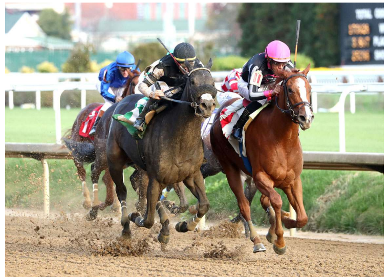
Her Laugh (inside)

6th-Woodbine, C$75,722, Msw , 11-17, 2yo, 1 1/16m (AWT), 1:45.58, ft, 1/2 length.