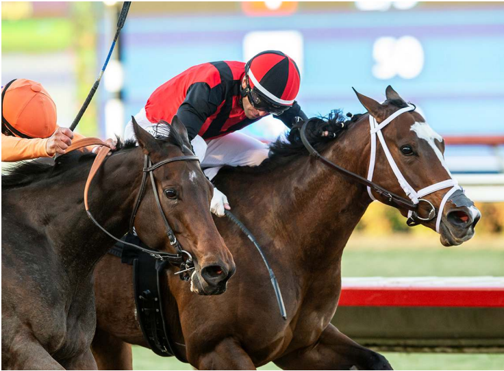
Sandy Bottom (right) defeats Tamara

Certainly it was disappointing to see 'TDN Rising Star' Tamara (Bolt d'Oro) lose in her comeback race on Friday at Del Mar, even if she did get beat by the undefeated filly Sandy Bottom (Omaha Beach) and only lost by a nose. Tamara, the daughter of the great Beholder (Henny Hughes), was all the rage after she won the 2023 GI Del Mar Debutante by 6 3/4 lengths.