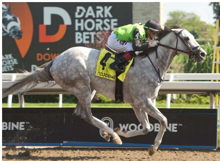
Tyson wins the Seagram Cup in 2023