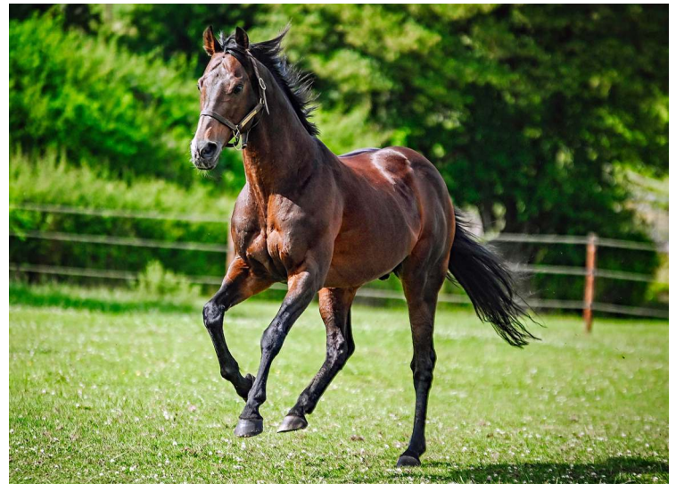
Walzertakt | Chapel Stud