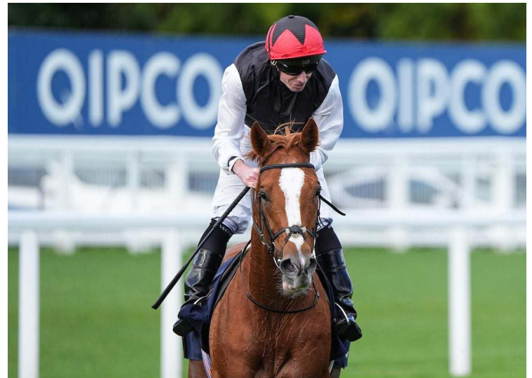
Kyprios: one of four nominations for the Cartier Horse of the Year