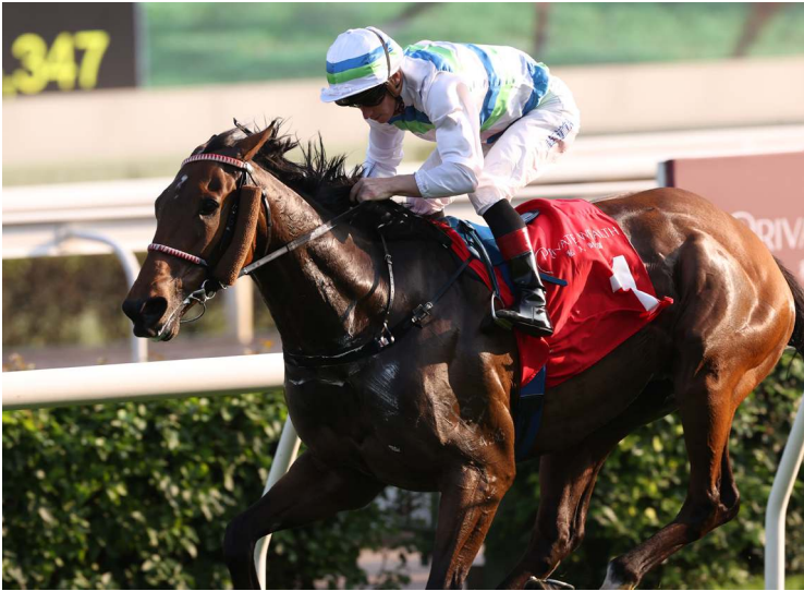
Voyage Bubble | HKJC