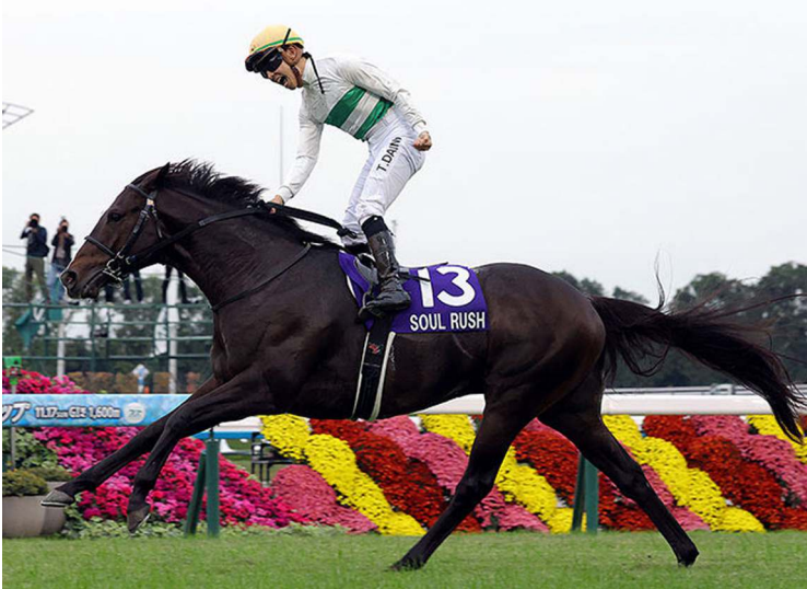
Soul Rush | JRA