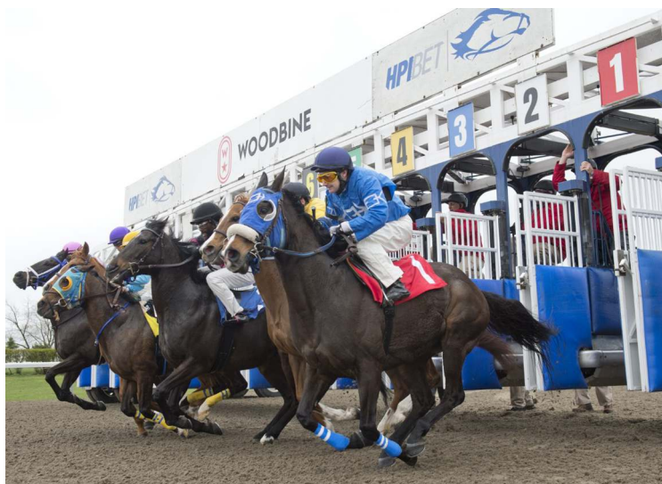
Woodbine gate

During the finale of a 12-race card at Woodbine Racetrack on Saturday, Flawless Ruler (Honor Code) was eased at the top of the lane during a $15,000 claimer going a mile and a sixteenth over the all-weather course, was vanned off, and after an examination by the Alcohol and Gaming Commission of Ontario (AGCO)-licensed veterinarians at the barn, the 5-year-old gelding was humanely euthanized, the track said via a press release late Saturday.