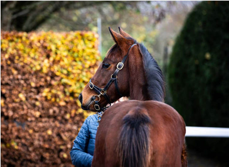
The Goffs November Foal Sale gets underway at 10am on Monday