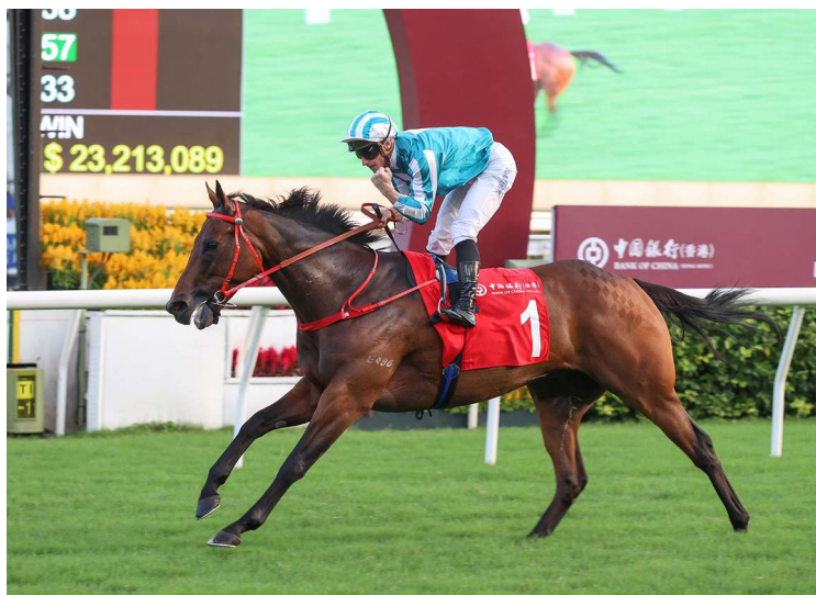
Romantic Warrior romps in his return to action Sunday