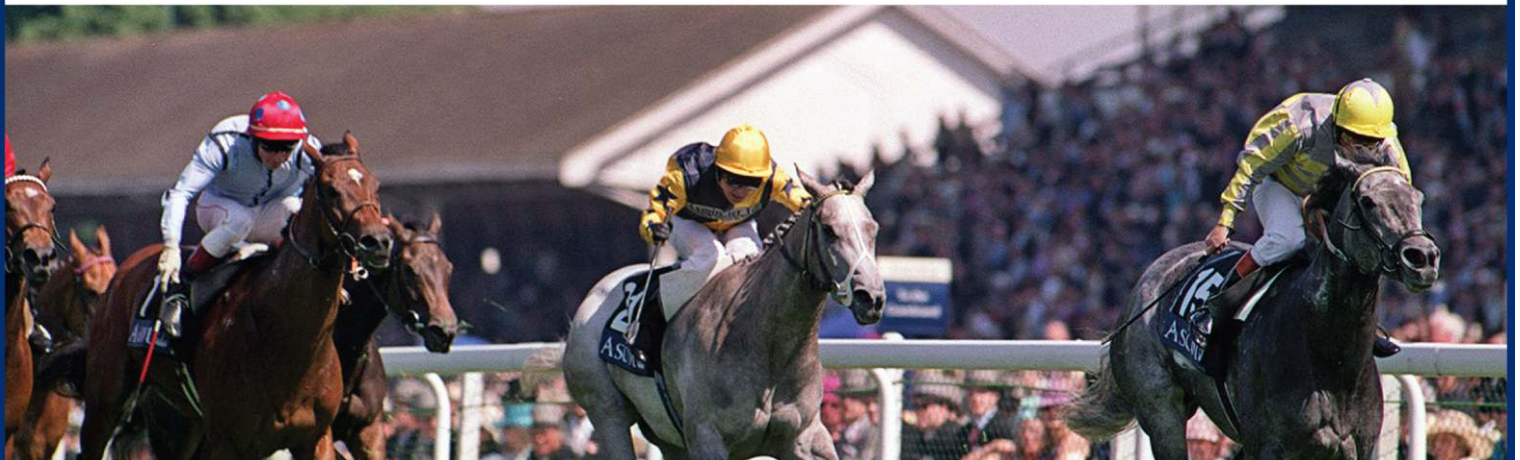
AUGUSTE RODIN's renowned ancestress Cassandra Go winning the 22-runner King's Stand Stakes at Royal Ascot