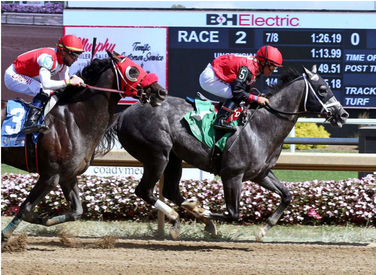
Touchdown Rocket | Coady Media