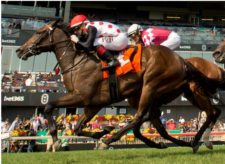
And One More Time