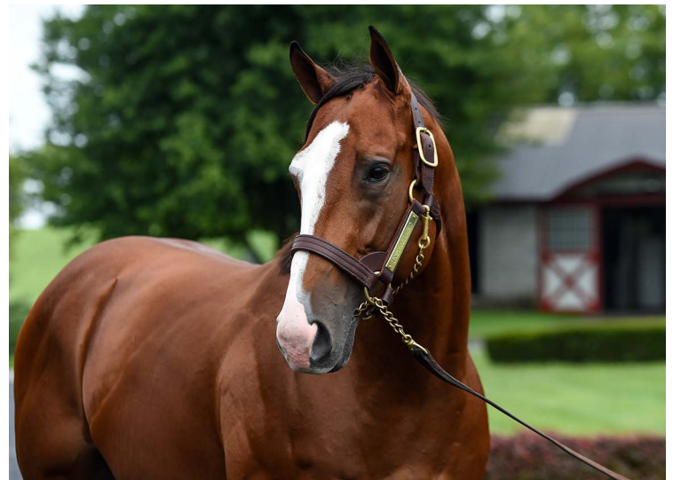
Instagrاند has a runner at Naas

104 foals of racing age/8 winners/0 black-type winners 4-NAAS, 8f, Shocker (Ire) 4,000gns Tattersalls October Yearling Sale (Book 3) 2023