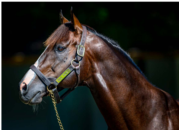
War Front

In terms of his synergy with Blame , there's a striking echo between the pair. For a start, both are out of Seeking the Gold mares. But Omaha Beach is additionally by Danzig's son War