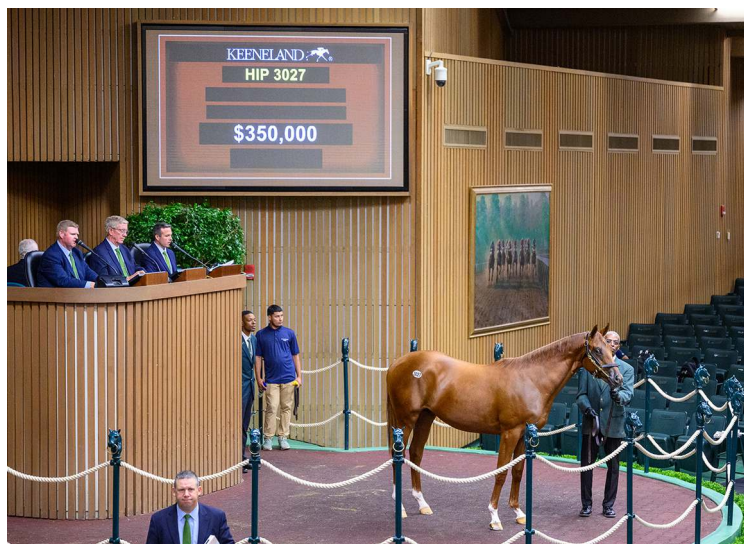
Wednesday’s topper, a colt by Not This Time