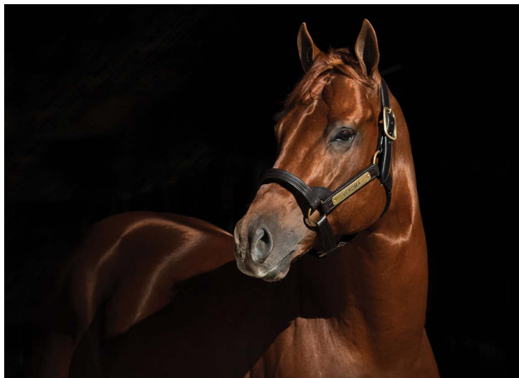
Vekoma

The son of Candy Ride (Arg) retired with a highly commercial profile, as a GI Met Mile/GI Carter Handicap winner, out of a single-turn Grade I scorer from the family of Street Sense and Mr. Greeley. His rather eccentric action did not discourage a staggering debut book of 222 mares, with another 408 through the revolving door across the next two seasons. Nor did the