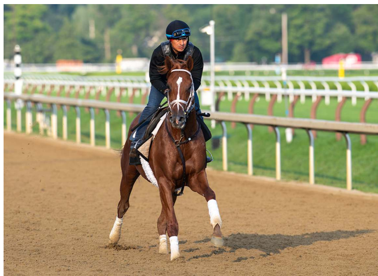
Locked pictured training earlier this summer at Saratoga

Locked has posted six workouts at Pletcher's Saratoga base, including a pair of four-furlong breezes in :50 (9/23) and :49.49 (19/71) over the Oklahoma training track Sept. 8 and Sept. 15, respectively.