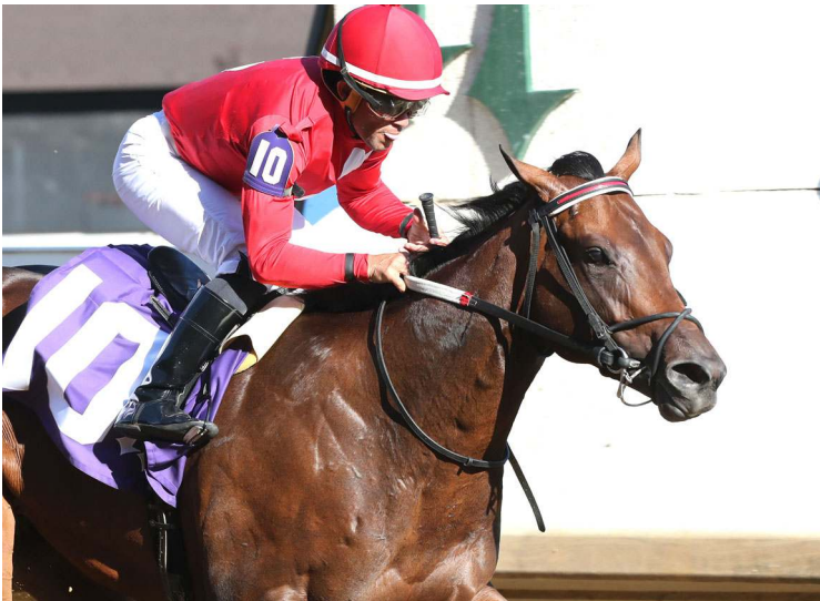
Jonathan's Way