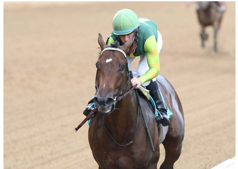
Optical | Coady Media

2nd-Horseshoe Indianapolis, $32,000, Msw, 9-18, 3yo/up, 1m, 1:39.47, ft, 1/2 length.