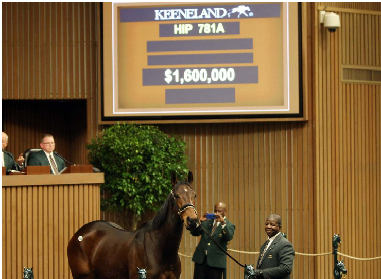
Mrs McDougal topped the 2018 Keeneland January Sale