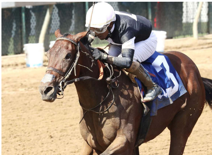
La Cara

As for Pocahontas winner La Cara ( Street Sense ), she traces to Golden Trail's second foal by Graustark, Java Moon. Herself winner of the GIII Comely Stakes, Java Moon has become celebrated as the link between Golden Trail and one of the most