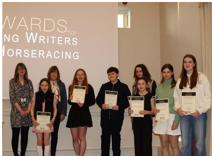
Last year's finalists at the Awards for Young Writers on Horseracing NHRM

The second year of the Awards for Young Writers on Horseracing, open to people aged between 11 and 25 living in the UK, was launched by the National Horseracing Museum (NHM) on Wednesday.