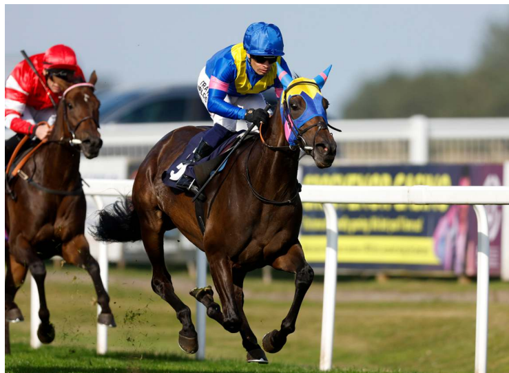
Sound Angela

Placed on five occasions at this level prior to Wednesday, Sound Angela offered the prospect that she had improved for wind surgery on her belated return in a York handicap last month and confirmed that impression with a black-type breakthrough. Buried in mid-pack early, she was delivered to overhaul the long-time leader High Spirited approaching the