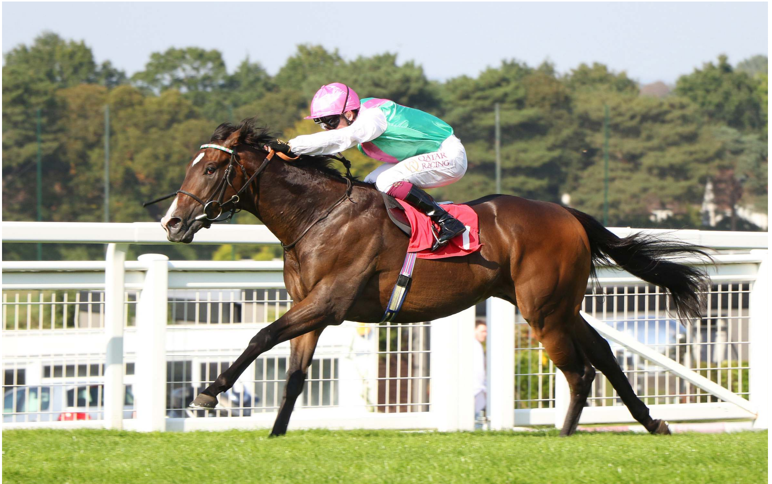
Cosmic Year is the 35th 'TDN Rising Star' for his sire