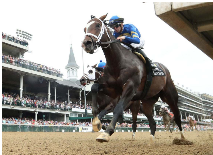
Zozos wins the Knicks Go Stakes