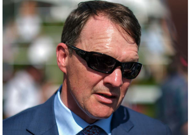
Aidan O'Brien