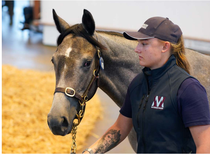
Lot 419 was the overall sale topper

Incidentally, the 140,000gns Elliott paid for the Havana Grey filly is the fourth highest price in the short history of the Somerville Yearling Sale. She is out of a half-sister to the G2 Sapphire Stakes winner Stepper Point (GB)