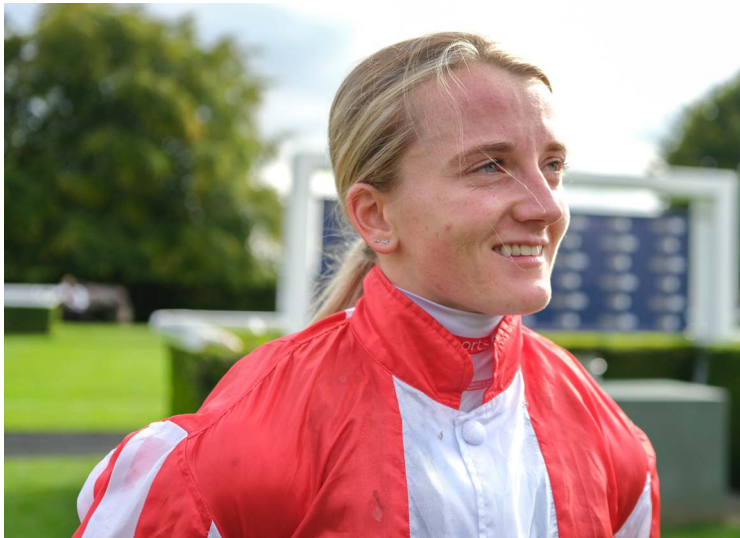
Hollie Doyle after riding her 1,000th winner