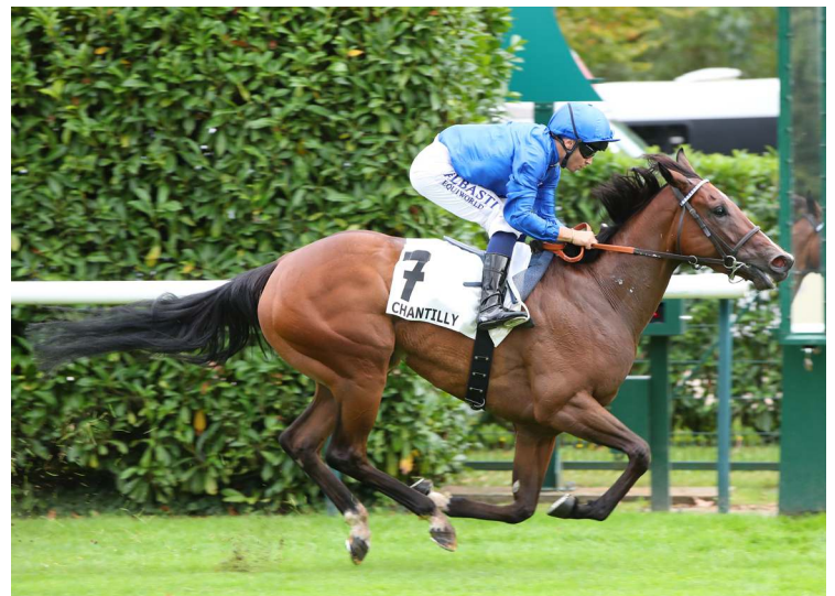
Spring Lantern | Scoop Dyga