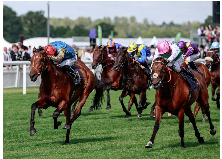
Haatem winning the Jersey Stakes