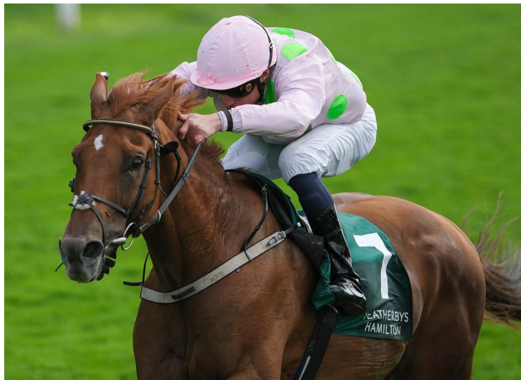
Vauban will return to Oz

Eighty of the 123 horses nominated for this year's G1 Lexus Melbourne Cup were bred in Europe. Only 18 of that group are still in training in either Britain, Ireland or France.