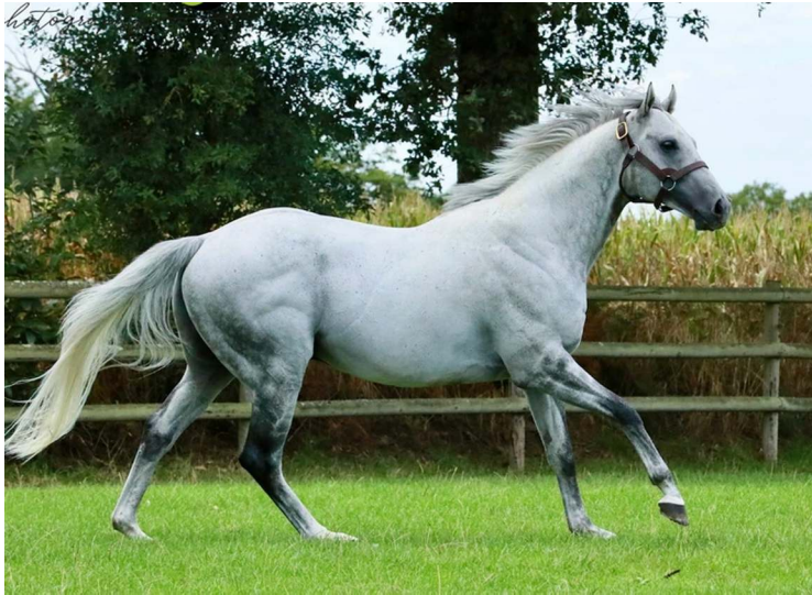
Yafta has a runner at Bath | Haras de la Haie Neuve

Yafta (GB) (Dark Angel {Ire}), Haras de la Haie Neuve 26 foals of racing age/2 winners/0 black-type winners 15:02-BATH, 5.75f, The Bear of Saints (Fr)