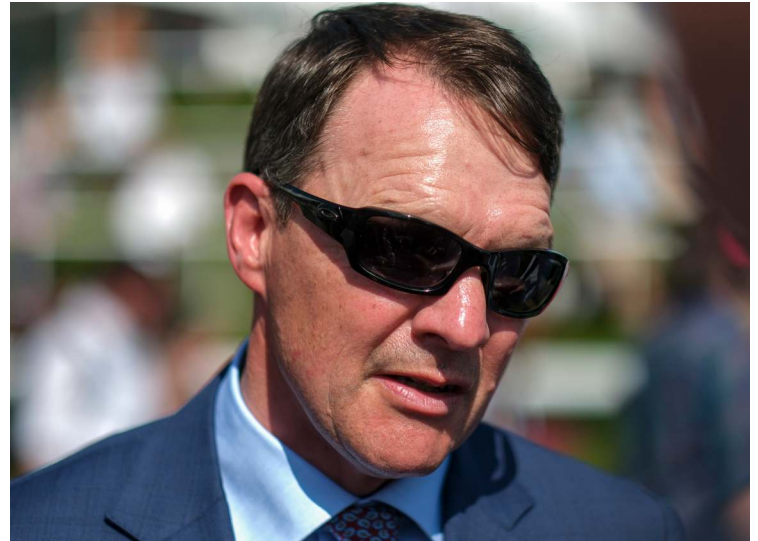
Aidan O'Brien