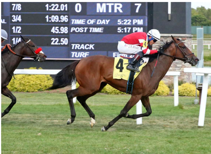
Classic Claire

Yoshida (Jpn) , Fact Not Fiction, g, 3, o/o Mother Nature, by Winslow Homer. ALW, 9-3, Thistledown