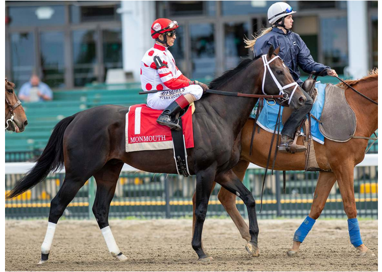
Mind Control

Goddess of Fire was second in the 2022 GII Rachel Alexandra Stakes and GII Gulfstream Park Oaks and finished third in that year's 2022 GI Alabama Stakes. She was sold to Bass Stables following an allowance win at Gulfstream in January and was bred to Annapolis this year.