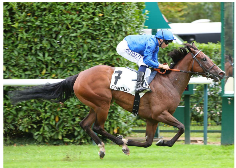
Spring Lantern