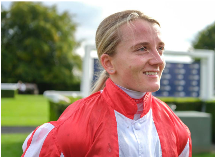
Hollie Doyle after riding her 1,000th winner