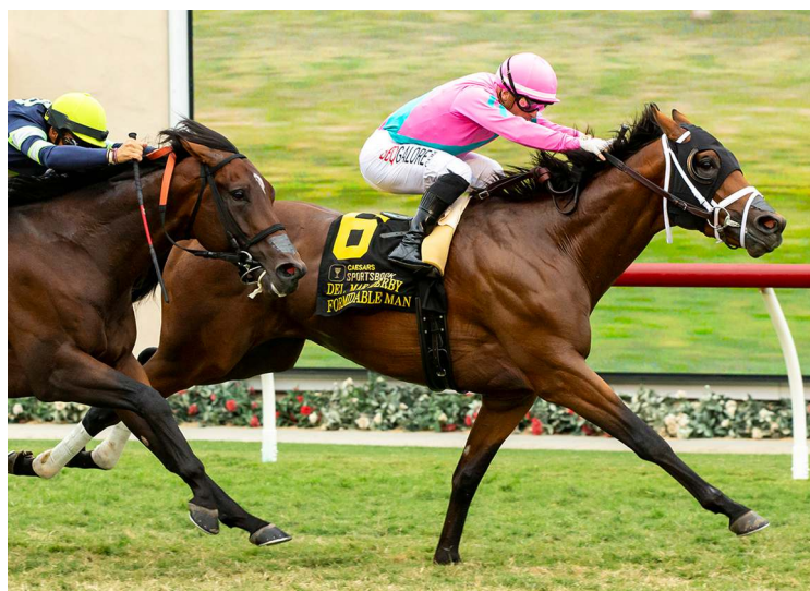
Formidable Man became the latest graded winner for Lane's End's City of Light in the Del Mar Derby

FOR THE WEEK ENDING SEPTEMBER 1, 2024 ACTIVE NORTH AMERICAN-BASED STALLIONS