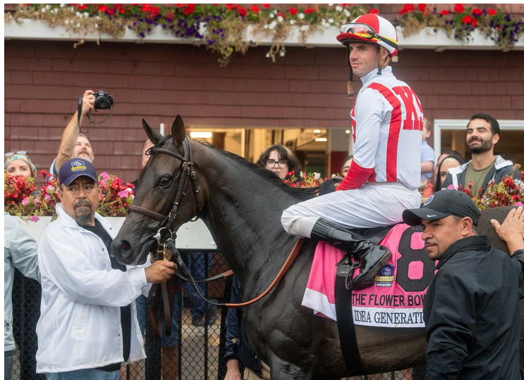
Idea Generation