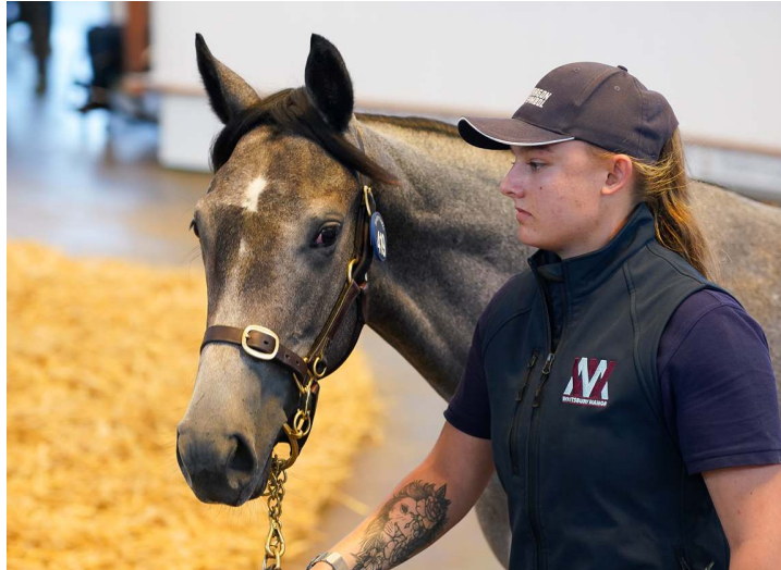
Lot 419 was the overall sale topper | Tattersalls

Incidentally, the 140,000gns Elliott paid for the Havana Grey filly is the fourth highest price in the short history of the Somerville Yearling Sale. She is out of a half-sister to the G2 Sapphire Stakes winner Stepper Point (GB)