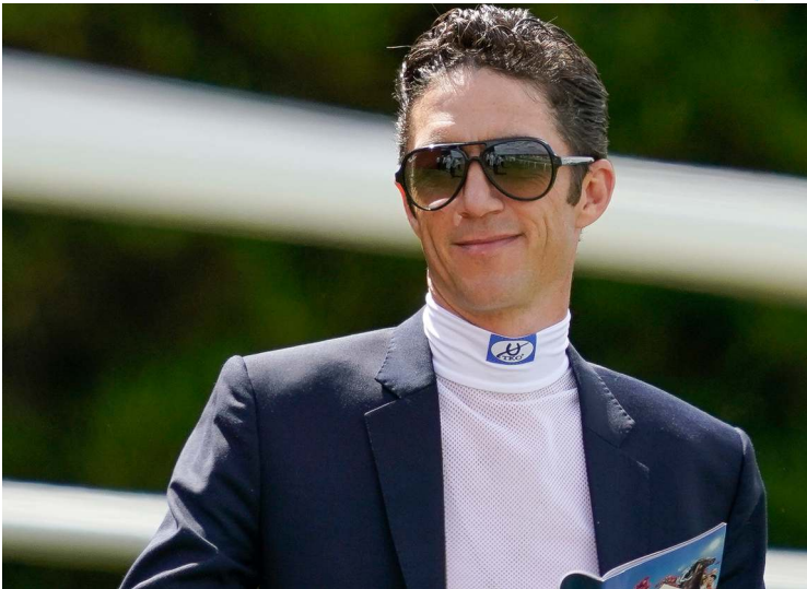
Christophe Soumillon is aiming for his third Prix Niel