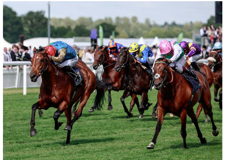
Haatem winning the Jersey Stakes