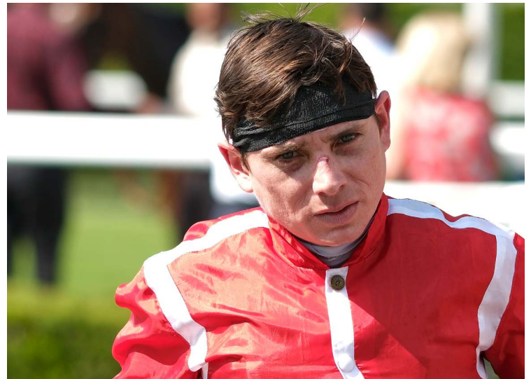
Callum Shepherd | Getty Images