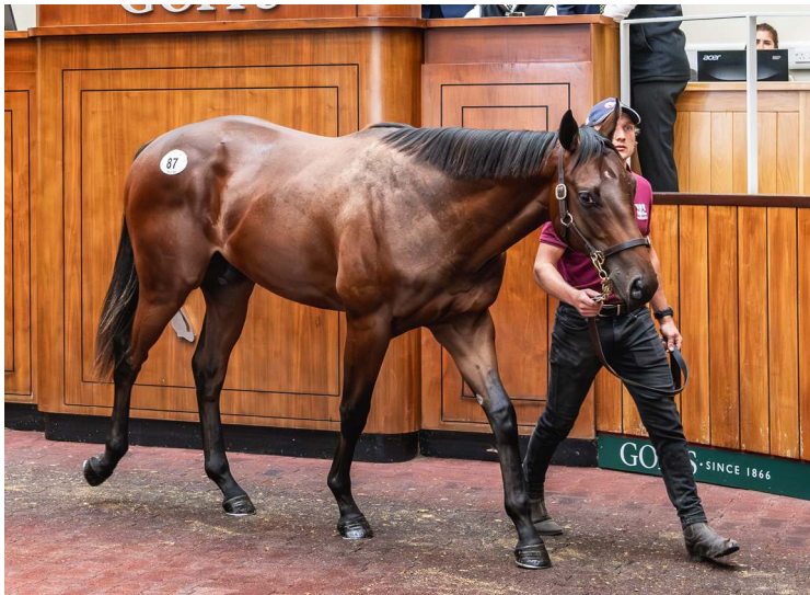
Sergei Prokofiev colt lot 87 | Goffs