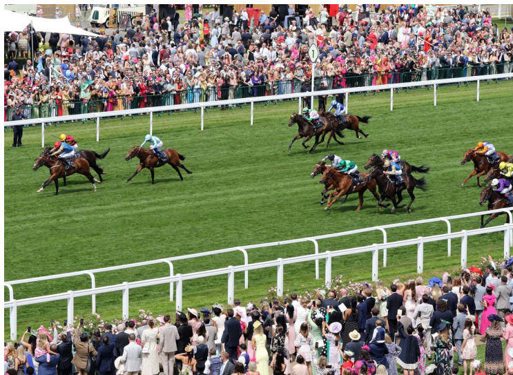
Shareholder wins the Norfolk at Royal Ascot

Recently, for instance, from one bought privately for just $17,000, they bred the top Canadian juvenile of last year, Carson's Run. (Not coincidentally, he's by Cupid--like Tapizar, a son of Tapit --while the mare, like Drumette, is by Henny Hughes.)