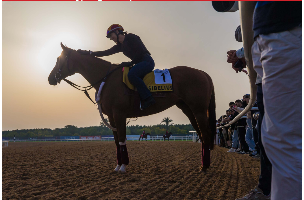
Group 1 winner Sibelius (Not This Time) (pictured here in Meydan this past March) has been retired from racing after suffering a tendon injury. Story on page 11.