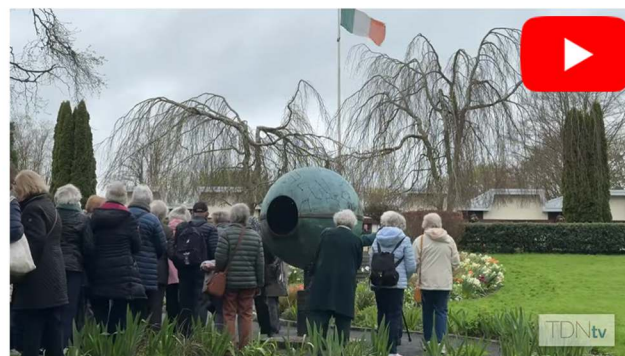
How the Irish National Stud Made Tourism a Major Source of Revenue