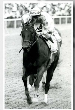
SAFELY KEPT Grade 2 Prioress, 1989 Champion Sprinter 1989