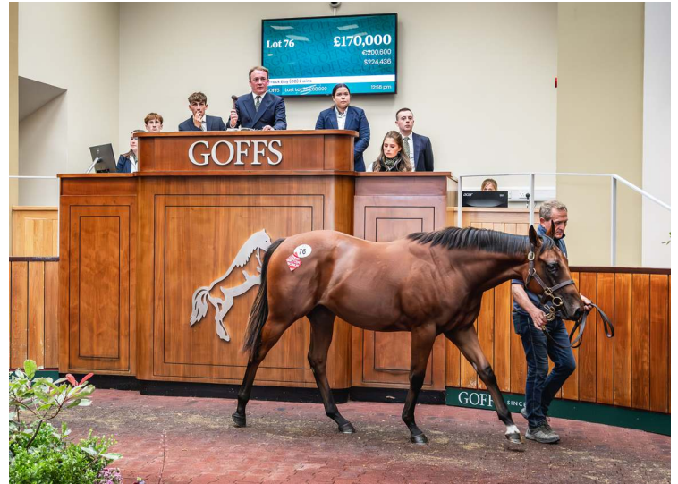
Lot 76 | Goffs

One of only two yearlings by Too Darn Hot (GB) in the catalogue, lot 76, continued the good work the young Darley stallion put in at the Arqana August Sale where three of his six yearlings made at least €200,000, with a colt out of the Poule d’Essai des Pouliches runner-up Irish Rookie (Ire) (Azamour {Ire}) leading the way at €520,000.