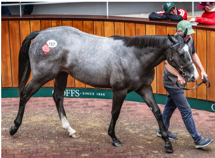
The session-topping filly

Whilst the Havana Grey filly was one of two yearlings to surpass the £200,000 paid for last year’s top lot, trade on day one was otherwise down on 12 months ago. Of the 243 yearlings offered--25 more than last year--200 sold at a clearance rate of 82%. The aggregate was down by 11% at £8,209,500, while the average dipped by 14% to £41,048 and the median by 11% to £31,000.