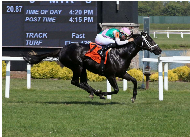
Alcove, by Twirling Candy