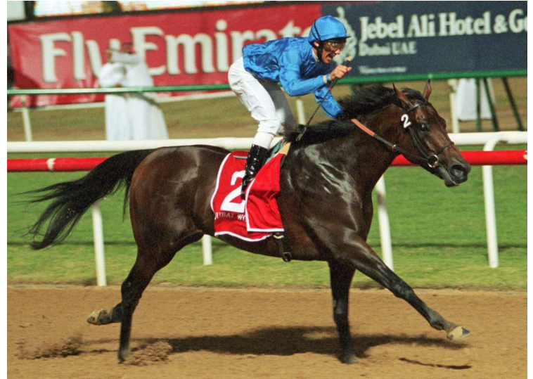
Dubai Millennium

Dubai Millennium (GB) (Seeking the Gold), arguably the greatest horse to ever carry the Godolphin silks, has won a hotly contested three-week public vote for which 'Turn of the Century' horse should be inducted to the QIPCO Hall of Fame. In so doing, he was chosen over Daylami (Ire), Giant's Causeway and Montjeu (Ire).