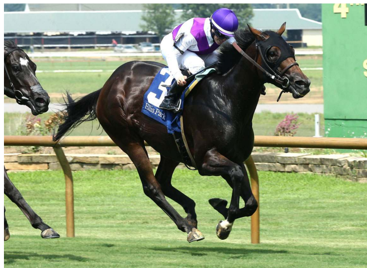
Awesome Treat