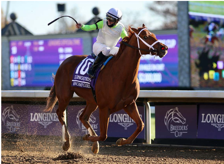
Monomoy Girl wins the 2020 Breeders' Cup Distaff

their compatriots in the "County Kentucky" diaspora.