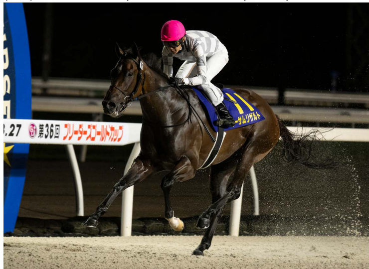
Awesome Result

Awesome Result is one of 17 Japanese winners for her sire and one of two black-type winners, joining Listed Oasis Stakes hero Yuttitham (Jpn) (--Zipessa, by City Zip). The unraced dam Blossomed has accounted for eight other winners and was purchased by Springhouse Farm for $425,000 in foal to Honor Code about two months after her daughter Sippican Harbor (Orb) caused a 16-1 upset in the 2018 GI Spinaway Stakes.