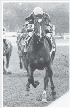
SMART ANGLE Grade 1 Spinaway, 1979 Champion 2YO Filly 1979