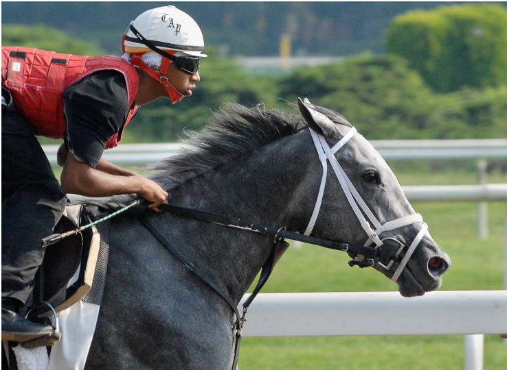
MGISW Octave at Belmont in 2007