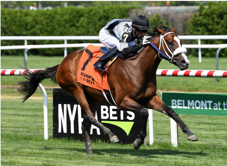
She's Our Tiz steps up for the P.G. Johnson S.

Some of the most highly anticipated races during the summer racing season are the 'baby' races during the boutique meetings at Saratoga and Del Mar and at Ellis Park, which attract its fair share of high-priced offspring from a variety of top national outfits. Summer Breezes highlights debuting and stakes-entered 2-year-olds at those meetings that have been sourced at the breeze-up sales earlier in the year, with links to their under-tack previews. Here are the horses entered for the final program of the season Wednesday at Saratoga: