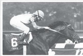
CIGAR Grade 1 Jockey Club Gold Cup, 1995 Horse of the Year 1995, 1996