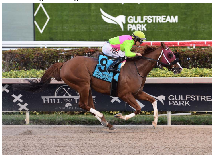
Sibelius