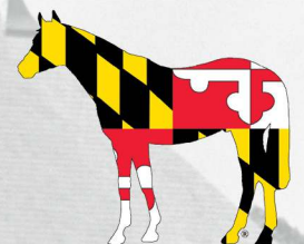
Maryland Horse. MarylandThoroughbred.com