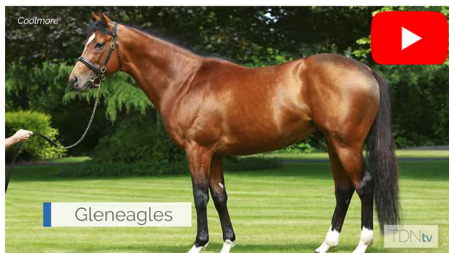
From the Derbys to July Cups Versatile Gleneagles Reigns