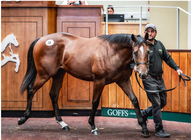
Lot 28 | Goffs