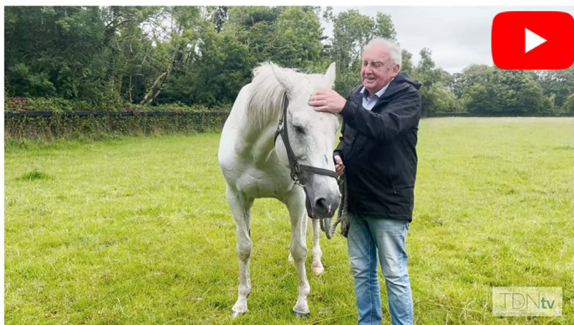
The Ever Growing Influence of Dark Angel