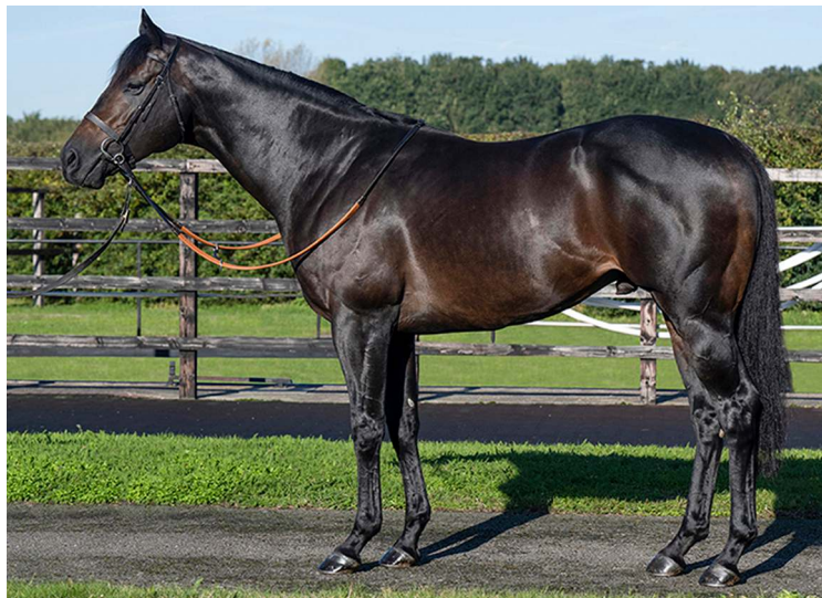
A'Ali | Newsells Park Stud