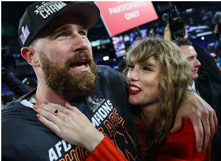
Travis Kelce and Taylor Swift