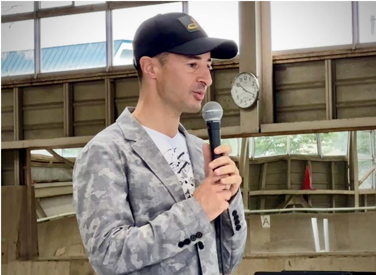
Christophe Lemaire addresses the IFAR conference