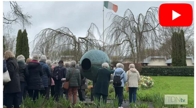
How the Irish National Stud Made Tourism a Major Source of Revenue