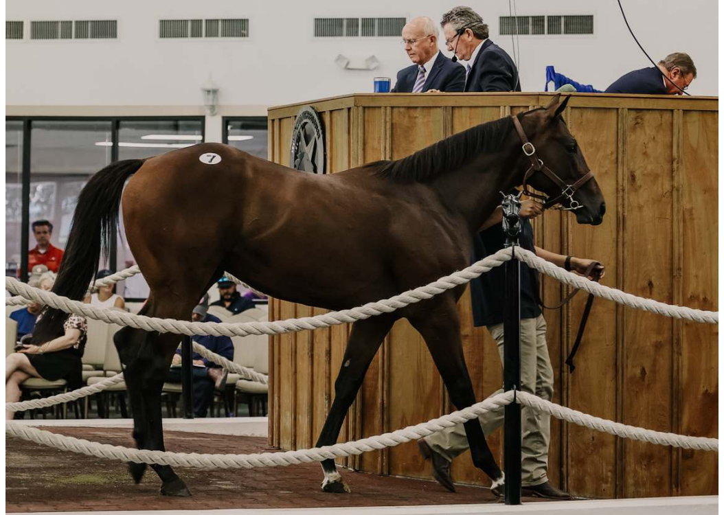
A yearling colt by El Deal brings top price of $150,000 at Monday's Texas Thoroughbred Association Summer Yearling Sale at Lone Star Park. See p7 for coverage