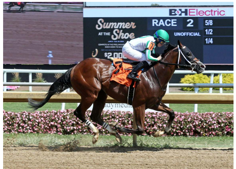
Sweet Mo B

Can't Wait to Get Your TDN Breaking News and Race Results?