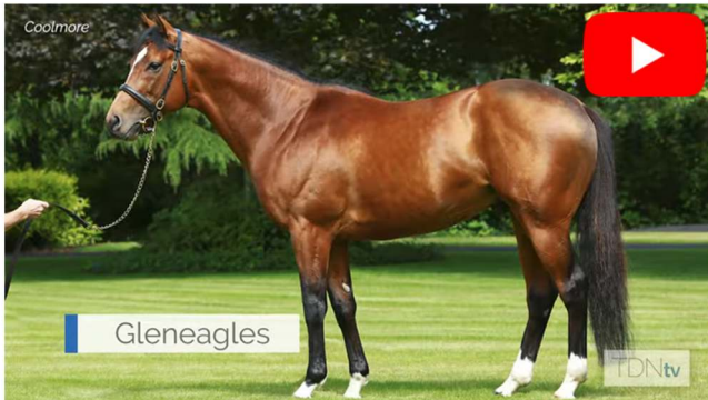
From the Derbys to July Cups Versatile Gleneagles Reigns