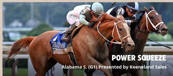
POWER SQUEEZE Alabama S. (G1) Presented by Keeneland Sales