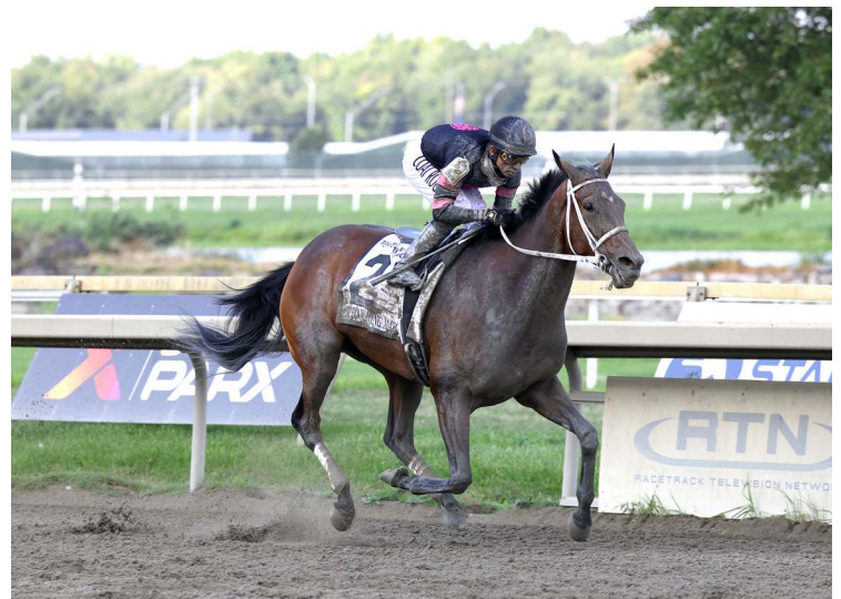
Central Banker's Morning Matcha wins at Parx