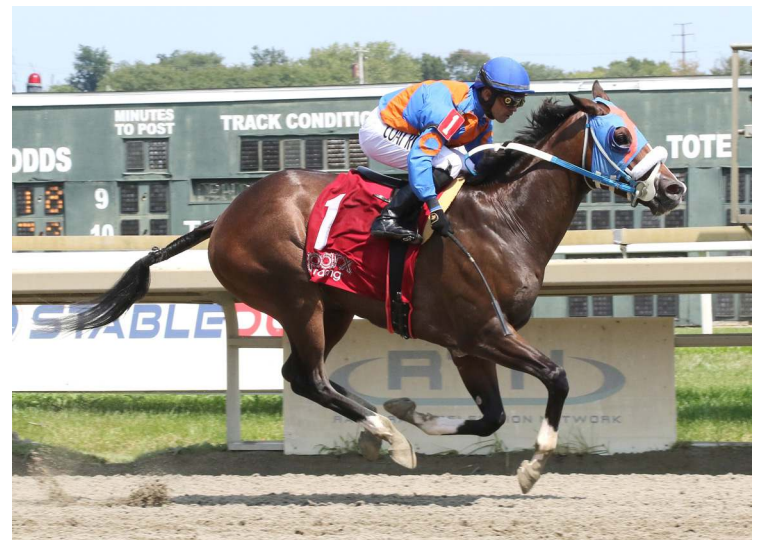
Buccherino became the newest stakes winner for Buccheri in the DeBunda Sprint, a prep for the GII Gallant Bob S.