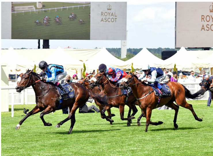
Asfoora

"I know she had a very busy preparation and I just don't see the upside in continuing with it. I'm happy to look after her in the knowledge she is going to race on next year, so there is no point bottoming her out now.