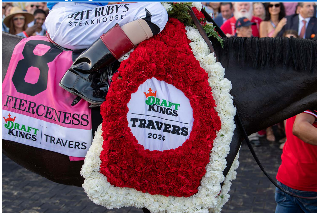
Mike Repole's Fierceness (City of Light) won Saturday's GI Travers Stakes at Saratoga under a brilliant ride by John Velazquez.