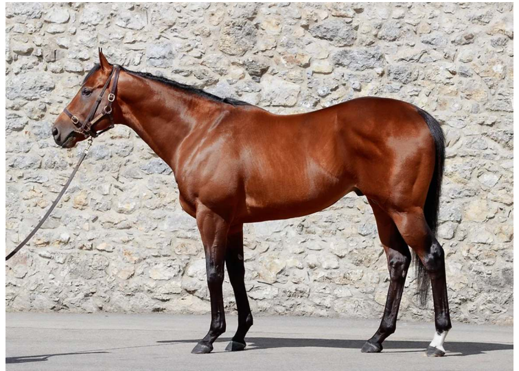
Starman