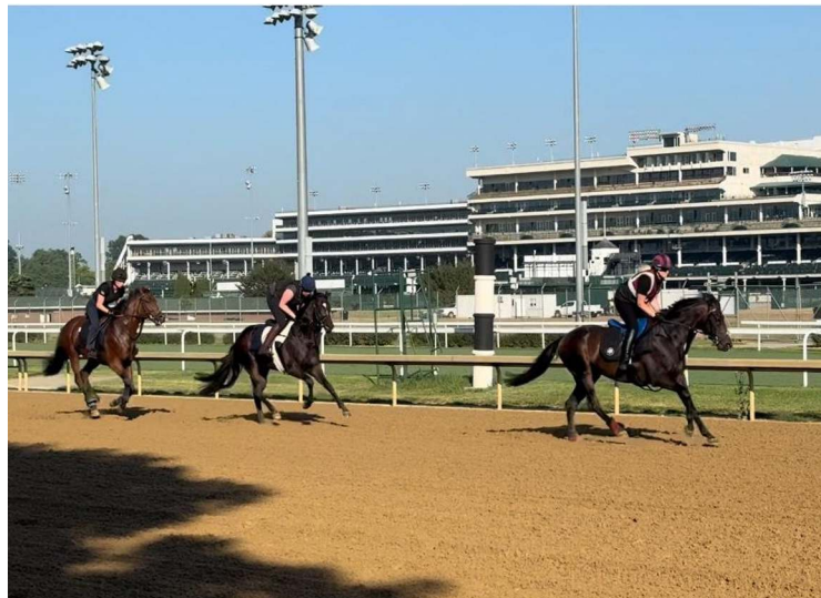
Black Forza, Bellum Justum and Stromberg get their first look at Churchill Downs Monday

As a Kentucky-bred, Black Forza runs for the Juvenile Sprint’s entire $1-million pot.