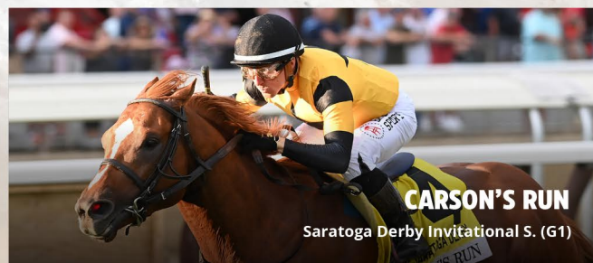
CARSON'S RUN Saratoga Derby Invitational S. (G1)