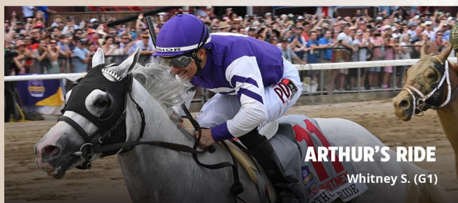
ARTHUR'S RIDE Whitney S. (G1)

Keeneland Sales is proud to celebrate alumni that have excelled at the highest level of competition this summer at Saratoga. We congratulate the connections of these incredible athletes and look forward to their future success!