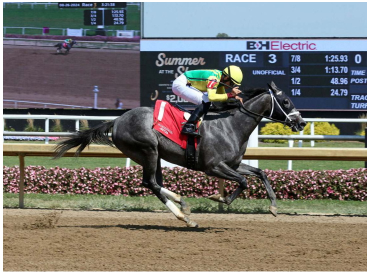
Musical Note

Uncle Lino , Uncle Winchester, g, 3, o/o Sunup, by Smart Strike. MSW, 8-26, Parx Racing