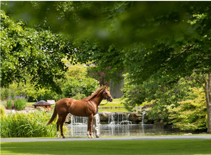
Night Of Thunder | Marc Ruehl

This week Lot 459, offered by Gillon Bloodstock, will be a unique commodity as the only yearling by the five-time Group 1 winner in the sale, a colt out of the Listed-placed mare Mighty Spirit (GB) (Acclamation {GB}).