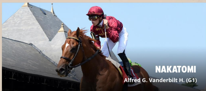
NAKATOMI Alfred G. Vanderbilt H. (G1)