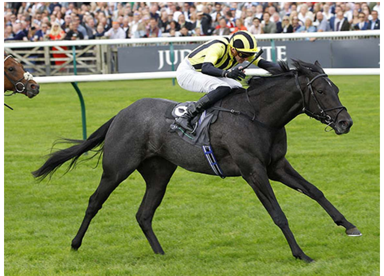
Vandeek | Tattersalls