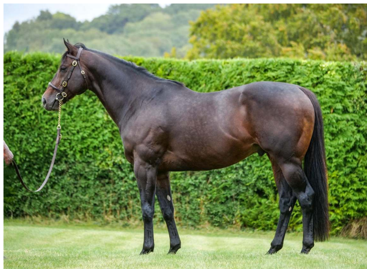
Sergei Prokofiev | Whitsbury Manor Stud

Sergei Prokofiev (Scat Daddy), Whitsbury Manor Stud 121 foals of racing age/15 winners/2 black-type winners 4-BELLEWSTOWN, 5f, Therussiancomposer (GB) 10,500gns Tattersalls December Foal Sale 2022; €10,000 RNA Goffs Orby Yearling Sale (Book 2) 2023