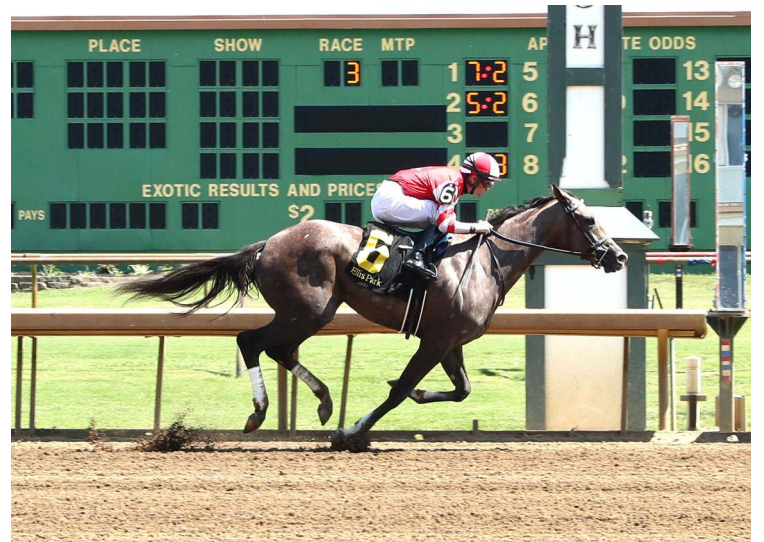
Jeweled Destiny

4th-Fort Erie, C$17,037, Msw, 8-26, 3yo/up, f/m, 1mT, 1:39.22, fm, 9 1/2 lengths.