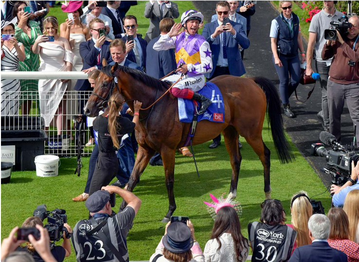
Kinross won the City of York in the last two seasons