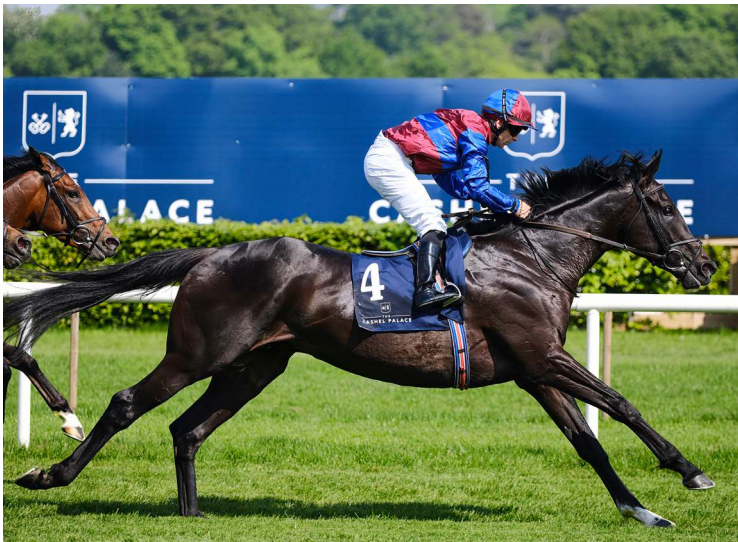
Los Angeles

“I thought he ran well and more than anything it gave us confidence that 12 furlongs would be within his compass because he was deeply relaxed, lobbing along in front when the others were keen,” he added. “It will be interesting how we get on as we are going in potentially against some stayers and he’s the one coming up in trip. He might be the one with the speed and they will want to go a nice tempo, which he likes.”