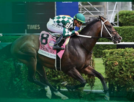
Cogburn, winner of the Jaipur S. (G1) was bred by Bellary Bloodstock