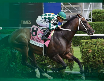
Cogburn, winner of the Jaipur S. (G1) was bred by Bellary Bloodstock