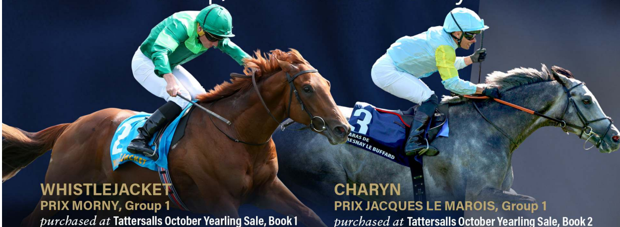
WHISTLEJACKET PRIX MORNY, Group 1 purchased at Tattersalls October Yearling Sale, Book 1

Tattersalls October Yearlings won SEVEN Group/Listed races in 8 days in Deauville