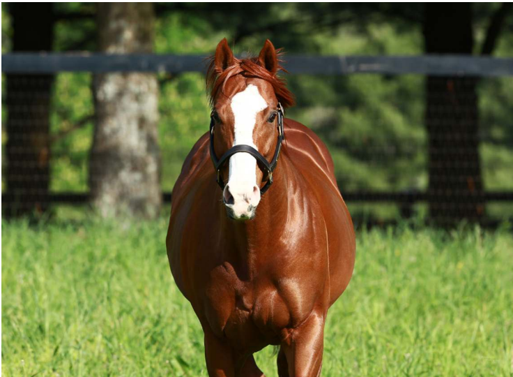
Munnings

Some of the most highly anticipated races during the summer racing season are the 'baby' races during the boutique meetings at Saratoga and Del Mar and at Ellis Park, which attract its fair share of high-priced offspring from a variety of top national outfits. Summer Breezes highlights debuting and stakes-entered 2-year-olds at those meetings that have been sourced at the breeze-up sales earlier in the year, with links to their under-tack previews. Here are the horses entered for Wednesday at Saratoga: