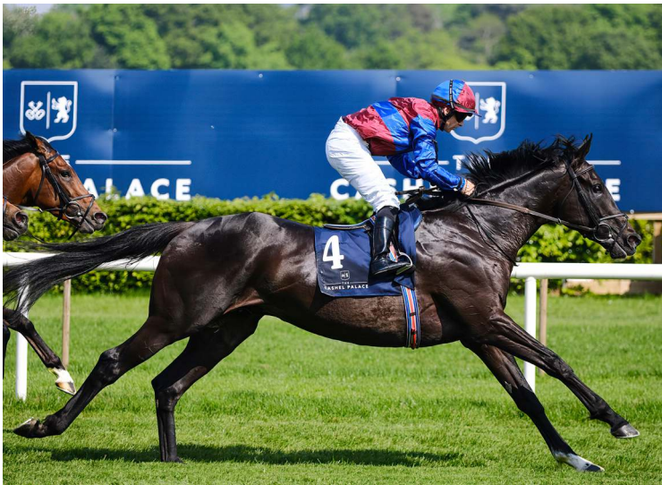
Los Angeles

“I thought he ran well and more than anything it gave us confidence that 12 furlongs would be within his compass because he was deeply relaxed, lobbing along in front when the others were keen,” he added. “It will be interesting how we get on as we are going in potentially against some stayers and he’s the one coming up in trip. He might be the one with the speed and they will want to go a nice tempo, which he likes.”