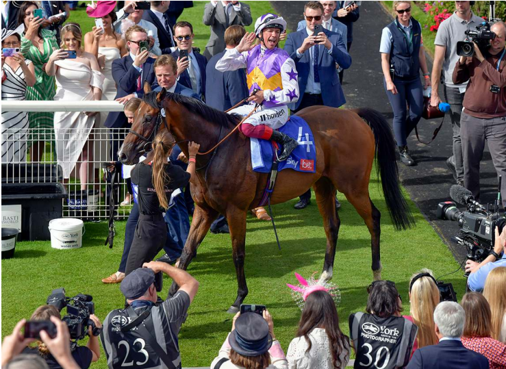
Kinross won the City of York in the last two seasons