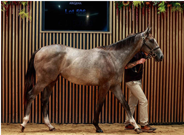
The V2 Sale top lot by Starspangledbanner at Arqana