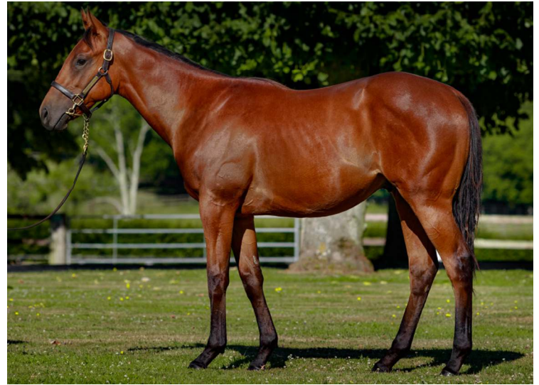
Silver Peak as a yearling

Repole Stable's 280,000gns Craven Breeze-Up acquisition Benny The Waiter (Ire) (Blue Point {Ire}) , a half-brother to this term's G2 King Edward VII Stakes runner-up and Wednesday's G2 Great Voltigeur Stakes nominee Space Legend (Ire) ( Sea The Stars {Ire} ), was without cover throughout this heavy-ground debut and ran on in the closing stages to finish sixth.