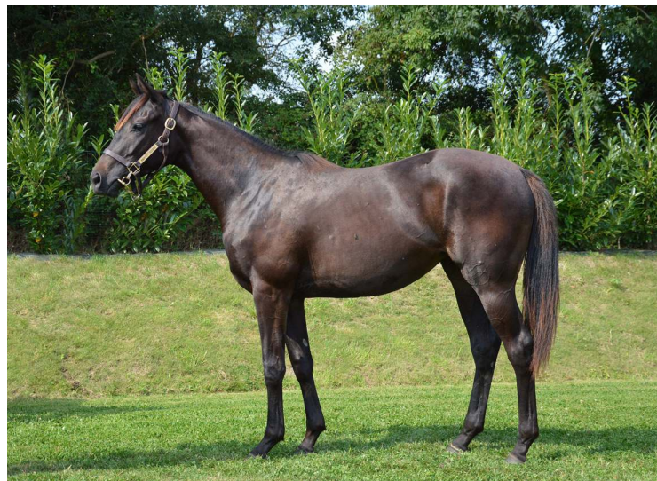
Lot 443, a filly by Armor