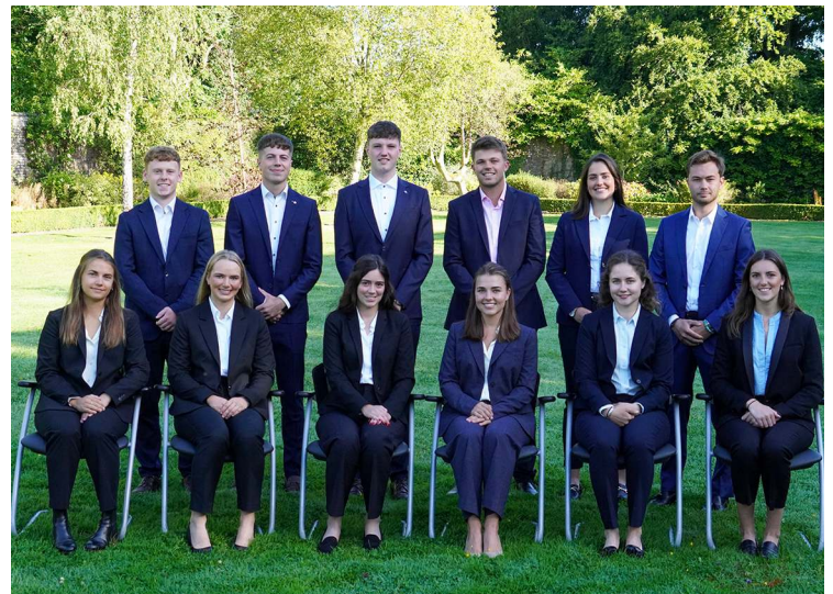
Godolphin Flying Start 2024-26 trainees

The newest intake of Godolphin Flying Start trainees have begun their two-year training programme at Sheikh Mohammed's Kildangan Stud in Ireland. The class of 2024-2026 consists of trainees from America, Britain, France, Ireland and the Czech Republic they will undergo training across the racing and bloodstock industry in Australia, America, Dubai and the UK.