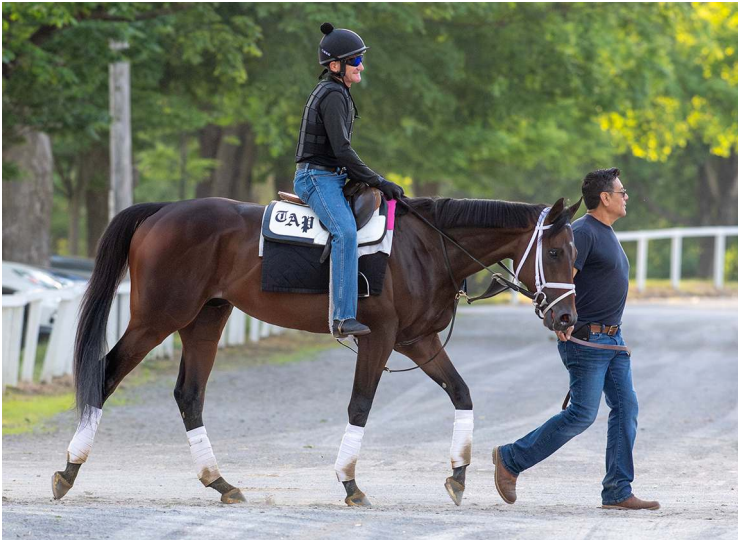
Fierceness