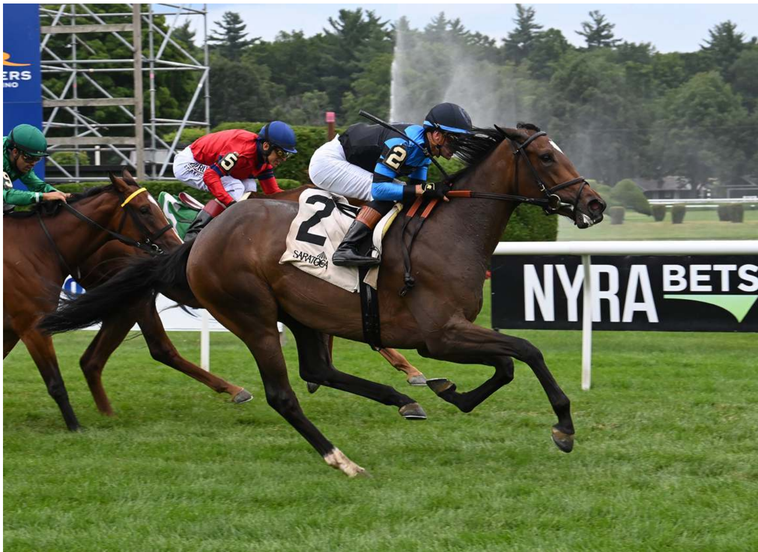
Virgin Colada