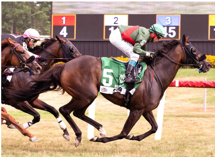
Sparkle Blue