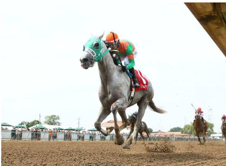
Here Mi Song

Here Mi Song, winner of last year's GIII Commonwealth Stakes, bound home an easy winner of his second straight renewal of the Jeff Hall Memorial Stakes Sunday at Ellis Park. The gray gelding was well held while stalking a moderate pace in a compact field down the backstretch. He pulled his way to the lead along the rail midway on the turn and skipped clear down the lane.