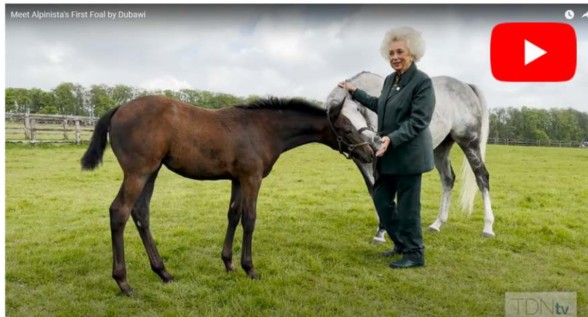
Meet Alpinista's First Foal by Dubawi