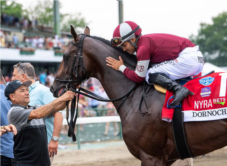
Dornoch