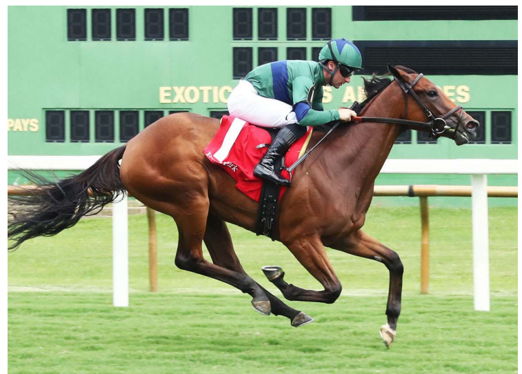
Sashay Away

1st-Laurel, $48,710, Msw, 7-21, 3, 4, /5yo, f/m, 7f, 1:26.03, ft, 6 1/4 lengths.