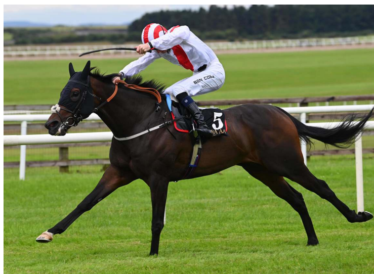
Royal Dress