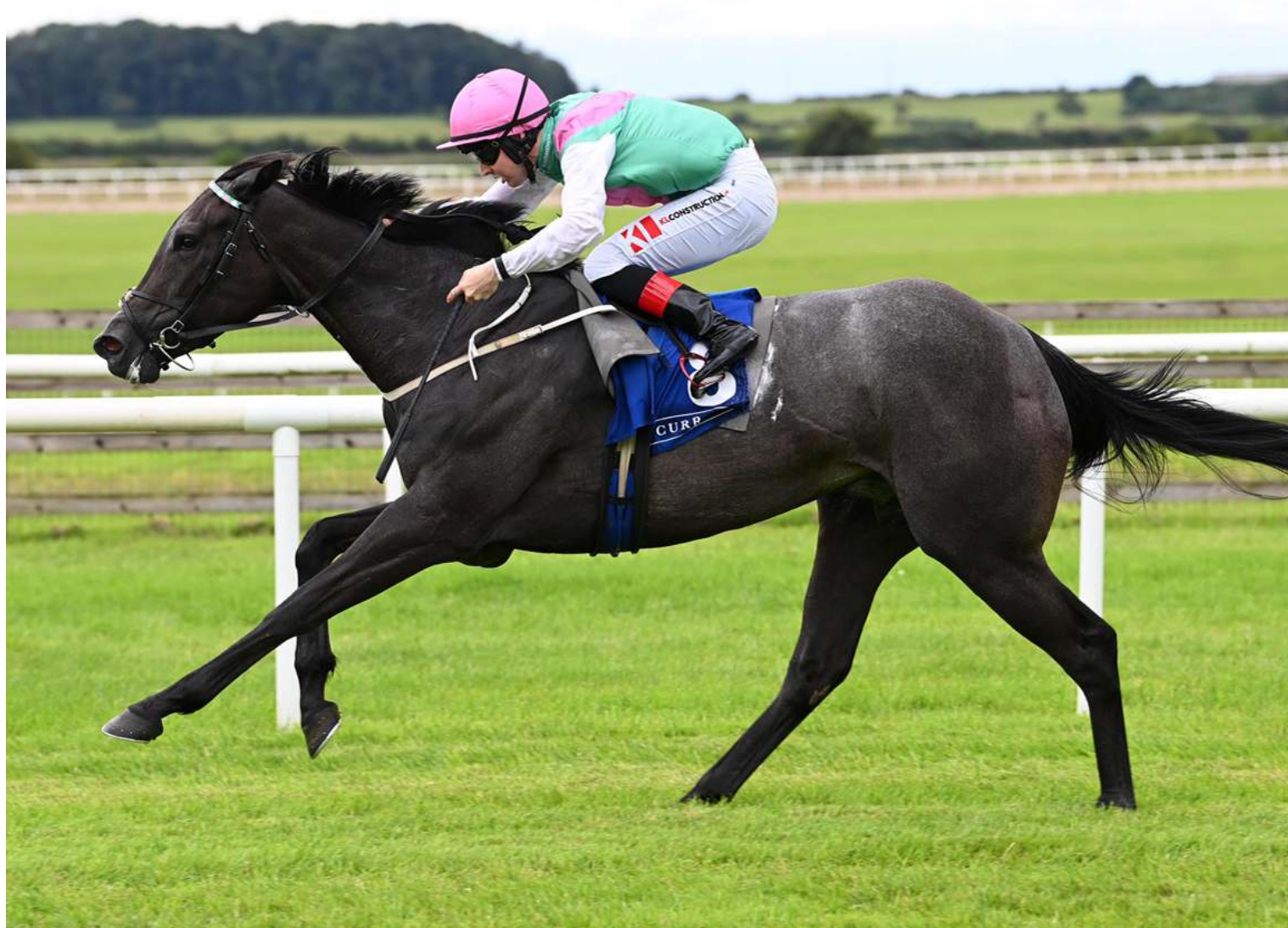
Red Letter opens her account with a stylish performance at the Curragh