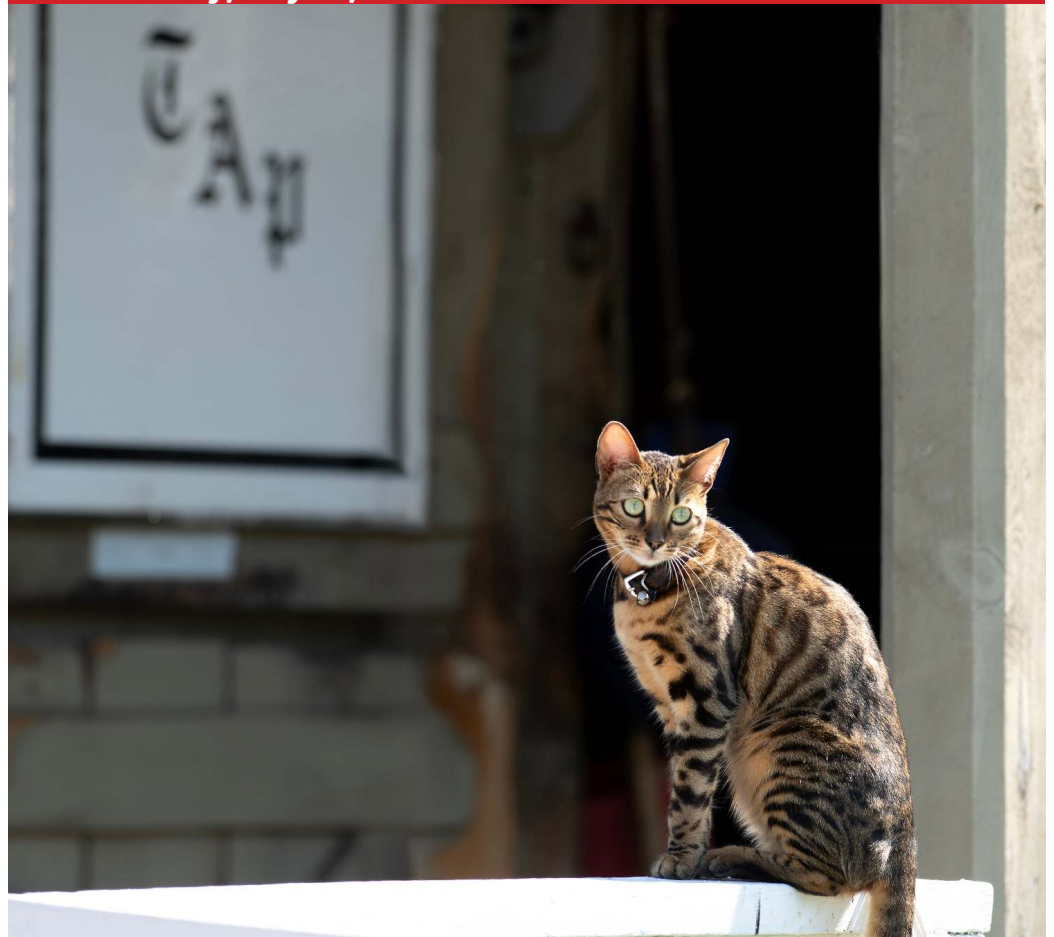
Mia the cat keeps an eye on things at Todd Pletcher's barn in Saratoga.