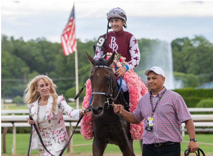
Thorpedo Anna

“That’s fine,” he said. “She would be talked about in terms of Genuine Risk and Ruffian and Winning Colors ... Rachel (Alexandra) and Zenyatta,” he said. “That is rare air that we are flirting with. Maybe she needs a challenge; she really hasn’t had one.”