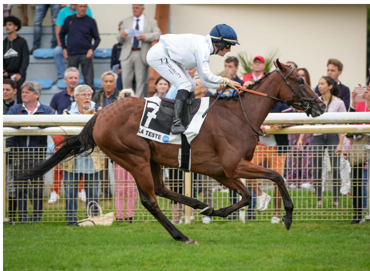
Pembay Bay

Also Ran: Obsess (Fr), Teeran (Ire), Spirituale (Fr), Beau Linge (Ire), Sans Voix (GB), Love Rush (Ire), Maywe (Ire), Eclair La Vie (Fr), Zuna (Fr), Zvalikova (Fr), Harmony Grey (Fr). Scratched: Otherwordly (Fr). Video, sponsored by FanDuel TV.