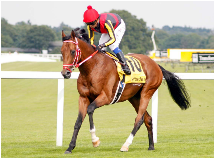
Deep Brillante

Okay, well one of the first things I saw an opportunity to make money on was pinhooking here in Japan. So buying foals or yearlings in Japan and bringing them back and selling them in Europe or the USA. We had some astounding profits and some shocking losses doing that. But it was 25 or 30 years ago now when I tried to buy my first horse in Japan and, at that time, you didn't have to register to buy a horse but you did have to bring a deposit. That deposit was roughly $25,000 in cash. Now, there was a lovely filly at this particular sale and I can remember