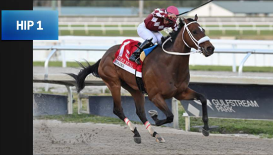
HADES Won 2024 Holy Bull S. (G3) & 2nd in Dwyer S. (G3) on 7/6