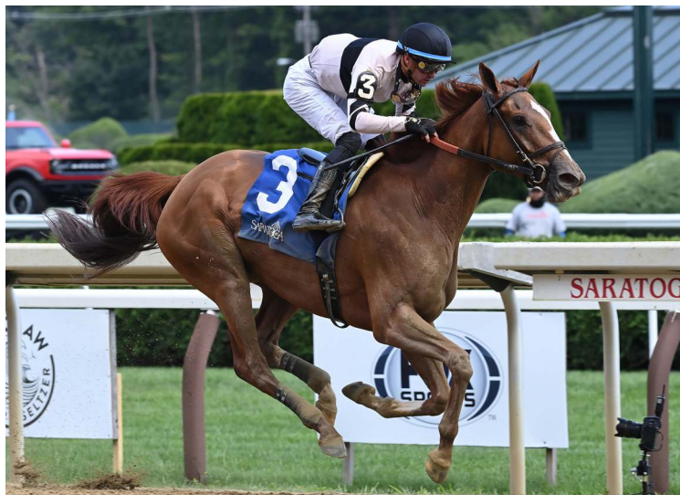
Raging Sea