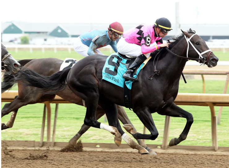
Most Wanted