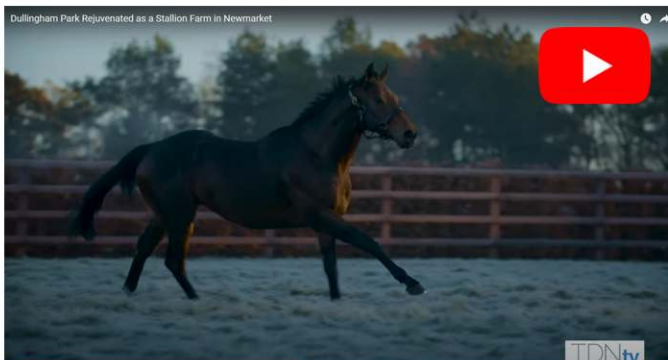
Dullingham Park Rejuvenated as a Stallion Farm in Newmarket