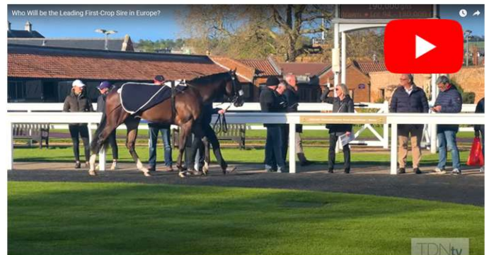
Who Will be the Leading First-Crop Sire in Europe?