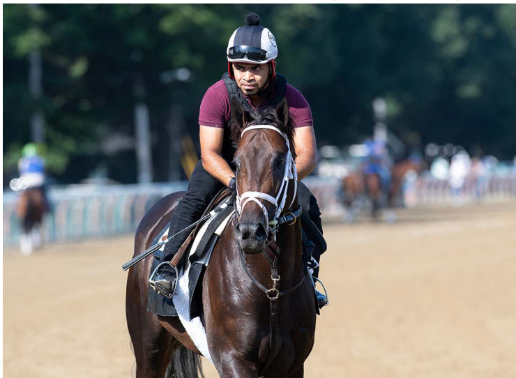
Mindframe

Yet the betting public still believed Dornoch had more to prove in the Haskell, emphatically backing Mindframe to odds-on favoritism while installing 'TDN Rising Star' Timberlake (Into Mischief) as the second choice off a nearly four-month layoff.