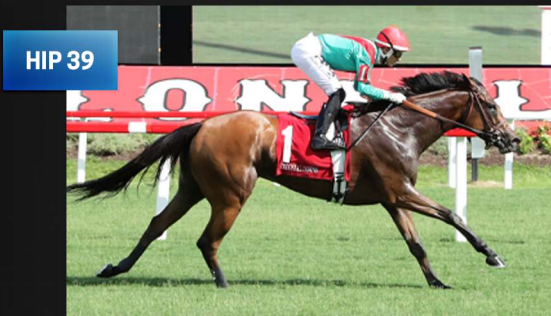
NADETTE (FR) GSW won Beverly D. Preview S. on 7/13