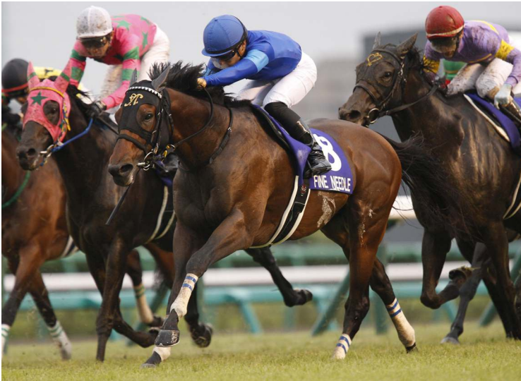
Fine Needle