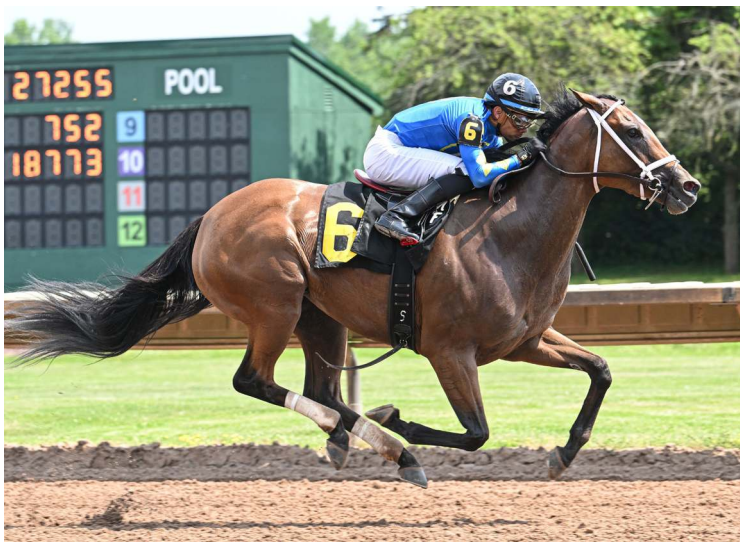
Caldwell Luvs Gold

Produced by a half-sister to MSW & GISP Quindici Man (Came Home) and MGSP Spurrier (Dixieland Band), Caldwell Luvs Gold has a 2-year-old half-sister named Saratoga Snow in training at Monmouth Park, a yearling Cupid half-brother and a foal half-brother by Mind Control . This is the extended family of GI Met Mile winner Wild Rush (Wild Again). Click for the Equibase.com chart.