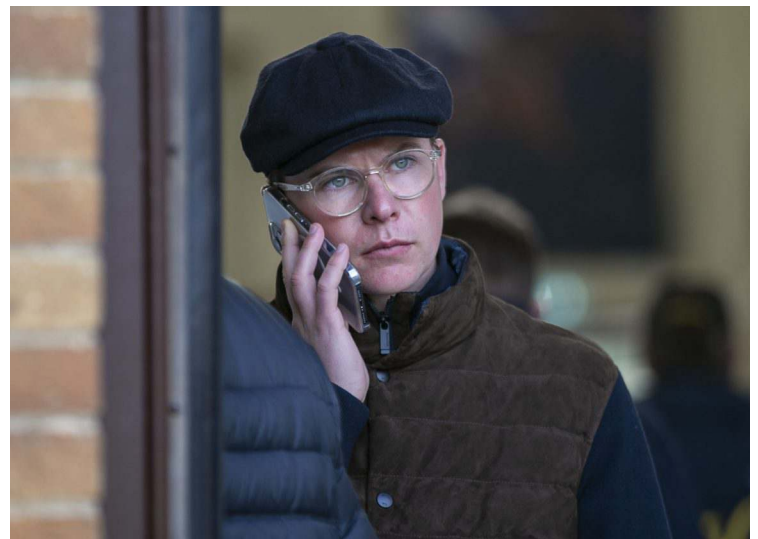
Joseph O'Brien, trainer of Galen