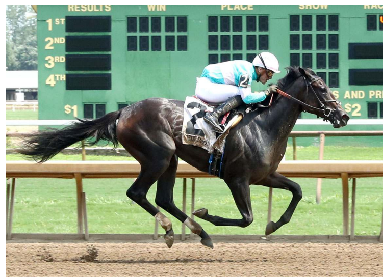
American Women was one of two back-to-back winners for Constitution at Ellis Park Monday