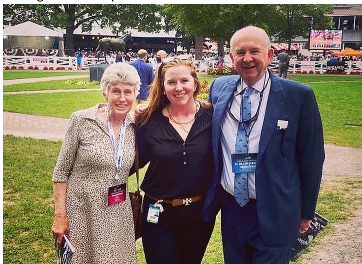
Campion Family

"Because he was the American Quarter Horse with a bit of stretch. Nothing like that in Ireland, where we were used to looking at Great Nephew and Habitat."