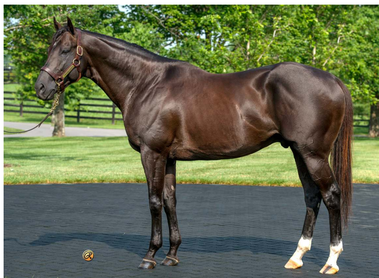
Take Charge Indy was represented by his 18th stakes winner when Tougherthantherest won the Irish Day S.

FOR THE WEEK ENDING JULY 14, 2024 ACTIVE NORTH AMERICAN-BASED STALLIONS