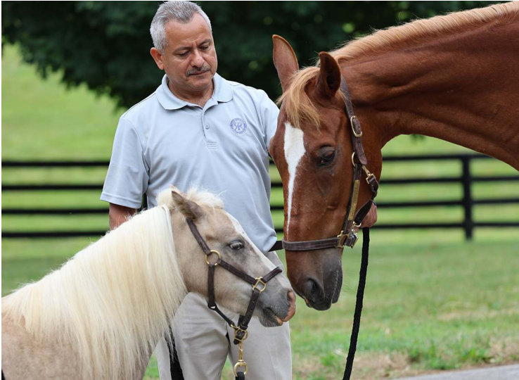
Fellow Resolute rescues Dexter and Turkey Tom are inseparable friends

"No one answer solves all the problems," he said. "But you can't just say the problems are too big, I can't do anything about it because I can't solve the whole problem. Right? That's impossible for me, too. But what I can do is solve the problem as it relates to me as an owner and a breeder."