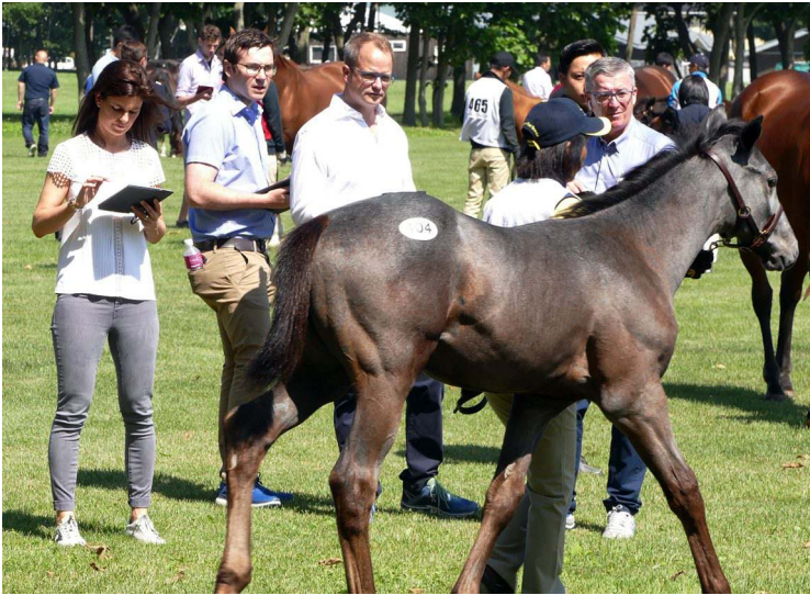
The Coolmore team viewing foals in Japan back in 2019 | Emma Berry