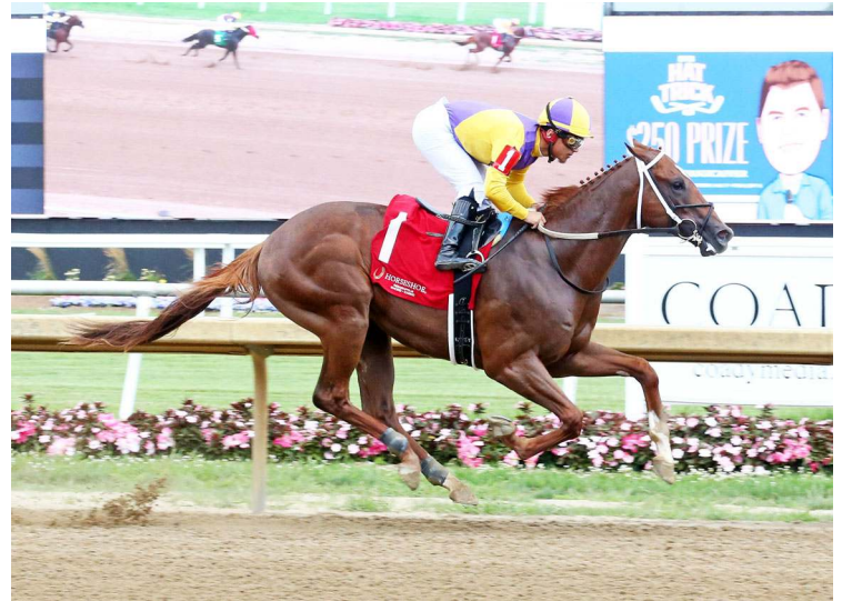
Maybe Eye'll Call | Coady Media