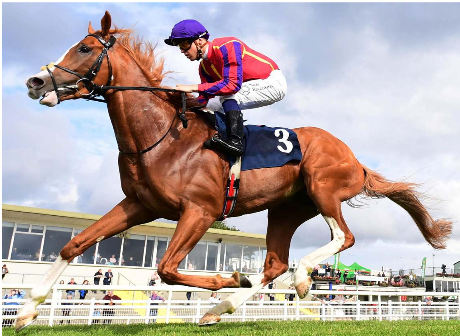
Galen is clear of his rivals at Killarney

http://www.thoroughbreddailynews.com/getLatest.php to download the latest edition of the TDN each day.