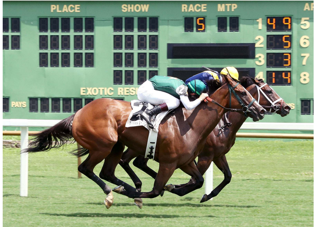
Ellen Jay ( Constitution) (inside) became the first winner for her two-time Eclipse Award-winning dam Covfefe ( Into Mischief) while making her turf debut at Ellis Park Monday. See the regional report for the complete result.