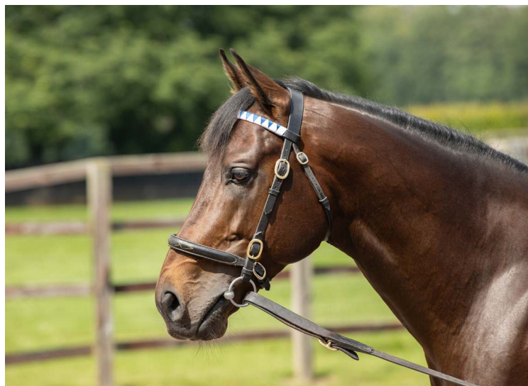
Pinatubo | Darley

Rumble Inthejungle (Ire) (Bungle Inthejungle {GB}), Norman Court Stud 23 foals of racing age/1 winner/0 black-type winners 15:00-BEVERLEY, 7.5f, Boro Queen (GB) €9,000gns RNA Tattersalls December Foal Sale 2022