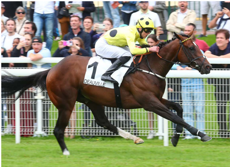
Elite Status

A Group 3 winner as a juvenile, Elite Status has been on the sidelines since making the perfect start to his three-year-old campaign with victory in the Listed Carnarvon Stakes at the Berkshire track, with a persistent issue with a joint forcing him to miss the G1 Commonwealth Cup at Royal Ascot.