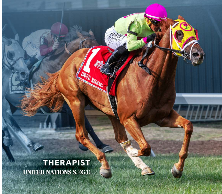
THERAPIST UNITED NATIONS S. (G1)

SUNDAY, AUGUST 11 • 7 PM MONDAY, AUGUST 12 • 12 PM SARATOGA SPRINGS, NY