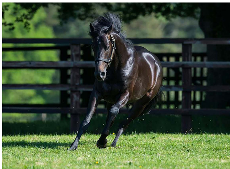
Harzand | Aga Khan Studs

Margins: 2HF, 1HF, HD. Odds: 0.60, 6.90, 14.00.