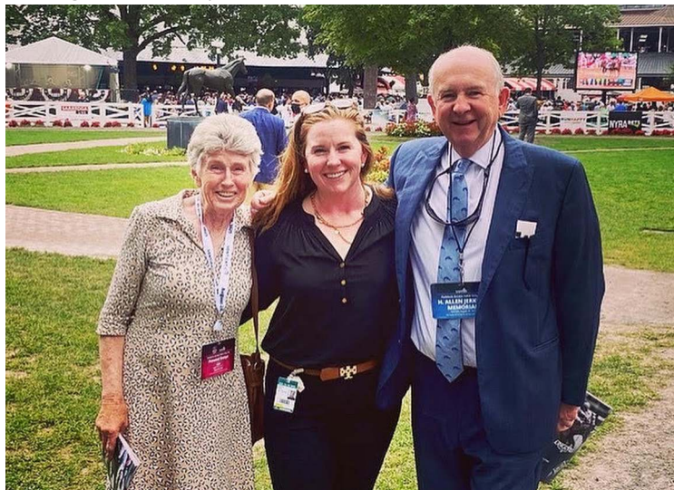
Campion Family

"Because he was the American Quarter Horse with a bit of stretch. Nothing like that in Ireland, where we were used to looking at Great Nephew and Habitat."