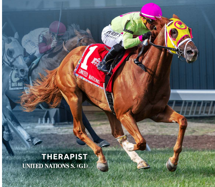
THERAPIST UNITED NATIONS S. (G1)

SUNDAY, AUGUST 11 • 7 PM MONDAY, AUGUST 12 • 12 PM SARATOGA SPRINGS, NY