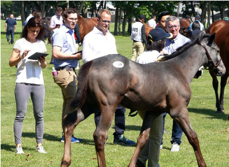
The Coolmore team viewing foals in Japan back in 2019 | Emma Berry