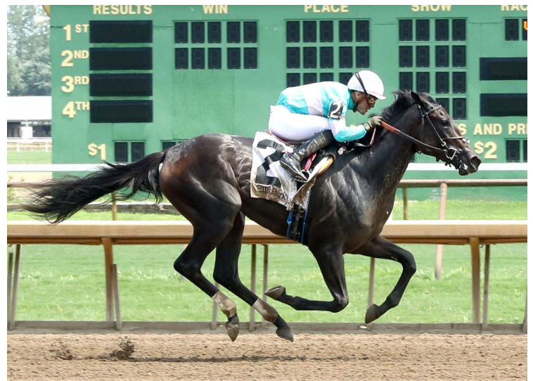
American Women was one of two back-to-back winners for Constitution at Ellis Park Monday

Constitution , Ellen Jay, f, 3, o/o Covfefe, by Into Mischief. MSW, 7-15, Ellis