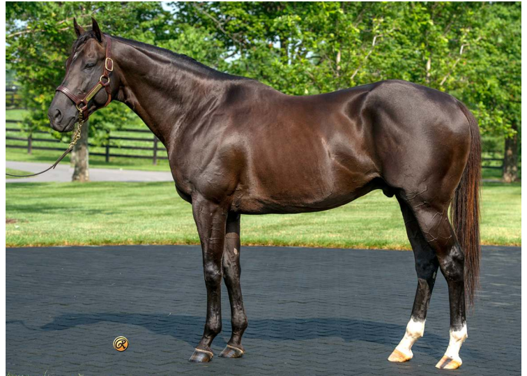
Take Charge Indy was represented by his 18th stakes winner when Tougherthantherest won the Irish Day S.

FOR THE WEEK ENDING JULY 14, 2024 ACTIVE NORTH AMERICAN-BASED STALLIONS