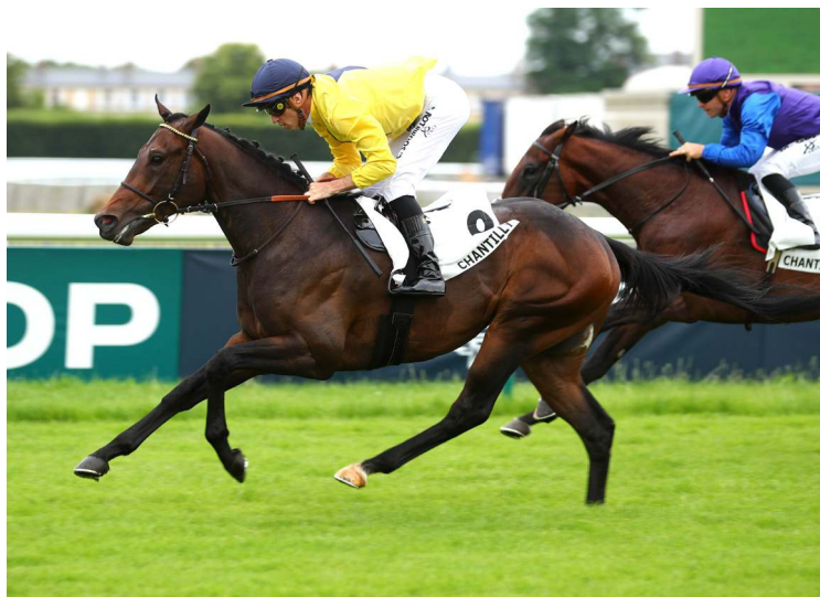
Scandalo

She is also related to the G3 John of Gaunt Stakes winner and G1 July Cup runner-up The Cheka (Ire) (Xaar {GB}) and the G3 Prestige Stakes winner Boomer (GB) (Kingman {GB}) from the esteemed dynasty of Zafonic. Sales history: 110,000gns RNA Ylg '23 TATOCT; £120,000 2yo '24 GOFAPR. Lifetime Record: 1-1-0-0, €15,000. Video, sponsored by FanDuel TV.