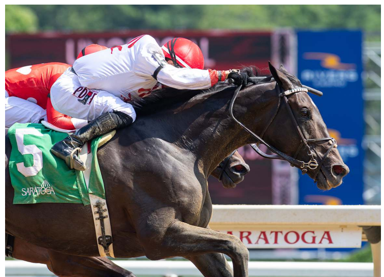
American Pharoah's My Kentucky Girl

Into Mischief , Tivy, c, 4, o/o Jellicle Song, by Street Cry (Ire). STR, 7-14, Saratoga