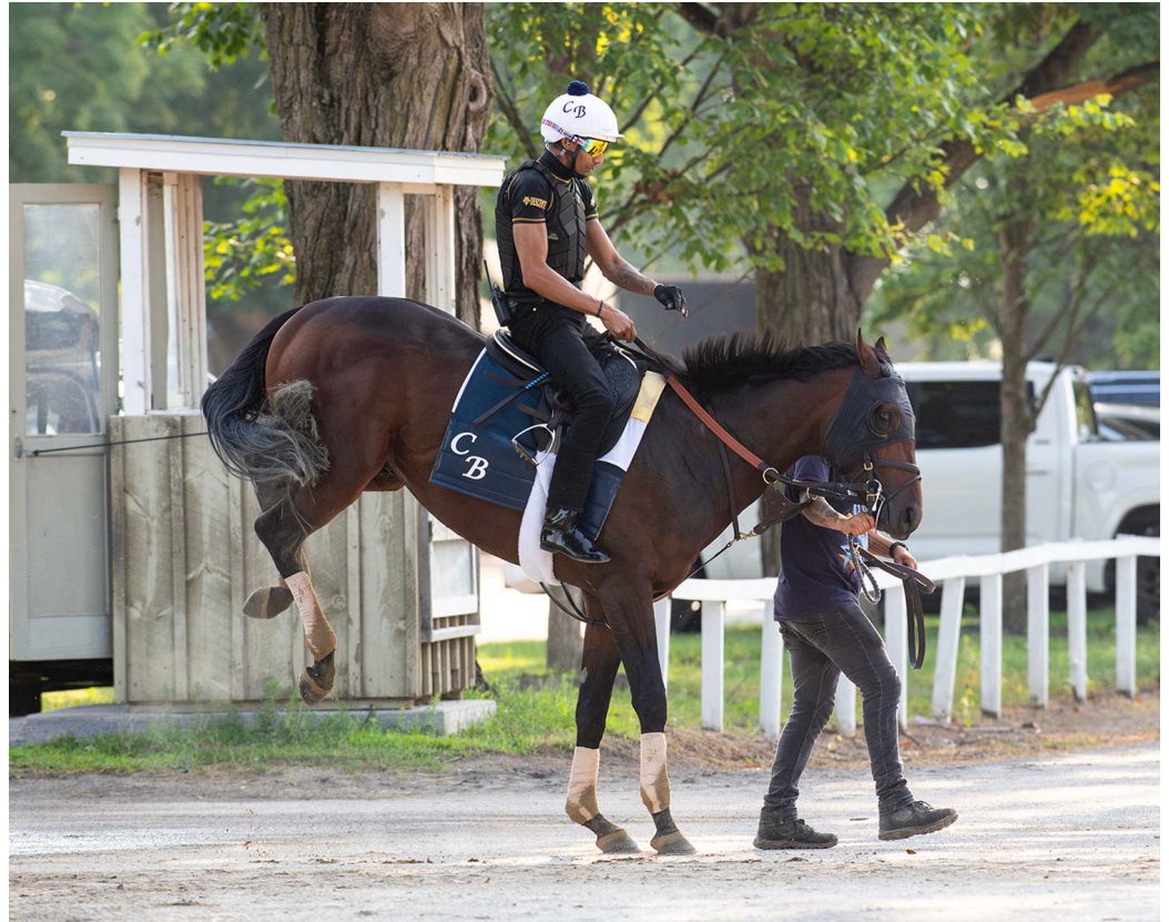
'TDN Rising Star' Sierra Leone ( Gun Runner) kicks up his heels after Sunday's workout over Saratoga's Oklahoma training track.