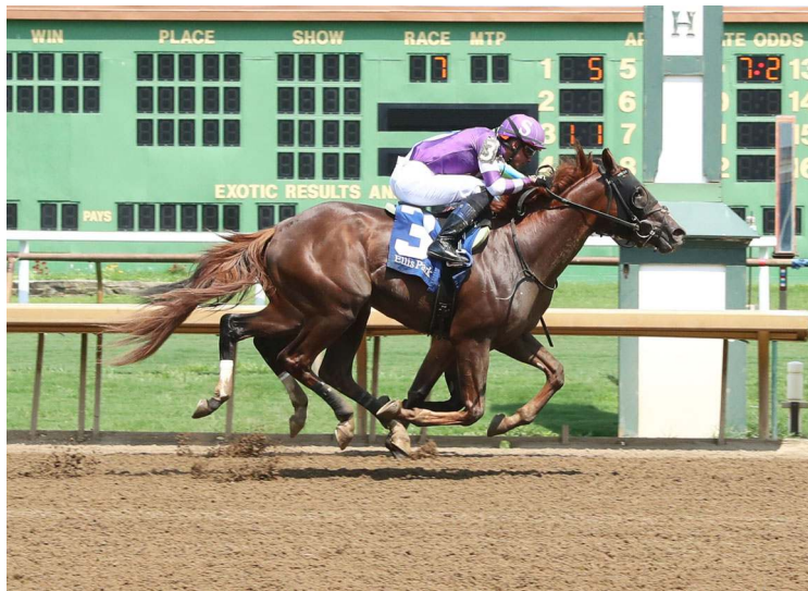
Dbook | Coady Media

3rd-Hawthorne, $40,960, Msw, 7-14, 2yo, 4 1/2f, :52.14, my, 4 1/4 lengths.