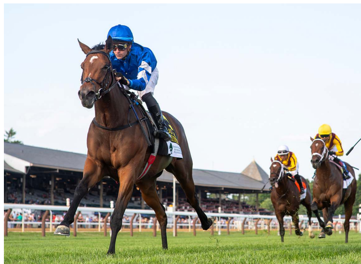
Star of Mystery