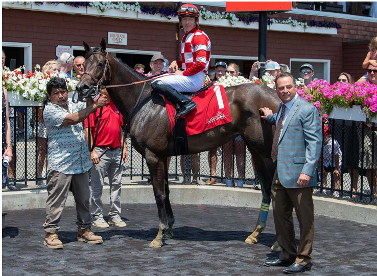
Kimchi Cat after her win Sunday