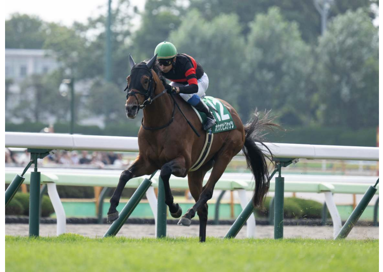
Ho O Biscuits

(Jpn), Emu (Jpn). Click for the JRA chart & video.