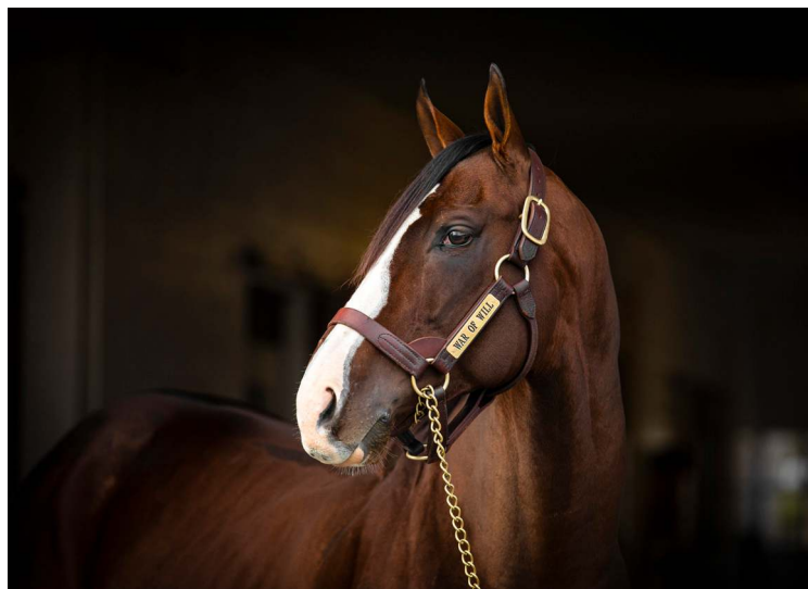
American stallion War of Will has an entry at Ayr

€25,000 Arqana Deauville October Yearlings 2023