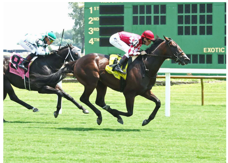
Dream On | Coady Media