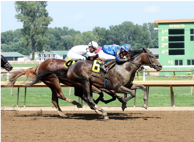
Maxwell