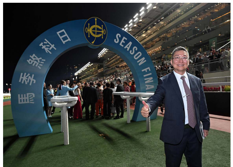
Francis Lui | HKJC

"These achievements are only possible because of the significant investment of our owners." Cont.