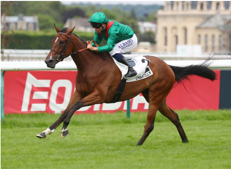
Zarigana

Zarigana, half to a yearling filly by Dubawi (Ire), is the second foal and scorer produced by Listed Prix Thiberville victrix and G1 Prix Vermeille third Zarkamiya (Fr) ( Frankel {GB} ), herself kin to Group 1-winning sire Zarak (Fr) (Dubawi {Ire}), Listed Prix Charles Laffitte victrix Zaykava (Fr) and to the dam of dual Group 3 winner Zeyrek (Fr) ( Sea The Stars {Ire} ). The January-foaled bay's second dam went unbeaten through a seven-race career, annexing the G1 Poule d'Essai des Pouliches, G1 Prix de Diane and G1 Prix de l'Arc de Triomphe along the way.