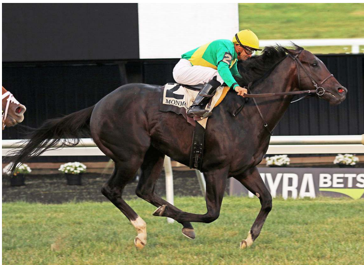
Apollo Ten

A winner on the grass in New York as a juvenile, Apollo Ten began his 3-year-old season at Gulfstream with an allowance-level win Apr. 18 before filling out the exacta on Tapeta in the six-furlong Tom Ridge Stakes last out at Presque Isle Downs June 17. Favored at 3-5 Sunday back sprinting on the grass, Apollo Ten broke to the lead with a quick challenge from Mattingly to his outside. That pair dueled into the far turn before the favorite turned his rival back and kicked for home, holding off a late charge from 17-1 shot Roi Soleil to earn his first stakes win.