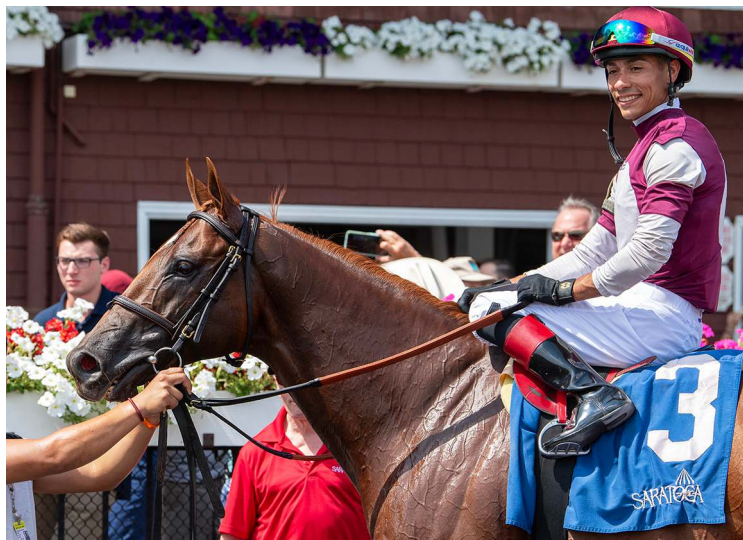
Jose Ortiz aboard Rebel Red

Ortiz won the Saratoga riding title in 2016-17 and 2019. His brother, Irad, has won it five times, including the last two.