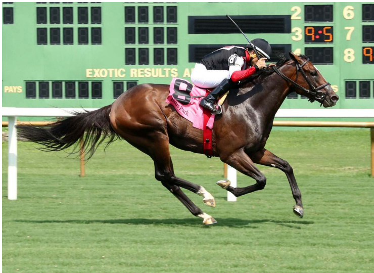
War Front's Runnin' Rocket winning at Ellis Sunday