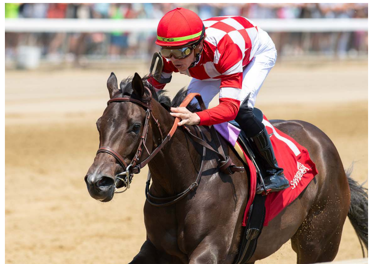
Kimchi Cat