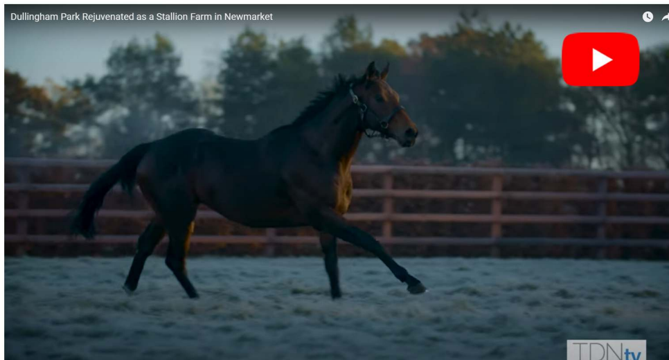
Dullingham Park Rejuvenated as a Stallion Farm in Newmarket