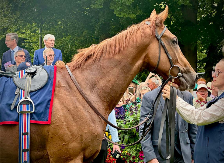
The new Whistlejacket

Appropriately, he too is a chestnut, and the Irish-bred son of No Nay Never is, fortunately, also a good 'un.