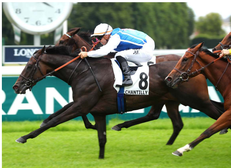
Blush