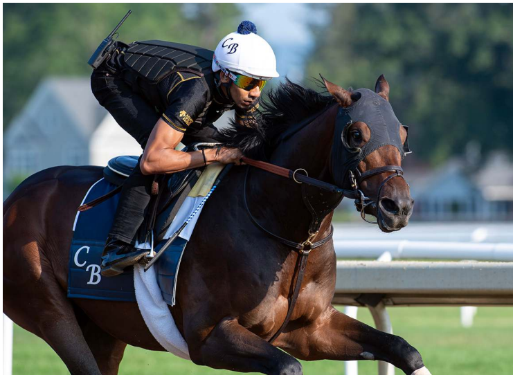
Sierra Leone

The Jim Dandy will serve as a prep for the GI Travers Stakes where Sierra Leone will join another stablemate on the day's card in Domestic Product ( Practical Joke ) who targets the GI H. Allen Jerkens Memorial and took the GIII Dwyer Stakes July 6 at Aqueduct off short rest.