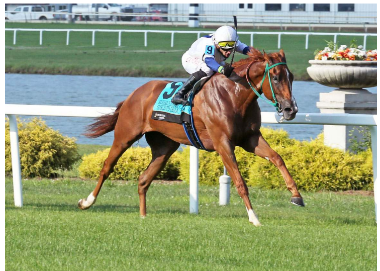
Charlene's Dream

A granddaughter of Grade I winner Lucifer's Stone (Horse Chestnut {SAf}), Clara Kelly, produced a filly by Echo Town last term followed by a Thousand Words filly this term. Click for the Equibase.com.