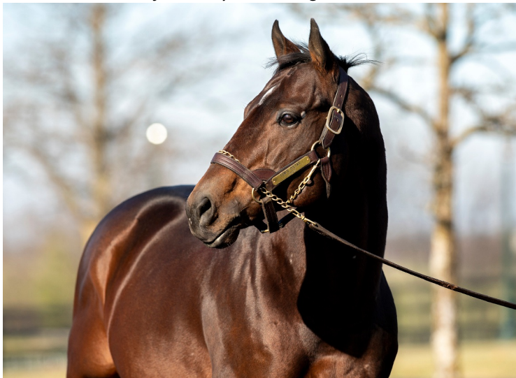
Tom's d'Etat

Some of the most highly anticipated races during the summer racing season are the 'baby' races during the boutique meetings at Saratoga and Del Mar and at Ellis Park, which attract its fair share of high-priced offspring from a variety of top national outfits. Summer Breezes highlights debuting 2-year-olds at those meetings that have been sourced at the breeze-up sales earlier in the year, with links to their under-tack previews. To follow are the horses entered for Friday at Saratoga: