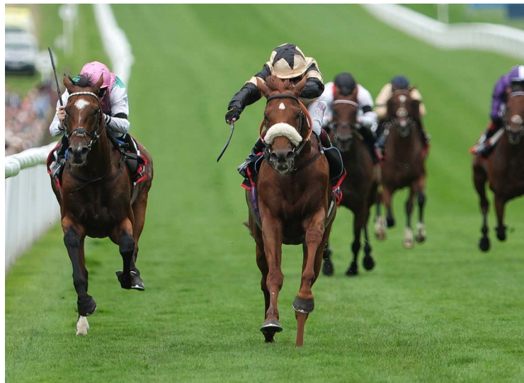
Giavelotto

Giavelotto, who was promoted from fourth to third in the 2022 St Leger, has had to wait for due credit having been sent over marathon trips that pushed him beyond his stamina limit following his first Yorkshire Cup win. This was a mile-and-a-half masterclass on the clock that served as a mild surprise for most other than his connections and he will be a strong contender for September’s Curragh feature whatever the presence from Ballydoyle and co. Cont. p9