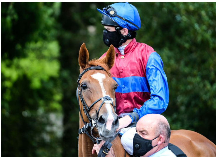
A Japan half-brother to German Oaks heroine Miss Yoda (above) and her first foal are both offered in the upcoming BBAG sale