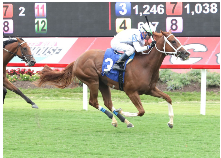
Glory Glory

Bucchero , Glory Glory, f, 2, o/o Imperial Strike, by Imperialism. MSW, 7-11, Colonial Downs