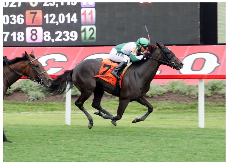
Strike When Ready