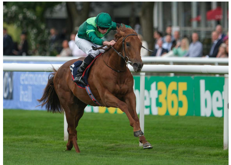
Whistlejacket

"He is obviously still a bit raw and is still learning, but it was a good performance," said Ryan Moore. "He has given away a bit of ground in the last furlong and gone a long way ahead. He is a fast horse and I think there is a bit more in there which gives us hope for the rest of the year." Cont. p8