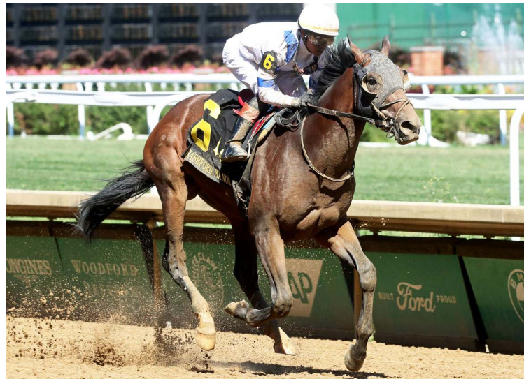
Politically Correct