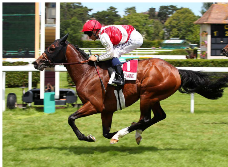
Gun Of Brixton | Scoop Dyga