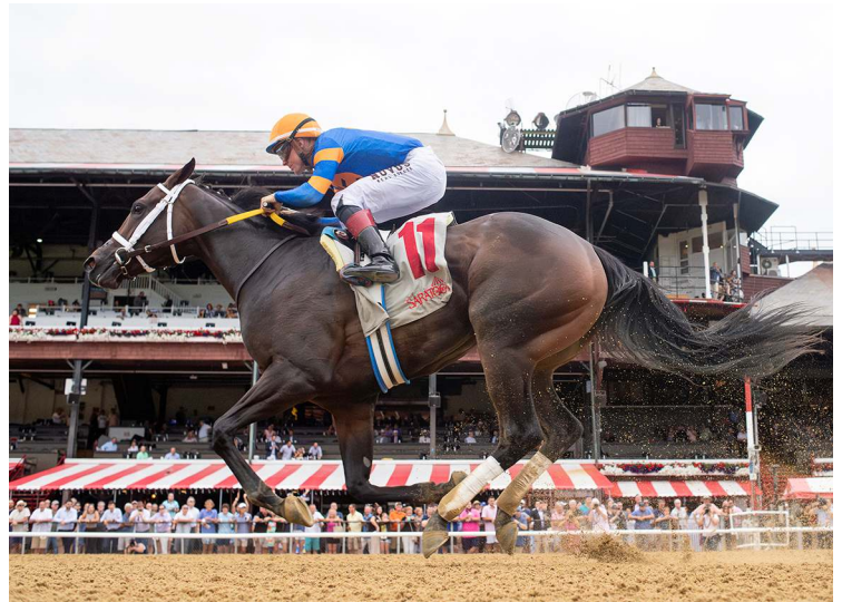
The Queens M G

"She ran as poor as a horse could run and we were feeling really down," the Barbadian said. "She checked out after the race fine and we couldn't find any soundness issue. She was bumped hard in her last start--a lot of things went against her that day--but we don't know why she ran bad. I figured we'd carry forward like that race didn't exist and train her to the Schuylerville."