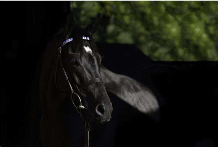
The near-black Group 1 winner Mohaather sired his first winner on Thursday