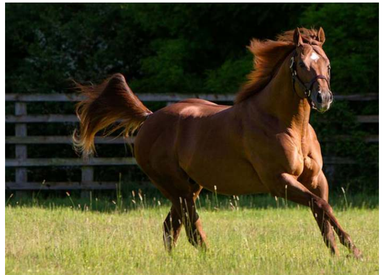
Night Of Thunder | Darley

The winner is the first foal out of the unraced dam, a daughter of Juddmonte's stellar performer Proviso (GB) (Dansili {GB}) whose career tally included wins in the GI Diana Stakes, GI Just a Game Stakes, GI First Lady Stakes and GI Frank E. Kilroe Mile Handicap. From the family of the G1 Prince of Wales's Stakes winner Byword (GB) (Peintre Celebre), her 2-year-old full-brother to the winner was bought by the owner for 100,000gns at Tattersalls October Book 2, while she also has a yearling colt by Too Darn Hot (GB) and a filly foal by Cracksman (GB).