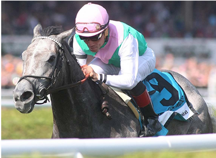
Filimbi

Cozzene, remember, was by Caro--who also gave us the dam of Arrogate's sire Unbridled's Song. Overall both Cozzene and Mizzen Mast were wholesomely flexible influences and Dragoon Guard's dam Filimbi was one of the line's high achievers on turf, as a Grade II winner whose multiple Grade I placings included a narrow failure to run down Tepin (Bernstein) in the Just a Game Stakes.