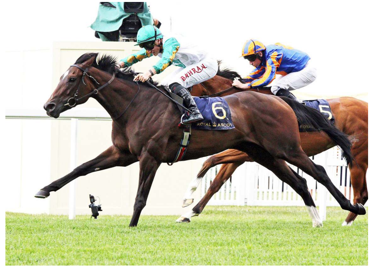
Porta Fortuna

“I would be worried if it stayed soft and her two worst runs last year—even though she never ran badly—were on ground that was slightly easier, but there isn’t much rain due on the forecast and Newmarket can dry out quickly, so we’re hoping it can dry out before the race,” he added. “The plan was to go either here or the Prix Rothschild. We’ll probably give her a little break after this and start her back in the autumn in the Matron Stakes and hopefully end up at the Breeders’ Cup at the end of the year.”