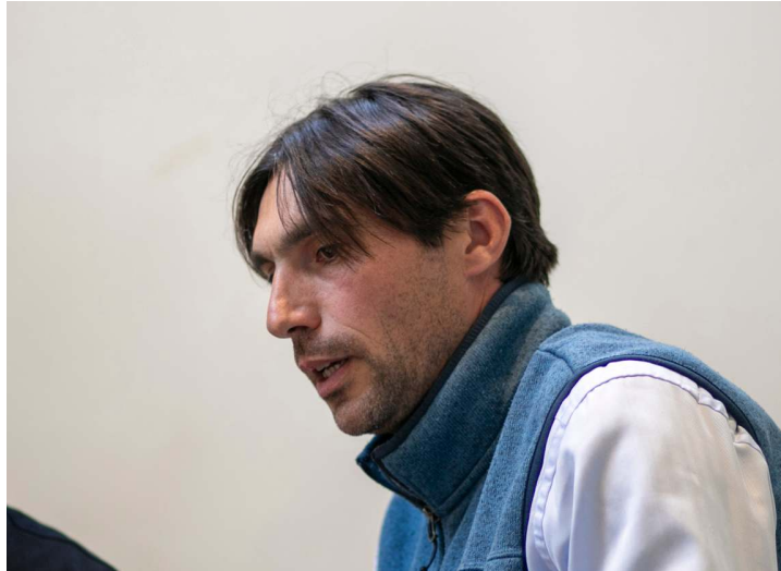
Alessandro Marconi

The four-year-old looks to have been well bought as, not only was she carrying to Sergei Prokofiev, who has made a promising start to his own stud career, but she is a descendant of the great Miesque through her third dam East Of The Moon. Cont. p5