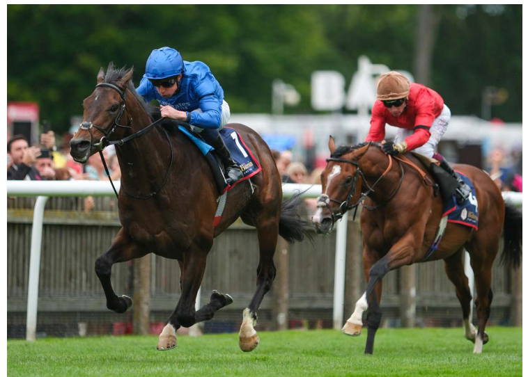
Ancient Wisdom

The 6-4 favourite went forward to assume control after the initial strides of this 13-furlong test. Holding sway thereafter, he was asked to stretch with three furlongs remaining and kept finding for pressure inside the final quarter-mile to comfortably hold Royal Supremacy (Ire) (Make Believe {GB}) by 1 3/4 lengths.