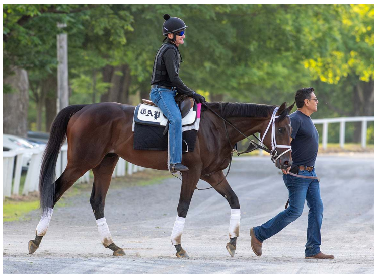
Fierceness

SARATOGA SPRINGS, NY -- Missing from action for two months, but certainly not forgotten, beaten GI Kentucky Derby favorite and 'TDN Rising Star' Fierceness (City of Light) is ready to make his comeback.