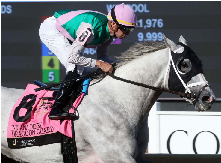
Dagoon Guard