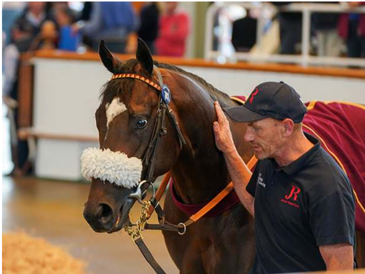
Jubilee Walk topped the third and final session of the July Sale