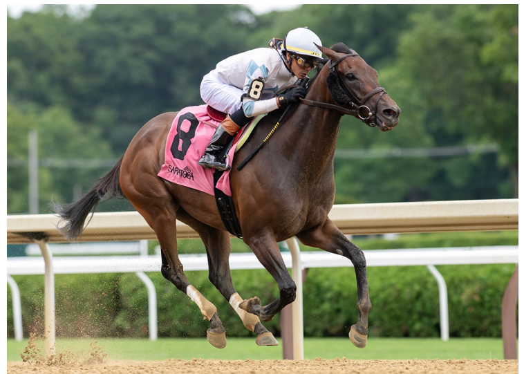
Amanda's Folly