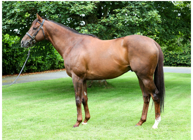
Shaman has a runner at York | Yeomanstown Stud

Wooded (Ire) (Wootton Bassett {GB}), Haras de Bouquetot 80 foals of racing age/3 winners/0 black-type winners 1-COMPIEGNE, 1400m, Slava Oukraini (Fr) €16,000 Arqana December Breeding Stock Sale 2022