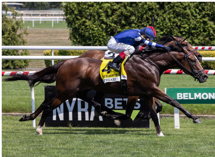
Trikari's Belmont Derby win Saturday

Although Oscar Performance may rightfully be perceived as a turf sire—every one of his seven graded wins was on the lawn and his own sire was champion turf male of 2004—Trikari is the only one of his 2024 graded winners to date on the grass. This year's GIII Hurricane Bertie Stakes winner and GI Madison Stakes placer Red Carpet Ready was on the dirt, GIII Fred W. Hooper Stakes winner and GII Gulfstream Park Mile Stakes runner-up Tumbaramba was on the main track, and GIII Jeff Ruby Steaks winner Endlessly was on Turfway's all-weather surface.