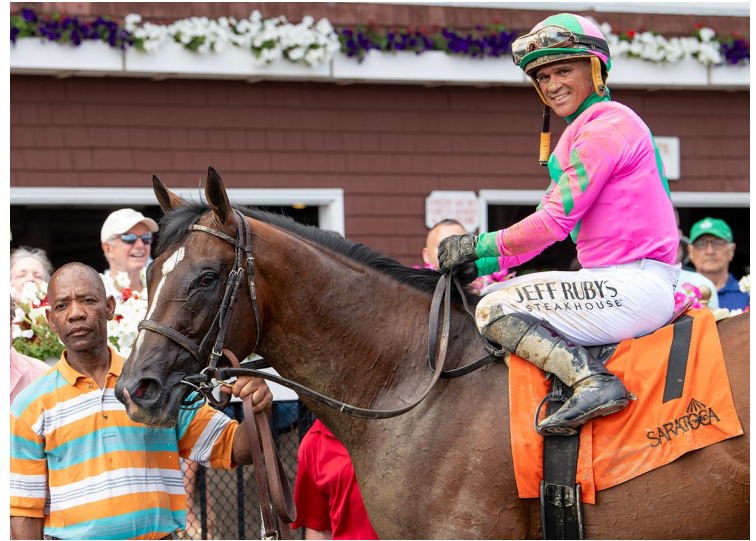
Brown Eyed Cat