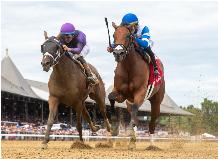
Strong State (inside)

5th-Colonial Downs, $81,750, (S), Msw, 7-11, 2yo, f, 5fT, :58.28, fm, 1 1/2 lengths.