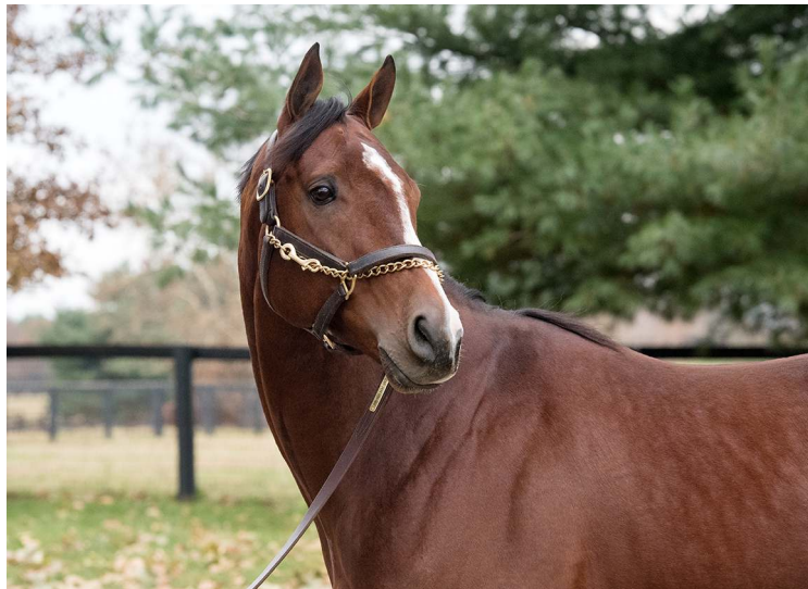
Oscar Performance

Pop quiz: which North American third-crop sire leads his contemporaries by individual graded stakes winners in the Northern Hemisphere in 2024? It's not Justify , nor Good Magic , who are each tied with three and are the runaway leaders by 2024 progeny earnings. The correct answer is Mill Ridge Farm's Oscar Performance , who has four graded winners in 2024 and also leads the top third-crop sires by percentage of black-type winners to runners at 6.6%.