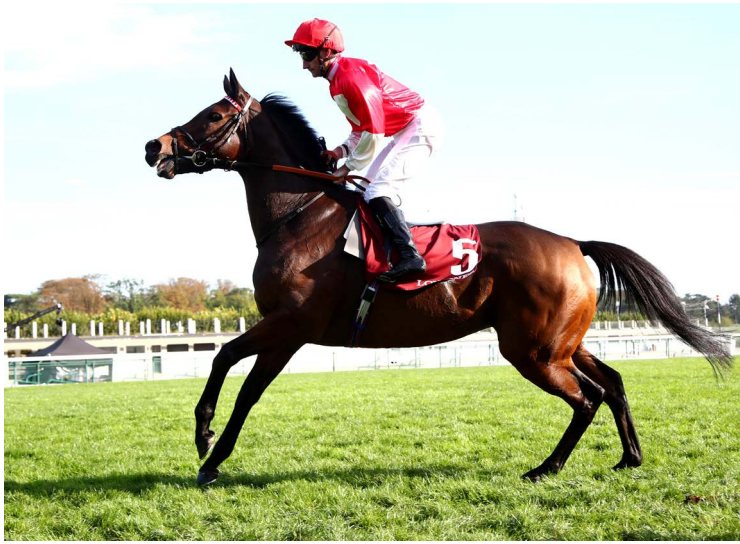
Rogue Millennium