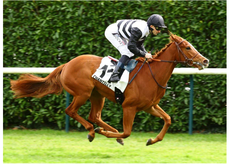
Ramatuelle

Connections of Ramatuelle are targeting an autumn campaign with the daughter of Justify after she finished third in the G1 Coronation Stakes at Royal Ascot, deciding against a tilt at the G1 Prix Jean Prat at Deauville on Sunday.