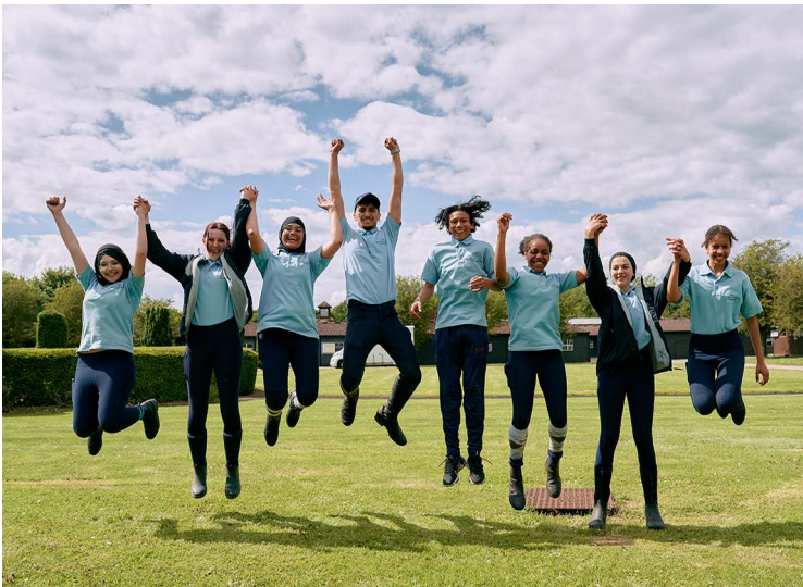
Graduates from the Riding A Dream Academy

The Riding A Dream Academy, which was set up in 2021, has been integrated into the British Racing School (BRS) in Newmarket.