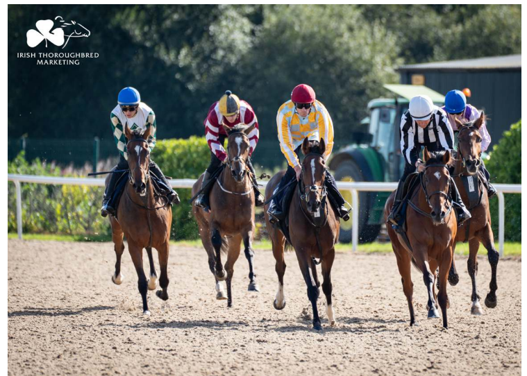
Entries for the next session of Irish EBF Barrier Trials close on Thursday | ITM