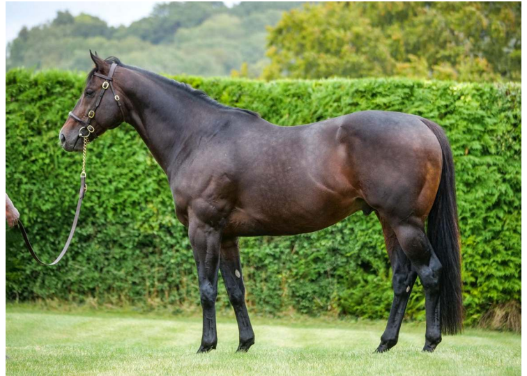
Sergei Prokofiev | Whitsbury Manor Stud

Sands of Mali (Fr) (Panis), Ballyhane Stud 98 foals of racing age/7 winners/1 black-type winner 14:15-THIRSK, 6f, Ay Gee Ell (Ire) €26,000 Goffs November Foal Sale 2022; €34,000 Goffs Orby Yearling Sale (Book 2) 2023