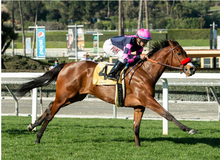
Lucky Girl

She was fourth in the GIII Monrovia Stakes in April and in the Mizdirection Stakes in May and is nominated to the July 21 Osunitas Stakes at Del Mar.