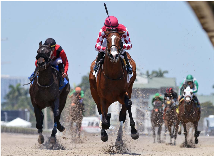
Mensa sold for $740,000 through Fasig-Tipton Digital

LA: So I'll say this: flash sales are extremely difficult. It's very difficult to get a huge update no matter who you are. To get that horse winning the Norfolk like he did, to look like he could possibly be one of the best 2-year-olds in Europe, that's hard to get. It's even harder to find an owner that is realistic about what the value of the horse may be. So we've been approached quite a few times about different flash sales where owners had astronomical expectations, but that's the one thing for me that's so important is if you do a flash sale, it has to work. Cont.