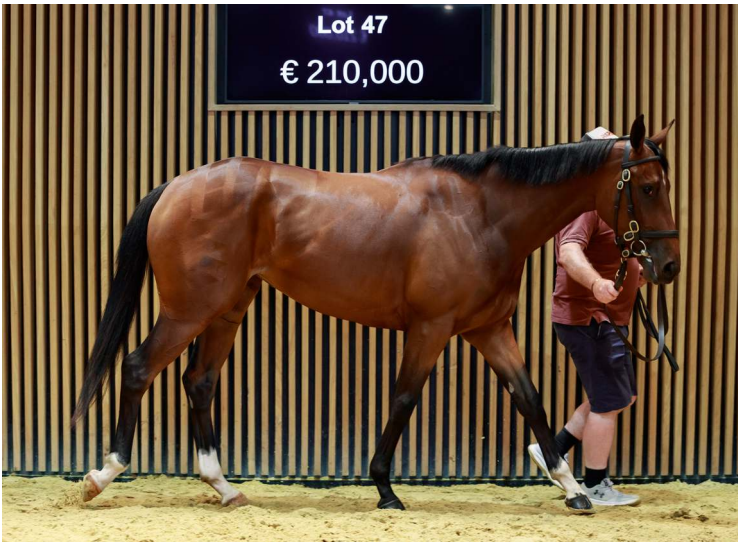
Lot 47: a Too Darn Hot filly led the way at Arqana on Tuesday Zuzanna Lupa