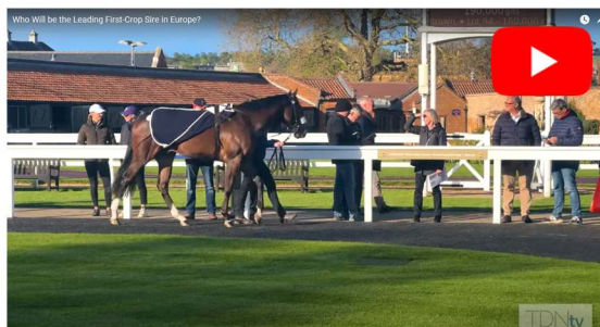
Who Will be the Leading First-Crop Sire in Europe?