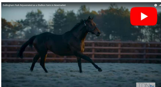
Dullingham Park Rejuvenated as a Stallion Farm in Newmarket