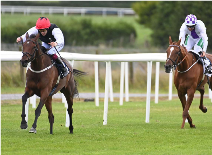
La Isla Mujeres