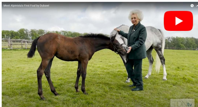
Meet Alpinista's First Foal by Dubawi