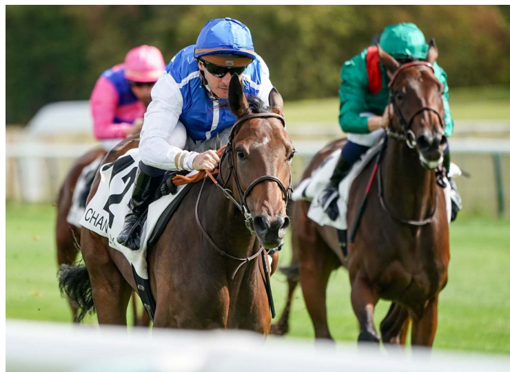
Aventure

Pedigree/form notes: A two-time winner in three starts, this relation to G1 Pretty Polly S. heroine Nezwaah (GB) (Dubawi {Ire}) has yet to race in black-type company, but is a half-sister to Listed Prix Finlande third Roman Bamb (Fr) (Holy Roman Emperor {Ire}). Cont. p8