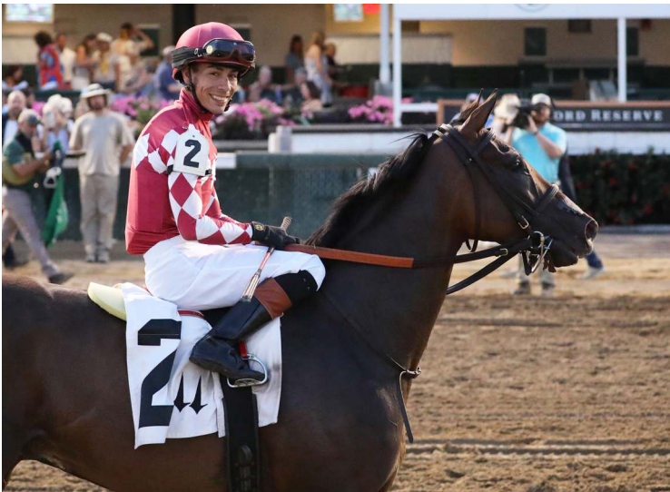
Web slinger

Web slinger returned to the winner's circle for the first time since winning the Audubon S. at this venue last June with a sharp effort in the Chorleywood S. under the lights at Churchill Downs Saturday.