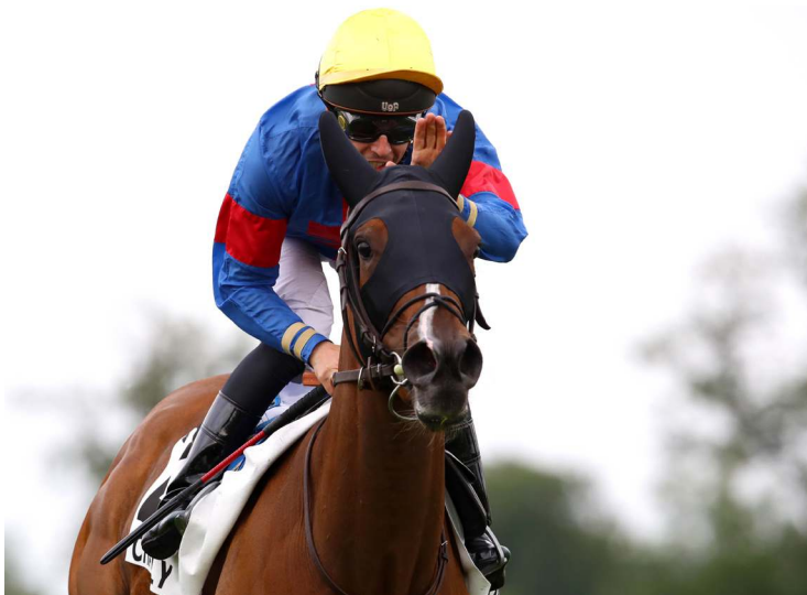
Sparkling Plenty