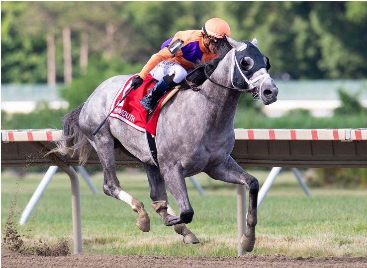
Tuscan Sky

South Andros, the dam of Tuscan Sky, won the 2014 Justakiss S. at Delaware Park. She also produced the colt Private Creed, winner of the GII Exacta Systems Franklin-Simpson S. last September at Kentucky Downs as a 3-year-old. Private Creed had finished third in the Breeders' Cup Juvenile Turf Sprint in 2022. South Andros has an unnamed 2-year-old colt by Complexity , a yearling full-brother to Private Creed and recently produced a Jackie's Warrior filly. Click for the Equibase.com chart or VIDEO, sponsored by FanDuel TV.