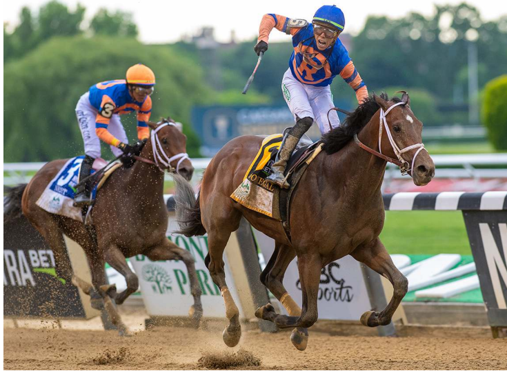
Mo Donegal and Nest, one-two in the 2022 Belmont

"I got into the trading," he recalls. "And, for me personally, the sales aspect kicked it into the next level. But what made all the