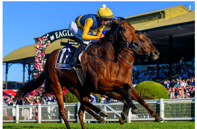
Stefi Magnetica | Magic Millions