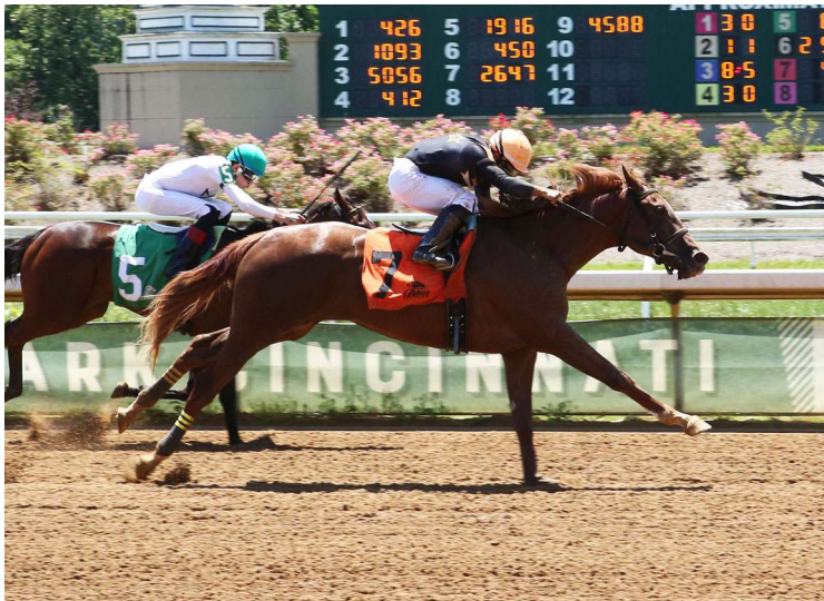
Goosebumps