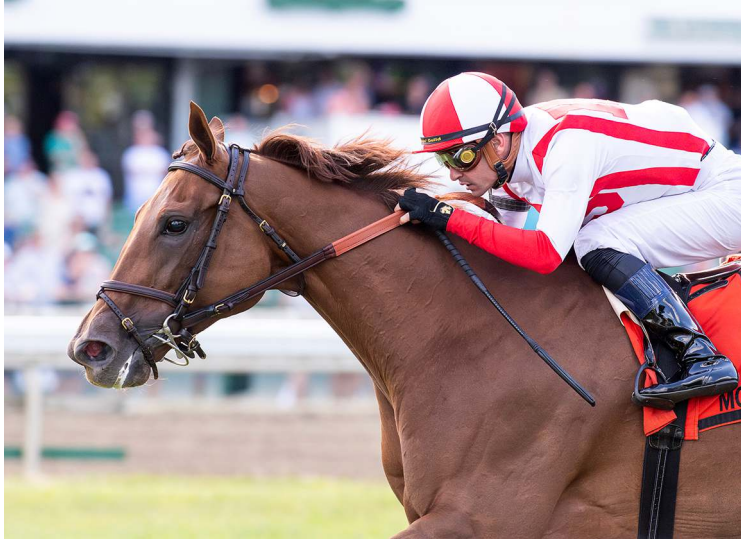
Tax Implications

An impressive debut winner over the local course in late 2022, the daughter of Mehmas (Ire) has since gone 0-for-7 on the NYRA circuit but continued to give a good account of herself, failing to hit the board only twice in that span.