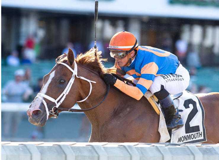
Bright Future

The mare had several headlining months. In addition to Bright Future's GI win in September, her debuting 2-year-old, Booth (Mitole), was named a 'TDN Rising Star' at Keeneland in October and, in December, her sophomore daughter Musical Mischief (Into Mischief) finished third in the GI American Oaks. Sophia's Song currently has a juvenile colt by Tiz the Law and a yearling colt by Maxfield . The mare is out of an unraced full-sister to dual champion sprinter Housebuster from the same family as last year's GI Hopeful S. winner Nutella Fella ( Runhappy ). Damsire Bellamy Road, the 2005 GI Wood Memorial S. winner, has an even dozen black-type winners out of his daughters.