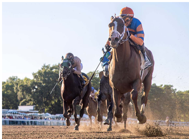
Bright Future to the front

Bright Future has been off since a sixth-place finish behind White Abarrio (Race Day) in the GI Breeders' Cup Classic last November, a spot he earned on the merits of a GI Jockey Club Gold Cup S. win in the waning days of the Saratoga meet in September. Those two starts followed an open daylight allowance win at Saratoga, the first in a string of three consecutive races that netted triple-digit Beyer Speed Figures for Bright Future. His last several works upon returning have been very sharp, including a :47 3/5 move over four furlongs (3/172) on Belmont's training track June 8.