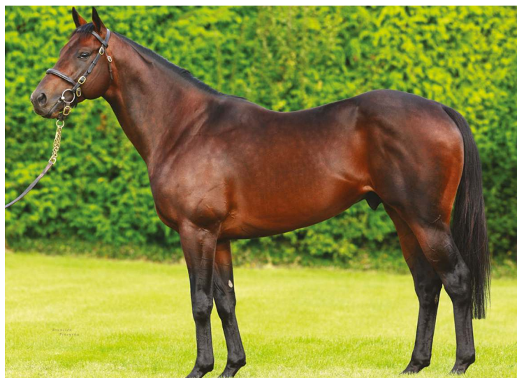
Adaay | Allevamento di Besnate

Adaay In Devon, half to a yearling filly by Sergei Prokofiev and one of her sire's four stakes winners, is the seventh of eight live foals and the leading performer from two winners out of Listed Ripon Champion Two-Year-Old Trophy and Listed Redcar Two-Year-Old Trophy runner-up Favourite Girl (Ire) (Refuse To Bend {Ire}). Favourite Girl is the leading performer out of a half-sister to multiple stakes-winning Scandinavian champion Rolo Tomasi (Ire) (Mujtahid), G2 German 1000 Guineas and GII Buena Vista H. runner-up Elegant Ridge (Ire) (Indian Ridge {Ire}) and the dual stakes-placed Summer Sunset (Ire) (Grand Lodge). Elegant Ridge is the dam of G3 Thoroughbred S.-winning sire Montiridge (Ire) (Ramonti {Fr}).