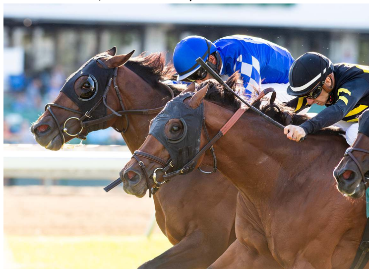
Fort Washington (outside) and Running Bee (inside)

Coming into the Monmouth S., Fort Washington's form might not have looked the best on paper. The dark bay was last seen finishing a well-beaten 10th against optional claimers over a 'good' Churchill Downs turf course May 9. However, his 3-year-old and 4-year-old campaigns included some challenging stakes competition. When he visited Monmouth two years ago for the Tale of the Cat S., he rallied nicely for the win.