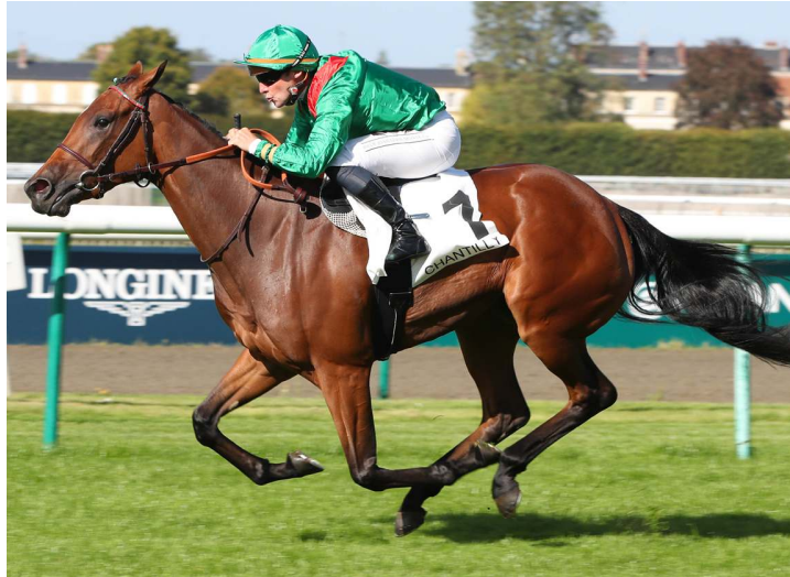
Candala

ground won’t do her any harm. We are applying cheekpieces just to hopefully keep her concentration at the business end of the race. She has a sensible draw in seven and, if she can reproduce her Epsom form, she is going to be a big player.”