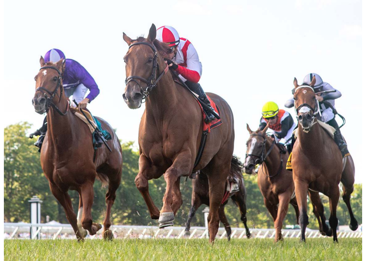
Tax Implications forges to the front