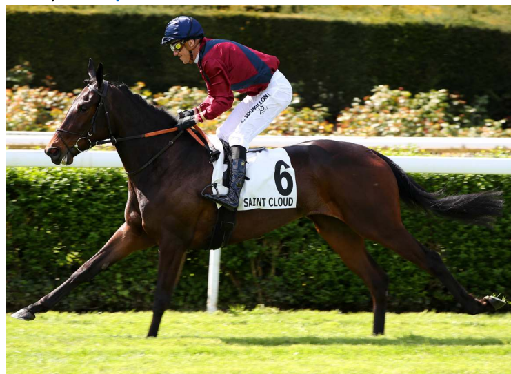
Gala Real