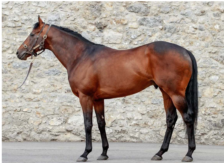
Inns Of Court