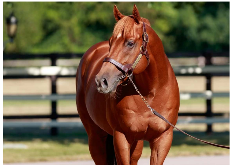
Golden Horde has a runner in France | Sumbe

103 foals of racing age/3 winners/0 black-type winners 1-GOWRAN PARK, 7f, Carnivore (Ire) €7,000 Tattersalls Ireland September Yearling Sale Part II 2023