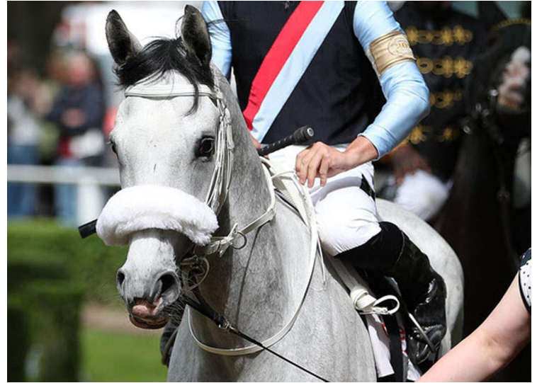
Three Havanas | BBAG

€145,500. O/B-Gestut Karlshof (Ger); T-Henk Grewe. *€80,000 Ylg '22 BBAGO.