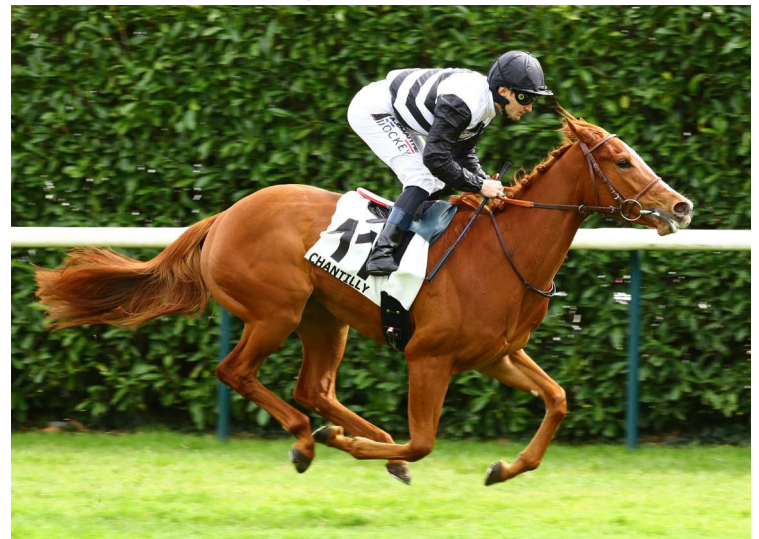
Ramatuelle