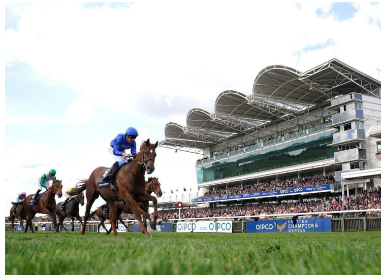
Notable Speech leads Guineas winners on Timeform ratings