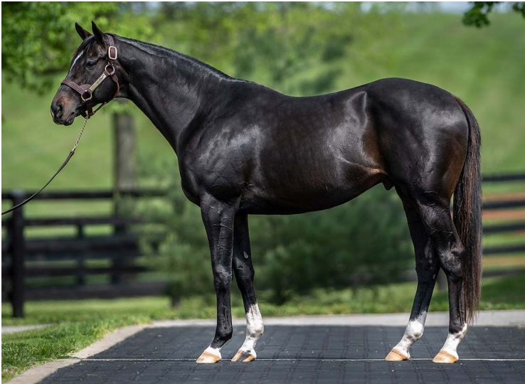
Not This Time

His now-pensioned dam produced five winners and Belouni (Fr) is the sole black-type earner. Sales History: €20,000 Ylg '21 ARQDOY; €180,000 2yo '22 ARARC. Lifetime Record: SW-US & SP-Fr, 12-4-4-0, $195,862. Click for the Equibase.com chart or VIDEO, sponsored by FanDuel TV.