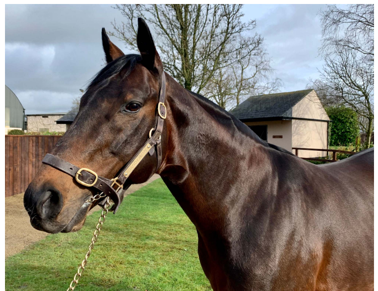
Dandy Man