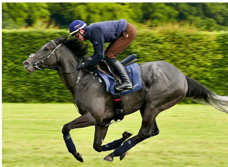
Vandeek and James Doyle on the Limekilns