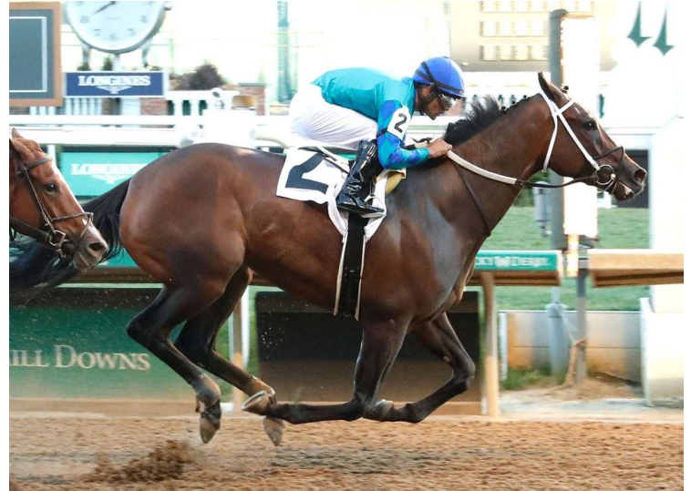
Our Pretty Woman