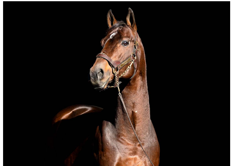
Tom's d'Etat sired his first winner Saturday

Sporting Chance , Not a Rehearsal, f, 2, o/o African Heat, by Southwestern Heat. MSW, 6-15, Ruidoso Downs Square Eddie , Eddie's Last, g, 4, o/o Loan Savant, by Spring At Last. AOC, 6-15, Santa Anita Stay Thirsty , Thirsty Mama, f, 2, o/o Easter Fever, by Stormin Fever. MSW, 6-15, Santa Anita Stay Thirsty , Thirsty in Vegas, f, 2, o/o Letsgotovegas, by Indian Charlie. MSW, 6-15, Santa Anita Street Boss , Runamileinmyshoes, f, 3, o/o Intoitagain, by Into Mischief. MSW, 6-15, Santa Anita Sungold , August Rain, g, 3, o/o Bitatude, by Super Saver. Ross Mcleod S., 6-15, Hastings The Factor , Appeal Factor, f, 3, o/o Karula, by Colonel John. Seattle S., 6-15, Emerald Downs Tom's d'Etat , Goosebumps, f, 2, o/o Callisto, by Malibu Moon. MSW, 6-15, Belterra Park Tom's Tribute , Tom's Regret, f, 4, o/o Pure, by Quality Road . Mary Clare Schmitt Pleasanton Oaks, 6-15, Pleasanton Uncle Mo , Foreseen, f, 3, o/o Imprecation, by First Defence. MSW, 6-15, Churchill Downs Vino Rosso , Avana, f, 3, o/o Revealing Moment, by After Market. River Rock Casino S., 6-15, Hastings