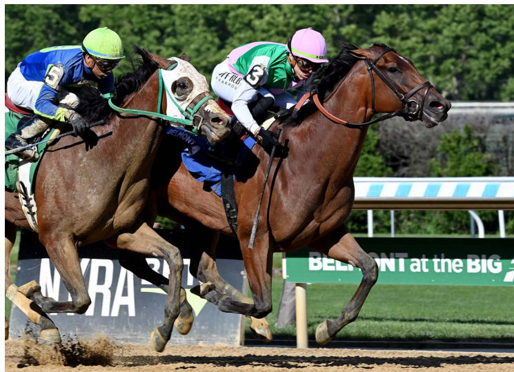
Accede

Accede, third at second asking in last spring's GII Eight Belles S., won her last two trips to the post at Keeneland, an allowance Oct. 14 and an optional claimer Apr. 24.