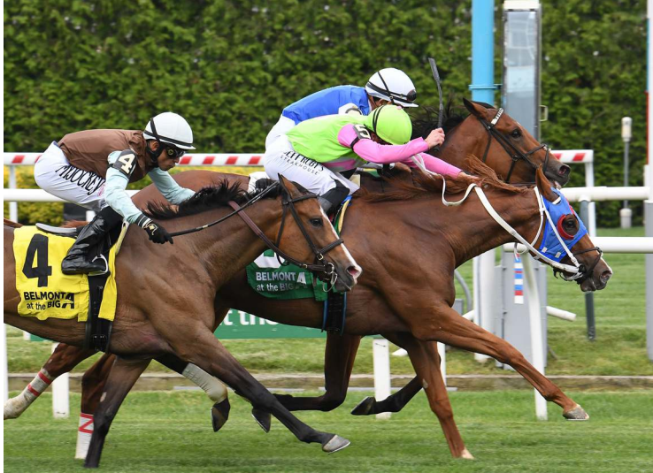
Soloshot (center)

Also Ran: Sohana, My Shea D Lady, Naughty Destiny, War Terminatrix, Find Your Joy.