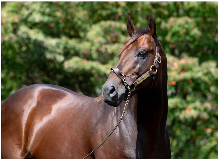
Nyquist