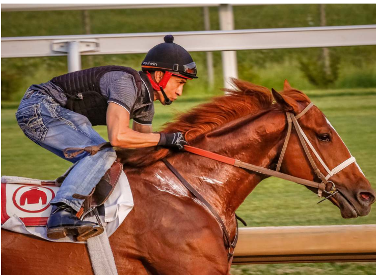
Rich Strike