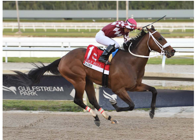
Hades winning the Holy Bull