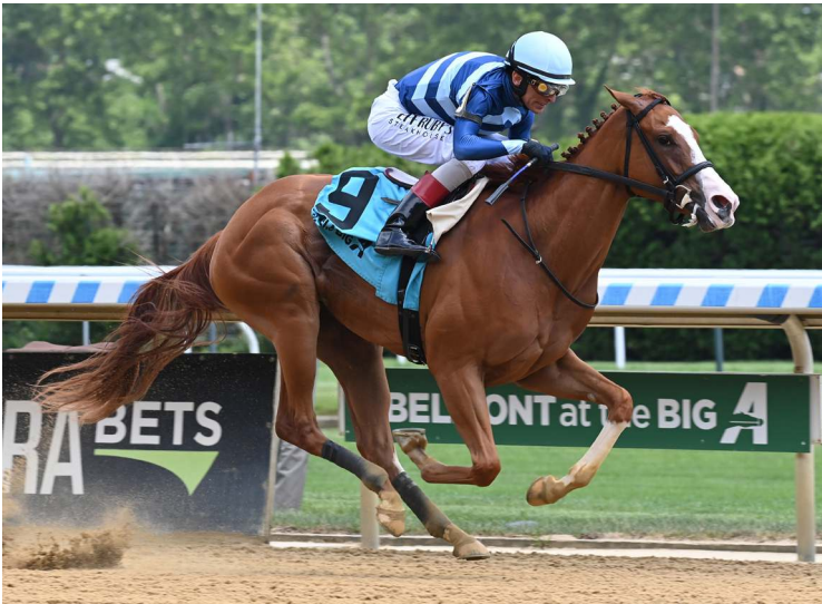
Complexion

Just a day after Win Win Win earned the first 'TDN Rising Star' of the freshman class with Nooni, he was joined by Complexity (by Maclean's Music ) who picked up his fourth overall winner Friday and first 'Rising Star' when Complexion (Complexity--Rushin No Blushin, by Half Ours) dominated her debut at Aqueduct.