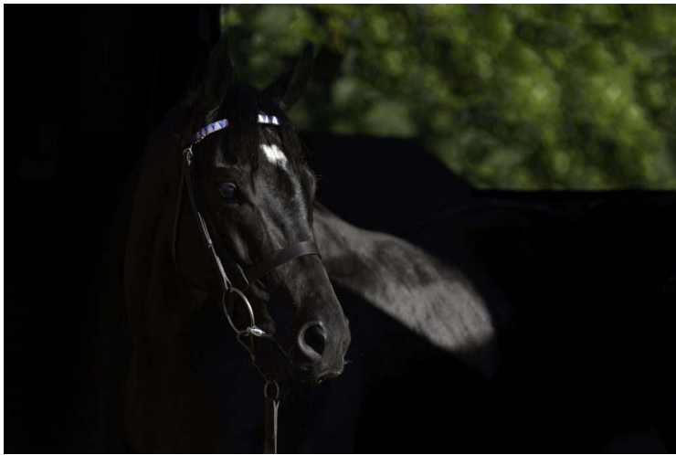
Mohaather has a trio of runners in the UK | Shadwell

13,000gns Tattersalls October Yearling Sale (Book 3) 2023 13:35-CHESTER, 6f, Thecoffeepoddotco (GB) 42,000gns Tattersalls Somerville Yearling Sale 2023