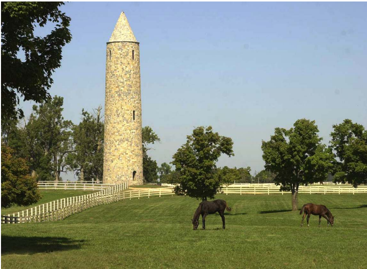
Castleton Lyons Farm

The original farm dates back more than 200 years, and was purchased by Dr. Tony Ryan in 2001. It underwent major renovations, and the breeding shed opened in 2004.