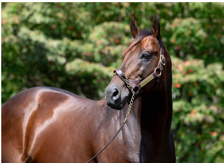
Nyquist