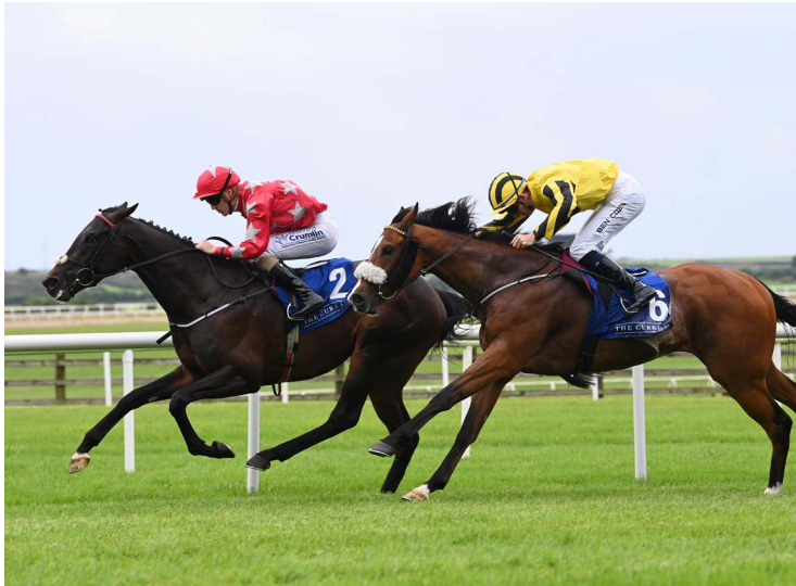
Follow Me: has a big chance at Royal Ascot