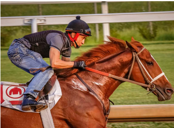
Rich Strike