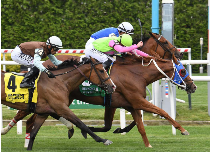
Soloshot (center)

Also Ran: Sohana, My Shea D Lady, Naughty Destiny, War Terminatrix, Find Your Joy.