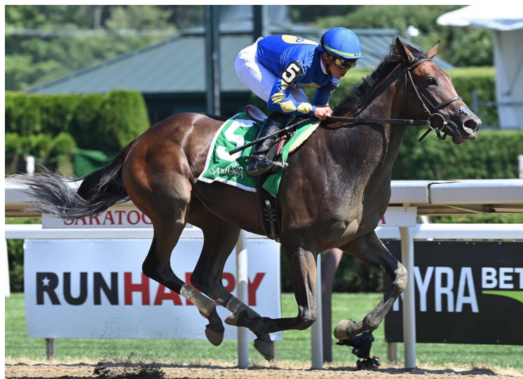
Leave No Trace | Coglianese