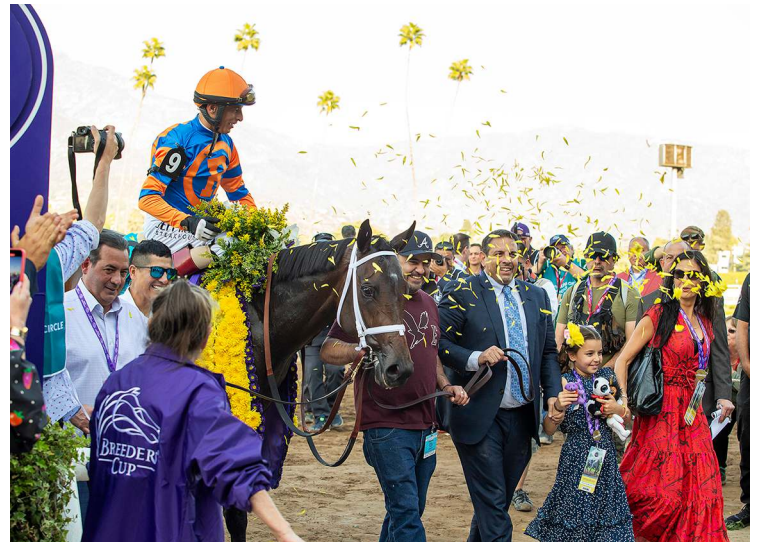
GI Breeders' Cup Juvenile winner Fierceness

He'd already shown his propensity to be quick in the mornings, putting up back to back bullets on both May 20 (four furlongs in :46 1/5 {1/35}) and May 27 (four furlongs in :46 2/5 {1/41}) to earn the wagering public's 1-5 bet of confidence. Drawn conveniently outside, Midland Money came out of the gate on even terms with Smash It (Star Guitar) and that pair quickly separated themselves from the rest of the field. But the favorite was faster and opened up even on that rival into the turn through a quarter in :22.37. While it looked briefly as if Smash It might try to make a quarter-pole run, that moment was short lived and Midland Money came home under wraps in dominating fashion. Magnolias In Bloom, now the dam of two winners from three to race, foaled a filly by Spendthrift's GI Kentucky Derby winner Authentic this year.