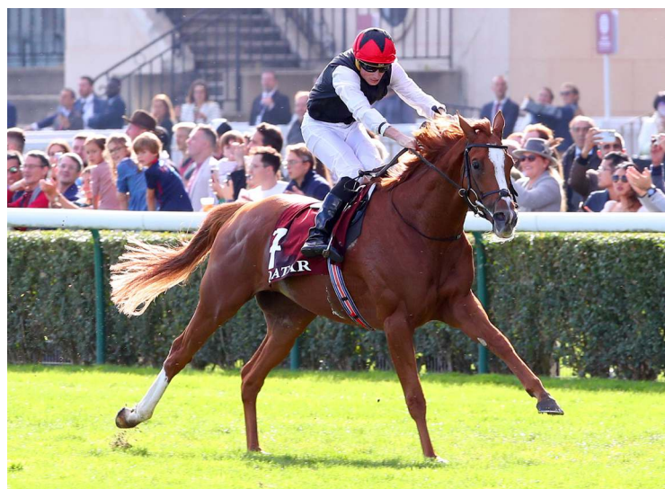
Kyprios | Scoop Dyga