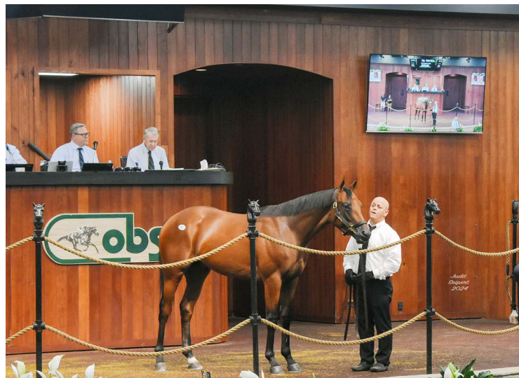
Uncle Mo colt (Hip 1021) | Judit Seipert