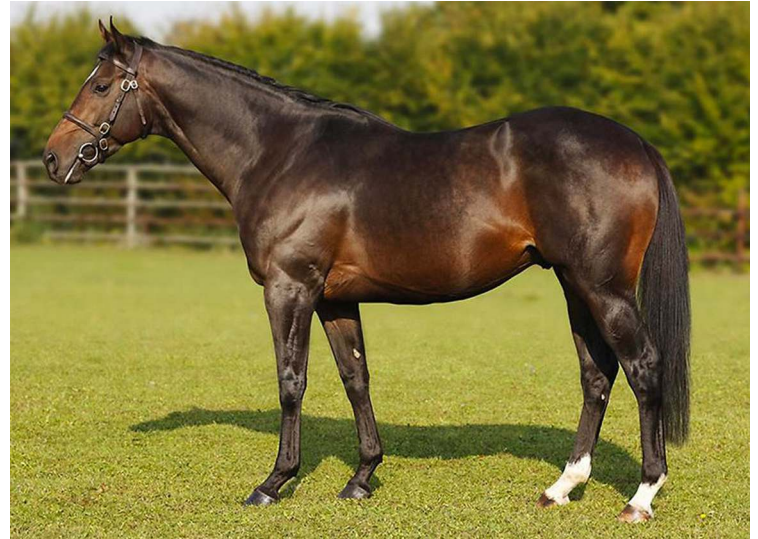
Kamsin | Haras de la Baie

German Derby hero Kamsin (Ger) (Samum {Ger}) has died at the age of 19, Jour de Galop reported on Friday. A resident of Haras de la Baie in 2024, the dual purpose stallion stood for €2,500 this year.