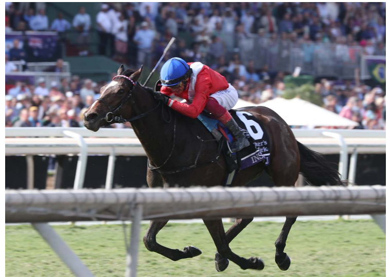
Inspiral