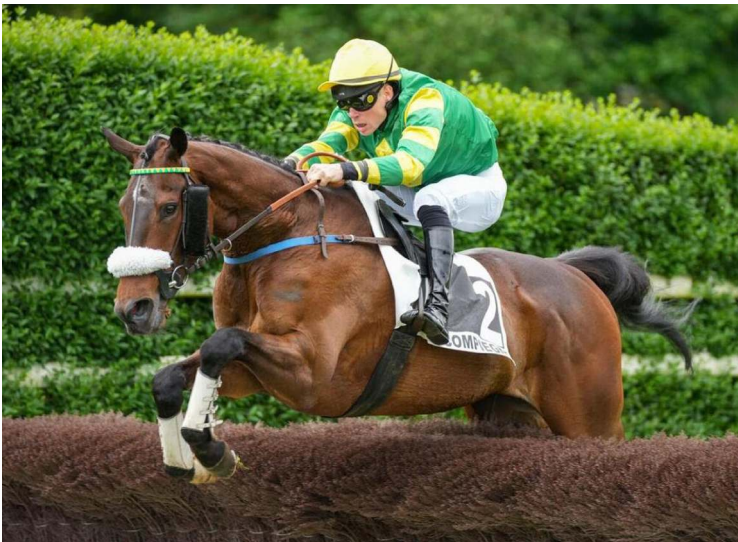
Kissman is one of the wildcard lots | Scoop Dyga