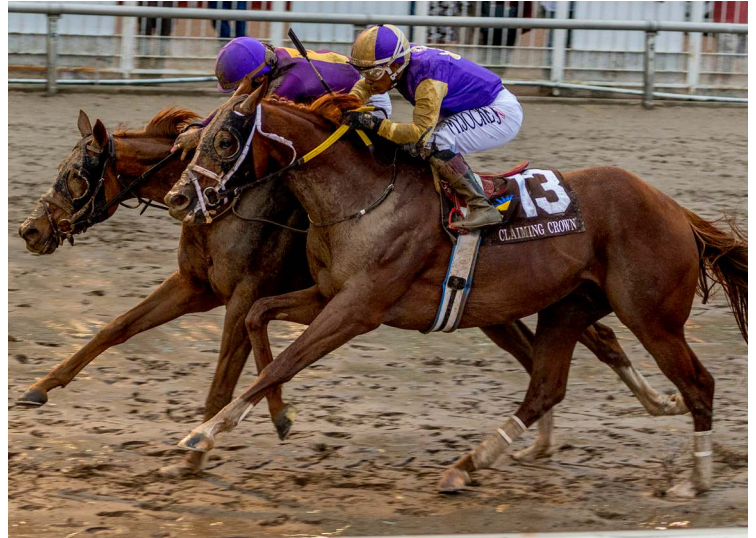
Time for Trouble winning the 2023 Iron Horse