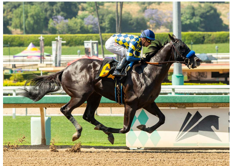
Midland Money

The third 'Rising Star' to come out of the freshman sire class in just 24 hours (joining Win Win Win and Complexity ), Midland Money (Shancelot--Magnolias In Bloom, by Flatter) became his sire's (by Shanghai Bobby) second overall winner Friday with a gate to wire win at Santa Anita.