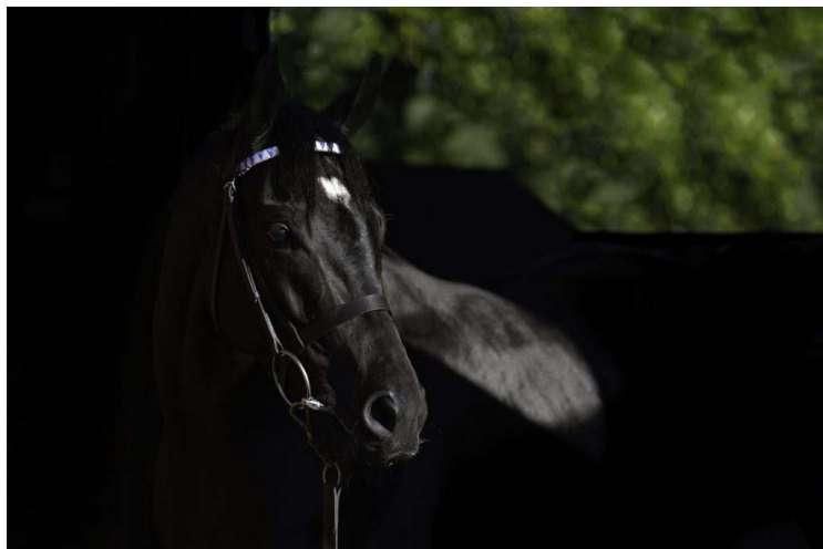
Mohaather has a trio of runners in the UK | Shadwell

42,000gns Tattersalls Somerville Yearling Sale 2023