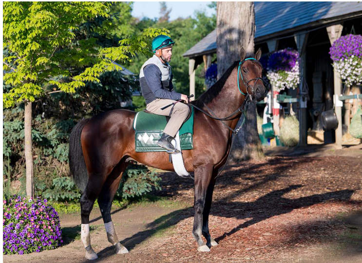
Nutella Fella