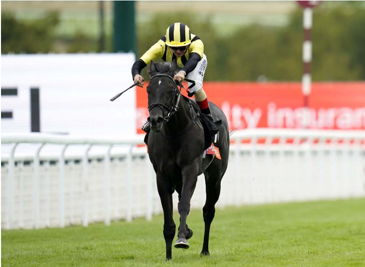
Vandeeek