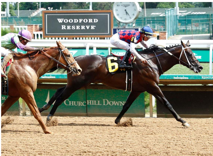
Otto the Conquerer