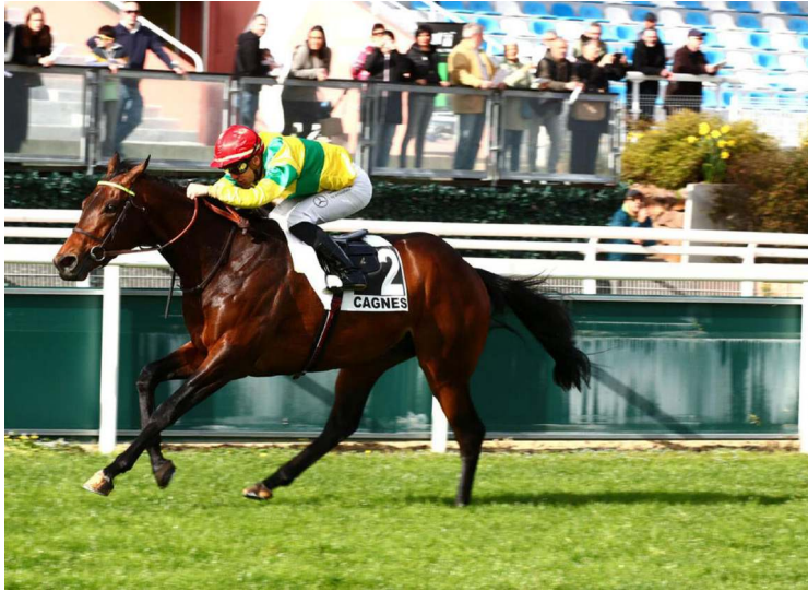
Zweig

Listed winner Zweig (Ire) (Churchill {Ire}) (lot 512) has been added as a wildcard to the Arqana Summer Sale, which is due to take place from July 1-4.