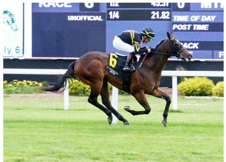
Homie