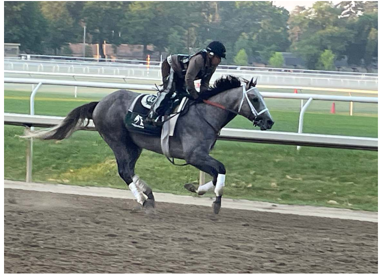
Seize the Grey on the Oklahoma track Wednesday