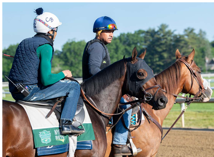
Sierra Leone with his new bit