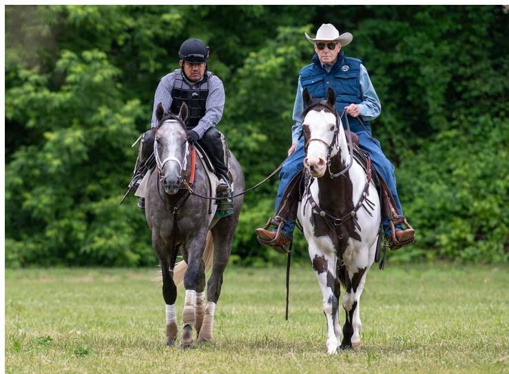
Preakness winner Seize the Grey