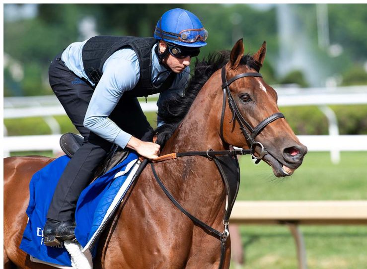
Siskany

A stayer with a very good turn of foot, Siskany needed every yard of the Meydan straight after breaking from a high draw in the Listed Al Khail Trophy in January, coming from third-last to be up on the line. Pouncing from closer range for a second straight victory in the Feb. 23 G3 Nad Al Sheba Trophy, he loomed a wide threat in this year's Dubai Gold Cup, but peaked on his finish 100 meters from home and lost a photo for third