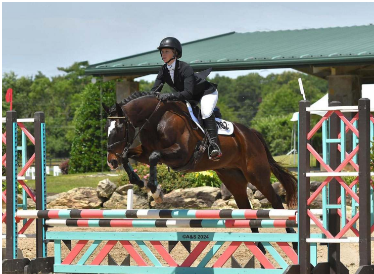
Diamond Bachelor competing | New Vocations