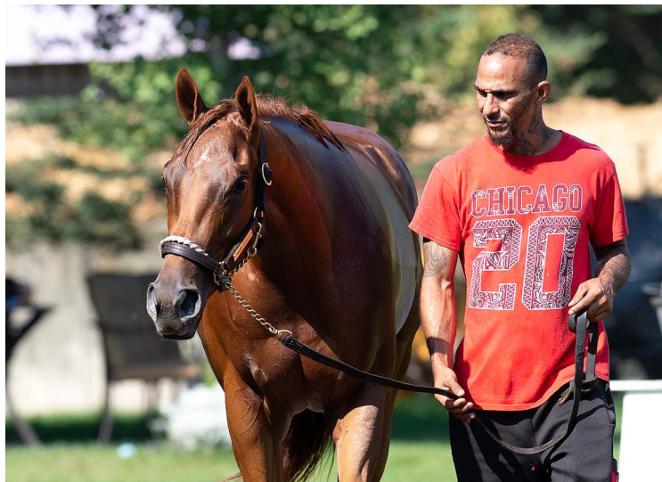
Crimson Advocate

Crimson Advocate ( Nyquist ), who flew in from the U.S. to defeat 25 European fillies in the G2 Queen Mary S. at Royal Ascot last year, will be back in England to contest the five-furlong G1 King Charles III S. (formerly the Kings Stand S.) at Ascot June 19. She will be saddled by John and Thady Gosden and stay on at their Clarehaven Stables for a European campaign.