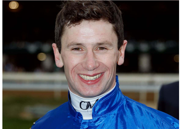
Oisín Murphy