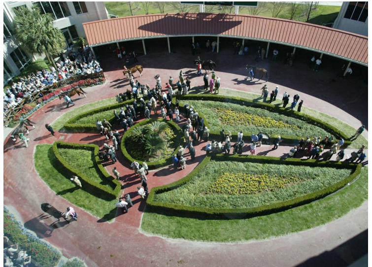
The paddock at Fair Grounds

Louisiana shippers will remain on the vets' list until the horse performs a workout under the supervision of the regulatory veterinarian and demonstrates to the satisfaction of the vet that the horse is sound to race, and until a blood sample is collected from the horse at the owner's expense following the workout and the sample has been reported as negative, the memo says.