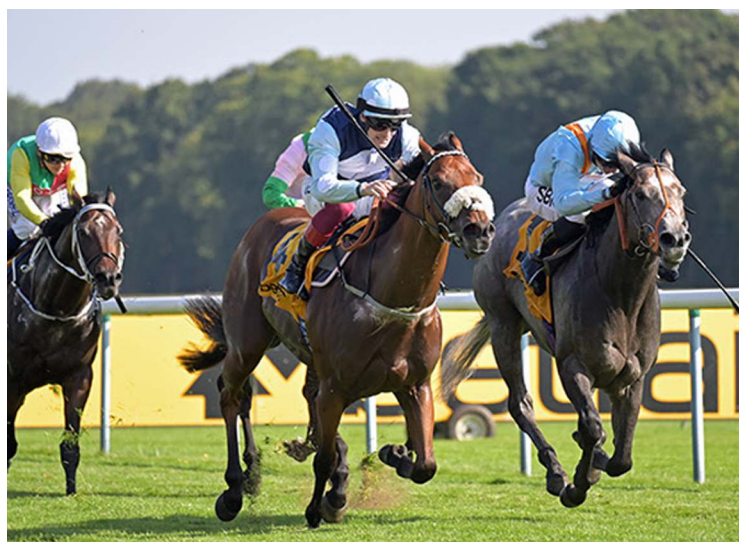
Regional: was sold for just 3,500gns at the July Sale