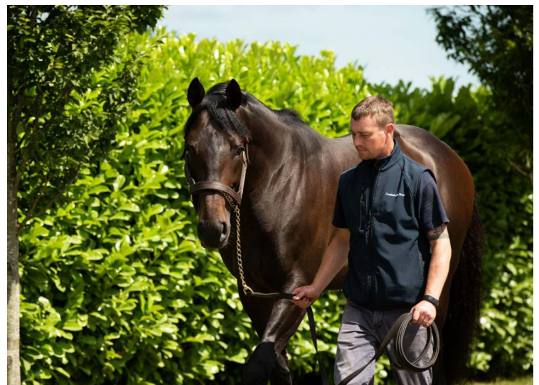
Arizona | Coolmore

Arizona (Ire) (No Nay Never) , Coolmore Stud 66 foals of racing age/0 winners/0 black-type winners 14:35-HAYDOCK PARK, 6f, Green Pursuit (Ire) €65,000 Tattersalls Ireland September Yearling 2023 17:15-CHELMSFORD CITY, 6f, Holbrook (Ire) €11,000 Goffs February Sale 2023; €21,000 Tattersalls Ireland September Yearling 2023