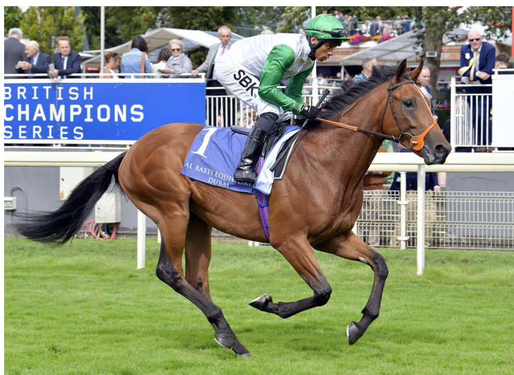
Haatem | Racingfotos.com