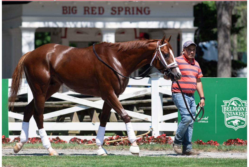
Centennial Farms' Antiquarian ( Preservationist) visits Saratoga's paddock for the first time during a schooling session Wednesday morning. The Gill Peter Pan S. winner starts from post position five in Saturday's GI Belmont S.