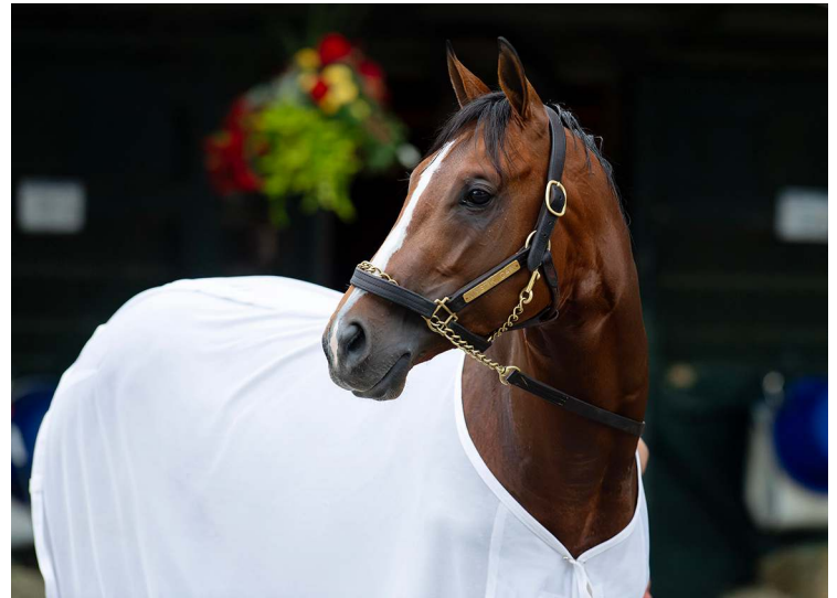
Kentucky Derby winner Mystik Dan at Saratoga Monday