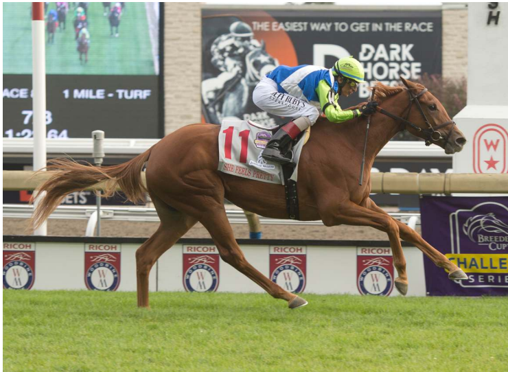
She Feels Pretty