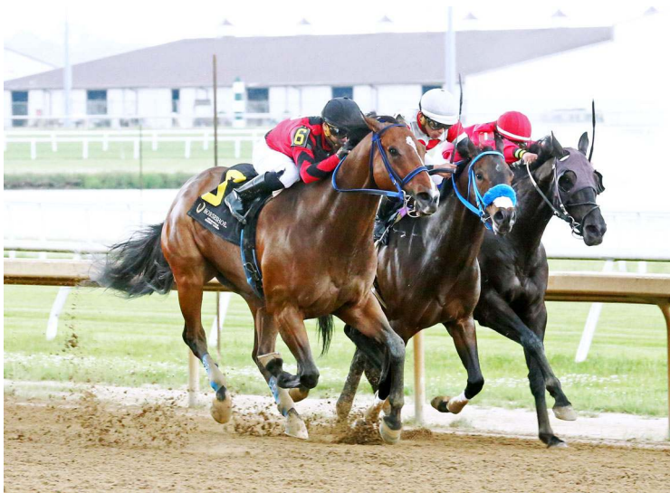
Mr Chaos