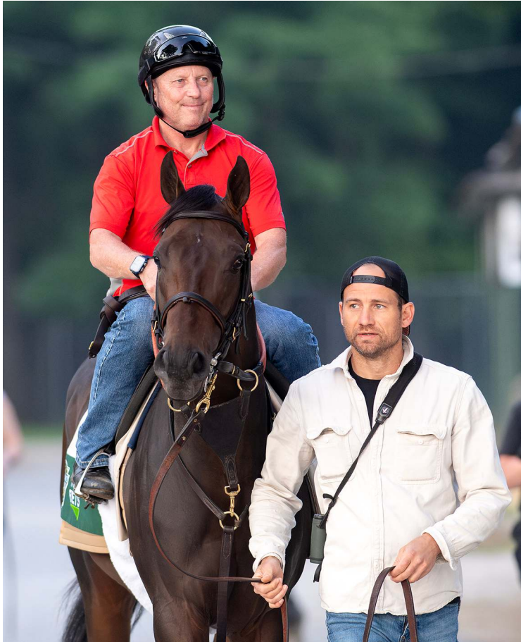
Honor Marie

Protective, third in both the Wood Memorial and Peter Pan, is by Darley's extraordinary sire Medaglia d'Oro , who won the 2002 GI Travers S. over this track and was second in that year's Belmont.