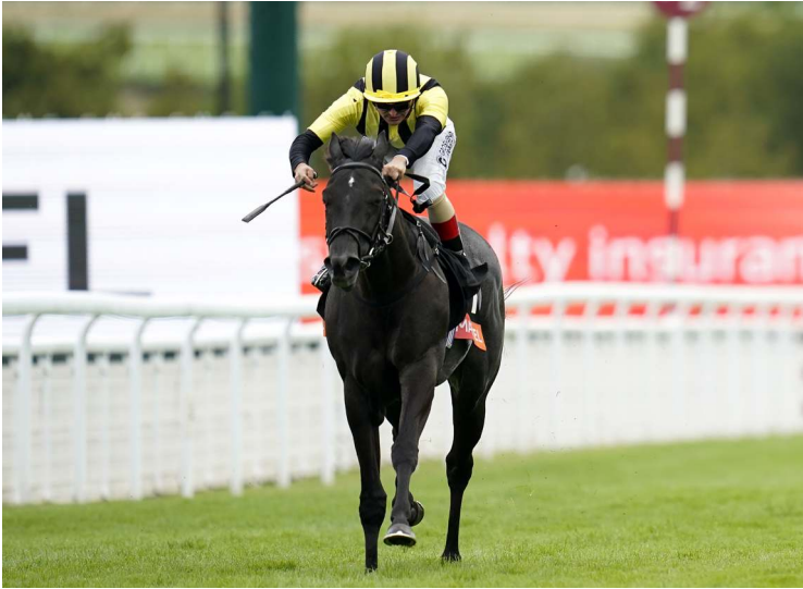
Vandeeek