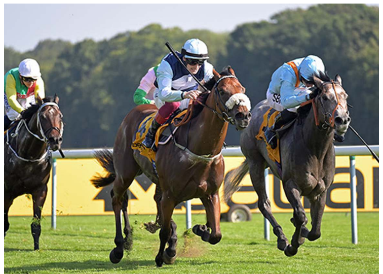
Regional: was sold for just 3,500gns at the July Sale