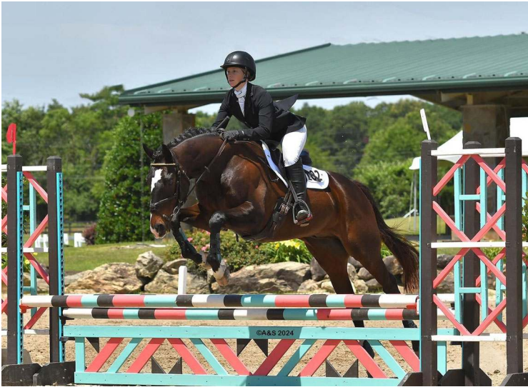
Diamond Bachelor competing