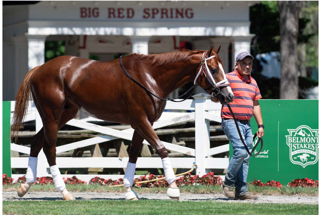
Centennial Farms' Antiquarian ( Preservationist) visits Saratoga's paddock for the first time during a schooling session Wednesday morning. The Gill Peter Pan S. winner starts from post position five in Saturday's GI Belmont S.