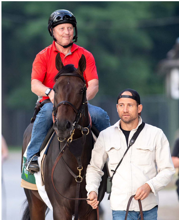
Honor Marie

Protective, third in both the Wood Memorial and Peter Pan, is by Darley's extraordinary sire Medaglia d'Oro , who won the 2002 GI Travers S. over this track and was second in that year's Belmont.