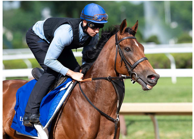
Siskany

A stayer with a very good turn of foot, Siskany needed every yard of the Meydan straight after breaking from a high draw in the Listed Al Khail Trophy in January, coming from third-last to be up on the line. Pouncing from closer range for a second straight victory in the Feb. 23 G3 Nad Al Sheba Trophy, he loomed a wide threat in this year's Dubai Gold Cup, but peaked on his finish 100 meters from home and lost a photo for third