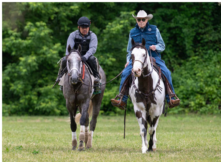
Preakness winner Seize the Grey