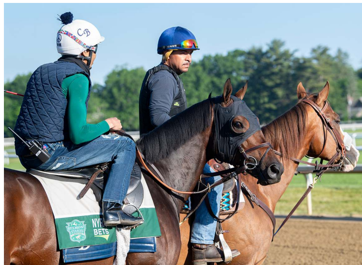
Sierra Leone with his new bit