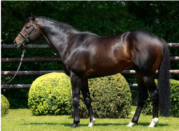
Romanised | Haras de Bouquetot

Yafta (GB) (Dark Angel {Ire}), Haras de la Haie Neuve 24 foals of racing age/0 winners/0 black-type winners 1-MAR.BORELY, 1000m, Spanish Rose (Fr) €10,000 RNA Osarus September Yearling Sale 2023