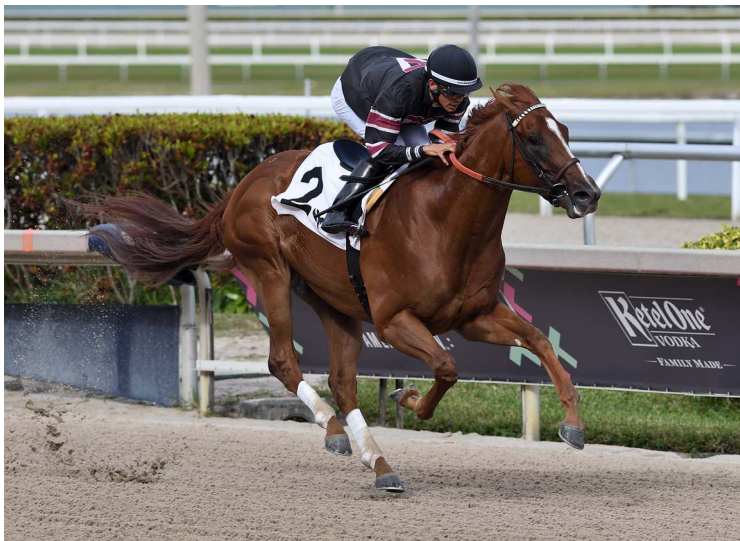
Beeline

The group of sires about to send a third crop of juveniles into the fray is proving a very competitive one, among others featuring Justify , Good Magic and Bolt d'Oro, plus several who appear to be seizing a much narrower chance. The busiest sires in the intake, studmates Mendelssohn and Justify , have so far had 262 and 216 starters, respectively, whereas Army Mule , Girvin and Oscar Performance have muscled into the top 10 (by cumulative earnings) with between 112 and 115 starters apiece. But not even these can match the ratio of stakes winners quietly assembled by Bee Jersey , whose son Beeline became his sixth black-type scorer from just 48 starters in the Hutcheson S. last weekend.