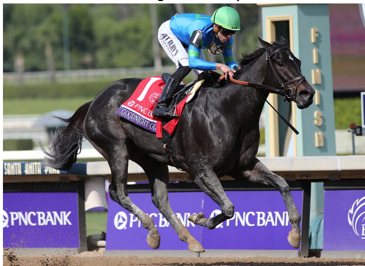
Goodnight Olive, the back-to-back winner of the Breeders' Cup Filly and Mare Sprint, was bred to Not This Time in 2024