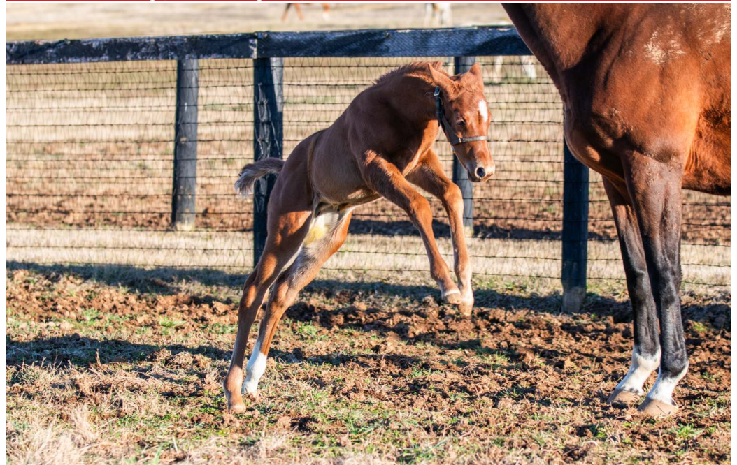
This Curlin filly out of champion Letruska is jumping for joy as sunny skies are on the horizon this week in Lexington. Catch up with the residents of Terrazas Thoroughbreds on page 7