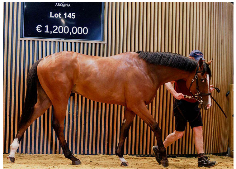
Siyouni's No Retreat topping Arqana's Breeze Up Sale last May

© Copyright Thoroughbred Daily News. This newspaper may not be reproduced in any form or by any means, electronic or mechanical, without prior written permission of the copyright owner, Thoroughbred Daily News. Information as to the American races, race results and earnings was obtained from results charts published by The Jockey Club Information Services and utilized here with their permission.