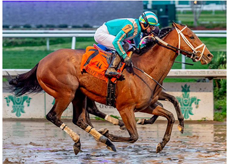
Money Supply became the newest graded stakes winner for Coolmore's Practical Joke in the Mineshaft H.

FOR THE WEEK ENDING FEBRUARY 18, 2024 ACTIVE NORTH AMERICAN-BASED STALLIONS