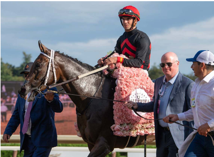
Echo Zulu following the Ballerina

Kept around two turns for the first half of her sophomore season, the bay wired the GII Fair Grounds Oaks, but didn't see out the nine-furlong trip of the GI Kentucky Oaks and finished a close third. Returned to sprint trips for the rest of the season--and her career--she posted a towering victory in the GIII Dogwood S. that September and ran Goodnight Olive ( Ghostzapper ) to 2 1/2 lengths when runner-up in the GI Breeders' Cup Filly & Mare Sprint.