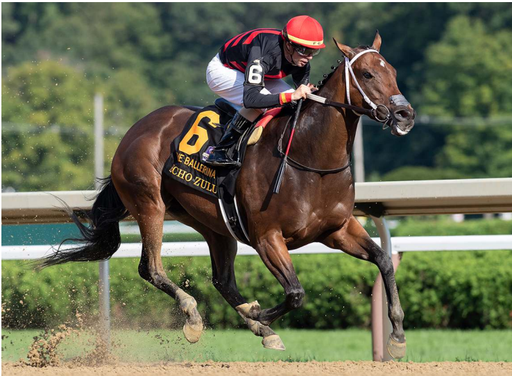
Echo Zulu