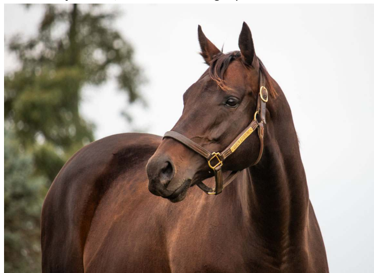
Queen Caroline, the dam of champion Forte, will be bred to Tapit in 2024

Purchased for $500,000 at 2023 Fasig-Tipton November