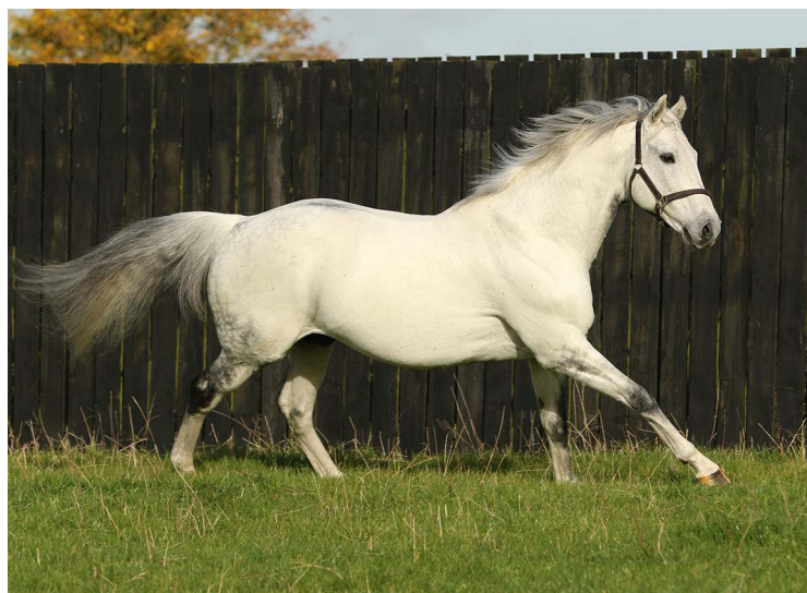
Dark Angel | Yeomanstown Stud