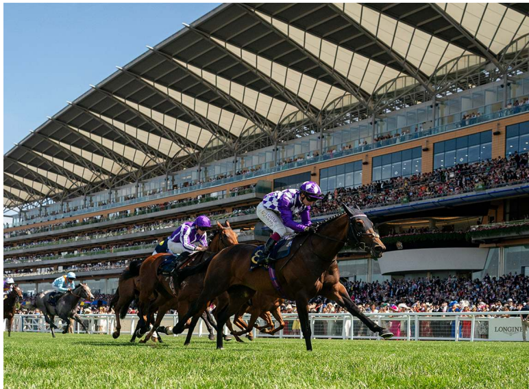
Shaquille winning the 2023 Commonwealth Cup

"So I think it does definitely fill a gap in the Pattern and I would be very sad to lose it as a Group 1 race. I am surprised that it is in danger." Cont. p6