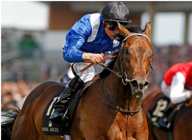
Muhaarar was a brilliant first winner of the Commonwealth Cup