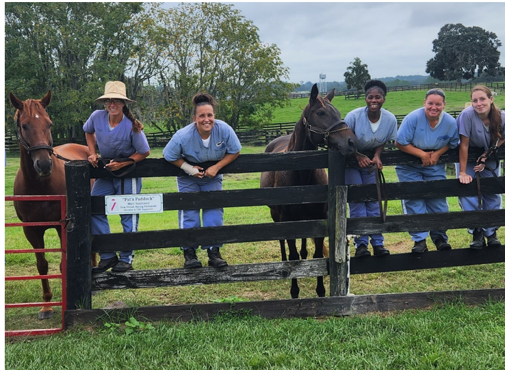
Women in the TRF's Second Chances program at the Lowell Correctional Institute in Ocala, Fl.

didn’t understand the economics of that. Most horse people would have had that same attitude. She explained to me their true value and what these horses do for the inmates.” Cont.