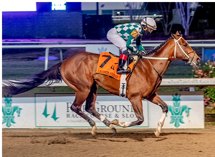
Track Phantom

“I think the Lecomte was as easy on him as you could have wanted it to be, with him still getting something out of it.”