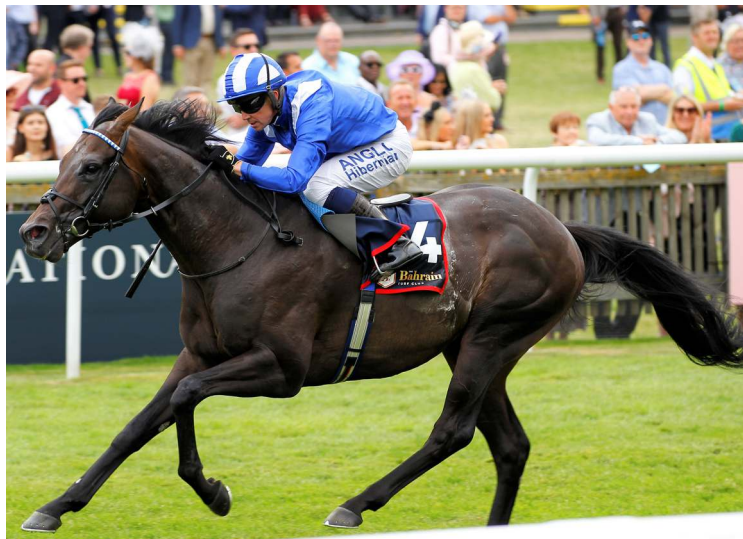
Israr winning the Princess of Wales's

Officials at the Qatar Racing and Equestrian Club announced in early 2023 that the purse for the country's richest Thoroughbred test, the H.H. The Amir Trophy, would be receiving a boost from an even $1-million to $2.5 million. A strong renewal won by the Hong Kong-based former Ballydoyle galloper Russian Emperor (Ire) (Galileo {Ire}) helped to ensure that the 2400-metre contest would be accorded Group 3 status for the 2024 running, and the Amir Trophy has accordingly attracted the most competitive field in the history of the race.