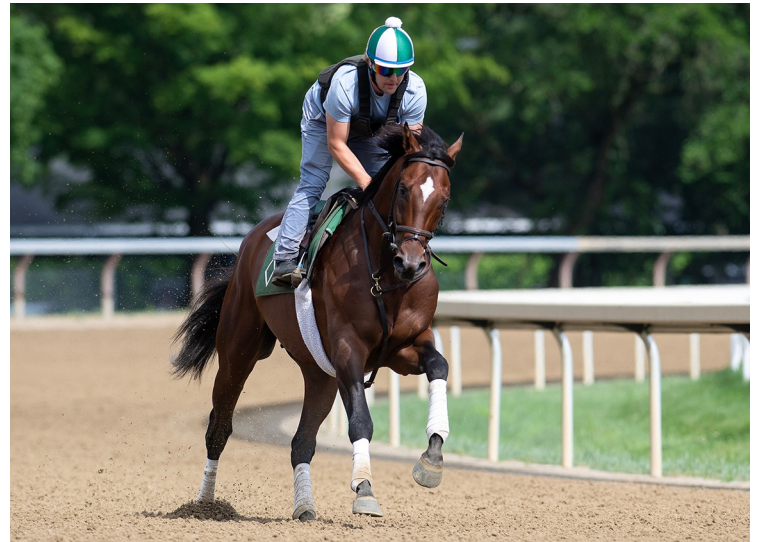
Kentucky-bred Cody’s Wish was named 2023 Horse of the Year

The KTBF was implemented in 2005 to ensure the strength of Kentucky’s equine industry by awarding funds to individuals who choose to breed a Thoroughbred mare in Kentucky.