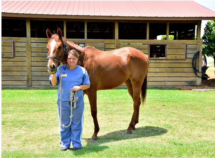
An inmate-caretaker at TRF’s Lowell facility

that the graduates of his program could easily find job at local farms if taught the right skills. The easiest way to find a job would be for them to learn how to prep weanlings and yearlings for the sales.