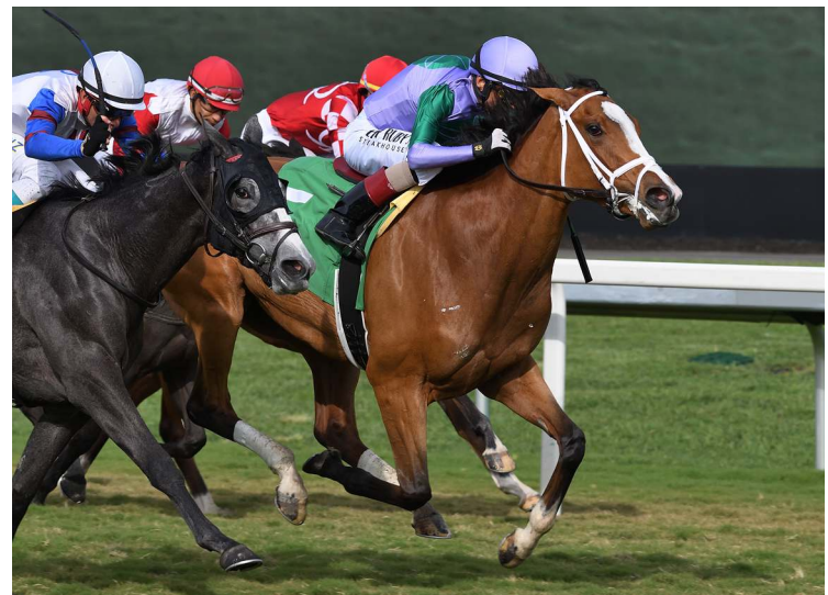
Lady Madonna