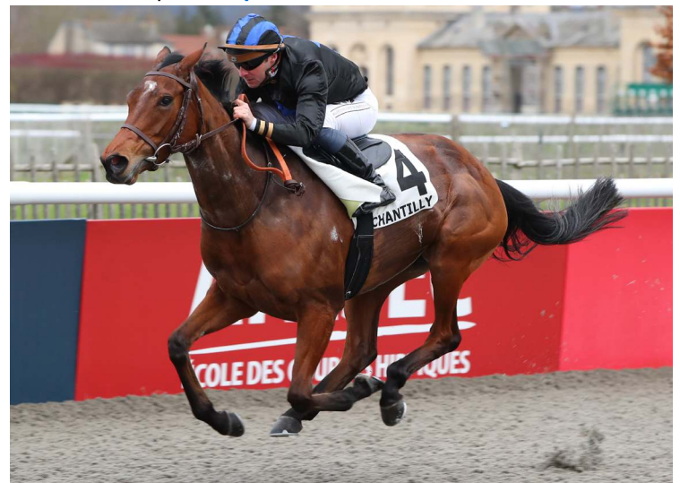
Goa | Scoop Dyga

3rd-Chantilly, €27,000, Mdn, 2-16, 3yo, f, 8f (AWT), 1:37.96, st. GOA (IRE) (f, 3, No Nay Never--Music In My Heart {GB}, by Galileo {Ire}), fifth at Deauville last month, tracked the leading trio early. Sent to the front with 1 1/2 furlongs remaining, the 7-2 second favourite drew away to score by four lengths from Avenue Montaigne (Fr) ( Zarak {Fr} ). The unraced dam, whose first foal was the G2 Wakeful S.-placed Muzyka (Aus) (Danehill Dancer {Ire}), is a full-sister to the G3 Queen's Vase-winning sire Mahler (GB) who was also placed in the G1 St Leger and G1 Melbourne Cup. Cont. p8