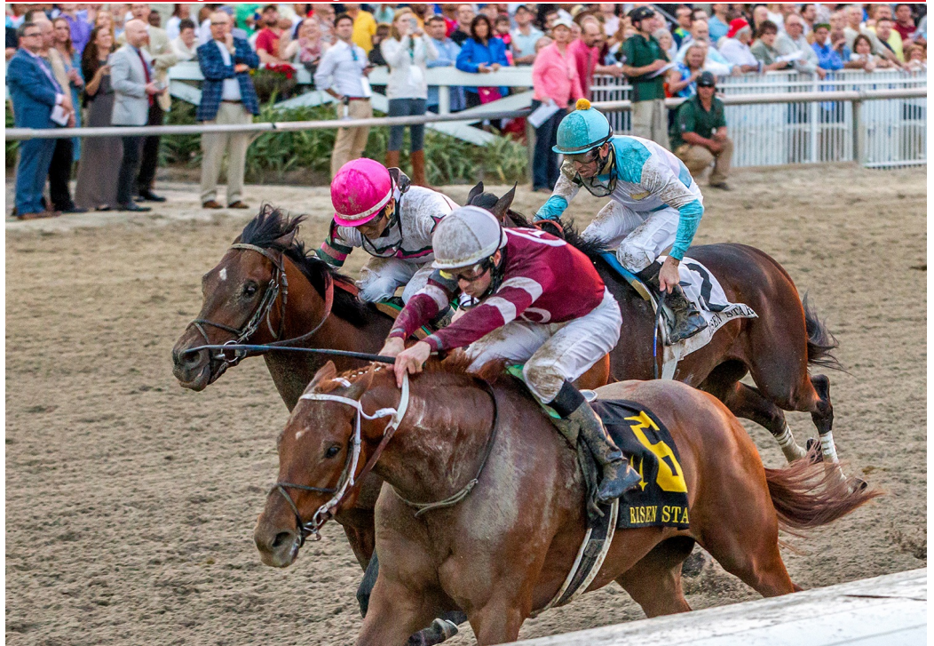
February 20, 2016. Gun Runner wins the GII Risen Star S. Two of his sons, Hall of Fame and Sierra Leone, are entered in Saturday's renewal. See our preview beginning on page 7.