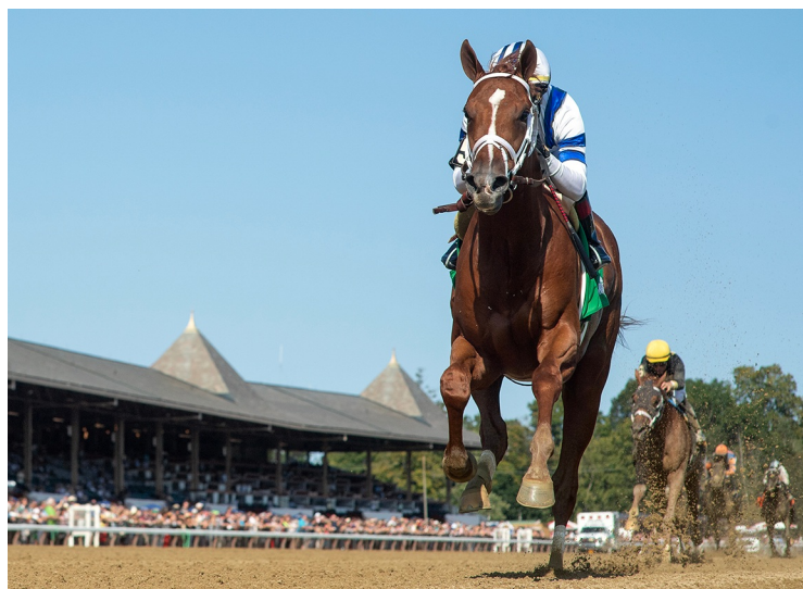
Locked

Fierceness, last year's champion 2-year-old male, kicked off his 2024 campaign with a lackluster third-place finish in the Holy Bull S. in which he was beaten 3 1/2 lengths. Afterward, Pletcher said his next race was up in the air, but confirmed Friday that he will go next in the Florida Derby. Fierceness will have his first work since the Holy Bull next week.