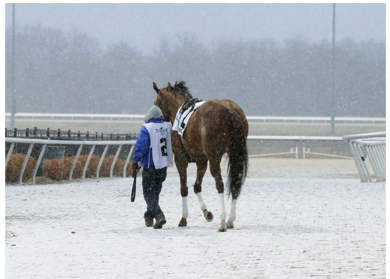
Racing at Turfway Park got rolling Friday night under a blanket of snow

War Front , Lady Madonna, f, 3, o/o Rosalind, by Broken Vow. MSW, 2-16, Gulfstream