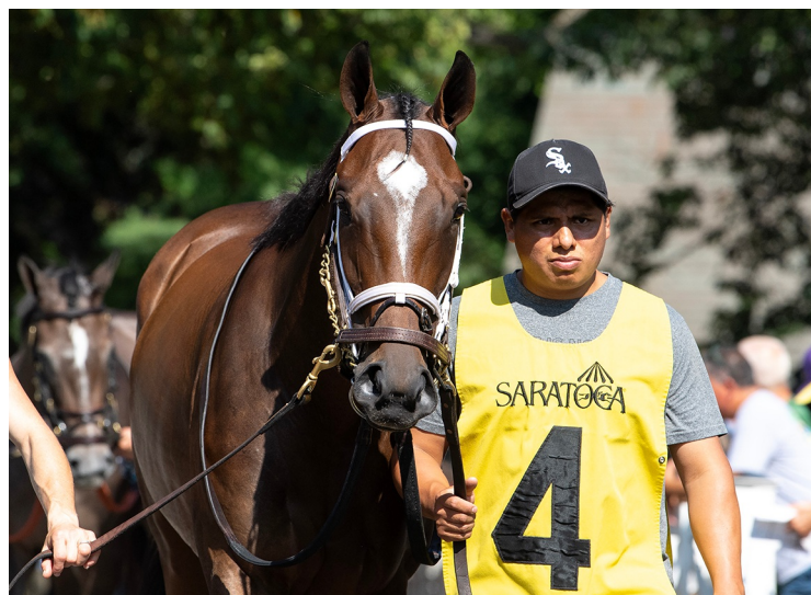
Alpine Princess

The sophomore fillies' counterpart to the Risen Star is named in honor of the romping winner of the 2009 GI Kentucky Oaks and has been an exceptionally productive steppingstone to the first Friday in May. Dating back to 2014, no fewer than four winners of the Rachel Alexandra have gone on to success at Churchill Downs, including ' TDN Rising Star ' Pretty Mischievous (Into Mischief) last year.