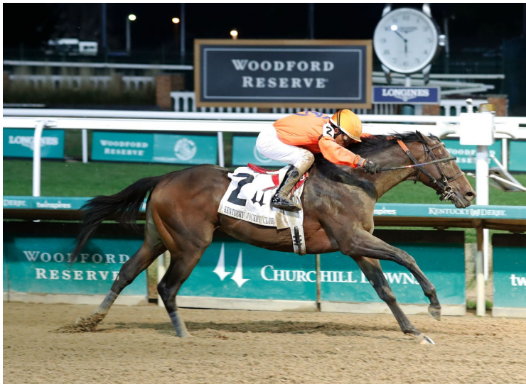
Honor Marie takes down the GII Jockey Club S.