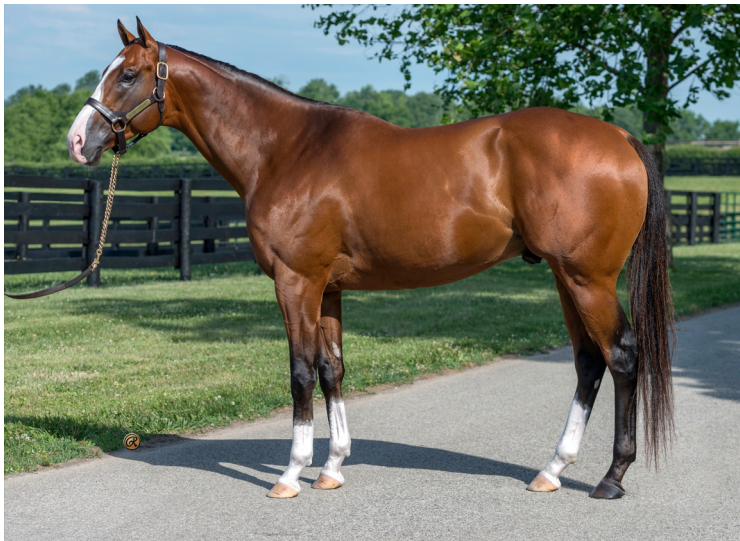
Maximus Mischief

It was Tiz the Law who rallied in his second book, to 218 mares against 131 for Game Winner , and maintained an advantage of 131 against 96 last spring. Cont.