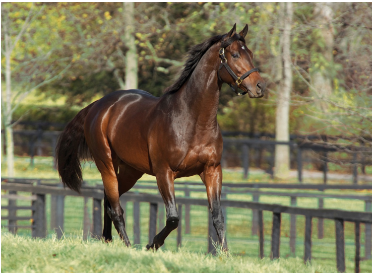
Blame | Claiborne Farm

He's actually had a modest year by his standards, with only three stakes winners, albeit these did include a sixth Grade I scorer in Wet Paint. But his lifetime ratios are extremely solid: 6.5% stakes winners from named foals, 3% at graded stakes level. His ratios are a match for the likes of Munnings , Street Sense and Twirling Candy , to name just three sires too good to be embarrassed by the comparison. And the big news with him over the past couple of years is his precocious emergence as a broodmare sire.