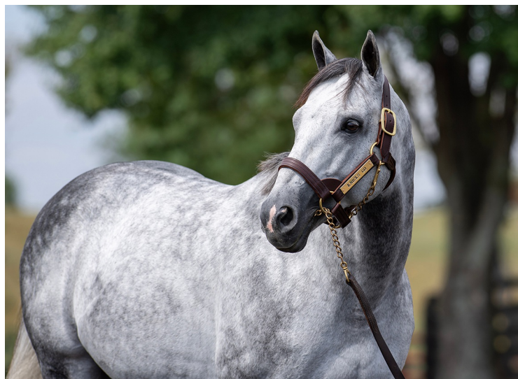
Knicks Go