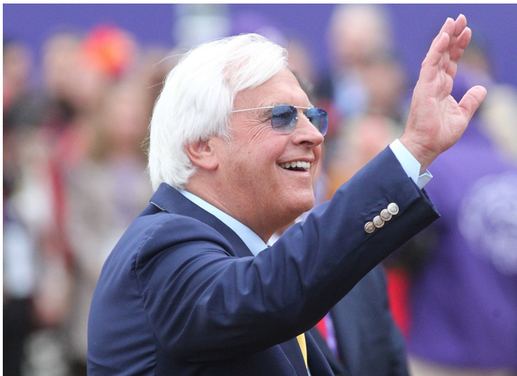
Bob Baffert