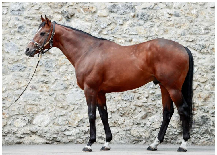
Kessaar | Tally-Ho/De Burgh Productions