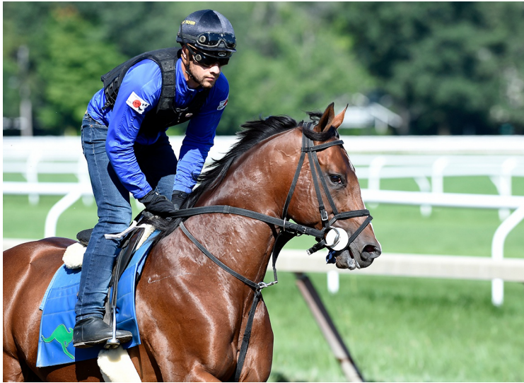
Oscar Performance