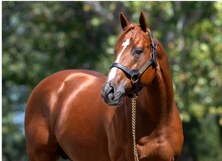
Vino Rosso

He collected a series of stallion-making Grade Is-- Champagne/Florida Derby/Belmont/ Travers--and might well have added the Derby if only it had been run at the normal date in 2020. That makes him look a lot of horse at this money.