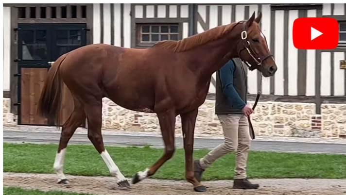
Is Sealiway the Next French Superstar Stallion?