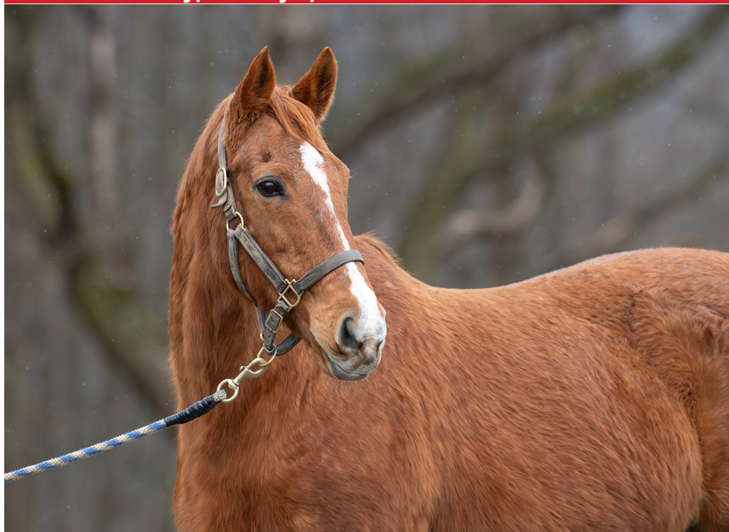
2023 in photos: December 30. MGISW millionaire Megahertz (GB) (Pivotal {GB}) poses for photos last week at Kaz Hill Farm in Middletown, NY. Apostle (GB) (Ulysses {Ire}), the ninth foal out of her full-sister Heaven Sent (GB), makes her debut Wednesday at Kempton. See TDN Europe for more.