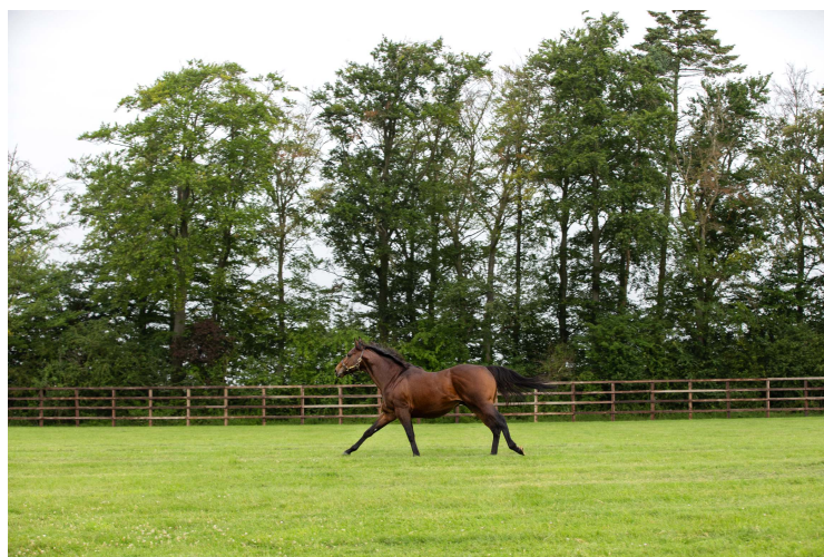
Pinatubo in his paddock

Many of the top industry judges hitched their wagon to Blue Point's wheel last year and we all know how that ended. The same theme developed at the yearling and foal sales last year with Pinatubo and to a similar extent with fellow Darley stallions Earthlight and Ghaiyyath. One thing's for certain: Darley appears to hold all the aces with a view towards this year's first-season sires' championship and, while it is only January, few people will be betting against Pinatubo being a big success. Cont. p5