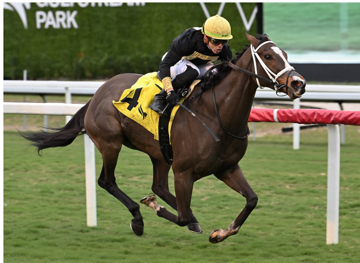
Full Count Felicia became the newest graded winner for Claiborne Farm's War Front in the Suwannee River S.