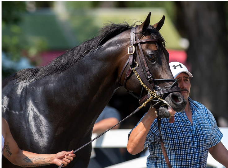
Yaupon

Gun Runner has risen so fast that more affordable sons are finding themselves quickly in the game, and this was one of his breakout stars who beat a 37-year track record in the GI Haskell S.