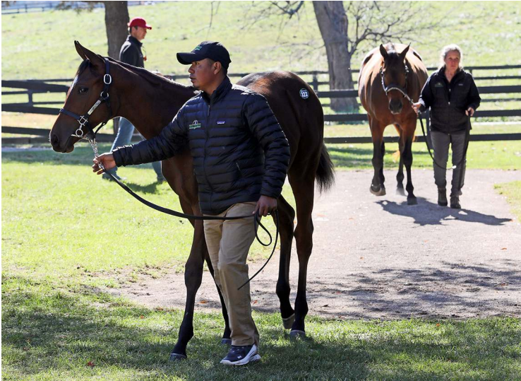
Who's Ticket sells as a weanling