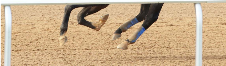
Tanya Showers | Coady Photography

10th-Oaklawn, $115,000, Msw, 12-31, 2yo, f, 1 1/16m, 1:46.52, ft, 5 lengths.