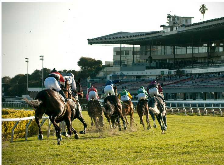
Golden Gate Fields

The betting product also needs to be better and more geared toward the booming market that is made up of sports bettors. The sport has not been nearly aggressive enough when it comes to getting the on-line sports betting websites to start accepting bets on racing. To date, the only one that has been signed up is FanDuel. That also means adopting fixed-odds wagers, which are what the sports bettors know. Only Monmouth Park has gone down this road and two years after it was implemented in New Jersey the concept is limping along. No other tracks or states have tried fixed-odds betting and, in New Jersey, only the second-level tracks are available to the fixed-odds bettors.