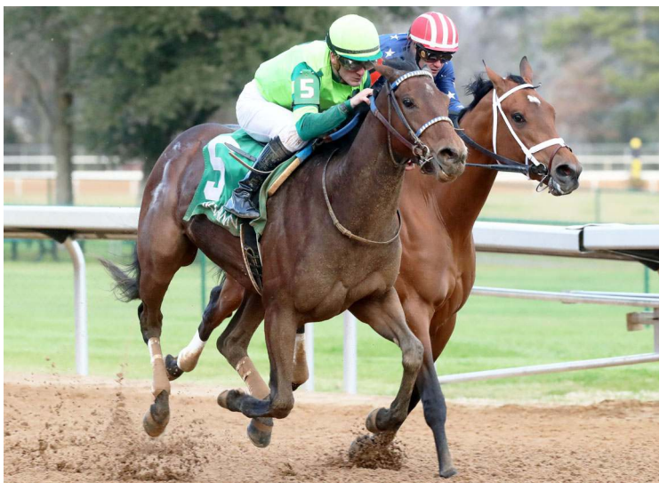
Ice Cold

The winner's dam produced a yearling colt by Omaha Beach and foaled a colt by Bolt d'Oro Apr. 23. She was bred to Jackie's Warrior for 2024. Second dam Elusive Lady (Van Nistelrooy) won the GIII Tempted S. and placed in five other graded races on both dirt and turf. Click for the Equibase.com chart or VIDEO, sponsored by FanDuel TV.