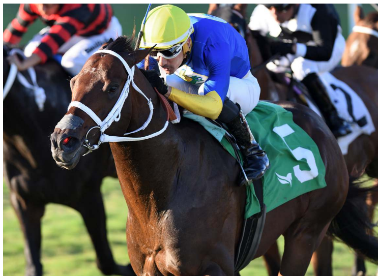
Panther Island | Ryan Thompson

Panther Island came off an eight-month break to win over the Tapeta against optional claimers in Hallandale Dec. 1. The dark bay was bet down from 12-1 morning-line to a 7-1 shot here. The four-year-old raced mid-pack up the backstretch, as favorite Yes I Am Free (Uncaptured) tangled with a couple of longshots. Chasing the pace around the far turn, Panther Island had the two-path open up at the top of the lane and surged ahead to catch the wire. Holiday Blues was purchased for $100,000 at the '21 Keeneland November Sale by Four Pillar Holdings while yearling Stars and Strides ( American Pharoah ) was in-utero. The resulting colt initially sold to Big Bear Bloodstock at the '22 Keeneland November Sale and then went to Pin Oak Stud for $475,000 during '23 Keeneland September Sale. The winner's dam foaled a filly by Frosted Feb. 28 and was bred to Maxfield for the new year. A half-sister to SW Nyuk Nyuk Nyuk (Mutakddim), second dam and Canadian MSW Deputy Cures Blues (War Deputy) also produced MSW Wine Police ( Speightstown ). Click for the Equibase.com chart or VIDEO, sponsored by FanDuel TV.