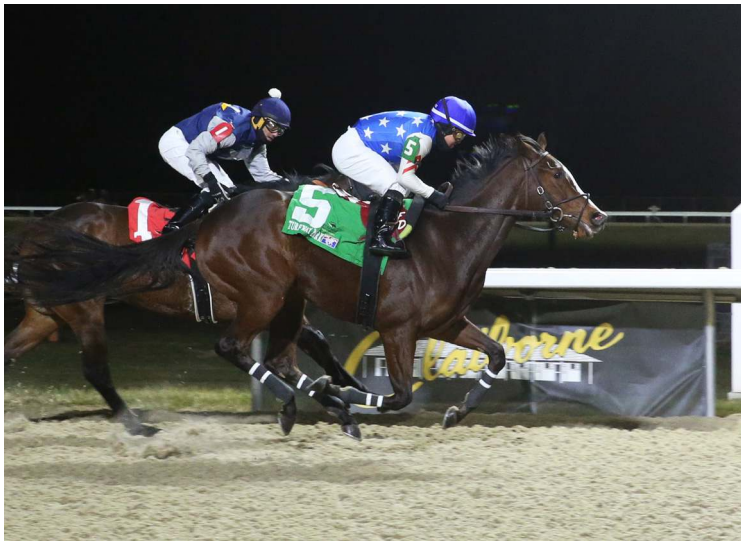
Gallerygal | Coady Photography

4th-Tampa Bay Downs, $32,000, Msw, 12-31, 2yo, f, 1m 40y, 1:42.46, ft, 6 1/2 lengths.