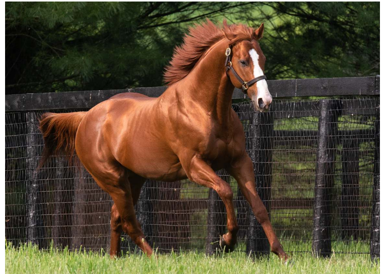
Justify | Coolmore

For the first time in recent memory, Coolmore icon Galileo (Ire) (Sadler's Wells) went through the whole campaign without representation and failed to improve upon his impressive haul of 41.