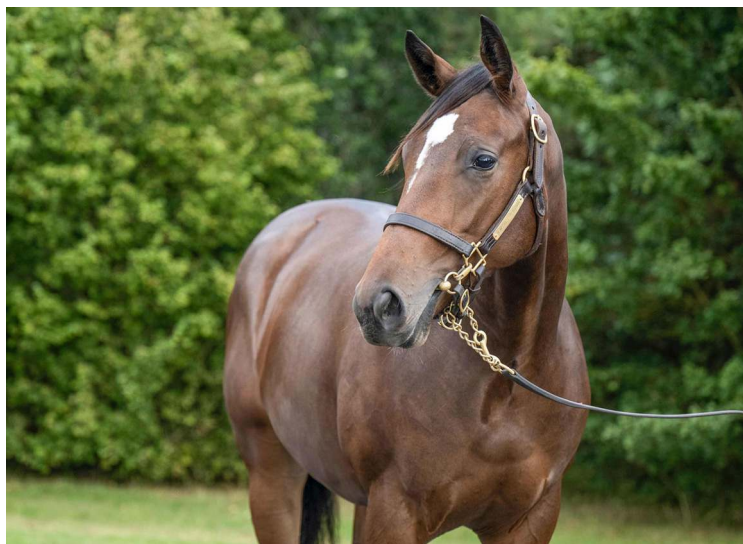
Ylang Ylang | Tattersalls

Unquestionable was highly tried on debut, running third in May's Listed First Flier S., and became his sire's fifth Rising Star when making all to shed maiden status on the Irish 2,000 Guineas undercard, in a six-furlong contest won by the stable's Arizona (Ire) (No Nay Never) in 2019. He subsequently ran fourth in the G1 Phoenix S. and second in the G1 Prix Jean-Luc Lagardere before setting the seal on his six-race juvenile campaign with victory in the G1 Breeders' Cup Juvenile Turf. The €340,000 Arqana August yearling, who hails from the family of sires Cityscape (GB) (Selkirk) and Bated Breath (GB) (Dansili {GB}), retains entries in May's G1 Irish 2,000 Guineas and June's G1 Irish Derby.