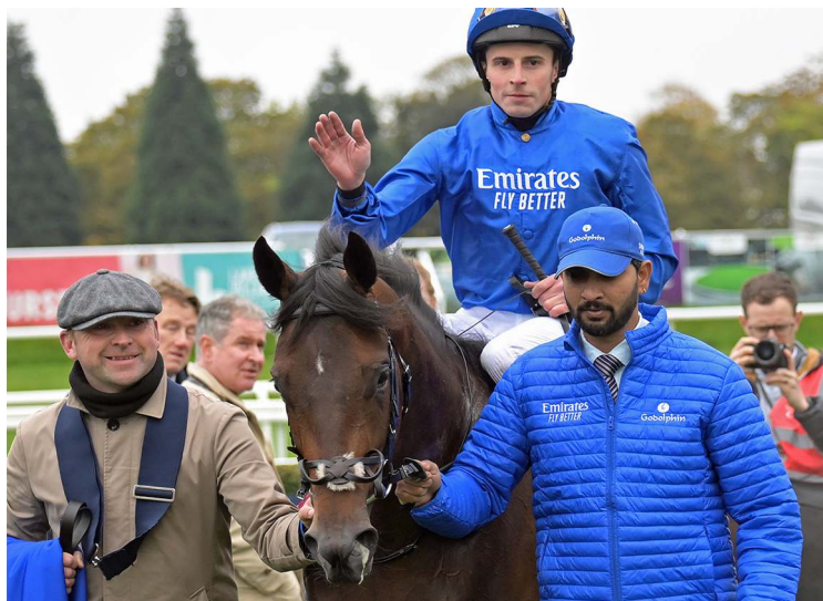
Ancient Wisdom and champion jockey William Buick