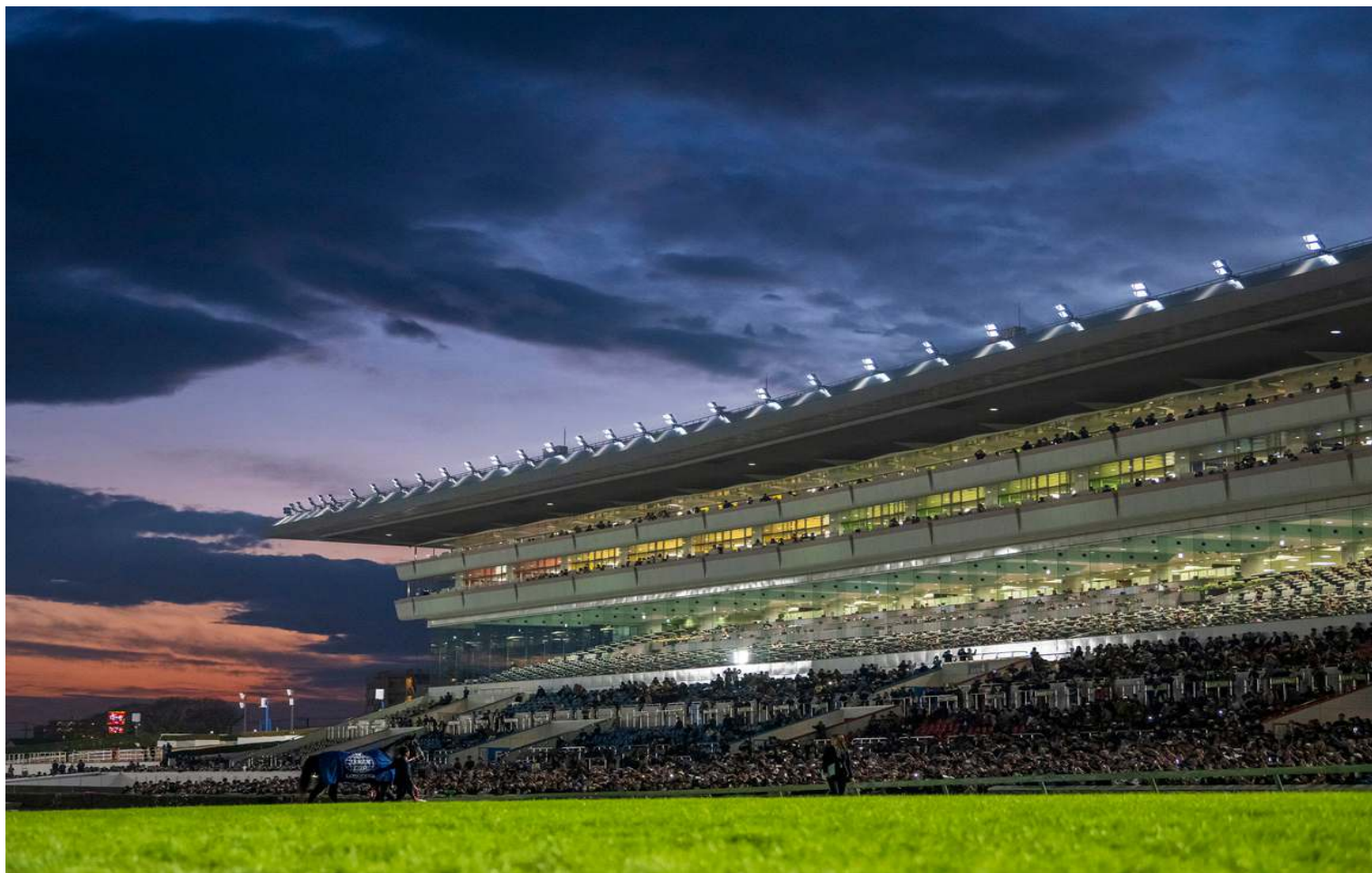
Equinox, sent away to his retirement after a JRA-planned ceremony fit for a king, was paraded before a sea of the faithful the week before Christmas at Nakayama