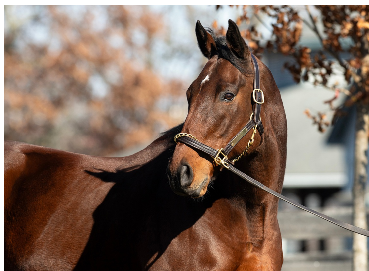
Roy H

It was an exciting year at the Horse Park in 2023 at the Hall of Champions. It was a bit sad during the summer that we lost two great Thoroughbreds in Hall of Famer Point Given and dual Classic-winning Kentucky Derby winner Funny Cide, but we were recently able to add two Breeders' Cup winners in Roy H--a two-time Breeders' Cup Sprint winner and two-time Eclipse Award winner--and Accelerate , one of the more exciting horses of the last 10 years, a five-time Grade I winner who won almost $7 million.