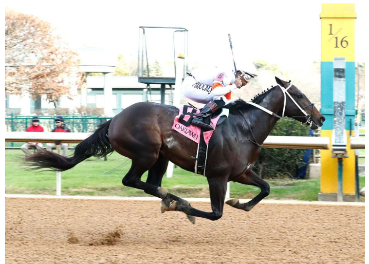
Carbone | Coady Photography