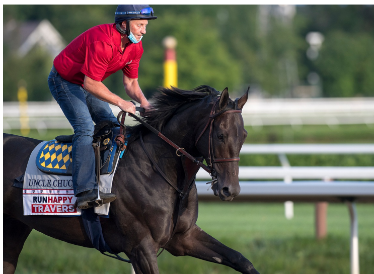
Uncle Chuck