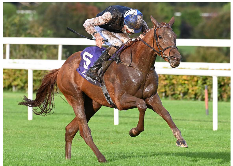
Moyglare Stud's Elizabeth Jane