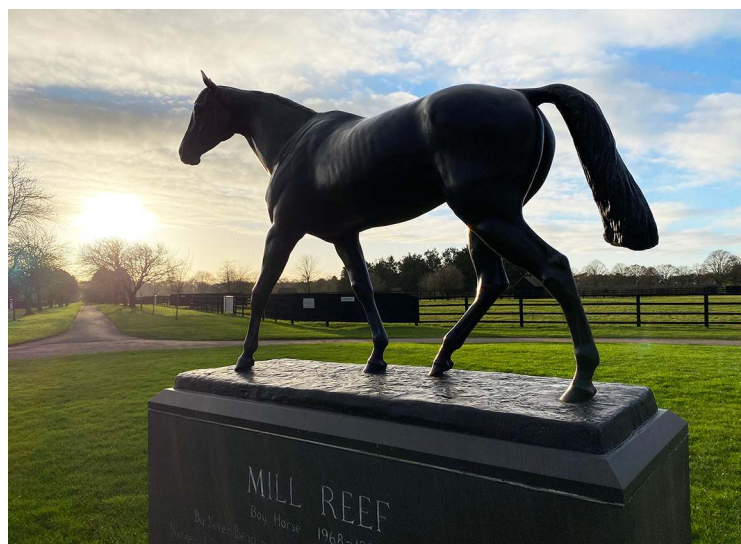
Mill Reef's statue at the National Stud

From a personal perspective, one of the only occasions to have brought proper joy following the death of my father in February was our horse Dereham winning at Newmarket for the second season in a row. It was an inconsequential race in the grand scheme, but to win at our home track with a homebred was special. I don't think the Jockey Club will be planning a retirement ceremony for him, but I might start to lobby for one if he wins that same race for a third time in 2024.