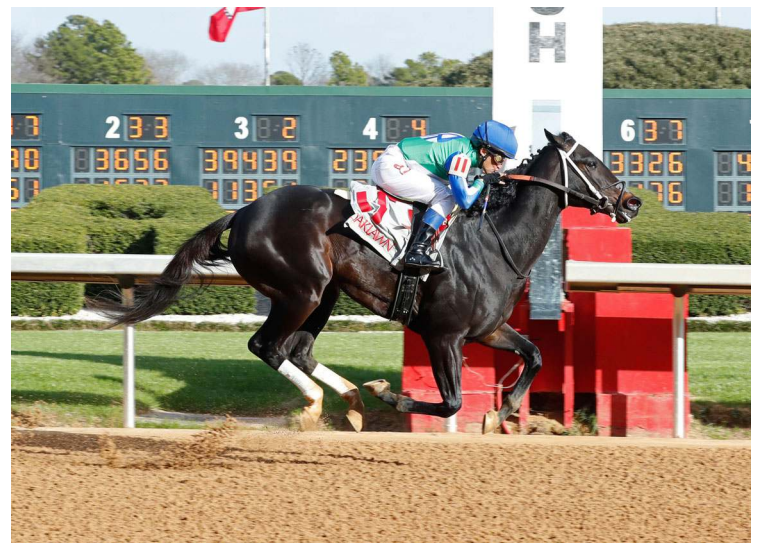
Time for Truth

1st-Oaklawn, $115,000, Msw, 12-31, 2yo, f, 6f, 1:11.44, ft, 1 3/4 lengths.