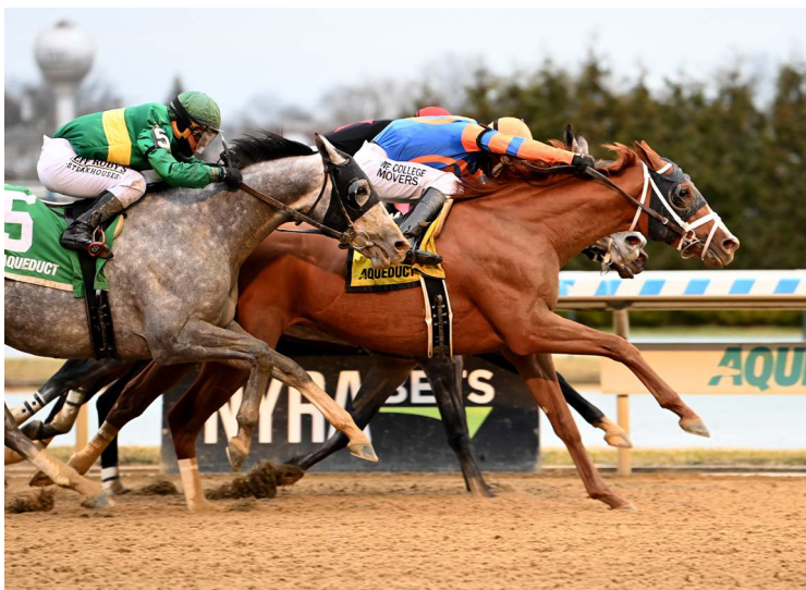
Crupi

Don'tforgetaboutme, purchased by Determined Stud for $550,000 while in foal to Blame at the 2022 Keeneland November sale, produced a colt this year and was bred back to Candy Ride (Arg) . The mare is a half-sister to graded winners Mo Tom ( Uncle Mo ) and Red Ruby (Tiznow), and to multiple Grade I placed Beautician (Dehere). Click for the Equibase.com chart or VIDEO, sponsored by FanDuel TV.