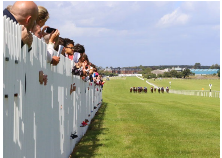
Ireland's Naas Racecourse | Racing Post

The procedures, developing by HRI in consultation with the Irish Horseracing Regulatory Board, must be undertaken by all racecourses hosting fixtures. A series of educational webinars will be announced next week to further assist understanding.