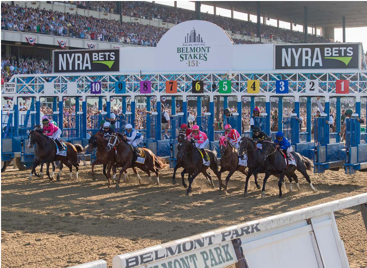
They're off in the Belmont Stakes!