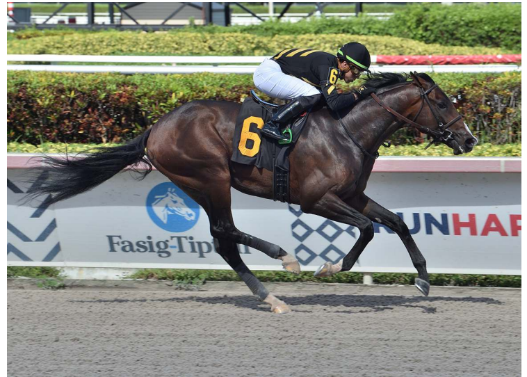
Casino Grande