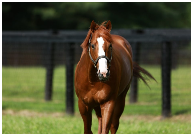
Justify