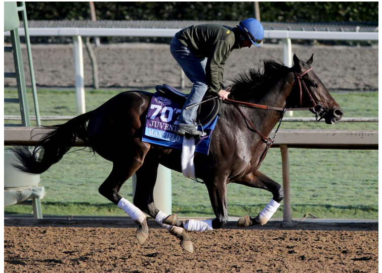
Maxfield

Major Fed (Ghostzapper), second in the GII Risen Star S. and fourth after a slow start in the GII Louisiana Derby, completed his last major workout on Saturday morning at Churchill Downs with a half-mile move in :51.40 (16/16) prior to taking aim at next Saturday’s GIII Matt Winn S. Meanwhile, 72 miles east of Churchill Downs, unbeaten GI Claiborne Breeders’ Futurity winner Maxfield (Street Sense) worked a swift half-mile in :47.20 (3/22) at Keeneland.