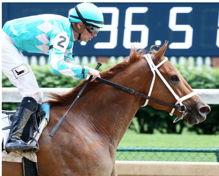
Monomoy Girl