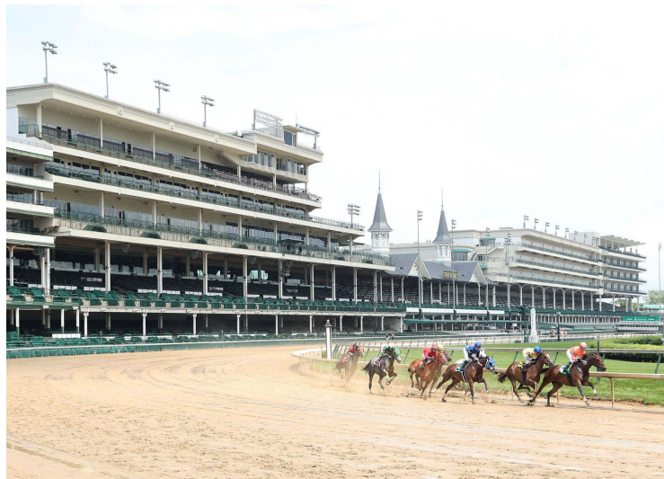
Spectator-free racing beneath the Twin Spires