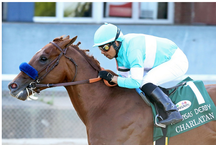
Charlatan is among the favourites for the Kentucky Derby