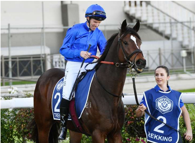
Trekking