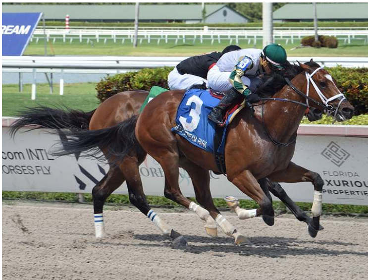
Double Crown | Coglianes

Also Ran: Ournationonparade, Cajun Casanova, Ricki Ticki Taffi.