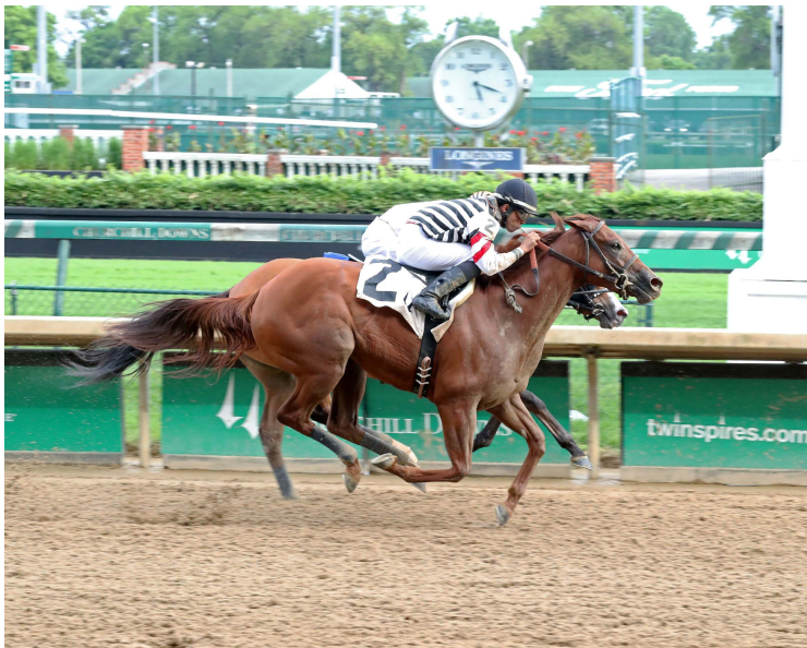
Reagan's Edge | Coady

8th-Churchill Downs, $80,700, Alw, 5-16, (NW1X), 3yo/up, 1m (off turf), 1:36.17, ft.