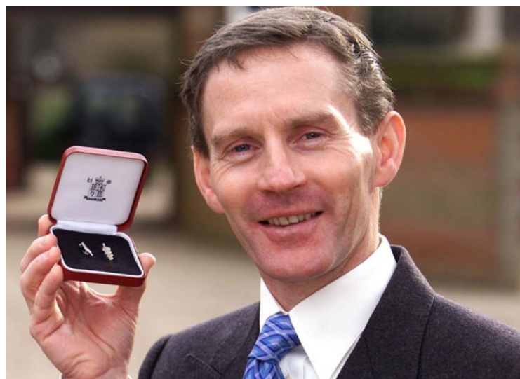
Ray Cochrane with The Queen's Commendation For Bravery he received for pulling Frankie Dettori from a burning plane