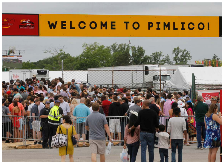
Preakness Day

Stronach issued a statement, which read: “We all wish we could have been together today to celebrate the Preakness but we stayed home and stayed safe and now we can look forward to Preakness 145 on Oct. 3,” Belinda Stronach, the chairman and president of TSG, said. “I would like to thank Governor Hogan and all of the state and local leaders along with our industry stakeholders, racetrack communities and partners, including our broadcast partner NBC Sports , for the ongoing support and commitment to racing in Maryland.”