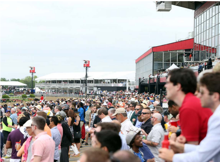
Preakness Day

To run the Belmont in its traditional spot in the Triple Crown order, the race would have to be squeezed between the Preakness and the Nov. 6-7 Breeders' Cup. It's difficult to imagine NYRA choosing that spot on the calendar. Another option would be to run the Belmont after the Breeders' Cup, meaning it would have to be run at Aqueduct and during a time of year when weather could be an issue. That also seems like an unlikely option.