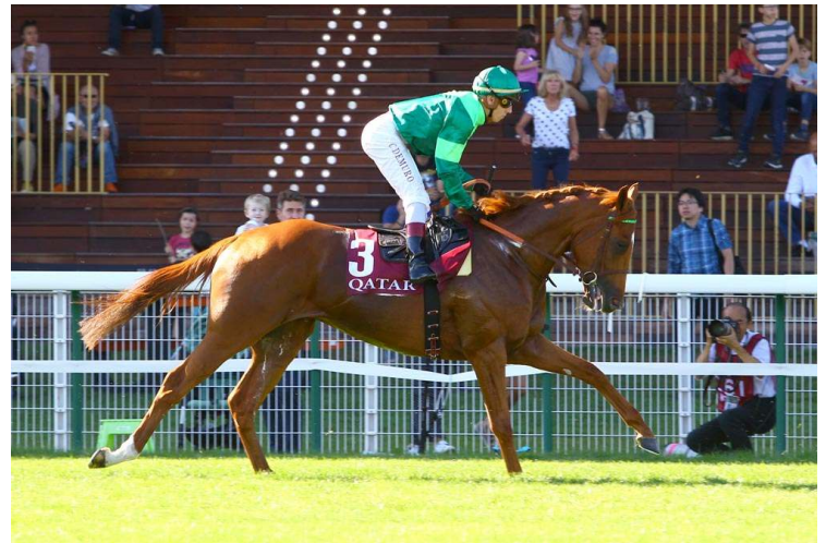
Sottsass

La Motteraye Consignment brings a colt and filly, respectively, to the Deauville ring-- lot 4 from GSP Zut Alors (Ire) (Pivotal {GB}) and thus a half-brother to Classic heroine Precieuse (Ire) (Tamayuz {GB}); and the first foal out of MGSW Realtra (Ire) (Dark Angel {Ire}) ( lot 203 ). Another with an appealing international pedigree is Haras des Capucines filly lot 54 , the daughter of listed winner Come to Heel (Ire) (Elnadim), herself a full-sister to the GSW Pasar Silbano (Ire) (Elnadim), dam of GSW & MG1SP Zousain (Aus) (Zoustar {Aus}). G1 Falmouth S. heroine Giofra (GB) (Dansili {GB})'s filly ( lot 100 ) will be offered by Haras de la Perelle.