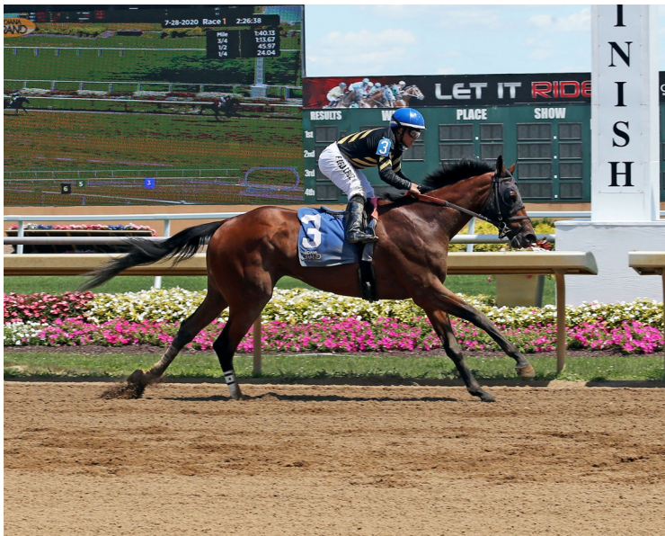
Uncle Kick | Coady

UNCLE KICK (g, 4, Uncle Mo--Firefly, by Tapit) , eighth debuting at six furlongs May 17 at Churchill, improved two spots when stretched out to a sloppy mile there June 21 and was backed down to even-money in this two-turn bow. Jostled on both sides at the start, the homebred traveled second-last behind a :24.04 quarter, overtook the pacesetter in hand five-sixteenths from home and steadily drew clear from there to romp by eight lengths under wraps. Cielo Azul (Misremembered) was second at 30-1. The winner's dam, bought with him in utero for $260,000 at Keeneland November in 2015, is a half-sister to the speedy GSW La Traviata (Johannesburg), who in turn produced MG1SW Seventh Heaven (Ire) (Galileo {Ire}) and G1SW Crusade (Mr. Greeley). Firefly is responsible for a juvenile Distorted Humor filly and a yearling colt by Arrogate. Lifetime Record: 3-1-0-0, $20,392. Click for the Equibase.com chart. O/B-Calumet Farm (KY); T-Jose Fernandez.