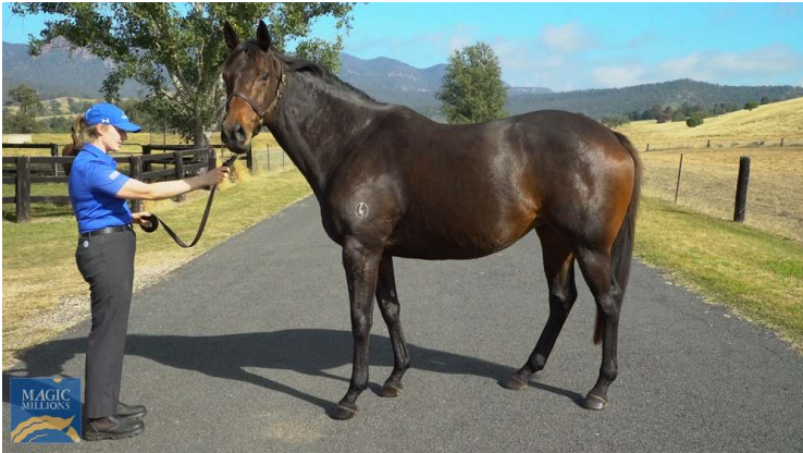
Right Cord | Magic Millions