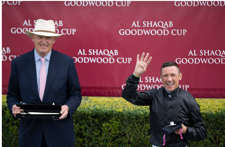
John Gosden & Frankie Dettori all smiles after their win