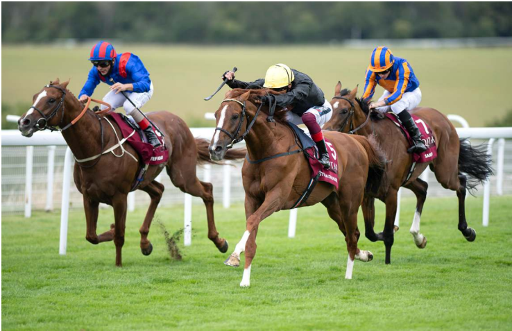
Stradivarius