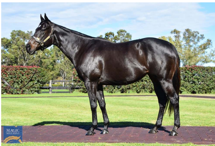
Solar Girl in foal to The Autumn Sun | Magic Millions