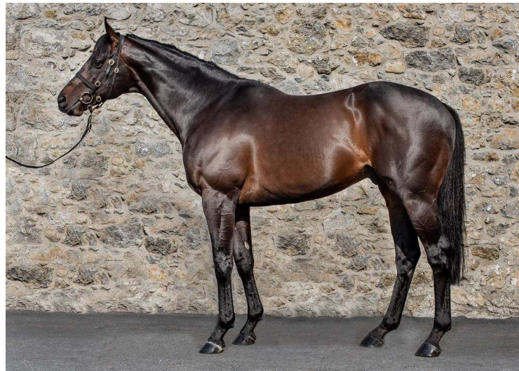
Vadamaos is aiming for a third winner at Thirsk on Wednesday.

Prince of Lir (Ire) (Kodiac {GB}), Ballyhane Stud 77 foals of racing age/4 winners/1 black-type winner 15:45-GOODWOOD, 5f, LADY AMALTHEA (Ire) €1,000 RNA Goffs February Mixed Sale 2019; 15,000gns Tattersalls Guineas Breeze-Up Sale 2020