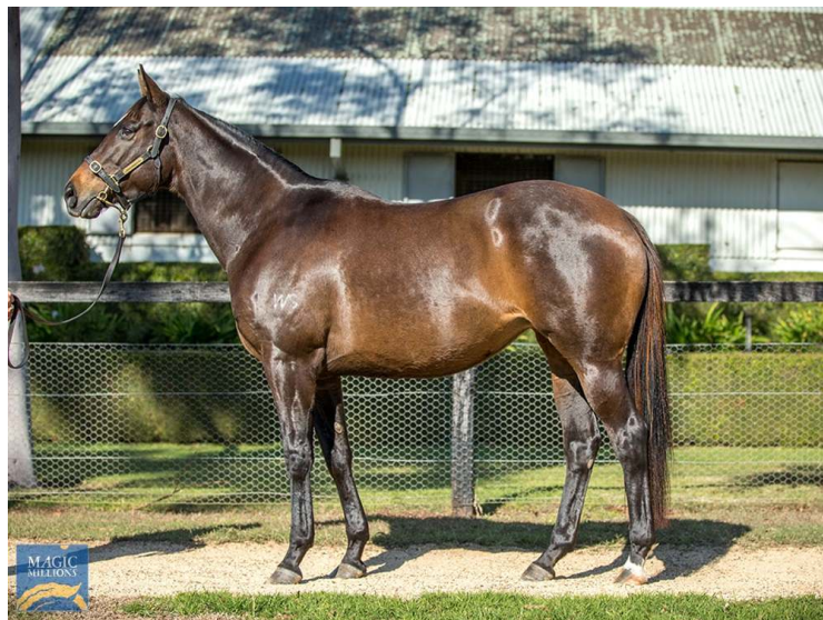
Mark Two | Magic Millions