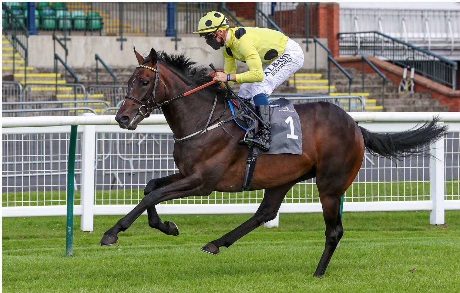
Cairn Island, from the family of Canadian Horse of the Year Arravale, graduated at third asking on Tuesday.

Twilight Son (GB) (Kyllachy {GB}), Cheveley Park Stud 122 foals of racing age/2 winners/1 black-type winner 16:30-THIRSK, 5f, PENOMBRE (GB) 18,000gns Tattersalls December Foal Sale 2018; 25,000gns Tattersalls October Yearling Sale 2019 - Book 3