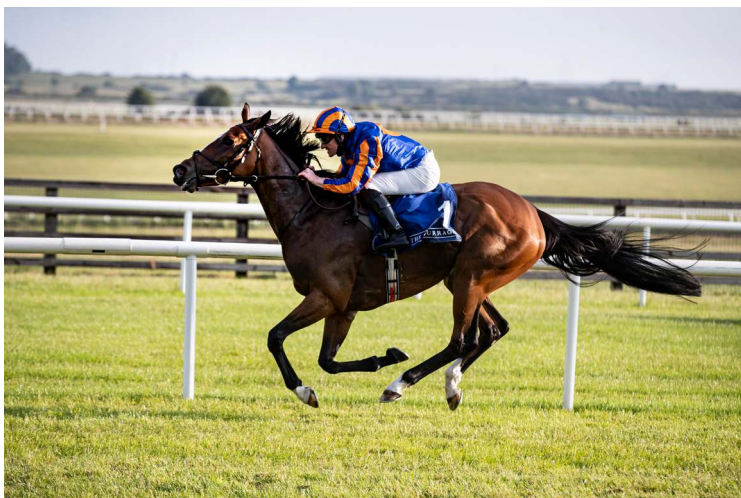
Magic Wand | Racing Post