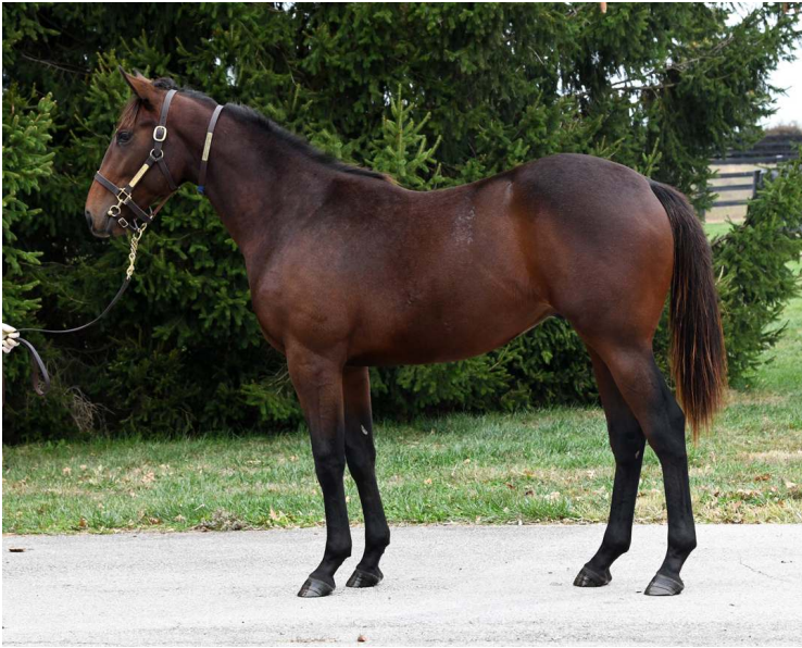
Battleground as a yearling

He added, "We think he will be a miler. He is a strong traveller, but he is by War Front, and being out of Found we thought he might get a mile and that is what we would be hoping for. Obviously all the 2-year-olds got a little bit messed up, with the start of the season not being there, and then we had to rush some of them to get them to Ascot. A lot of stuff wasn't ideal, but he was lovely. It is very early for horses. Some will improve, some will stand still and some will go back, but we are delighted with this horse."