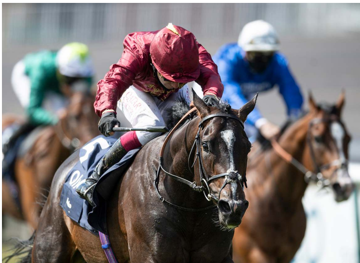
Kameko | Racing Post