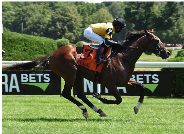
Decorated Invader claims the GII National Museum of Racing Hall of Fame S.

Even with such a lengthy collection of victories, the Virginia resident still has yet to join her colt in the winner's circle.