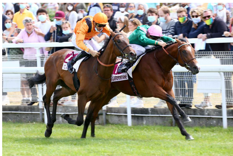
Darkness