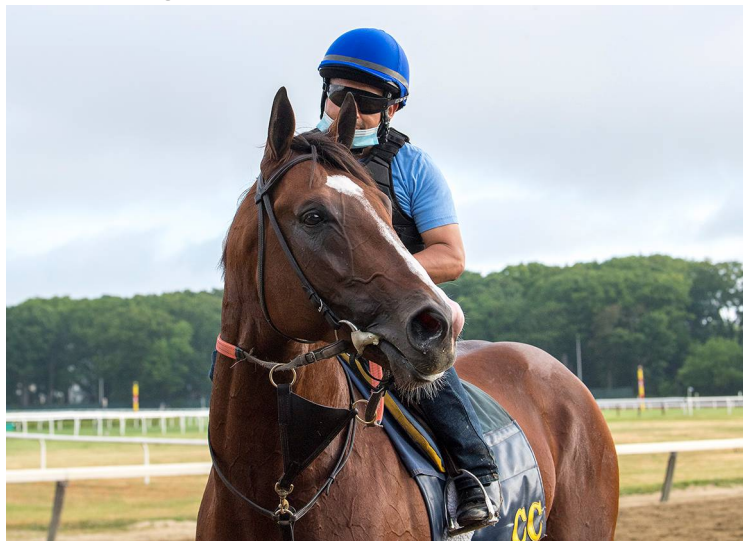
Decorated Invader