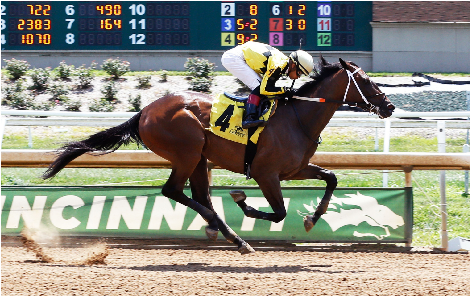
Big On Big gets it done at first asking to get Cinco Charlie off the mark as a sire

BUY LAND AND SEE (c, 3, Cairo Prince--Twiggles, by Maria's Mon), closed to be third debuting in a Saratoga turf sprint last August--a race in which leading GI Kentucky Derby contender Art Collector (Bernardini) was the runner-up--and set a local course record in an 8 1/4-length maiden win going this distance before scoring in the Awad S. Oct. 26 at Belmont. Cont. p2