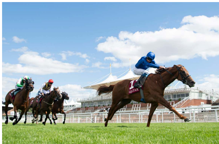
Space Blues | Racing Post

Looking ahead to another tilt at the Deauville festival, the trainer continued, "On the back of that, it'll be nice to see how fresh we can get him, as quick as possible, as I feel the Maurice de Gheest is a nice race for him. He ran well in it last year and he's a stronger horse this year. He's a great traveller in his races and he has got that gear change. Cont. p6