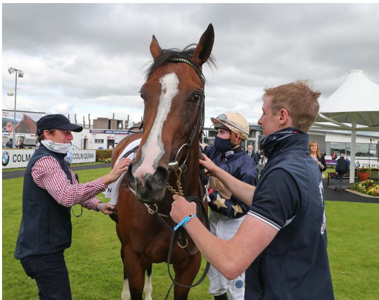
Champers Elysees | Racing Post