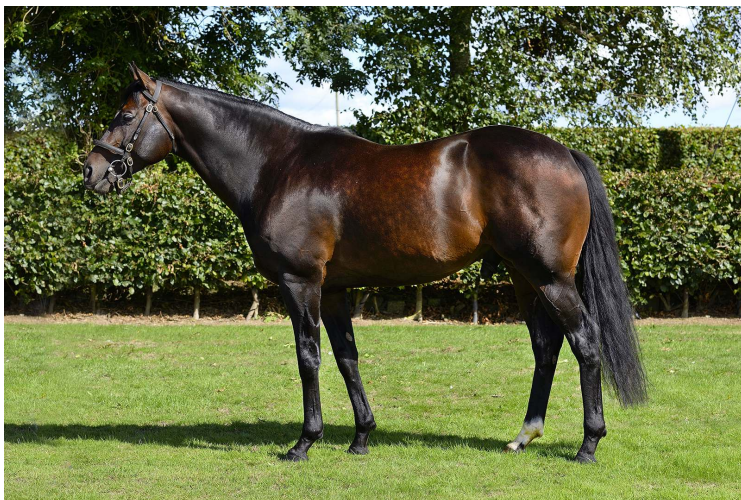
Kodi Bear is looking for his fourth winner at Hamilton Park & Windsor on Wednesday.

Kodi Bear (Ire) (Kodiac {GB}), Rathbarry Stud 83 foals of racing age/3 winners/0 black-type winners 14:20-HAMILTON PARK, 6f, BERGERAC (Ire) €40,000 Goffs November Foals Sale 2018; £75,000 Goffs UK Premier & Silver Yearling Sale 2019 12:45-HAMILTON PARK, 5f, BROXI (Ire) €8,500 Goffs November Foals Sale 2018; €8,000 Goffs Sportsman's Yearling Sale 2019 16:55-WINDSOR, 6f, COCO BEAR (Ire) 25,000gns Tattersalls December Foal Sale 2018; £15,000 Goffs UK Premier & Silver Yearling Sale 2019