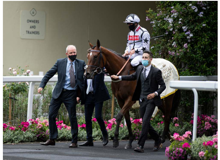
Dandalla returns after winning the Albany