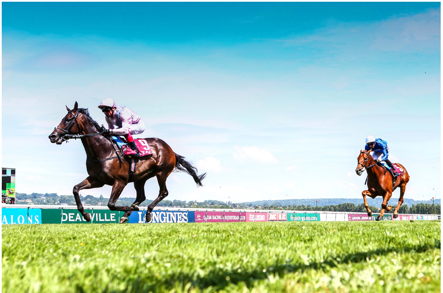
Too Darn Hot

In an attempt to notch up a Classic victory, the G1 Irish 2000 Guineas was hastily put on the agenda but just nine days later, it arguably came too soon and Too Darn Hot had to settle again for the runner-up spot. Next up was Royal Ascot for the G1 St James’s Palace S. where he was a gallant third to subsequent three-time Group 1 winner Circus Maximus (Ire) (Galileo {Ire}) but still lacking some of the pizzazz we had witnessed at two.