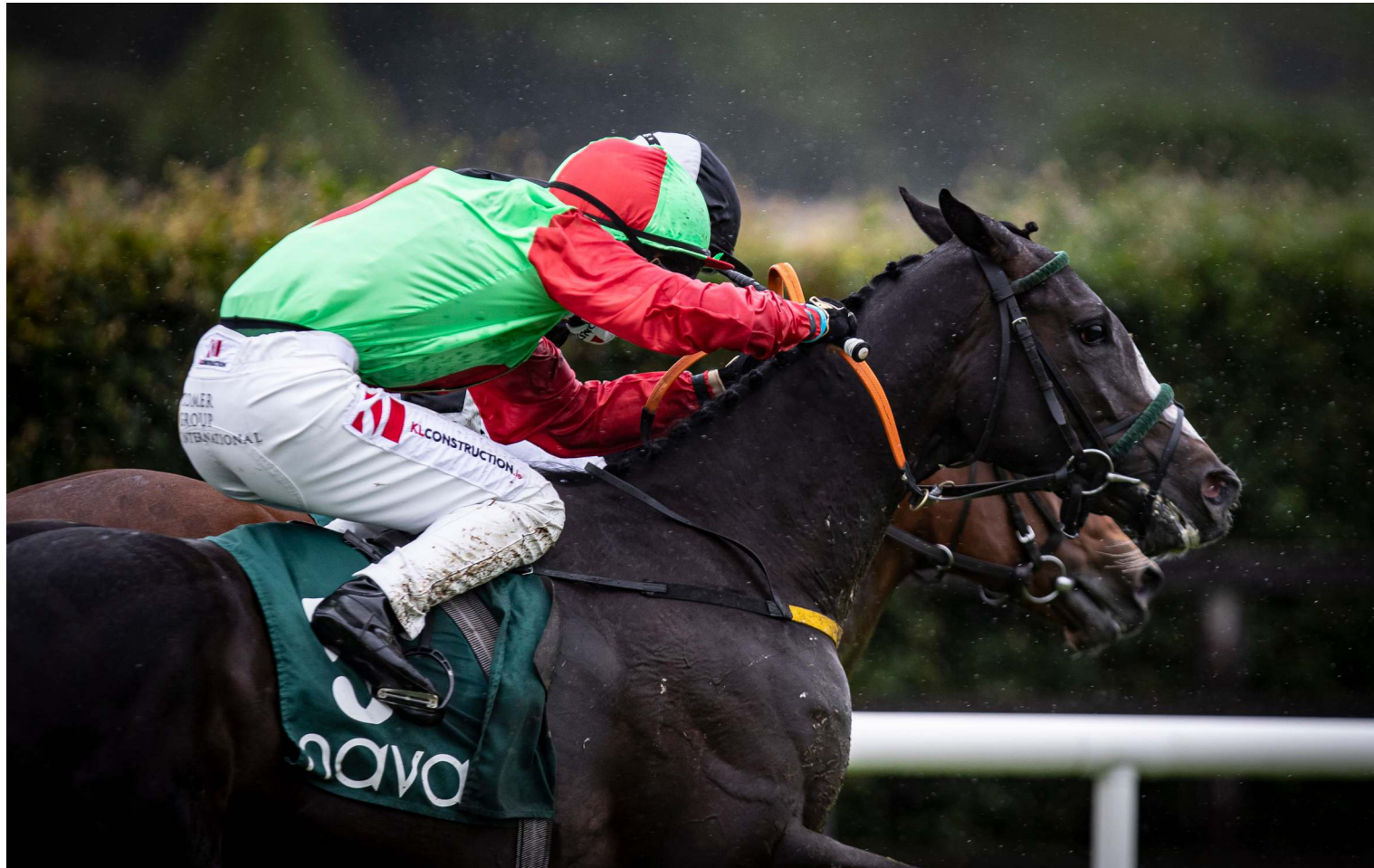
Elysium is the fifth winner for her first-season sire Belardo.

2nd-Navan, €24,000, Mdn, 6-23, 2yo, c/g, 5f 164yT, 1:14.57, sf. LAWS OF INDICES (IRE) (c, 2, Power {GB}--Sampers {Ire}, by Exceed and Excel {Aus}), a June 8 first-up ninth over six furlongs at Naas last time, tracked the leaders in a handy third after an alert getaway in this one. Nudged along soon after halfway, the 3-1 second choice went third entering the final furlong and was driven out in the closing stages to deny Street Kid (Ire) (Street Boss) and The Blue Panther (Ire) (Buratino {Ire}) in a three-way photo on the line. “The framing of this race worked out for him with the weight allowances and there will be plenty of winners come out of the race he ran in at Naas,” said winning trainer Ken Condon. Cont. p11