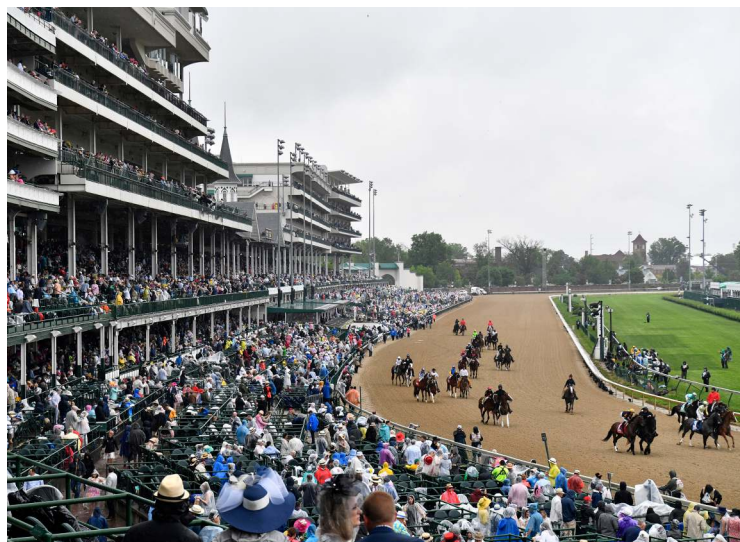
Churchill Downs grandstand at the 2019 Derby

Churchill has not released details of its proposal and it is not clear if management is seeking to have a Derby with an unlimited amount of spectators or one where the number of people that can attend is capped.