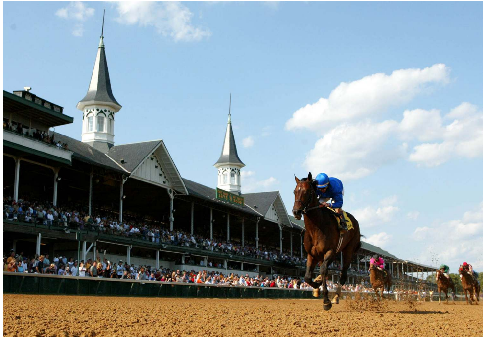
June 15, 2002. Street Cry (Ire) (Machiavellian) takes the 2002 GI Stephen Foster H. at Churchill Downs. Click here to read the TDN from that day in our newsletter archive.