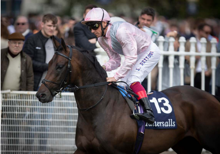
Too Darn Hot | Racing Post