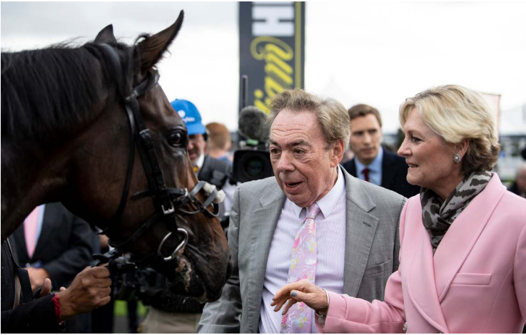
Lord and Lady Lloyd-Webber with Too Darn Hot