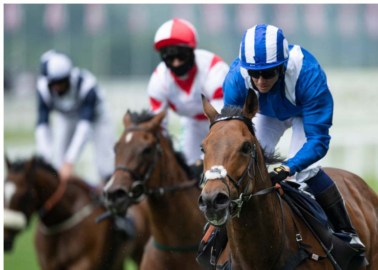
Battaash and Jim Crowley winning the King's Stand S.