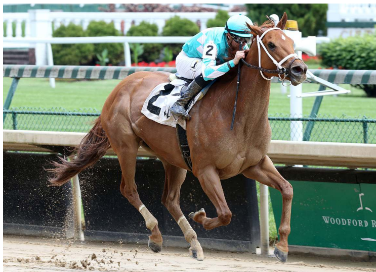
Monomoy Girl