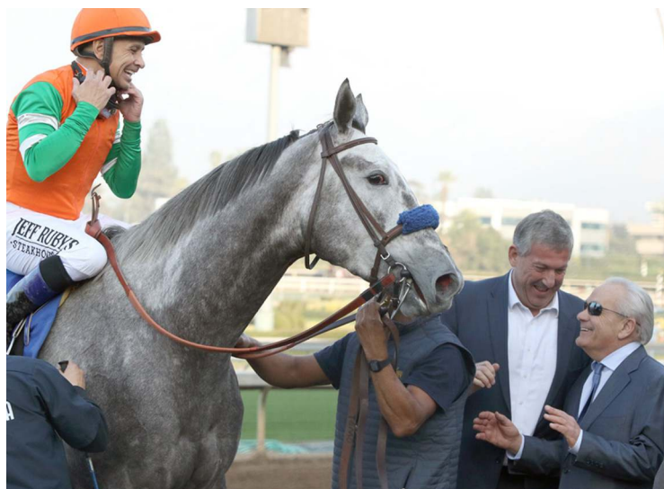
Unique Bella and connections celebrate a Grade I win