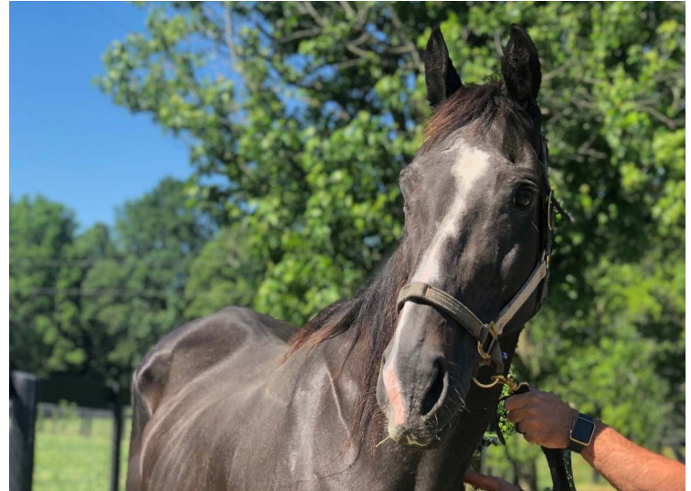
Exploding Star home at Claiborne Farm