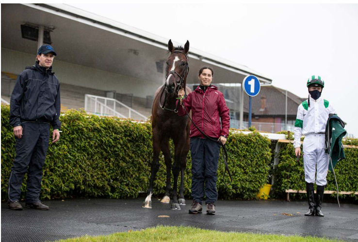
Laws of Indices and his winning connection | Racing Post