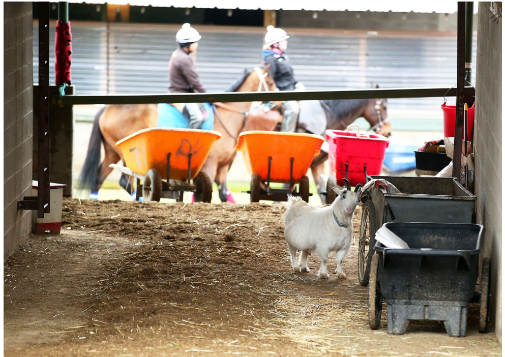
Kidding around. A goat oversees Tuesday morning's activities at Oaklawn. | Coady