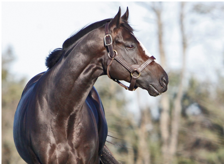
Honor Code | Lane's End

Nonetheless he received a precautionary trim to $20,000: the gray always promised to be a long-term play. As it was, those two stunning injections of Grade I publicity have immediately inflated his fee to $35,000, and maintained a six-figure average (behind only American Pharoah) with his second crop of yearlings.