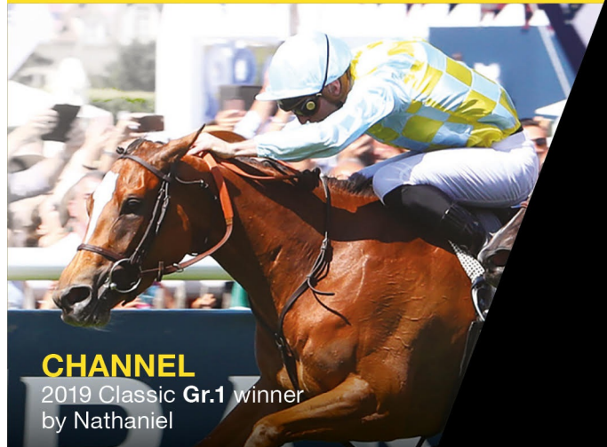
CHANNEL 2019 Classic Gr.1 winner by Nathaniel

Fee: £25,000 1st Oct SLF Galileo ex Magnificent Style