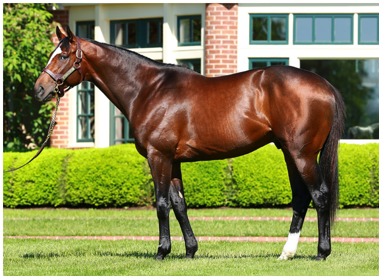
Tonalist | Lane's End

Like Palace Malice, Tonalist is a Belmont winner who later recorded Grade I success at a mile, and collected triple-digit Beyers for fun in a hard-knocking career in which he banked $3.6 million. And his bottom line measures up even to his two regal contemporaries at Lane's End, his first two dams being half-sisters respectively to the mother of Havre De Grace (Saint Liam) and to champion Plugged Nickle (Key To The Mint); while his third is Broodmare of the Year Toll Booth.