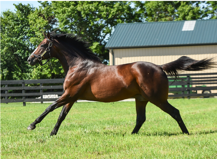
Constitution | WinStar