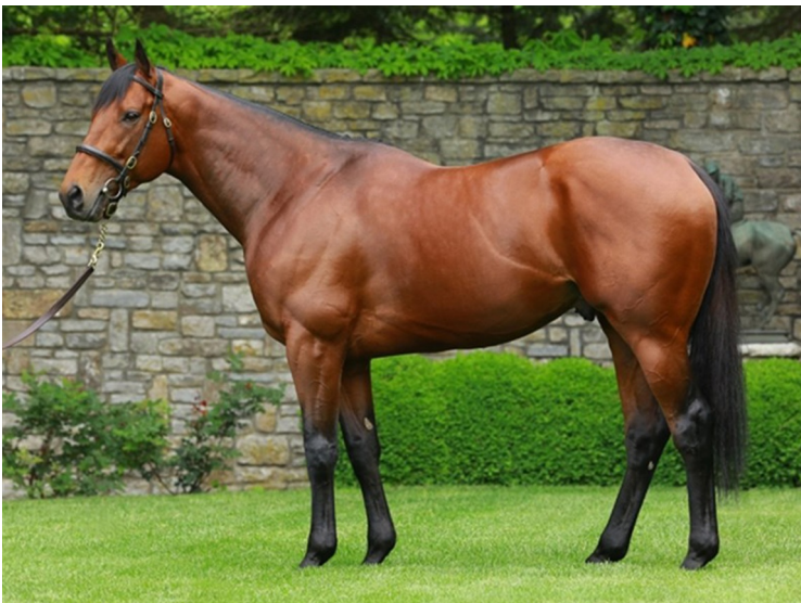
American Pharoah | Coolmore

At an opening fee of $200,000, soon designated "private" at Ashford, AMERICAN PHAROAH (Pioneerof The Nile--Littleprincessemma by Yankee Gentleman) embarked on his second career with little margin for error. Hats off to him, then, for mustering an all-the-way Grade I sprint winner at the Breeders' Cup from his first crop. The fact that Four Wheel Drive won those laurels on the turf, moreover, was only the most vivid of many corroborations for the theory that American Pharoah--author of the most iconic dirt achievement available to the breed--has the potential to become a potent transatlantic influence. Cont. p5