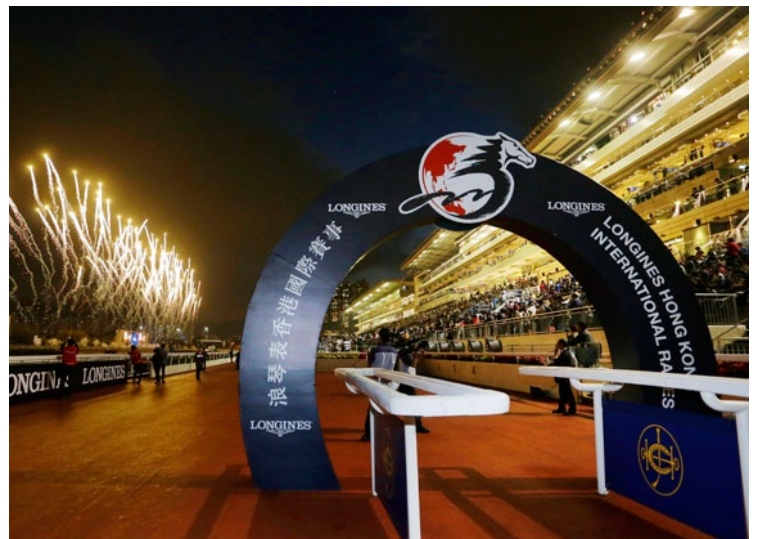
Sha Tin Racecourse | Hong Kong Jockey Club