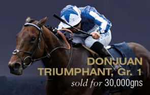
DON JUAN TRIUMPHANT, Gr. 1 sold for 30,000gns

featuring the £15,000 Tattersalls Craven Breeze Up Bonus April 13 - 15