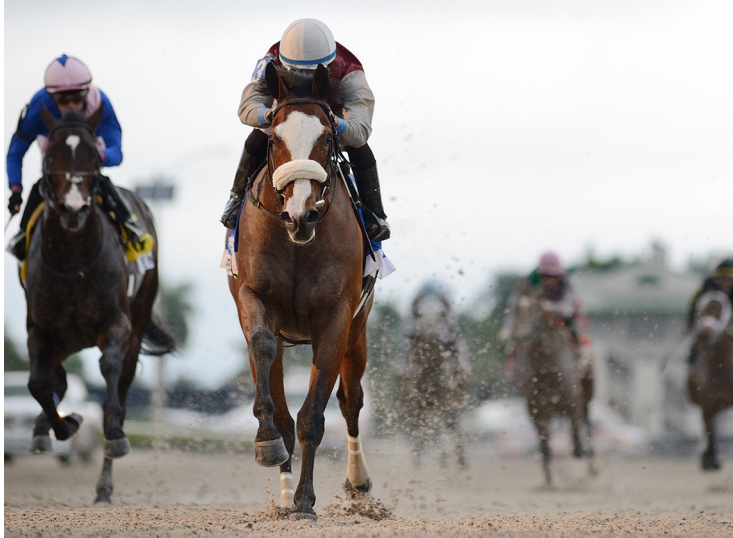
Constitution's Tiz the Law winning the Holy Bull | Coglianes