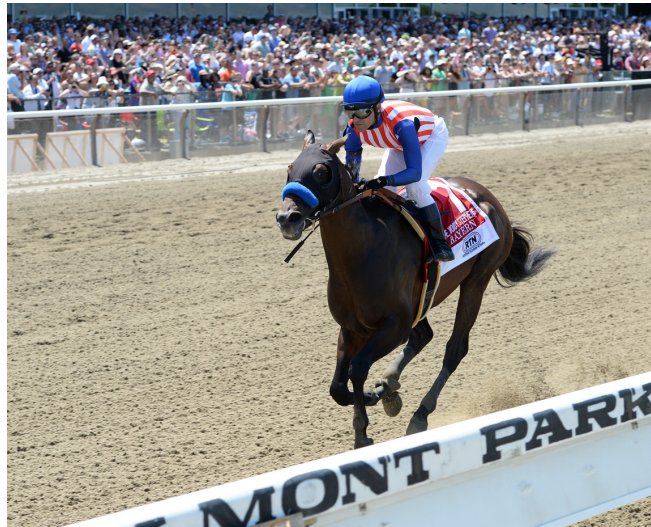
Bayern | Coglianesse

His sire was always going to make things tough, commercially, Bayern having emerged too late to prevent his export to Turkey. But the bottom line is the stuff of legend, with the matriarch Courtly Dee as close up as his third dam. And the way he carried his speed on the track should make Bayern appealing to every kind of agenda: he won the GII Woody Stephens by 7 1/2 lengths in 1:20.75 before later stretching out to win the GI Breeders' Cup Classic. Unfortunately that luster faded during