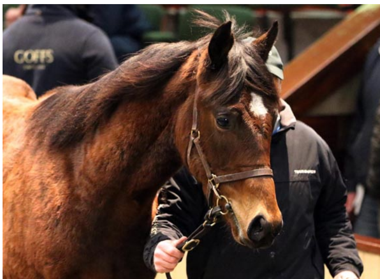
Day 1 Topper, Lot 183 | Goffs