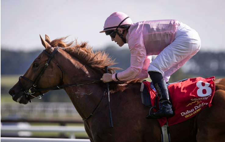
Sovereign winning the 2019 G1 Dubai Duty Free Irish Derby

Dubai Duty Free has extended its sponsorship of the G1 Dubai Duty Free Irish Derby by a further two years, and added five additional races to its sponsorship portfolio, which will see prizemoney at this year's Dubai Duty Free Irish Derby Festival on June 26 to 28 rise to €2.25-million from €2-million. In 2021, all races at the festival will be worth a minimum of €100,000.