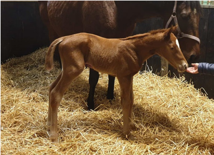
Unfortunately’s first foal, a colt born last week