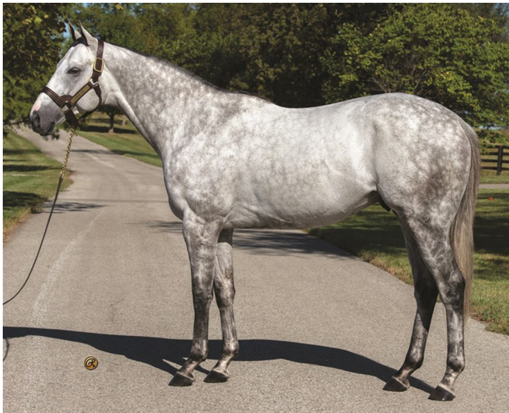
Race Day | Louise Reinegal

RACE DAY (Tapit--Rebalite by More Than Ready), remarkably, also mustered four stakes winners from just 16 overall winners, good news for those who secured him another six-figure book in his fourth season at Spendthrift. In jostling for position among sons of Tapit, he had taken the standard slide in numbers after an opening book of