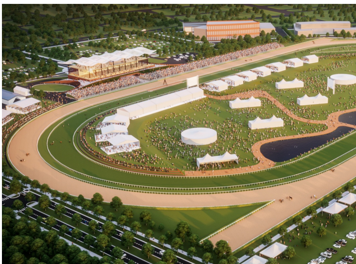
Pimlico development concept | Racing For the Future

The legislation also calls for the creation of an Equine Health, Safety and Welfare Advisory Committee under the Maryland Racing Commission.