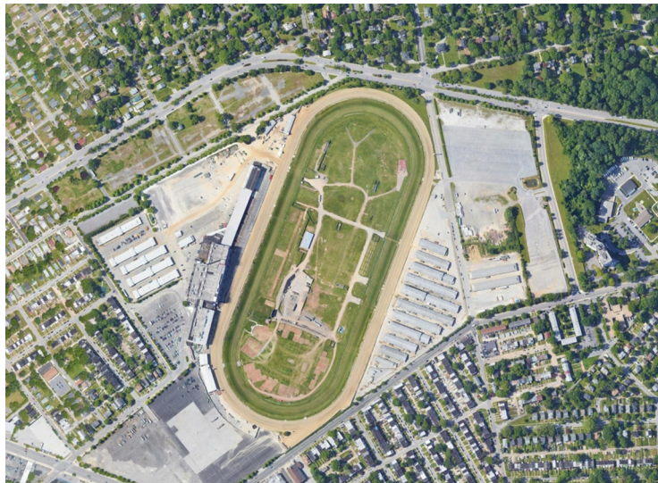
Pimlico development concept | Racing For the Future

The Preakness would continue to be run at Pimlico even during construction, under the deal. The Stronach Group would sign a lease for a minimum of 30 years to use the property for two months each year to prepare for and run the Preakness.