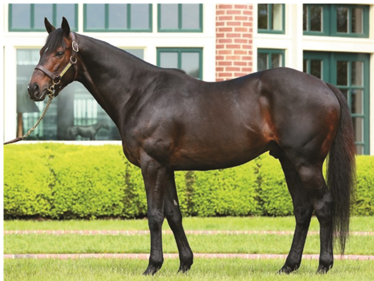
Mr Speaker | Lane's End

Fast Anna is himself a good example of that diversity, having majored in dirt speed. Though unraced as a juvenile, he showed blistering pace in his first two races and was only collared late in the GI King's Bishop. That turned out to be the highlight, but his mother is champion juvenile Dreaming Of Anna (Rahy) and of his 11 first-crop winners, three scored at black-type level. That helped his second crop of yearlings hold up better than most, year on year, and justly elevated him to $10,000 from $7,500 at Three Chimneys.