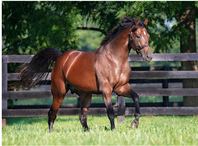
Wicked Strong | Spendthrift

has experienced a similarly bewildering start to his stud career, barely matching his first book of 160 mares in three years since. But that big first crop did what was required, mustering 27 winners to move him back up to $12,500 (had dipped to $7,500). Cont. p9