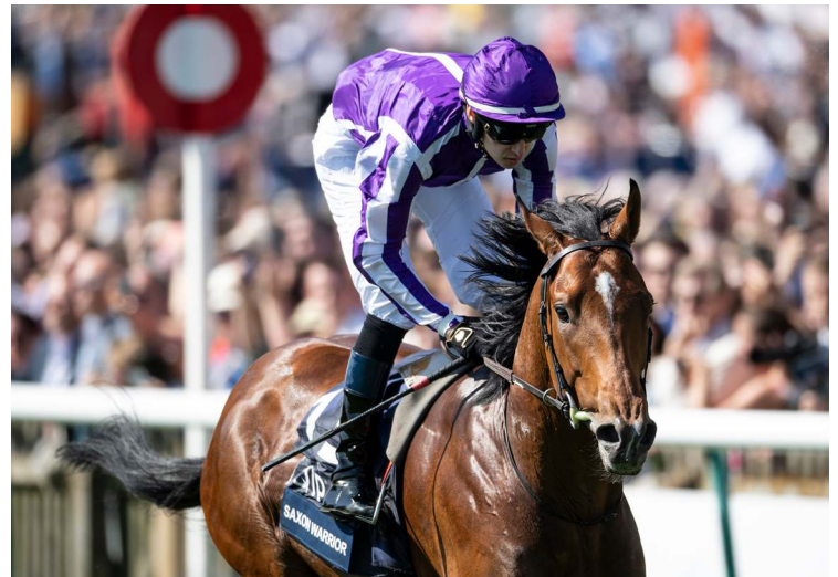
G1 English Guineas hero Saxon Warrior sired his first foal, a colt, on Thursday.