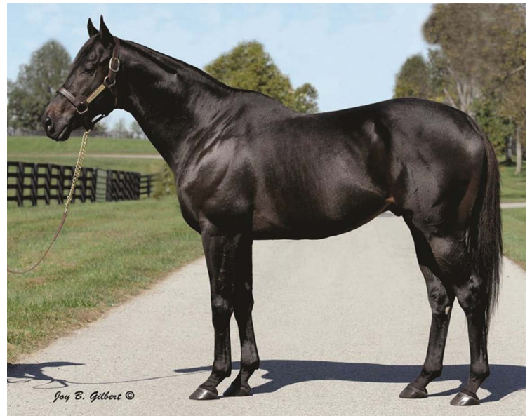
Spendthrift Farm's Temple City was represented by a trio of good-looking winners Thursday and Friday

TONALIST , Alta's Award, f, 3, o/o Queen's Award, by Medaglia d'Oro. MSW, 1-17, Fair Grounds