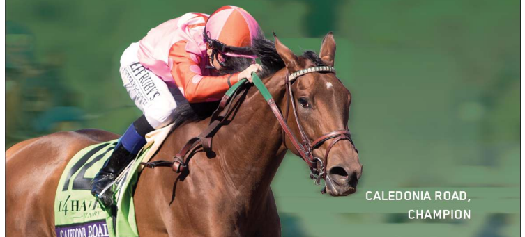
CALEDONIA ROAD, CHAMPION