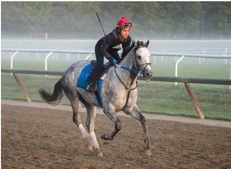
Chestertown