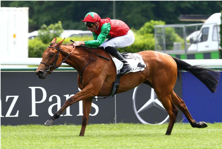
My Sister Nat, a half-sister to Sottsass and Sistercharlie, is an Arqana February graduate