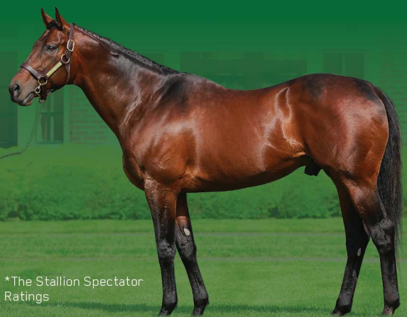
*The Stallion Spectator Ratings