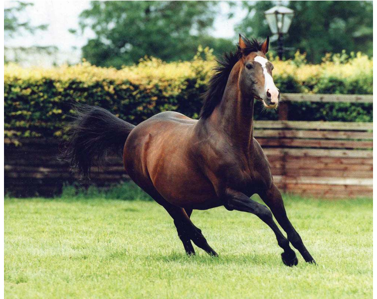
Sadler's Wells | Coolmore