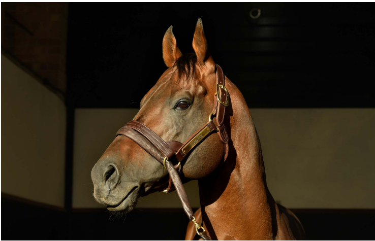
Australian reverse shuttler Zoustar

none of his many outstanding racehorses carry inbreeding to Sadler's Wells, his best being the 123-rated Cliffs Of Moher.