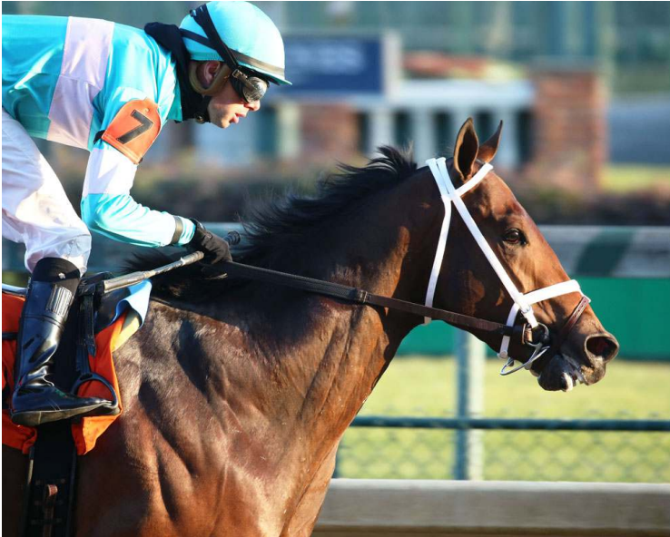
Mr. Monomoy

A large and competitive field is set for the first step on the Fair Grounds Road to the Kentucky Derby, Saturday's GIII Lecomte S. 'TDN Rising Star' Mr. Monomoy (Palace Malice) graduated at second asking sprinting at Churchill Downs Nov. 16 and missed by just a head last time in the slop over this oval Dec. 21. His champion half-sister Monomoy Girl (Tapizar) took her first step towards the GI Kentucky Oaks at this venue when winning the GII Rachel Alexandra S. in 2018.