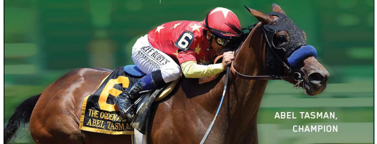
ABEL TASMAN, CHAMPION