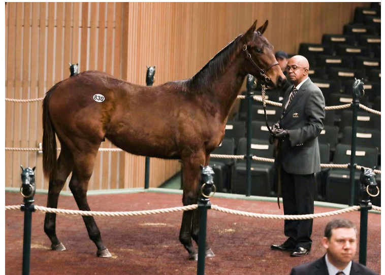
Hip 830: the sale's top yearling, an Uncle Mo--Red Sashay colt

"The competition was immense for the types of foals that you think could be commercially viable later this year," Graves said. "It was maybe even a bit stronger than November because it just seemed like those type of foals were fewer and farther between. The market is obviously still very polarized because the ones that don't possess that, there is not really a lot of leeway there and they are not easy to sell. But the ones that have commercial appeal, combined with a good physical and some sire power, that vet well, bring a premium." Cont. p10