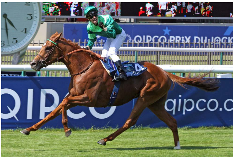
Sotssass winning the Prix du Jockey Club