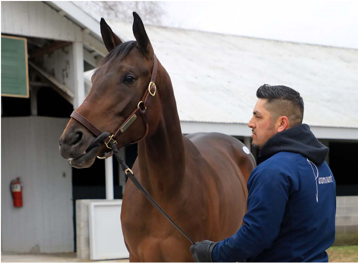
KEEJAN sale topper Enaya Alrabb