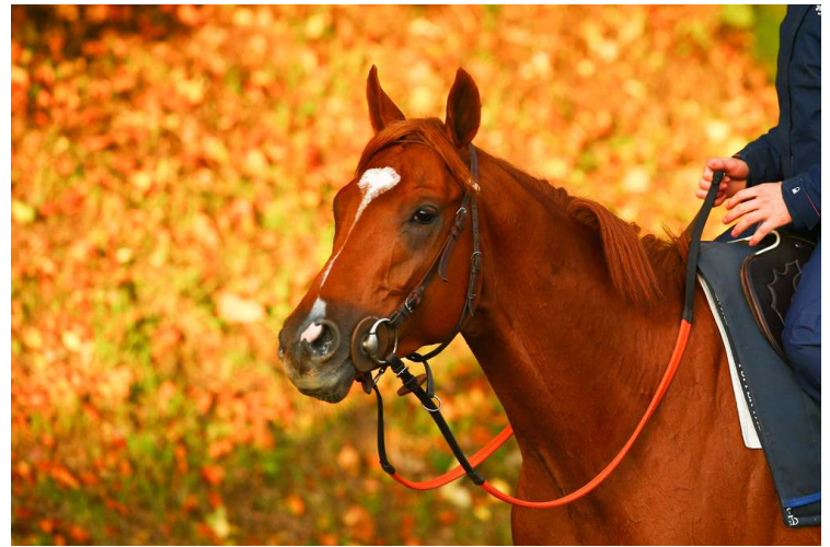
Sottsass | Scoop Dyga