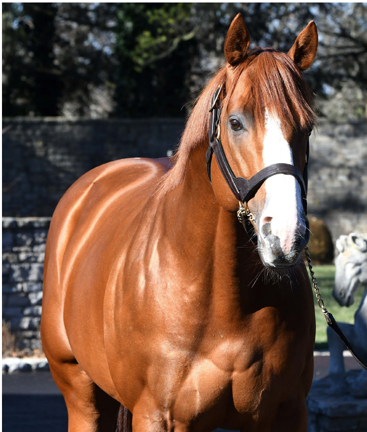
Justify at Ashford