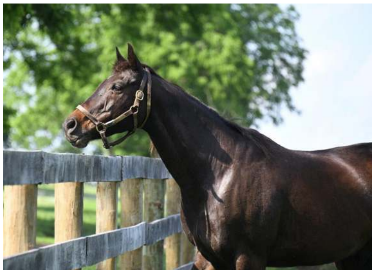
Cajun Beat

Cajun Beat (Grand Slam--Beckys Shirt, by Cure the Blues), the 2003 GI Breeders' Cup Sprint winner, has died.