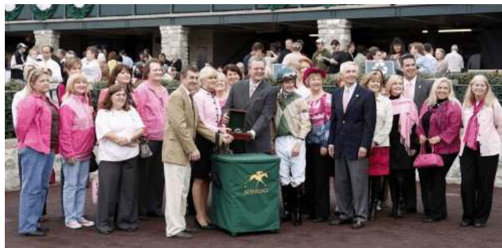
Pink Day at Keeneland