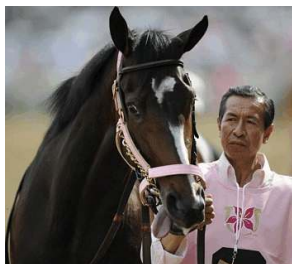
Kentucky Oaks heroine Rachel Alexandra wears her pink halter for the cause