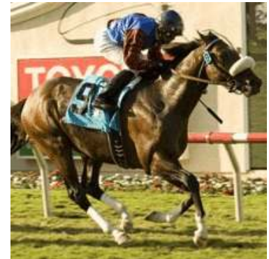
Ferneley