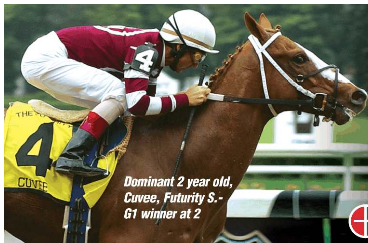
Dominant 2 year old, Cuvee, Futurity S.-G1 winner at 2