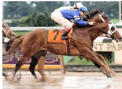
Black Seventeen edges Fabulous Strike in the Vosburgh

Black Seventeen (Is It True), upset winner of the GI Vosburgh S. in September, will try to rebound from an off-the-board effort in the GI Breeders' Cup Sprint in Thursday's GIII El Conejo H., the New Year's Day feature at Santa Anita. Black Seventeen had Fabulous