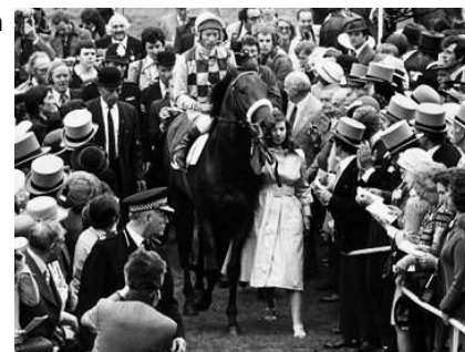
Empery After His Epsom Derby Win