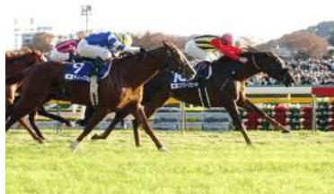
Screen Hero

Screen Hero , who posted a 40-1 upset in the G1 Japan Cup Nov. 30, faces a stellar field of domestic rivals in Japan's version of the 'race that stops a nation.'