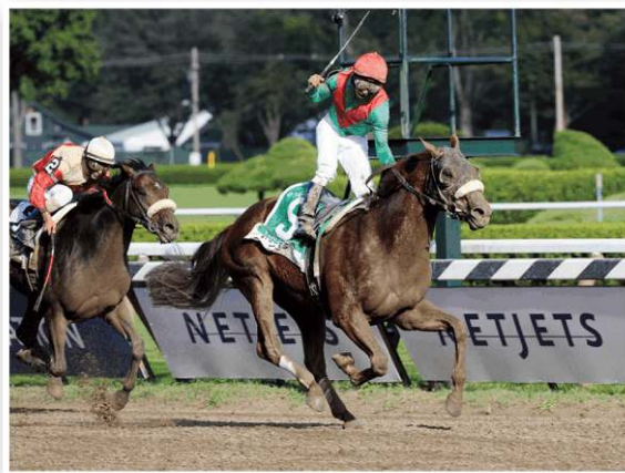
Visionaire passes the whole field in the stretch to win the King's Bishop S.-Gr.1 by 2¼ lengths.

• ASHFORD • ASHFORD • ASHFORD • COOLMORE® • ASHFORD A M E R I C A