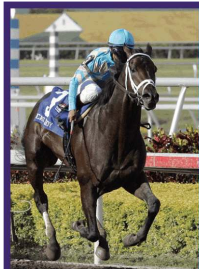
Scat Daddy, a Gr.1 winner at 2 & 3 years