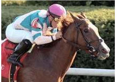
Bit of Whimsy

It could also pay to look at the pedigrees of some of the other stallions which have enjoyed success with El