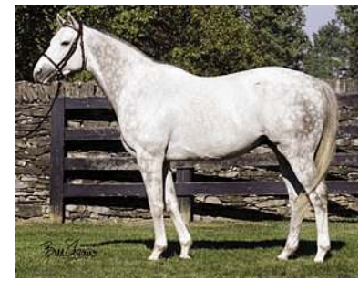
Tapit

"Relaunch and his sister were gray, inheriting their color from their dam Foggy Note, whose grand-