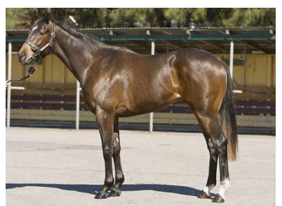
HKIS Topper - Redoute's Choice colt hkjc.com

auction proved that it was not immune to the effects of the global economic crisis, as the average of HK$2.9 million ($375,054) and median of HK$3 million ($387,097) represented declines of 34 and 33 percent, respectively. The aggregate was HK$87.2 million ($11,251,613), while last year's event grossed HK$132 million. "Today's figures are a reflection of the alobal trend for bloodstock at the moment, but it's never been our objective to make a profit either," commented Mark Player,