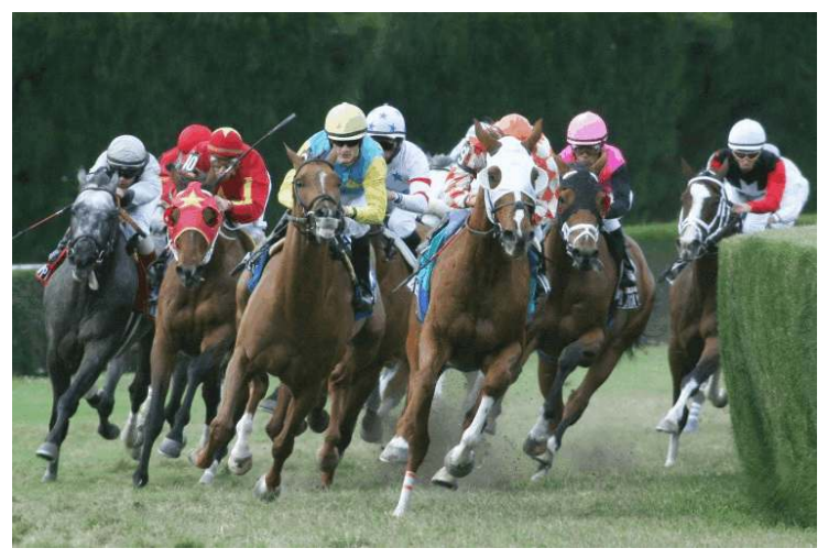
Presious Passion turns for home with the lead in his GII W.L. McKnight title defense