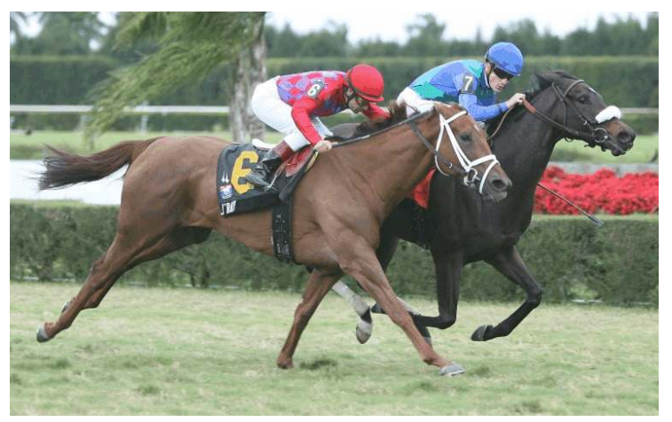
Herboriste (inside) holds off J'ray in the GII La Prevoyante H. at Calder

Click for the <u>brisnet.com chart</u> or the <u>brisnet.com PPs</u>. Video, sponsored by Taylor Made.