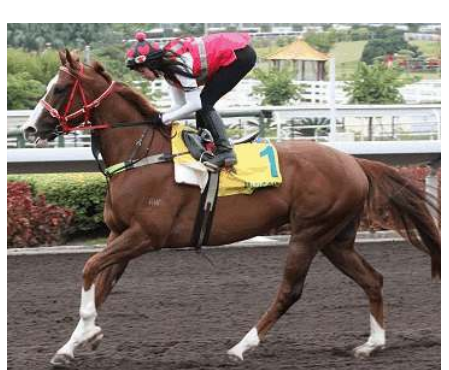
Apache Cat

G1 Hong Kong Sprint challenger Apache Cat (Aus) (Lion Cavern) bounced out of Wednesday's breeze in good order, turning heads as he completed two circuits