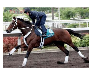
Mourilyan

Mourilyan (Ire) (Desert Prince {Ire}), sixth in the GI Canadian International Oct. 4, had his final workout