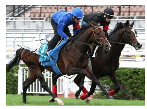
Jaguar Mail (outside) & Mores Wells (inside) working in company

G1 Hong Kong Vase rivals Mores Wells (GB) (Sadler's Wells) and Jaguar Mail (Jpn) (Jungle Pocket {Jpn}) worked in company in a half-speed gallop on the Sha Tin turf Friday morning. Jaguar Mail's conditioner