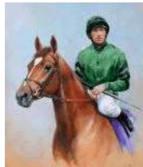
Raven's Pass