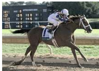
Azeri winning the GI Spinster S. at Keeneland in 2004