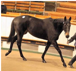
Anna Pavlova tattersalls