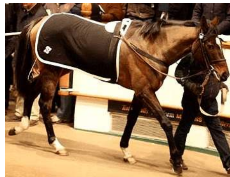
Unsung Heroine