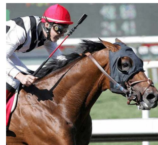
Mast Track