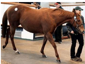
Our Queen of Kings www.tattersalls.com