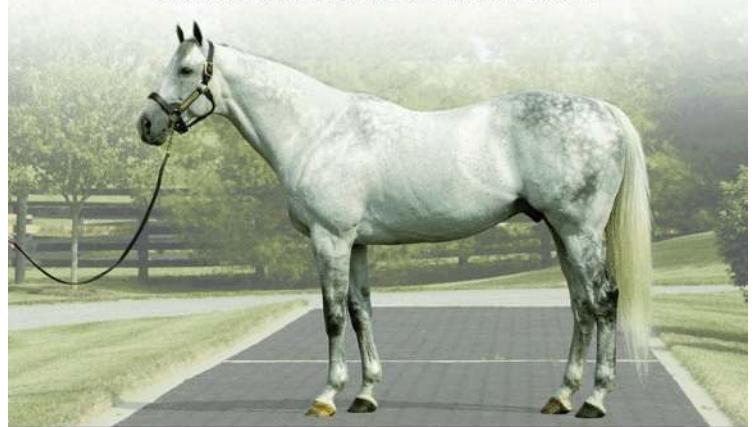
TAYLOR MADE • (859) 885-3345 • www.taylormadestallions.com

$800,000 TAYLOR MADE SEPTEMBER GRADUATE OLD FASHIONED, COMING OFF A 15 1/2 LENGTH VICTORY LAST TIME OUT, REMAINED UNDEFEATED WITH AN EMPHATIC 7 1/4 LENGTH WIN IN AQUEDUCT'S DERBY PREP, THE $200,000 GRADE 2 REMSEN STAKES WHICH WAS THE LAUNCHING PAD FOR 2 RECENT WINNERS OF THE KENTUCKY DERBY (G1). OLD FASHIONED JOINS BC JUVENILE (G1) WINNER AND LIKELY ECLIPSE CHAMPION MIDSHPMAN AS MAJOR DERBY CONTENDERS FOR SUPERSTAR SIRE UNBRIDLED'S SONG. PERFORMANCE LIKE THIS YOU CAN TAKE TO THE BANK.